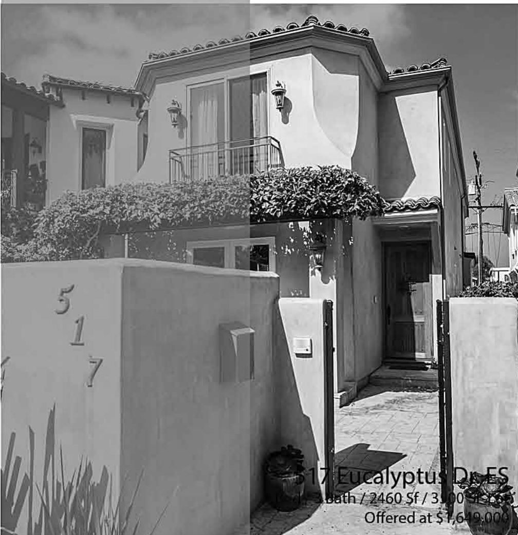
517 Eucalyptus Dr. ES 3 Bed / 3 Bath / 2460 Sf / 3500 Sf Lot Offered at $1,649,000

AlexAbad@AlexAbadRealestate.com 310.877.6488 BRE 01701311