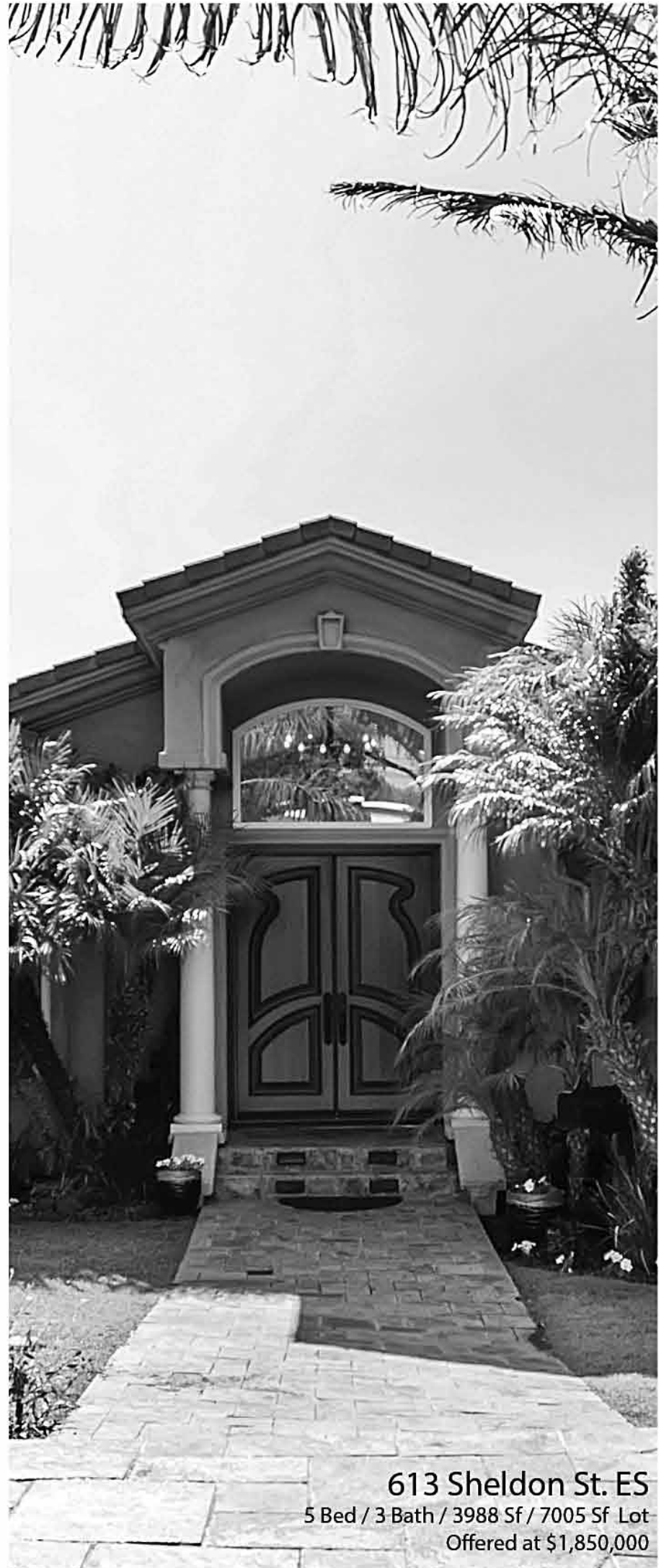
613 Sheldon St. ES 5 Bed / 3 Bath / 3988 Sf / 7005 Sf Lot Offered at $1,850,000