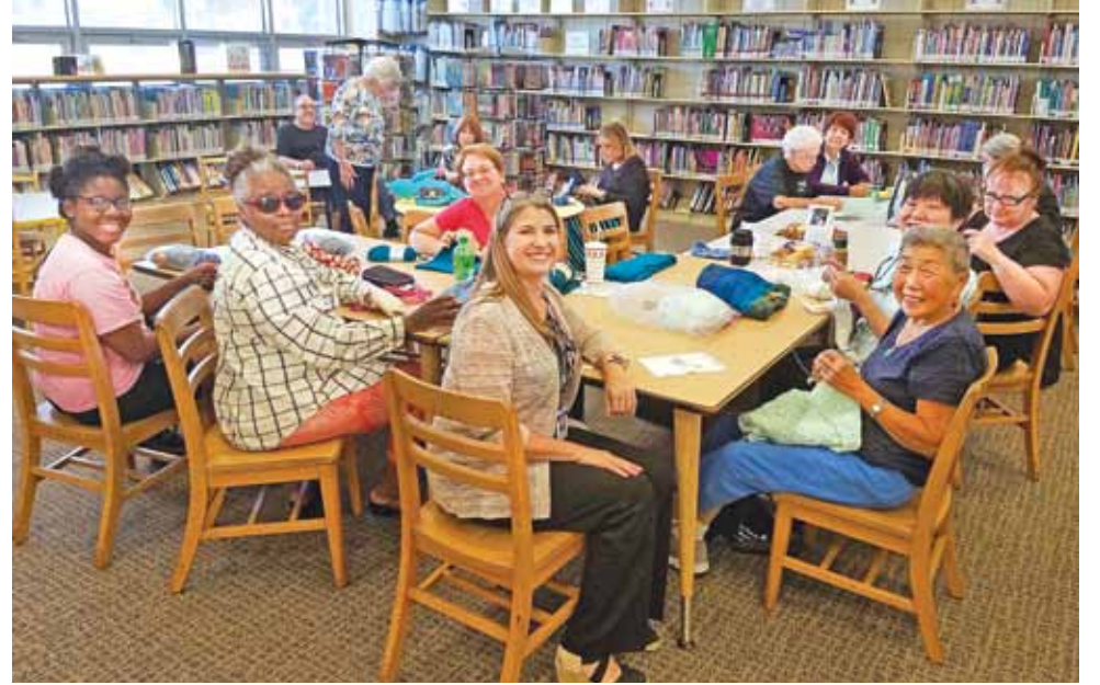
Craft Delight Program attendees.

What I noticed about this welcoming Torrance group is the incredible admiration each has for the other. Not one person hesitated bragging about the other. These are open,