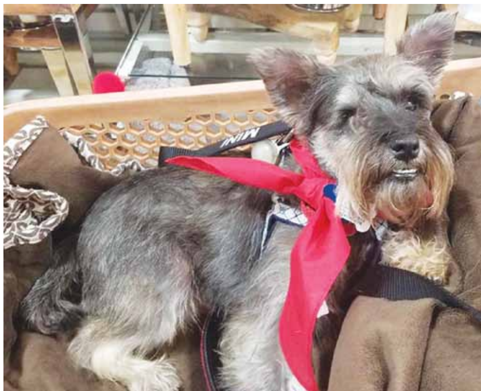
Wishing Hobbes and his new family a wonderful life in Upland!

Congratulations to Hobbes and his new family. Hobbes is the little cutie who had to have his underdeveloped eye removed when we rescued him. He's the guy with the adorable under-bite and looks like he's always smiling and winking at everyone! His new folks are real dog lovers. This is their fourth Miniature Schnauzer (all rescues) and his mom previously fostered French