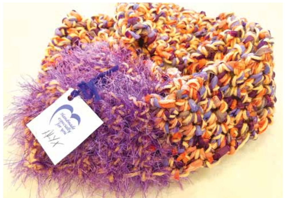
Scarf for abused women's shelter.