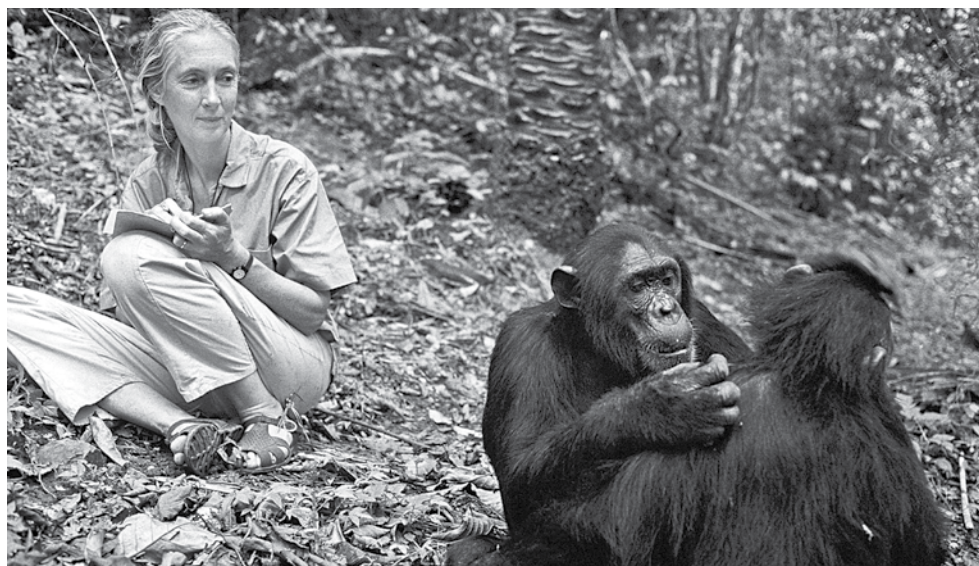
Jane Goodall in Jane.

Jane is not rated. 90 minutes. Opening at The Landmark this Friday. •