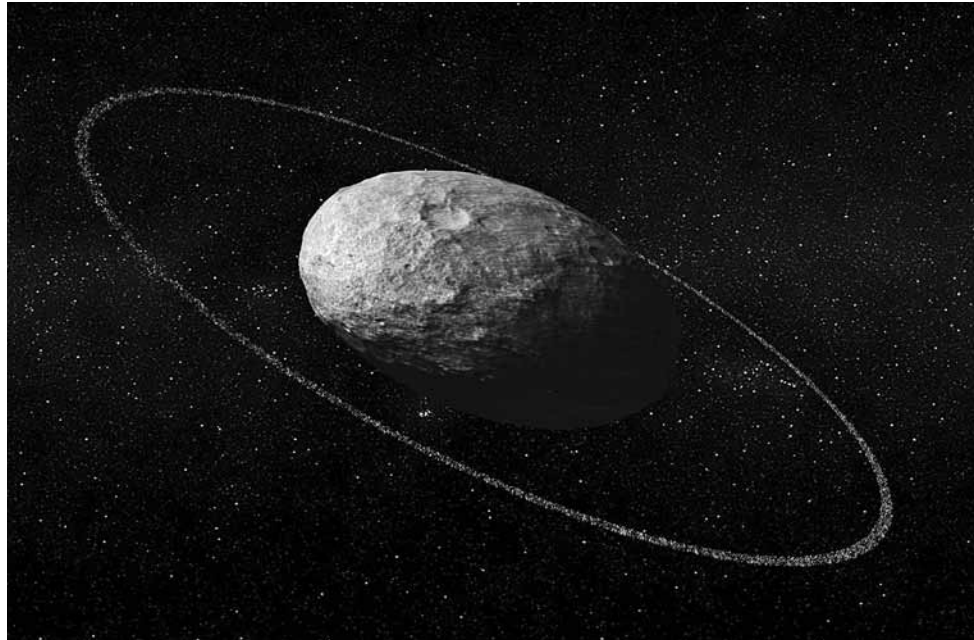
Artist concept of Haumea, with the correct proportions of the main body and the ring. The ring is at a distance of 2287 kilometers from the center of the main body and is darker than the surface of the dwarf planet itself. Image from Instituto de Astrofísica de Andalucía (IAA-CSIC).

Haumea is the name of the goddess of childbirth and fertility in Hawaiian mythology. The name is particularly apt, as the goddess Haumea also represents the element of stone and observations of Haumea hint that the dwarf planet is composed largely of stony material with a crust of pure ice. •