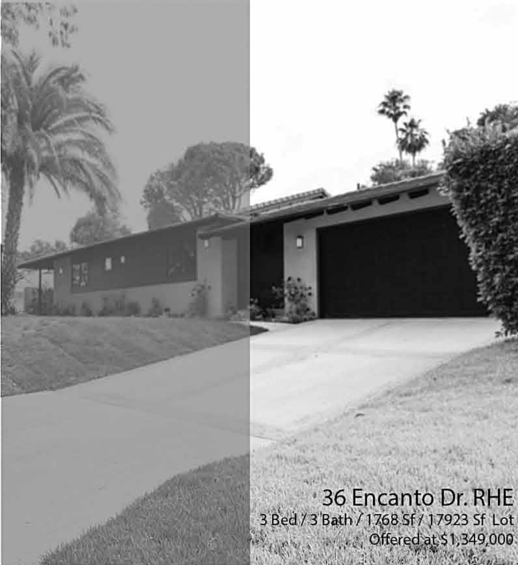
36 Encanto Dr. RHE 3 Bed / 3 Bath / 1768 Sf / 17923 Sf Lot Offered at $1,349,000