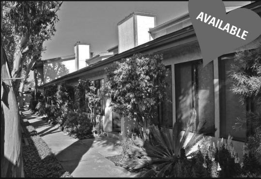
867 Washington Street