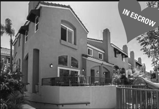
1305 E. Grand #A