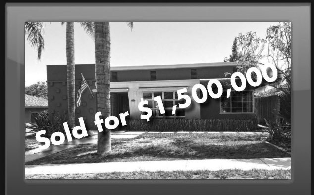
510 Virginia, El Segundo