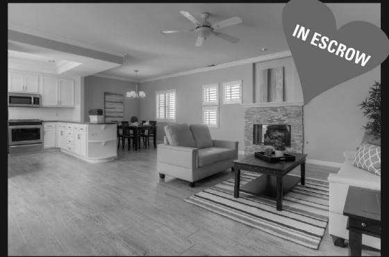
216 Loma Vista