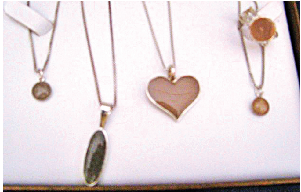
Modern Mourning jewelry.