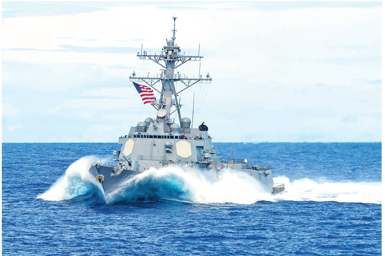
The guided-missile destroyer USS Stockdale (DDG 106) transits through the Pacific. Providing a ready force, supporting security and stability in the Indo-Asia-Pacific, William P. Lawrence is operating as part of the John C. Stennis Strike Group and Great Green Fleet on a regularly scheduled 7th Fleet deployment.