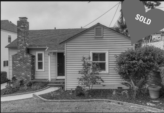
516 E. Walnut