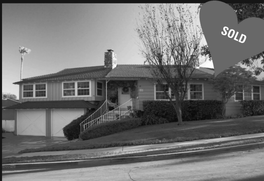
1000 E. Acacia