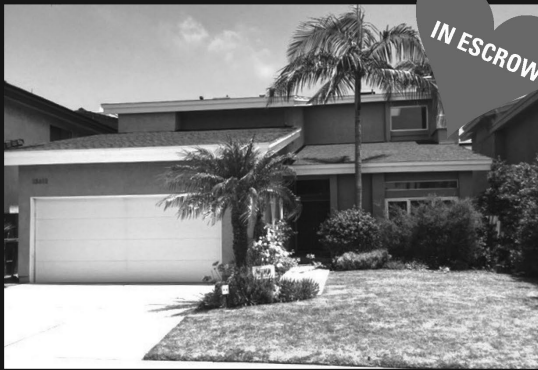
13612 Heather Way