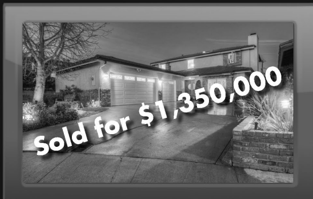
702 Redwood, El Segundo