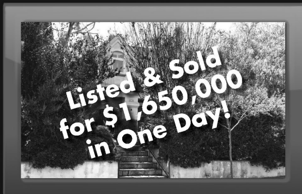
630 W. Sycamore, El Segundo