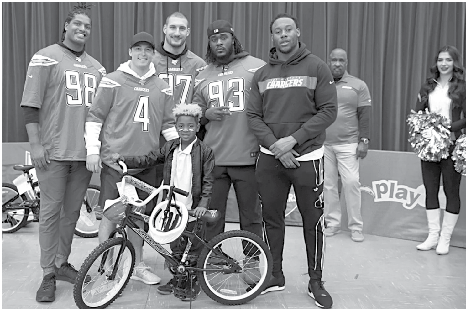
(Left to right) A Bennett-Kew essay contest winner poses with his new bike alongside players from the Los Angeles Chargers. The Chargers and the Bikes for Kid's Foundation, which surprised more than 100 students with bikes. More than 100 Bennett-Kew Elementary School second- and third-graders cheered and jumped with excitement when they received new bikes from the Los Angeles Chargers and Bikes for "Kids Foundation during December 10 surprise event that included Inglewood's Mayor and Inglewood Unified's top administrators.