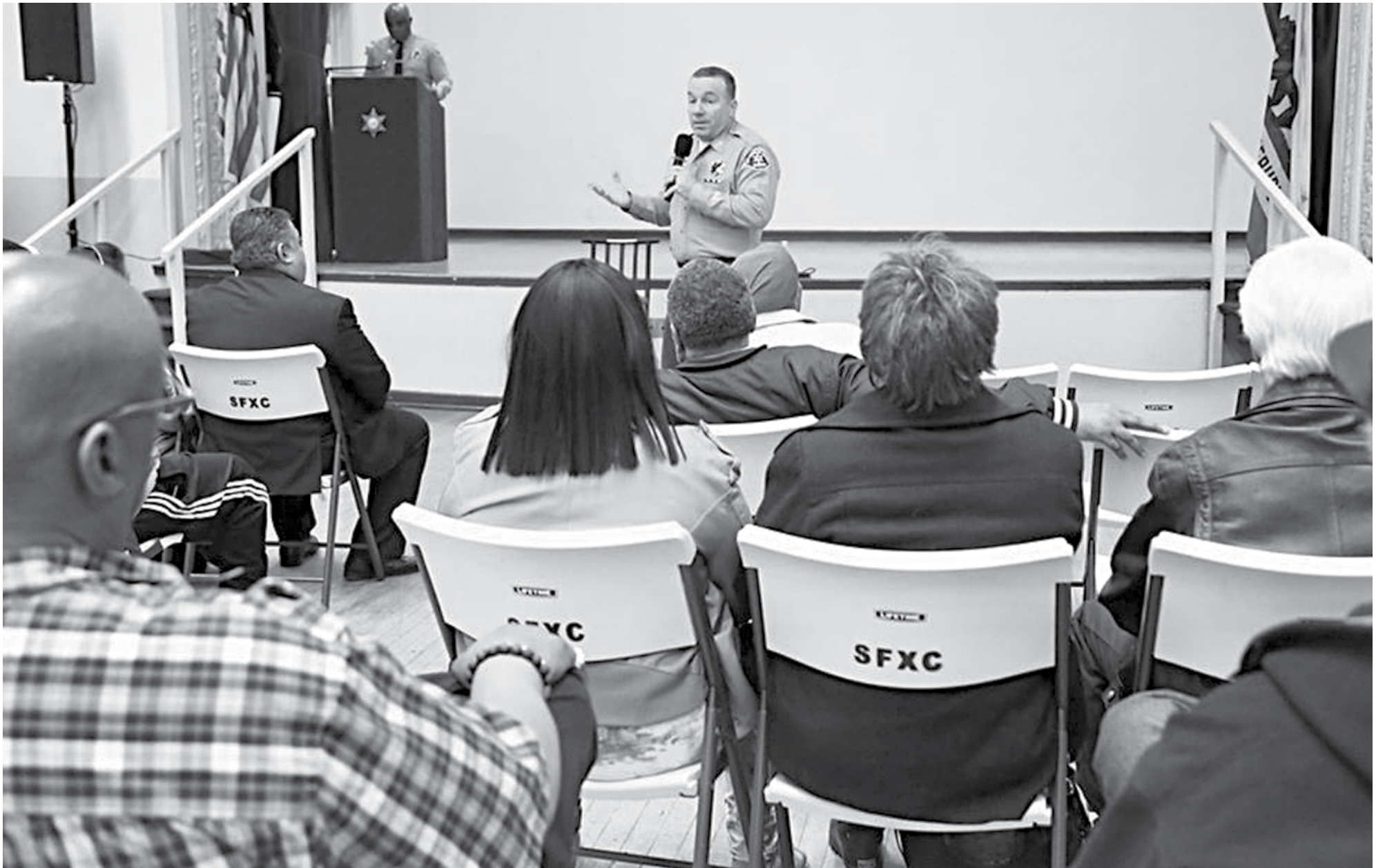
December 16 LA County Sheriff department held it's 27th community Town Hall. The Sheriff Department wants to remind residents to "Get to know your neighbors. Stay involved and crime rates will continue to go down."