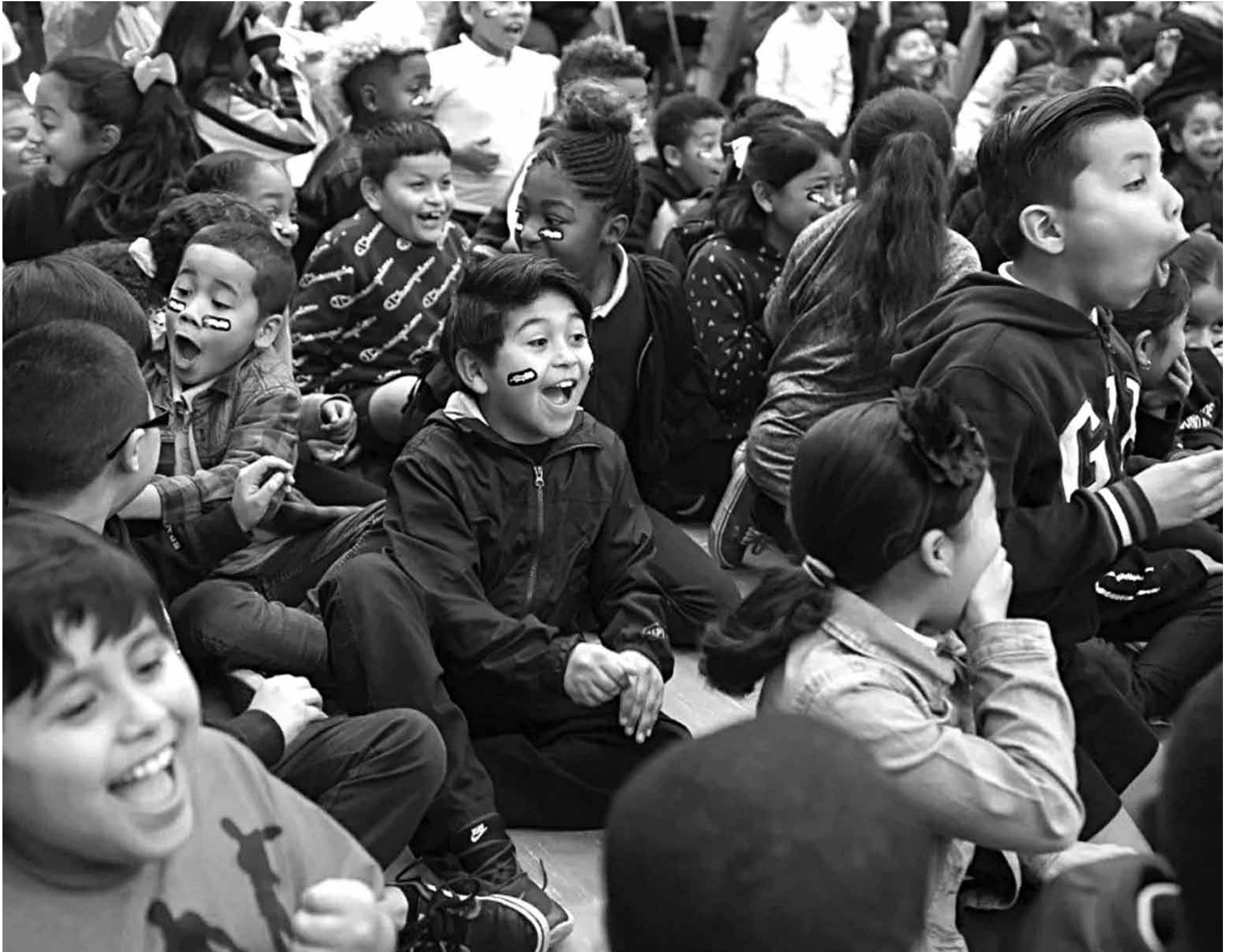
Bennett-Kew second- and third-grade students react with joy when they find out the LA Chargers brought bikes for all of them.