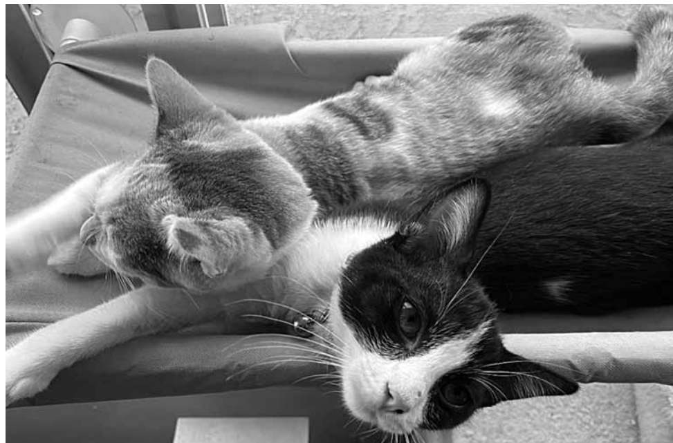
Dutchess and Sylvester

George is a walking cloud of puffy sweetness. He is confident and outgoing, loves people and wants to be held, cuddled and napped with as often as possible. This little puffball is a gorgeous buff color with white feet and white on his chest. He has long hair and will need regular brushing, which he quite enjoys. George is young and playful and needs another cat in the home for companionship. Maybe you already have a cat or kitten and you're looking for a playmate? Or maybe you're interested in adopting two kittens as a pair? George is being fostered in a home with gentle kids, other cats and a large, sweet dog. He loves them all. When George was tested at five weeks for Feline Leukemia and FIV, his results were negative for Feline Leukemia -- but he showed a slight positive for FIV. The vast majority of kittens that test positive for FIV at five weeks will go on to retest negative by 4-6 months. If you are unfamiliar with FIV and early testing, feel free to reach out to us for links to more information and research about why this test should not scare you off from