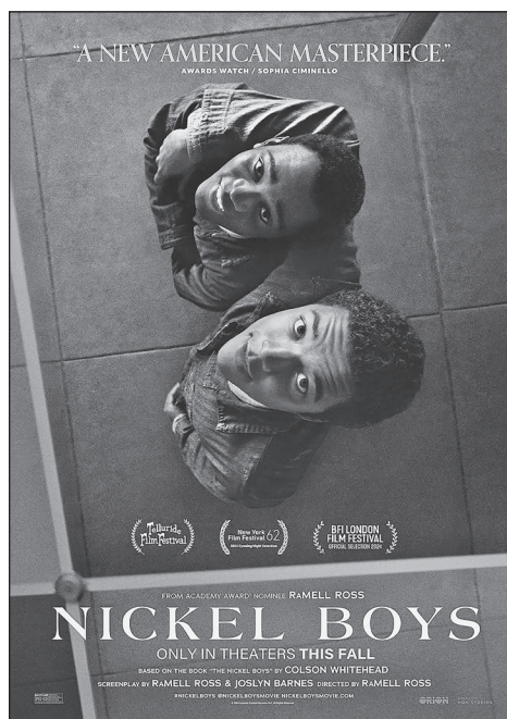
Nickel Boys

All things considered, Nickel Boys is phenomenal filmmaking and one of the year's best. Nickel Boys opens in select LA theaters on December 20 before expanding to additional markets in the subsequent weeks. •