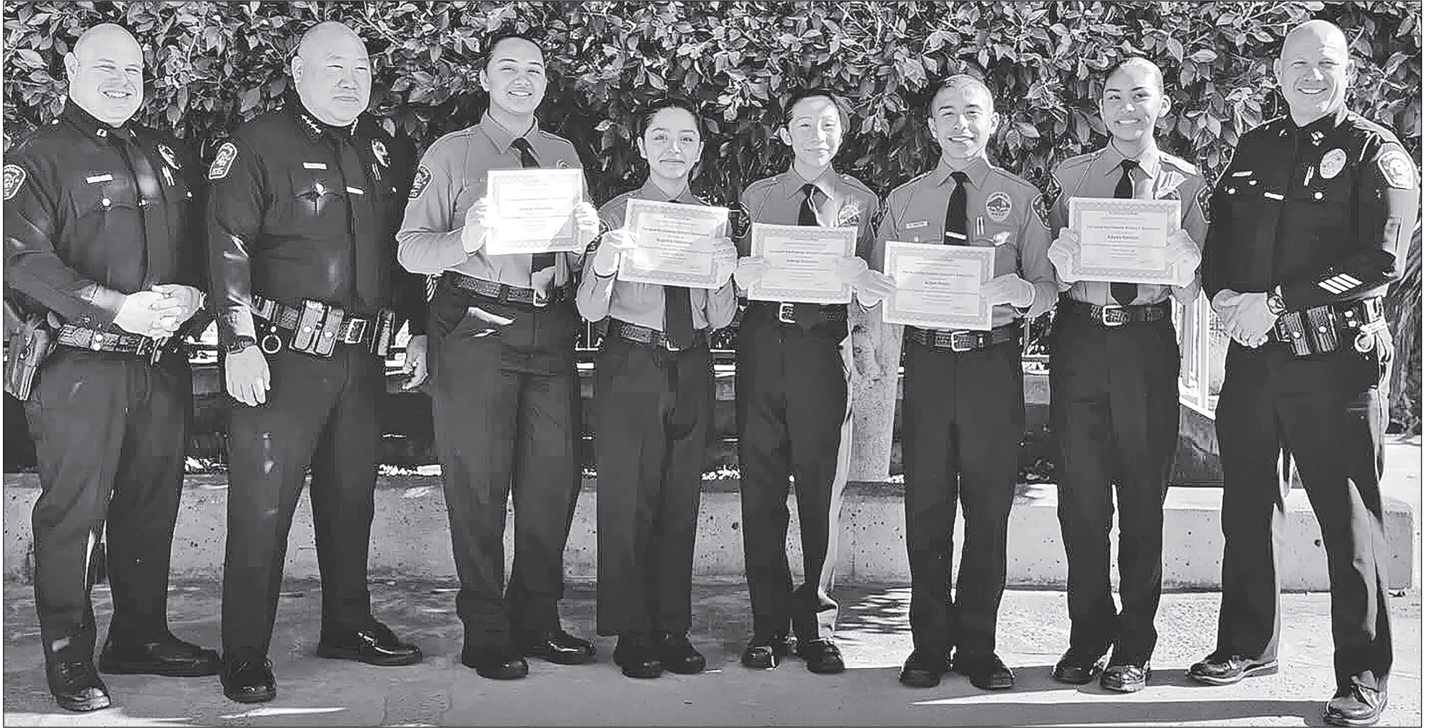
Congratulations to five of our newest Police Explorers who graduated from the South Bay Regional Police Explorers Academy. We are proud of your accomplishment.