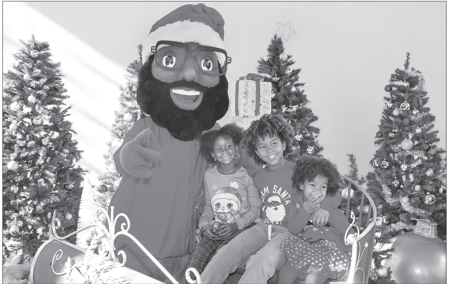
The WinterFest at Hollywood Park had fun-filled Holiday activities for the entire family. This year's events included: Farm Habit's Farmers' Market, Photos with Black Santa and Mrs. C, the Vendor Village, Live Performances by Musicians at Play and Inglewood High School, Art Delectables Cookie Decorating and a Hot Chocolate Pavilion.