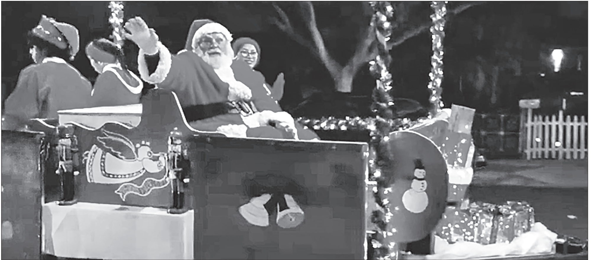
Santa will be making the rounds (with his elves) all around Lawndale until December 19th. Try and catch Santa before his busiest night of the year. Check out https://www.lawndalecity.org/news/what_s_new/santa_s_sleigh_route_2024 for Santa's routes.