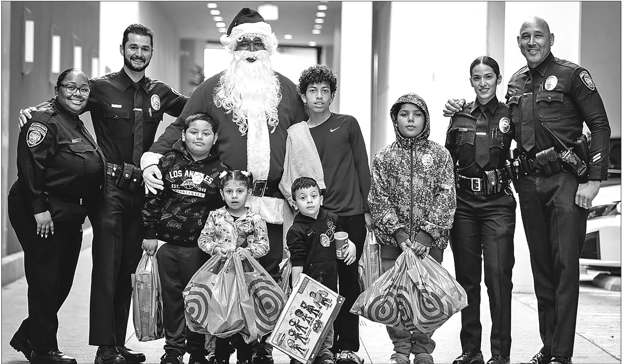
With the amazing donations from the Inglewood Police Officers Association and Target, Inglewood families were able to have a special holiday spree at the local Target. This is what the holidays are all about. Thank you to everyone who made this special event possible.