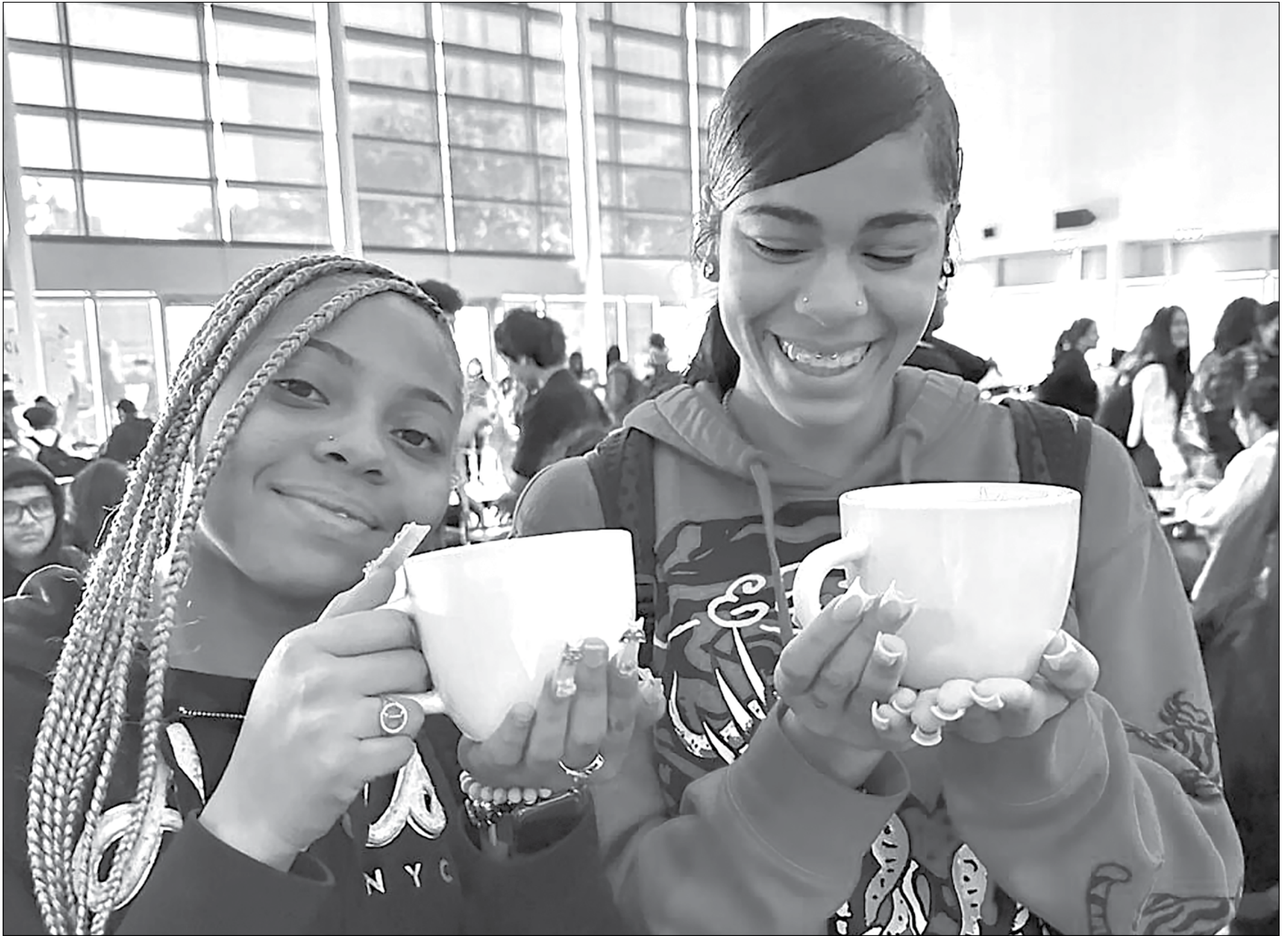
Bring Your Own Mug day is always a hit (as long as there is free hot chocolate to fill it).