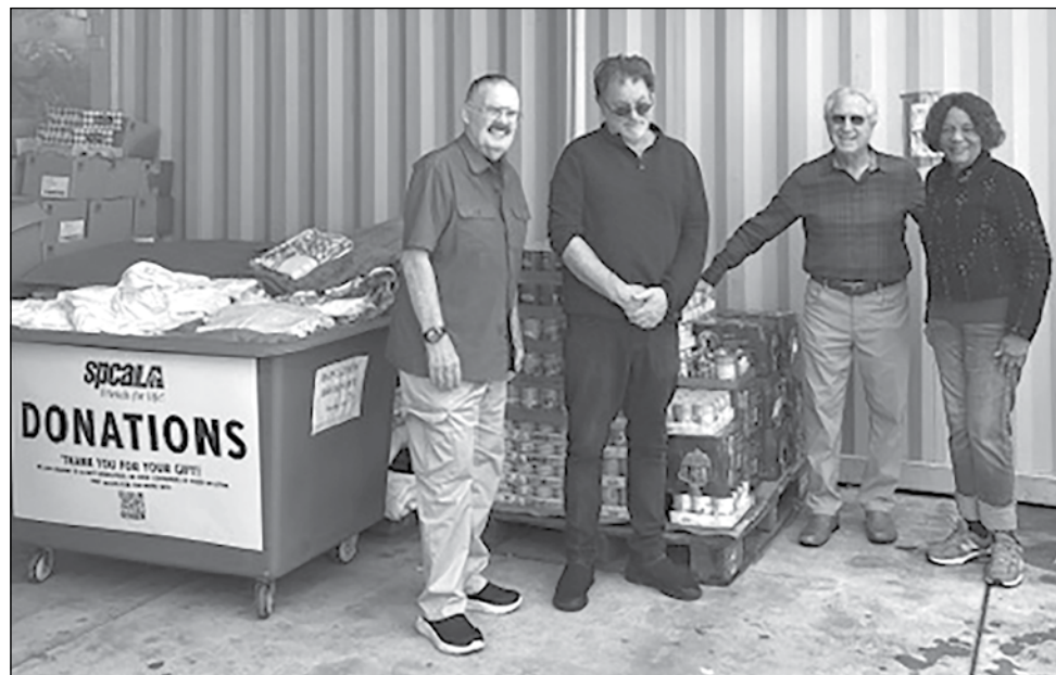
Hawthorne Kiwanis Club donates to SpcaLA.