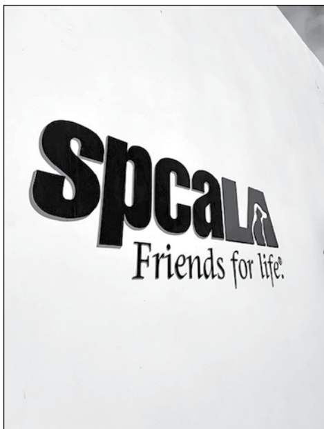
Friends for Life.

'Tis better to give than to receive. I will surely bark a lot to that! •