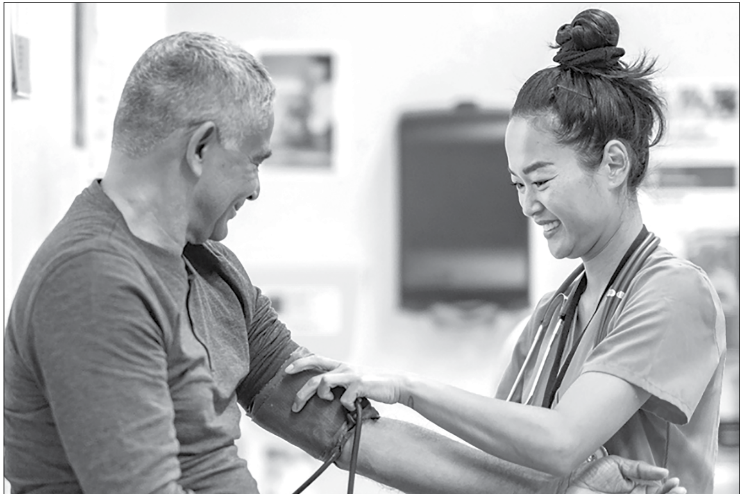
Centinela Hospital Medical Center, a member of Prime Healthcare, achieved numerous accolades for clinical excellence from Healthgrades. Centinela Hospital received five-star ratings for six procedures and conditions, including the treatment of heart attacks, pneumonia, diabetic emergencies, heart failure, hip fracture treatments, and pacemaker procedures. These achievements reflect Centinela's commitment to consistently delivering the best care possible and place the organization in the upper echelon of hospitals for specialty care nationwide.