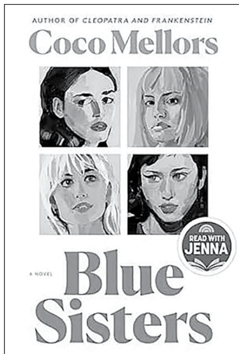
Blue Sisters by Coco Mellors