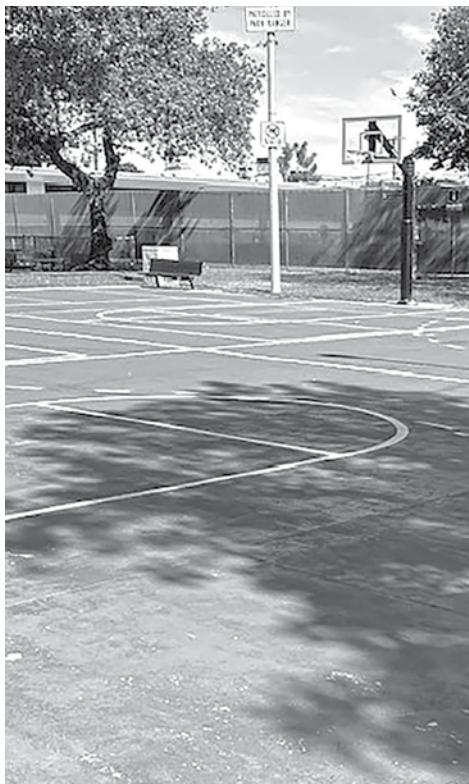
Ramona Park pickleball court.