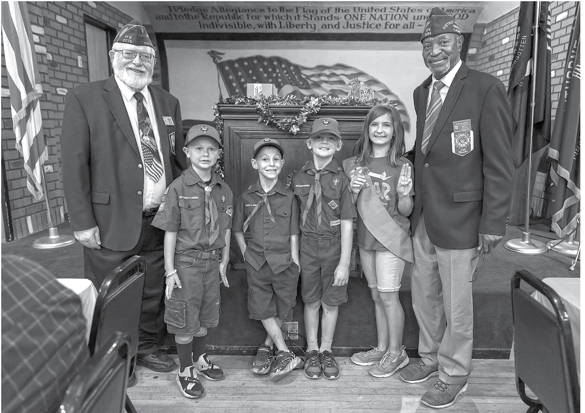
Veterans of Foreign Wars Post 2075 held a luncheon for veterans on Saturday, Nov. 20th at their VFW location in Hawthorne. City officials, the Boy Scouts, the Girl Scouts, along with Congresswoman Maxine Waters and Senator Steven Bradford came together to greet the vets and have a nice lunch with them. Food was provided from donations from Food 4 Less, Costco, and VFW Post 2075 members. Special Thanks to Hawthorne Interact Club and the Naval ROTC from Hawthorne High for their time volunteering with helping passing out food.