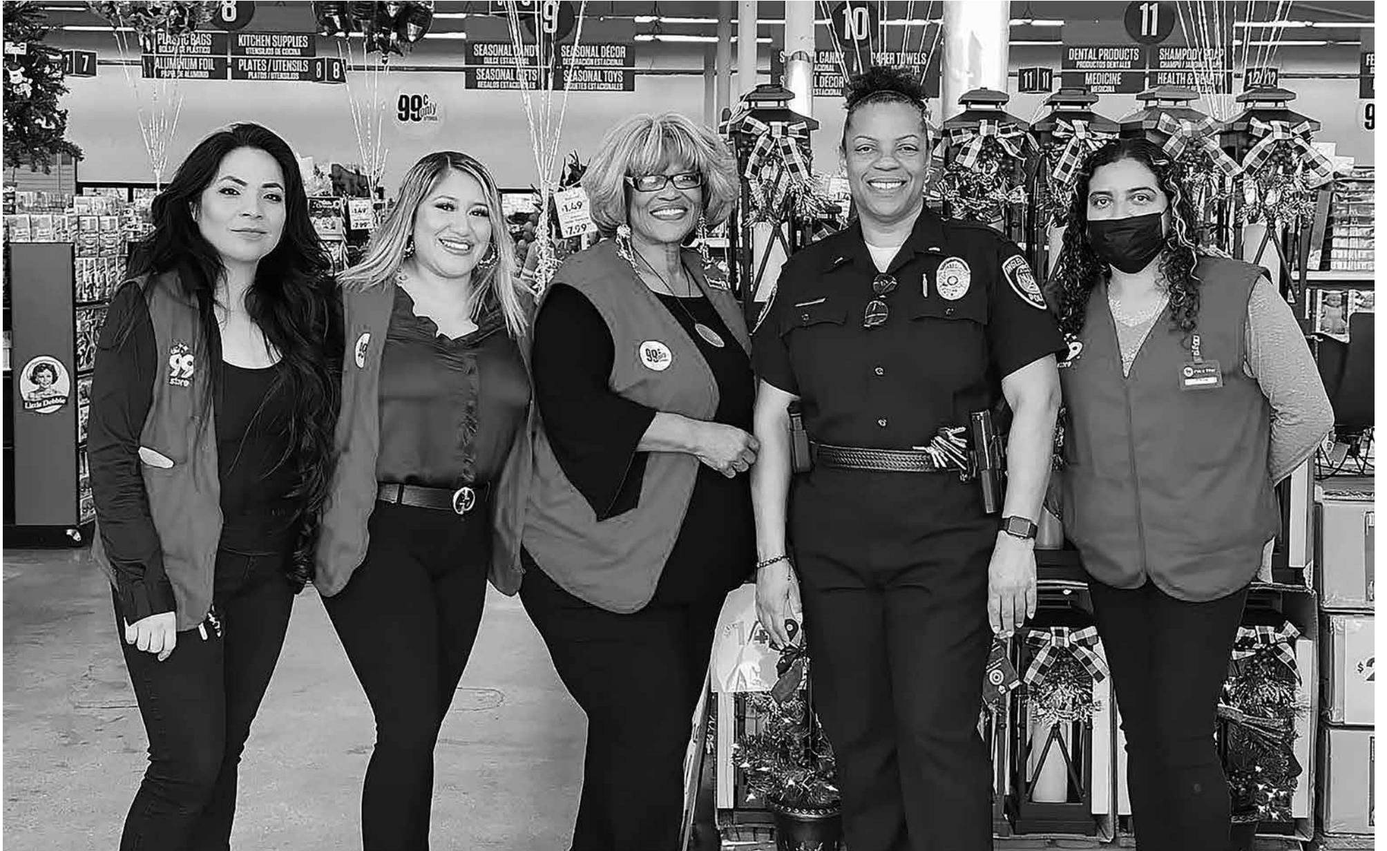
Inglewood Police Department spent time getting to know the community they serve. Thank you 99 Cents Only Stores for hosting Coffee with a Cop and connecting with our officers.