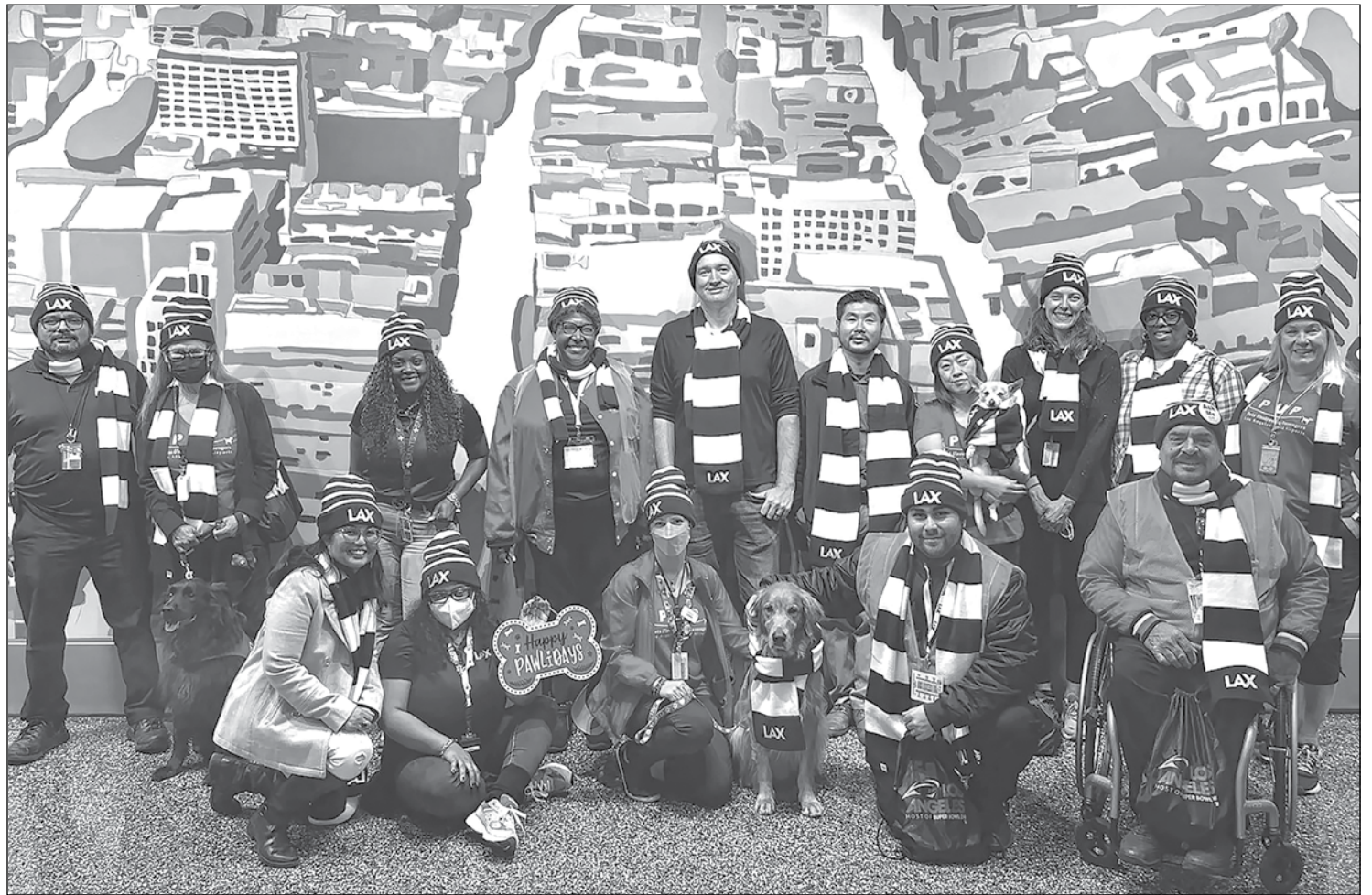
LAX expected about 200,000 passengers to use the airport each day, Tuesday and Wednesday, leading up to Thanksgiving day. LAX PUPS (Pets Unstressing Passengers) and our TLC and iCARE volunteers were in the terminals, answering passengers' questions and giving away gifts while supplies lasted. Thank you JCDcaoux for donating the beanies.