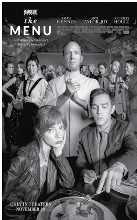
The Menu

The world of fine dining is an elusive one. The thought of spending a month's paycheck on a meal—regardless of how many Michelin stars it has—feels like a blasé act reserved for the affluent community. So, when the opportunity arises to enter into the world of elitist eaters for one unforgettable night, of course one would jump at the opportunity. What could possibly go wrong? Turns out, a lot, as seen in The Menu , a satirical thriller that puts a clever spin on the “Eat the Rich” anecdote.