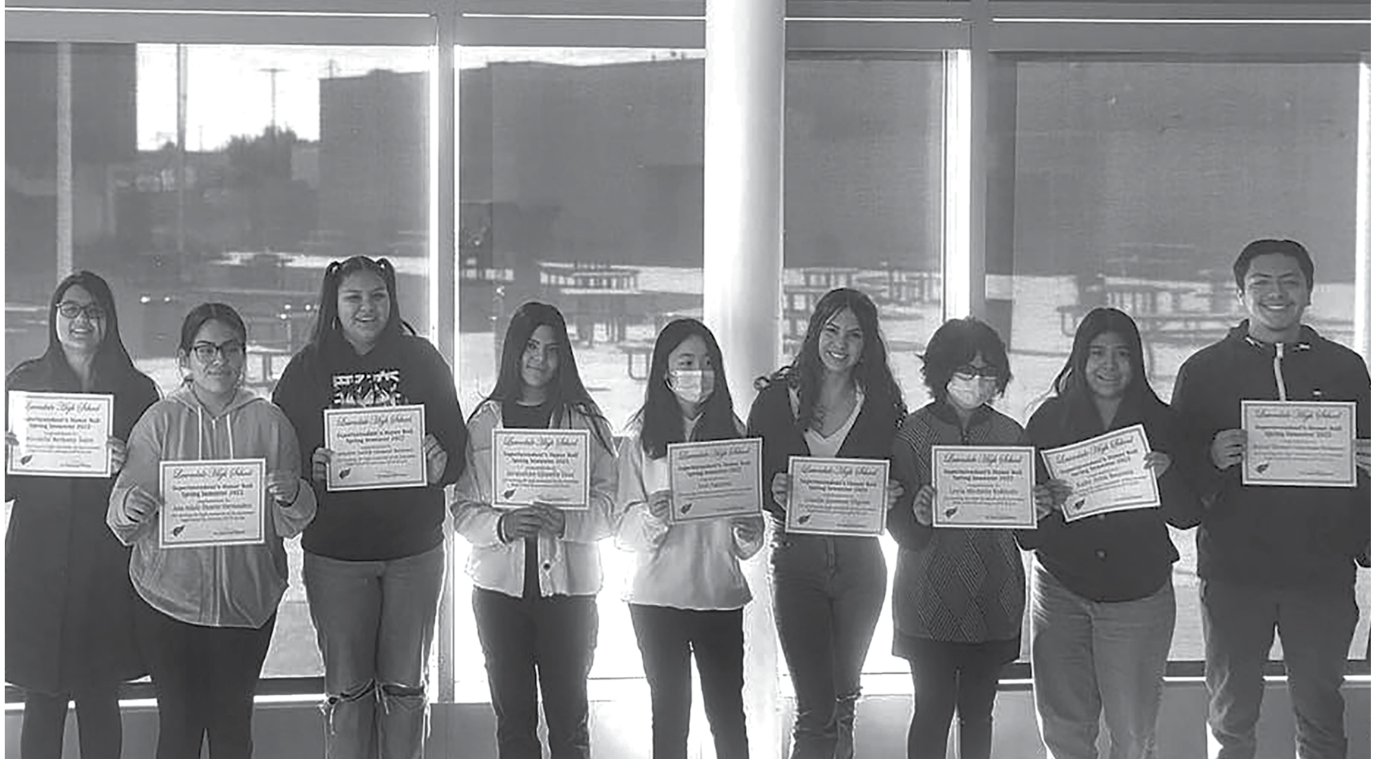
Lawndale celebrated six-hundred and five students during its three grade level honor roll assemblies. These students demonstrated academic excellence during the spring 2022 semester. Thank you parents for coming out to support.

"You are braver than you believe, stronger than you seem and smarter than you think."