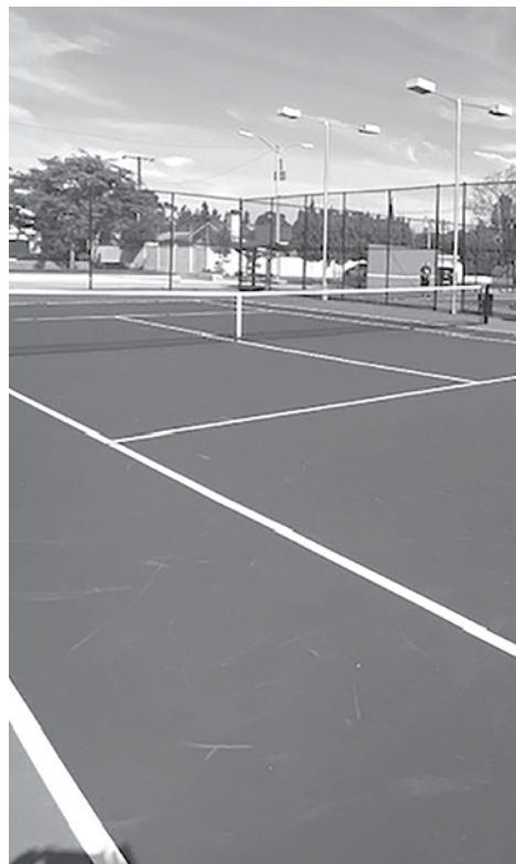
Hollyglen pickleball court.