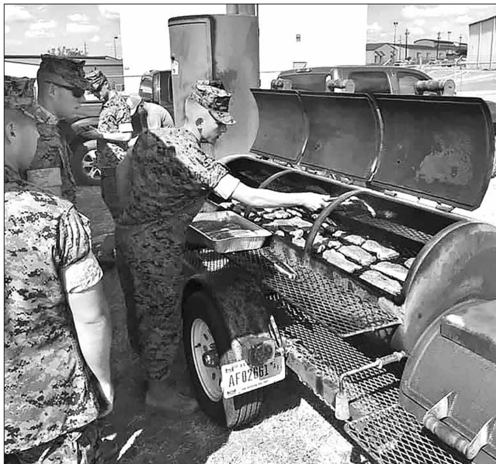
Making the Feast.