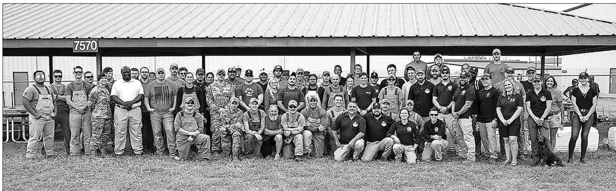
One of the Feeds.