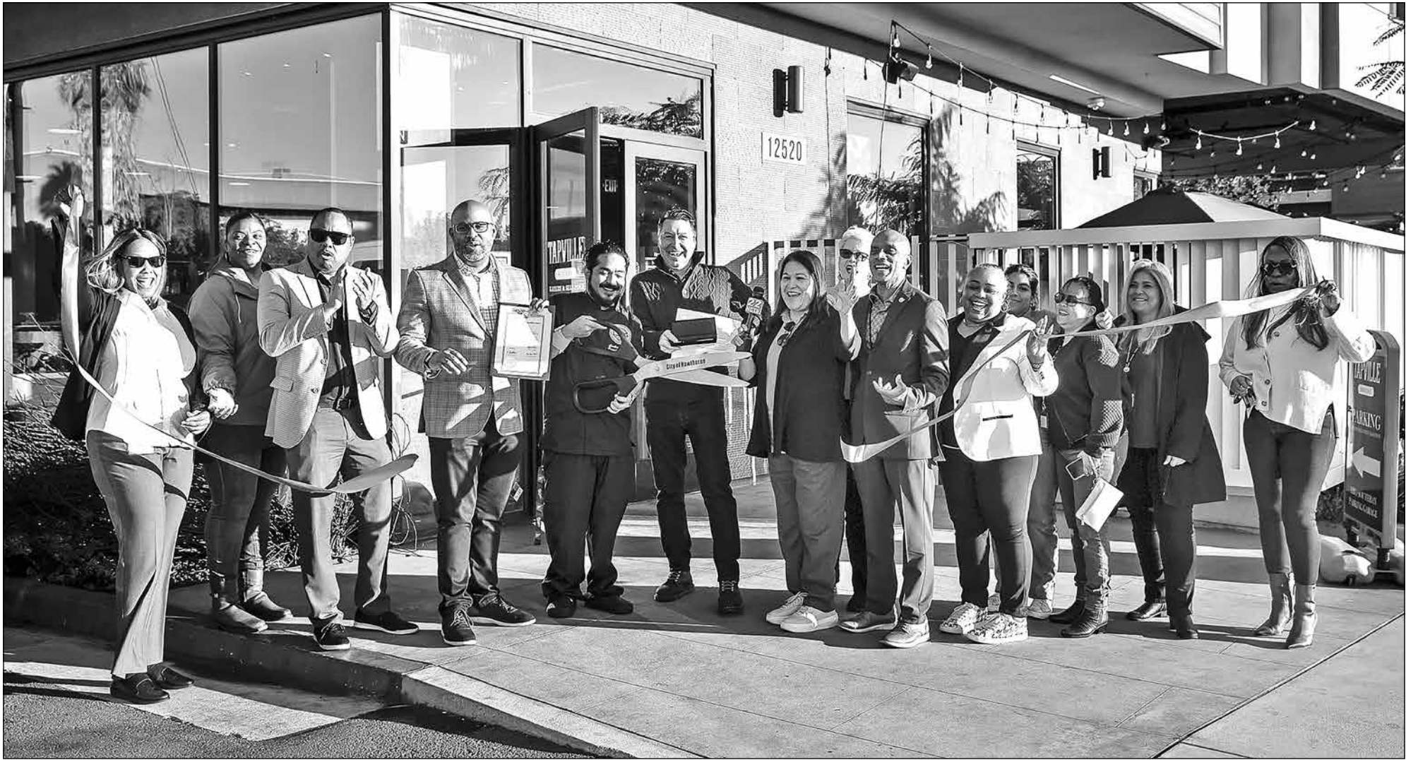
The tech-forward hospitality brand, known for its American scratch kitchen, craft cocktails and innovative self-pour beer and wine taps, has opened its first California restaurant location here in Hawthorne. This new location boasts over 90 unique selections of premium bourbons and tequilas and features a rotating list of forty-eight selections of beer and wine taps, making it easy for guests to explore and customize their dining experience. Please support our local businesses.