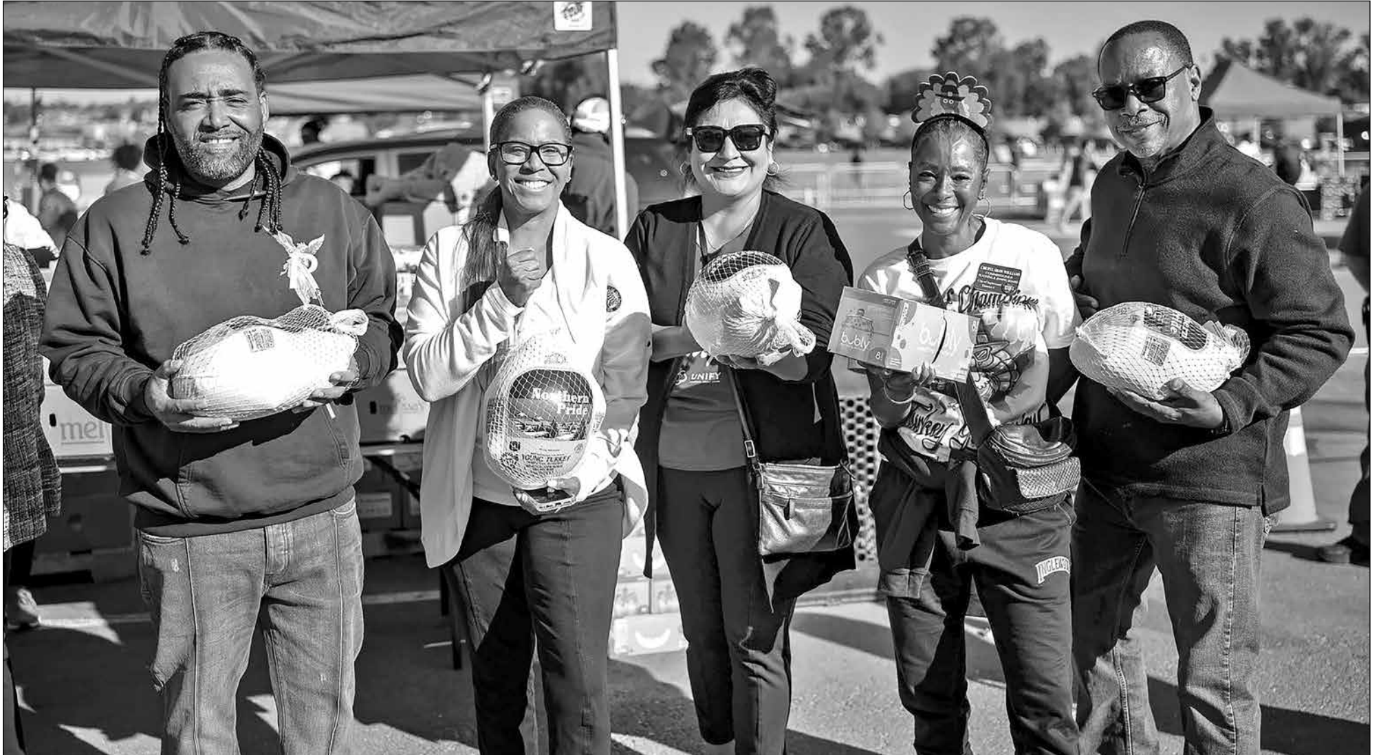
A huge thank you to PepsiCo and Don Lee Farms, two-thousand and five-hundred residents were served with turkeys, boxes of delicious sides, and goods from Los Angeles Food Bank, Melissa's Produce, and Rockstar Energy Drink. Much gratitude to our amazing volunteers and generous sponsors who bring this event to life every year.