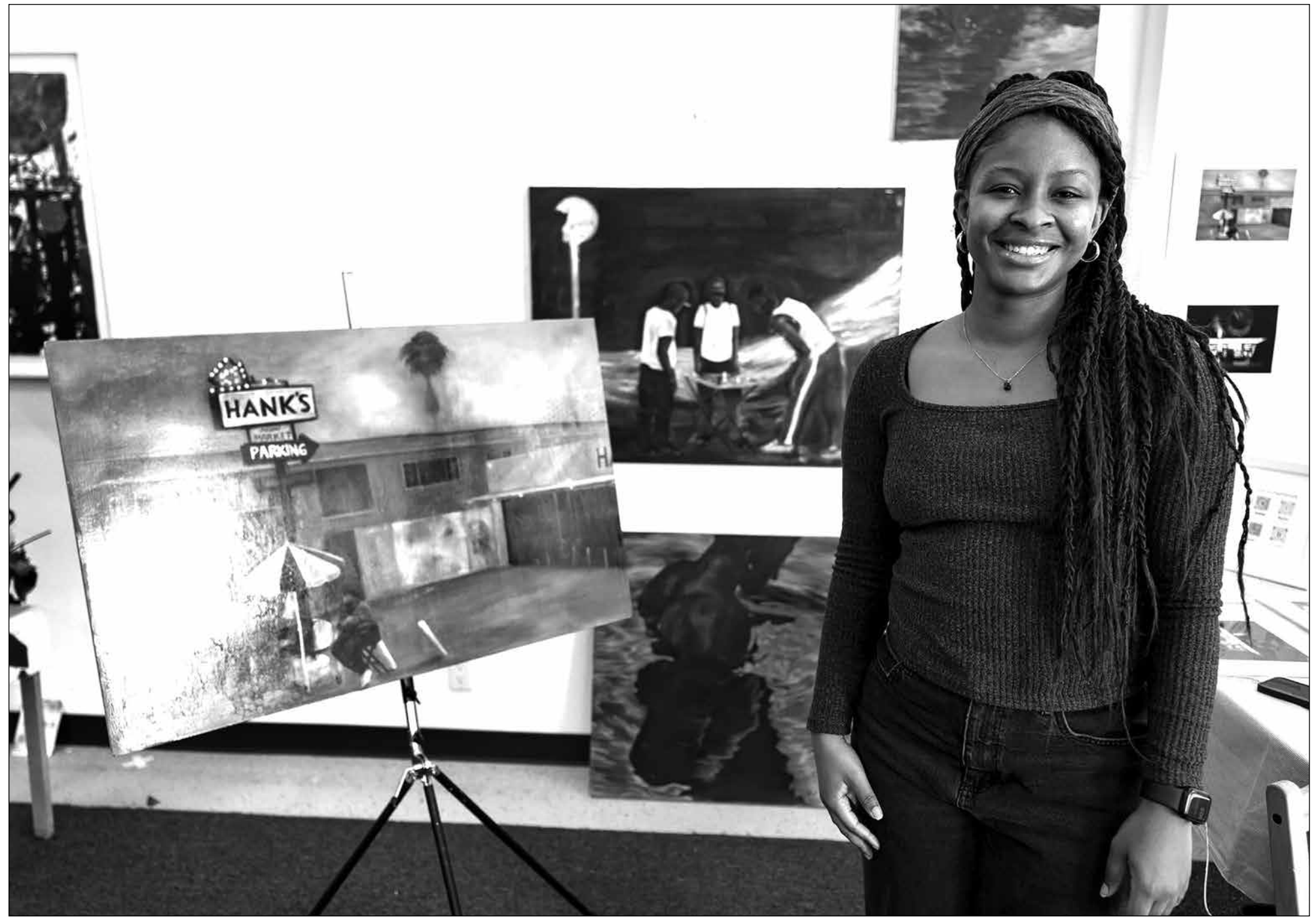
The city came alive with incredible art, showcasing the talent that makes our community so unique. Be sure to follow Inglewood Open Studios for a glimpse into the incredible talent that graced our city this past weekend.