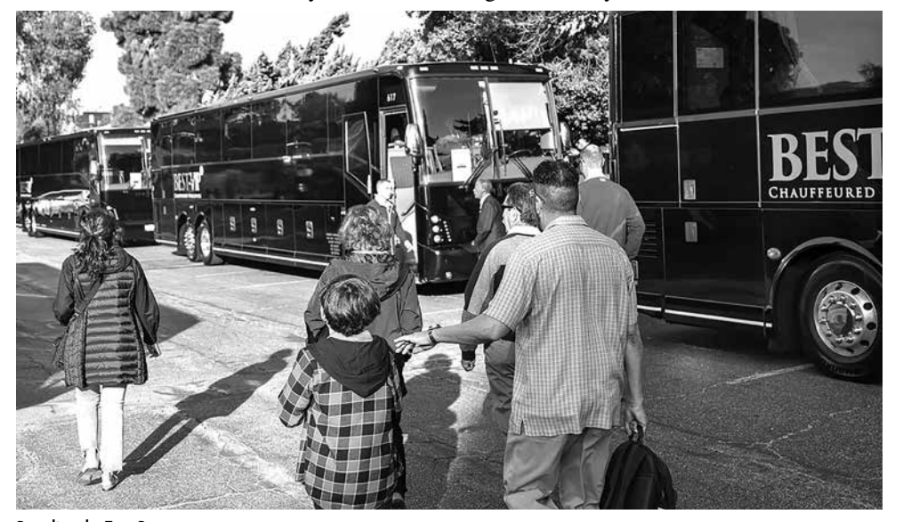
Boarding the Tour Bus.

The City of El Segundo is such a good place to live, visit, and spend some time. El Segundo touts aerospace, great restaurants, businesses (from Pilates to Beyond Meat), very fine schools, the Little League World Series champions, and really good breweries, among other positives. But most would not think to say: "Don't forget the Chevron Refinery!" After a visit there, after research and study, and after taking a closer look, you'll be convinced to say the refinery is something for El Segundo to brag about, too. •