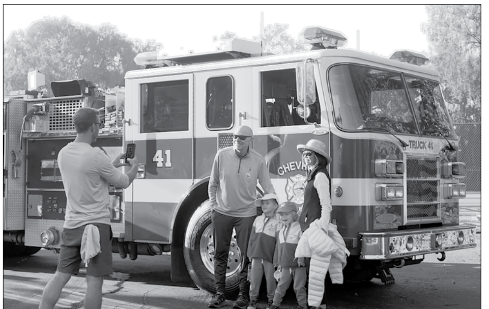
Chevron's Fire Truck.

Security is, of course, extremely important. We were asked not to take photographs and to remain inside the bus, which slowly wound See Chevron, page 8