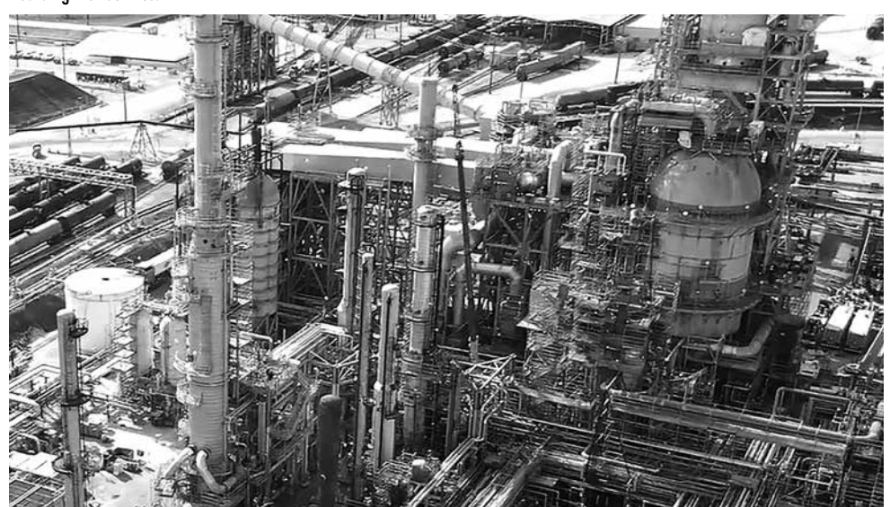
Fuel From Soy Bean Oil.