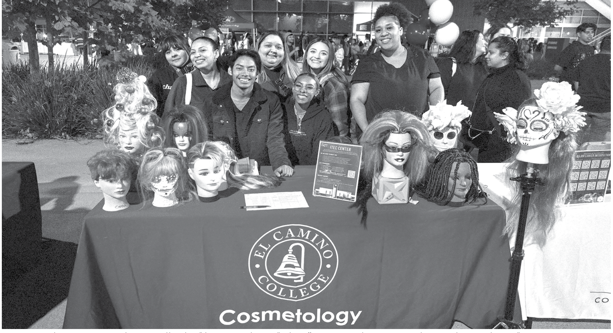
It was amazing to see the community come out in numbers (1,200+) and learn about all the great resources El Camino College has to offer. We can't wait to welcome our prospective students in 2024.