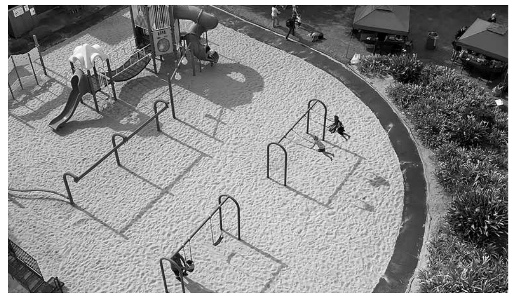
The Employee Playground.