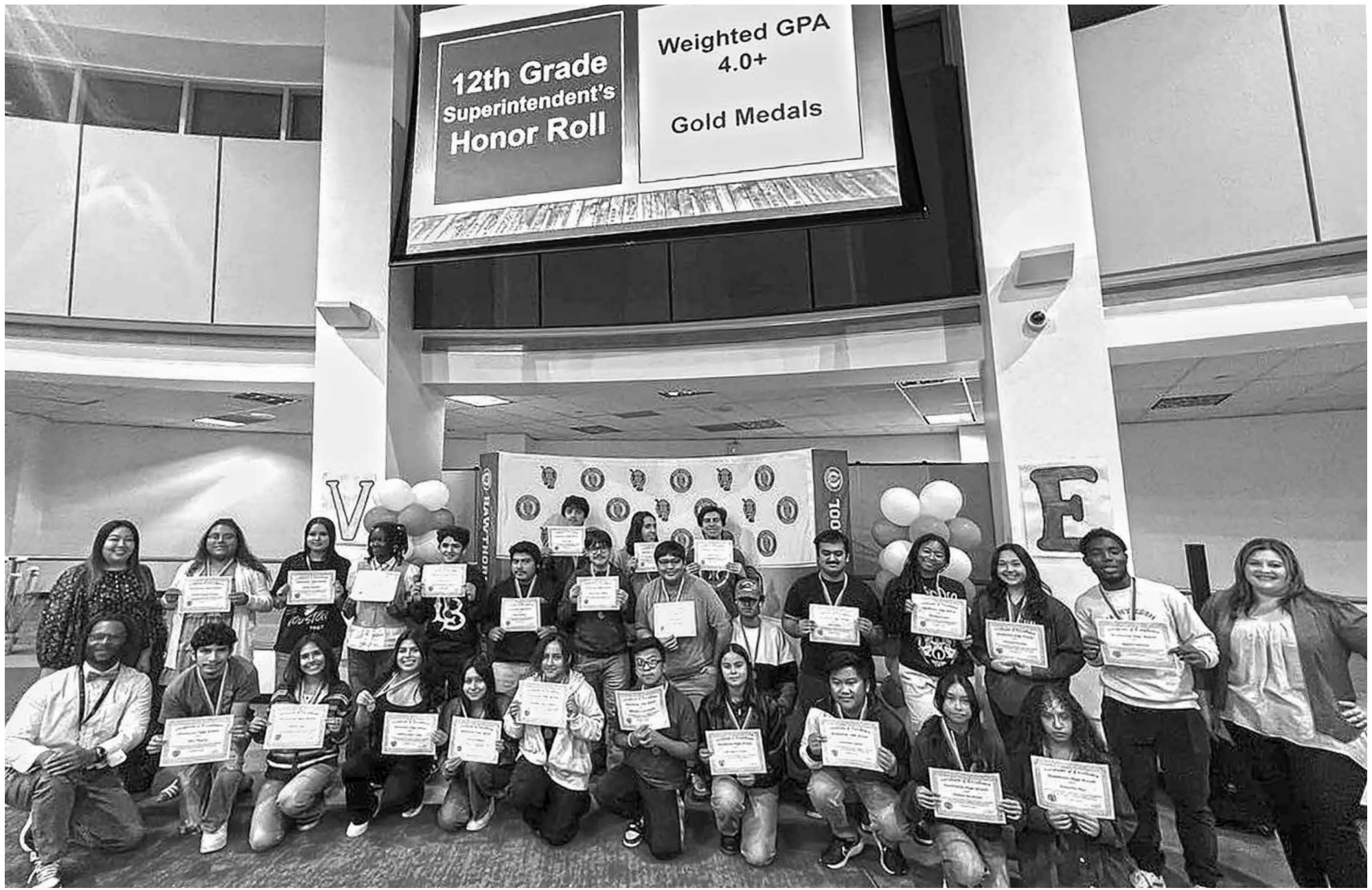
We are so proud of our cougar scholars. Keep up the PAWesome work. Graduation and life after high school is just around the corner.