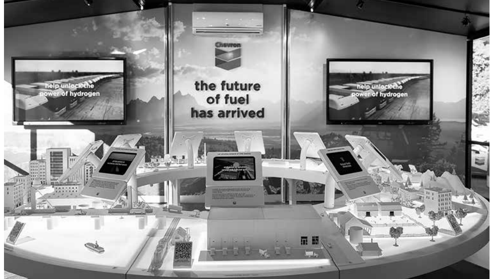
Chevron Looks Forward.