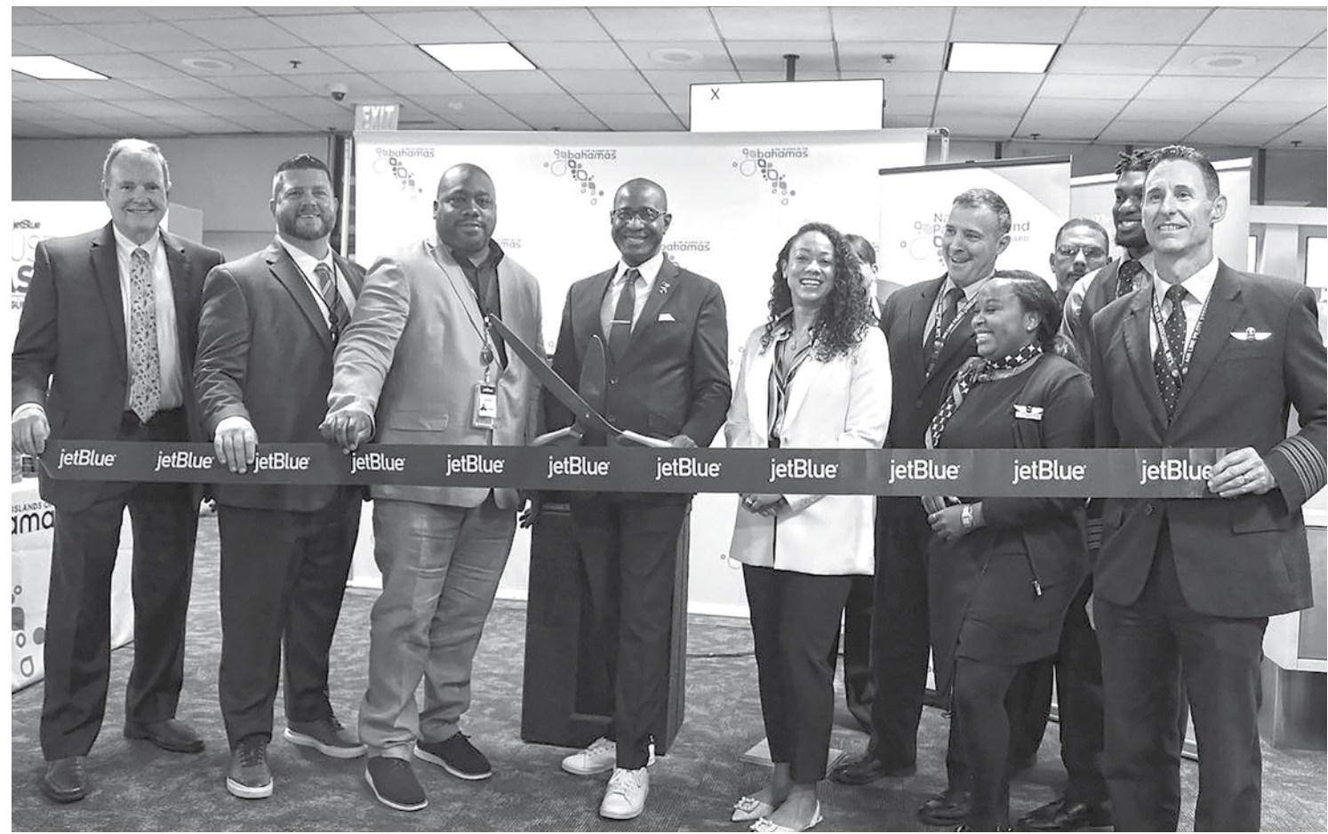
This is the only direct flight to the Bahamas currently offered by any airline at LAX. Passengers were treated to Bahamian pastries, a gift bag, and visit from the island's mascot, courtesy of Visit the Bahamas, before they took off on a quick 5.5 hour journey to the island destination.