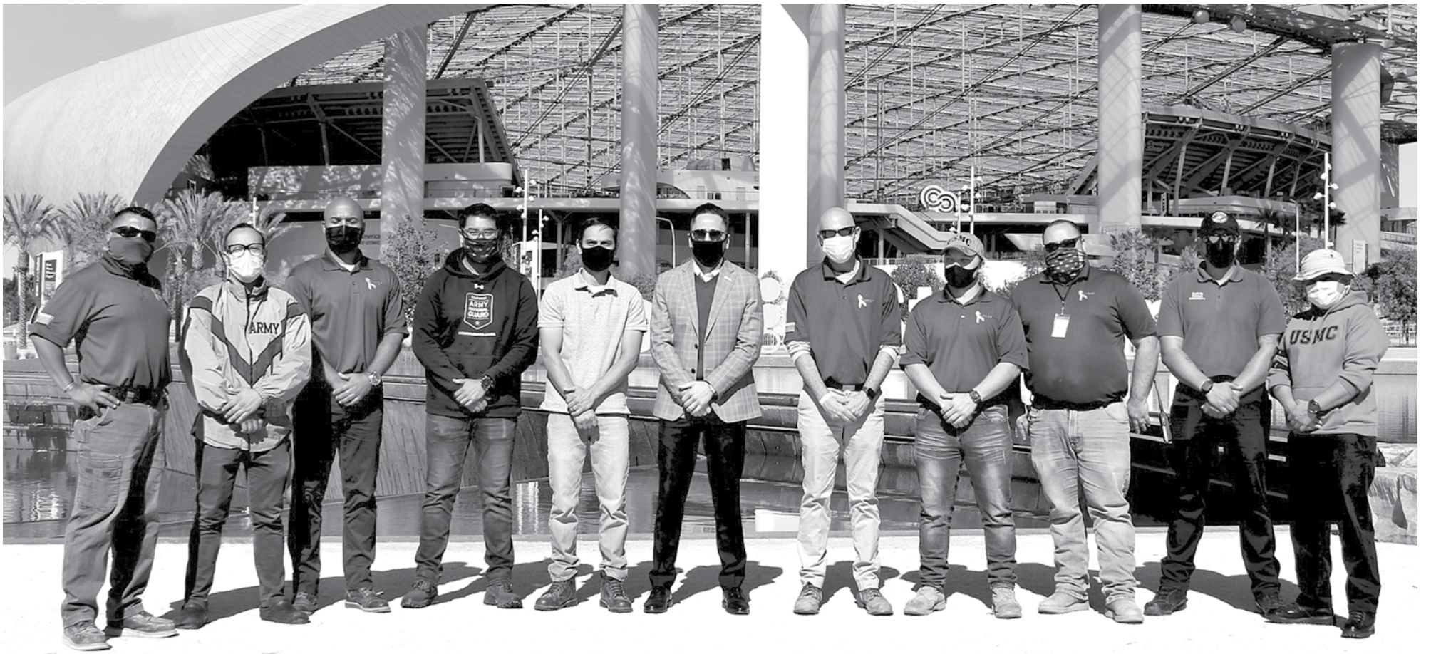
We honor all those who served. Thank you to the men and women who have served and are currently serving in our nation's armed forces. Your courage, dedication and sacrifices are appreciated. Pictured are Veterans who now work for SoFi Stadium and Hollywood Park, Legends and Turner AECOM Hunt Joint Venture.