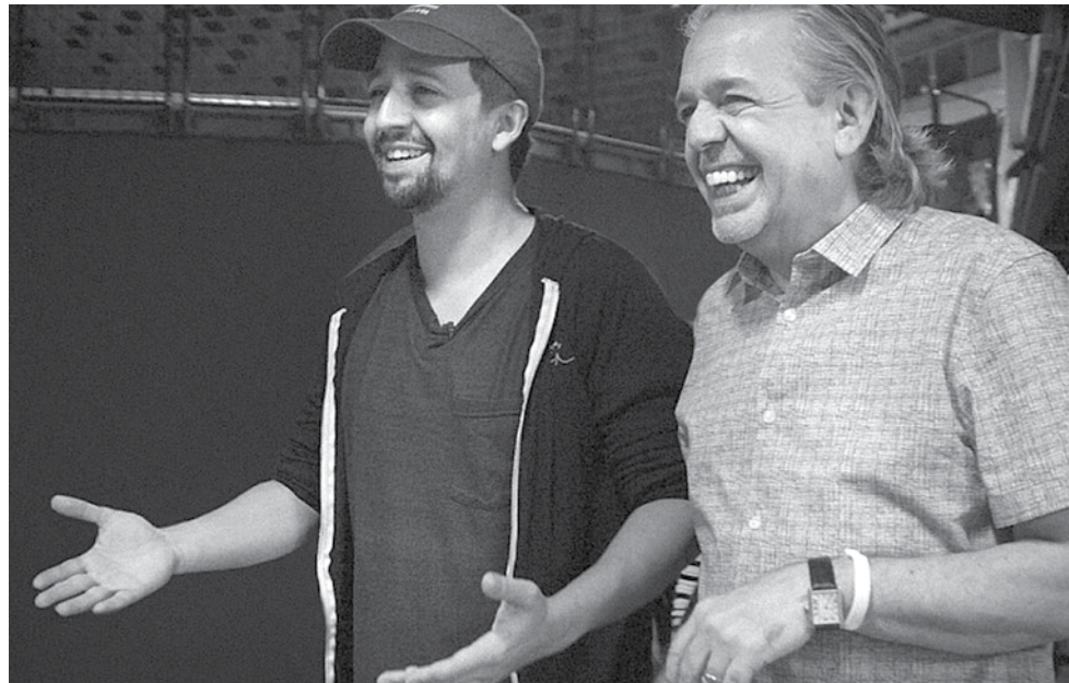
Siempre Luis , courtesy HBO.

Siempre, Luis tells the beautiful story of a unique, proud immigrant who found a way