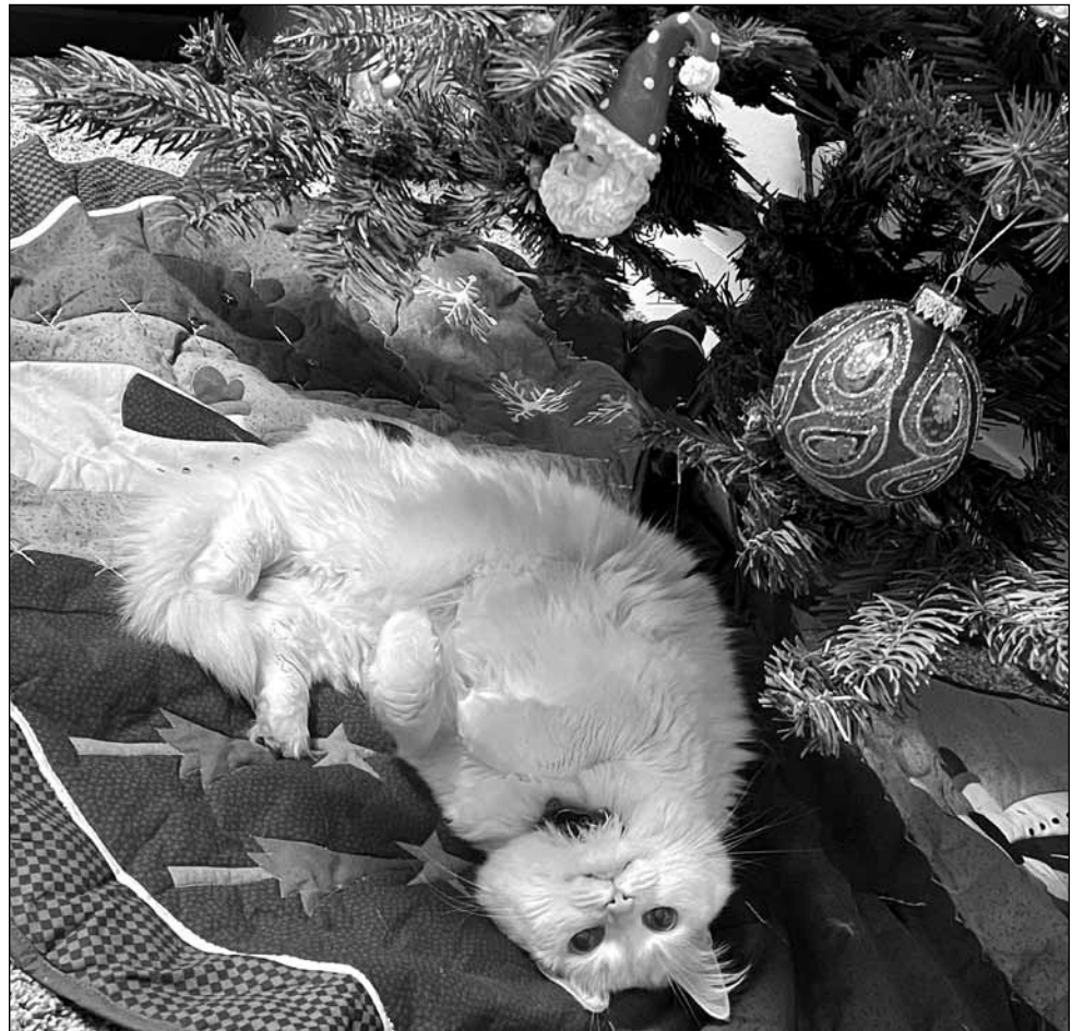
Happy Holidays from Cloud and her family.

California, moved to Washington D.C., and now she's living in Anchorage, Alaska! Cloud has proven to be an excellent traveler, and blessings to her family for taking her with them to each new city. Happy Holidays from Cloud. •