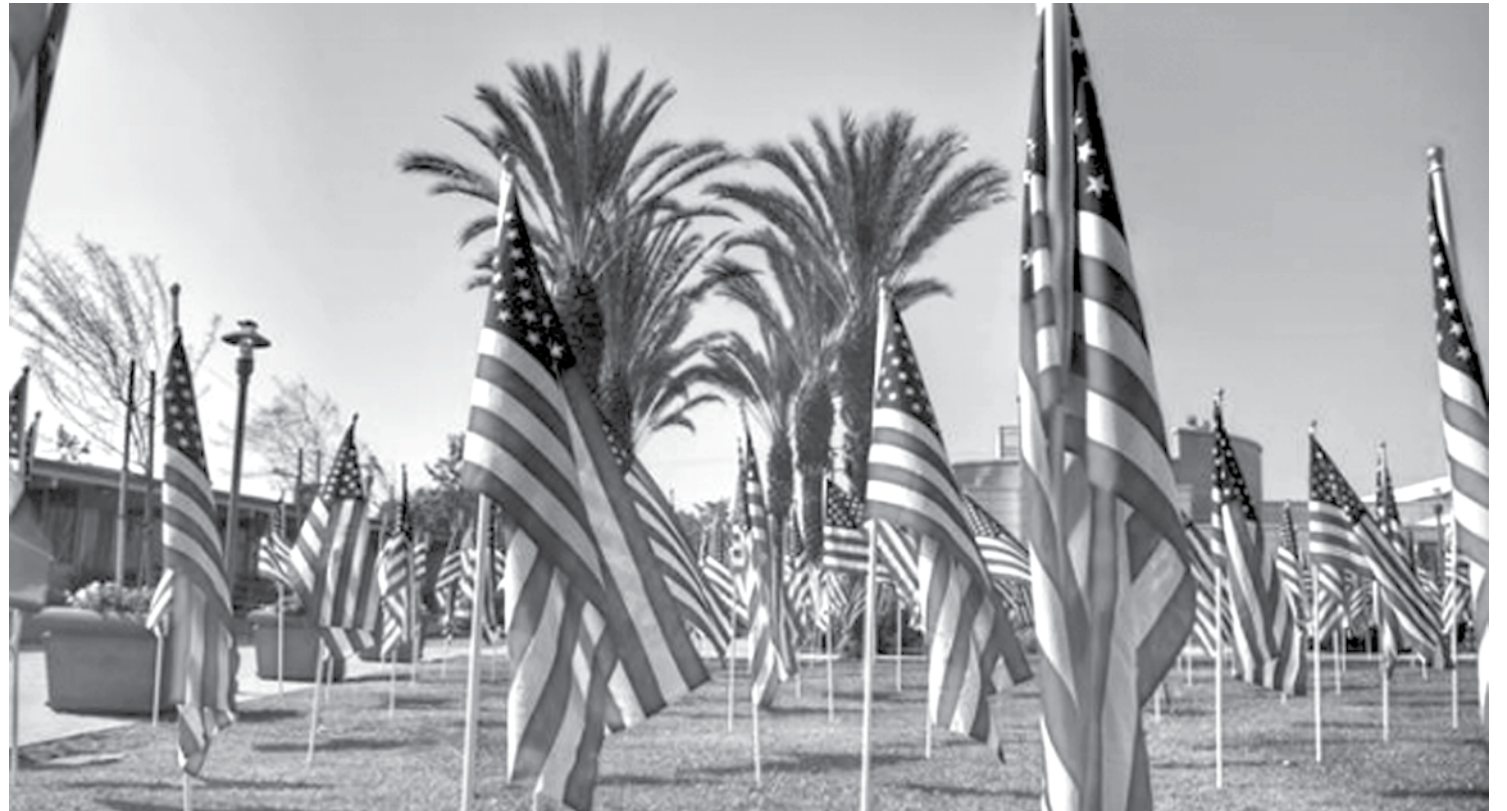
The City of Lawndale's 5th Annual Field of Honor Event took place on November 10th - November 12 in the plaza in front of City Hall. Hundreds of American flags were placed in a set formation and displayed for the community to honor and celebrate those who have served in our armed forces. Light towers were present to keep the field illuminated for the duration of the event. Thank you to all our Veterans.