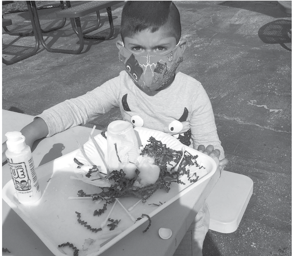
This is what socially distanced learning looks like. The City of Lawndale is so happy to have their first group of students back in person and ready to learn. Most importantly, they are making sure their students and staff are SAFE & HEALTHY.