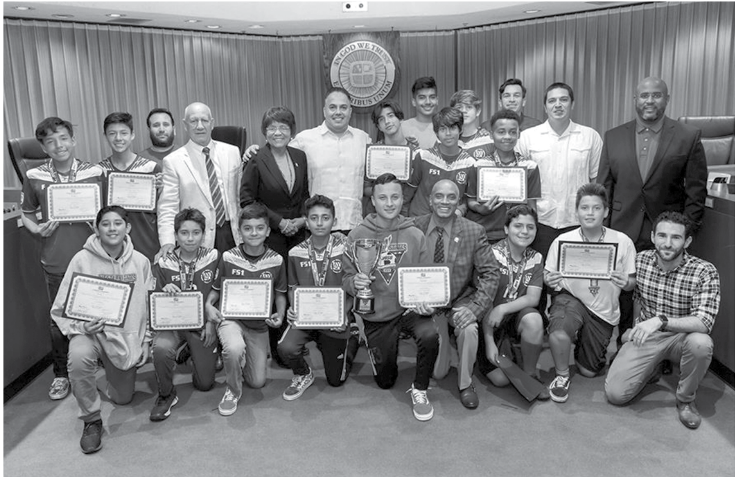
The Blue Strikers of AYSO Region 21, Hawthorne Boys U-14 received special recognition at the last Hawthorne City Council meeting for going 33-0 en route to the Western States Championship.