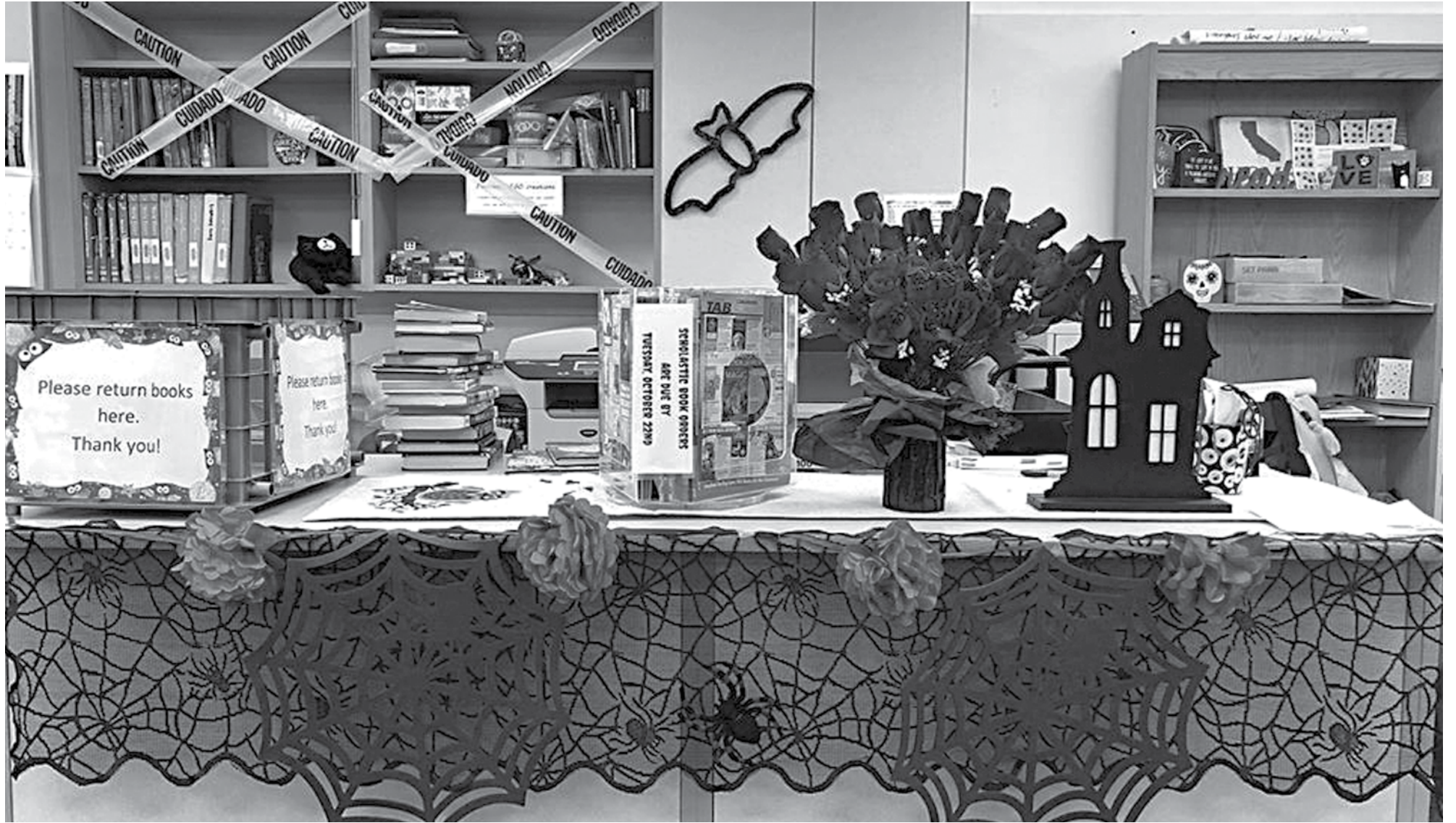
The Chevron 21st Century Media Center at Will Rogers Middle School in Lawndale got into the Halloween spirit this year to make this learning place fun.