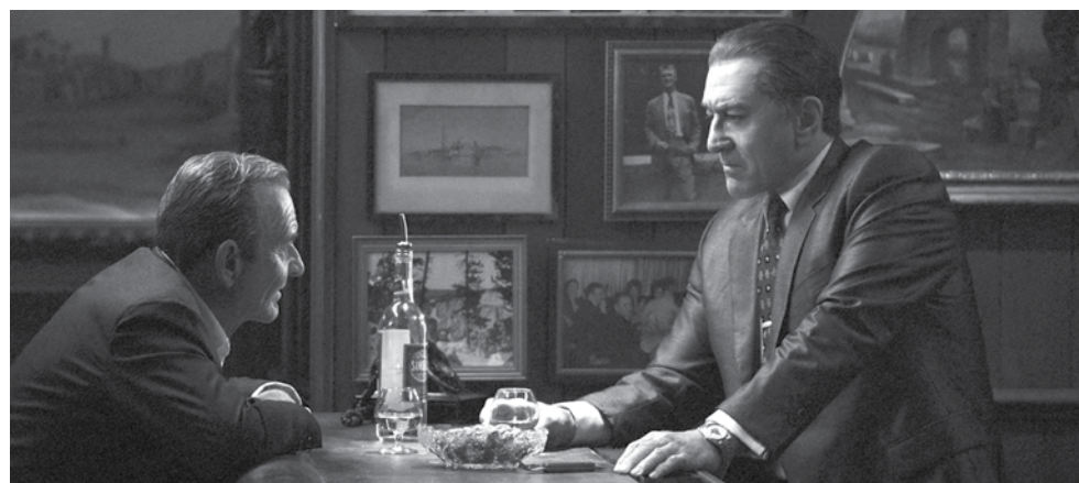
The Irishman

period-piece imagery and superb direction that audiences have come to love and expect from Scorsese, The Irishman is also surprisingly introspective, as he examines death and isolation in a closer way than ever before. Of course, plenty of humor is incorporated into the script – which is fantastically acted through further performances by Harvey Keitel and Ray Romano – but it's the film's quieter moments that make it so unique. De Niro's performance – or performances, plural, as he plays Frank through many years of his life with the help