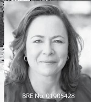
BRE No. 01905428

As you walk through the front door notice the original hardwood floors, coved ceilings and fireplace facade with original light fixtures that anchors the living room. The cozy nook off the living room is perfect as a home office or reading nook. The dining features an original built in buffet with an etched glass mirror back. Off the hallway the two bedrooms are well appointed with ceiling fans. The bathroom has a glass shower enclosure, tiled floor and pedestal sink. The galley kitchen is full of natural light with new stainless steel appliances and new light fixtures. Washer/Dryer hook ups are in the back of the kitchen across from the pantry. The back yard is perfect for entertaining and has a one car detached garage off the alley. Super charming home from a generation past!!