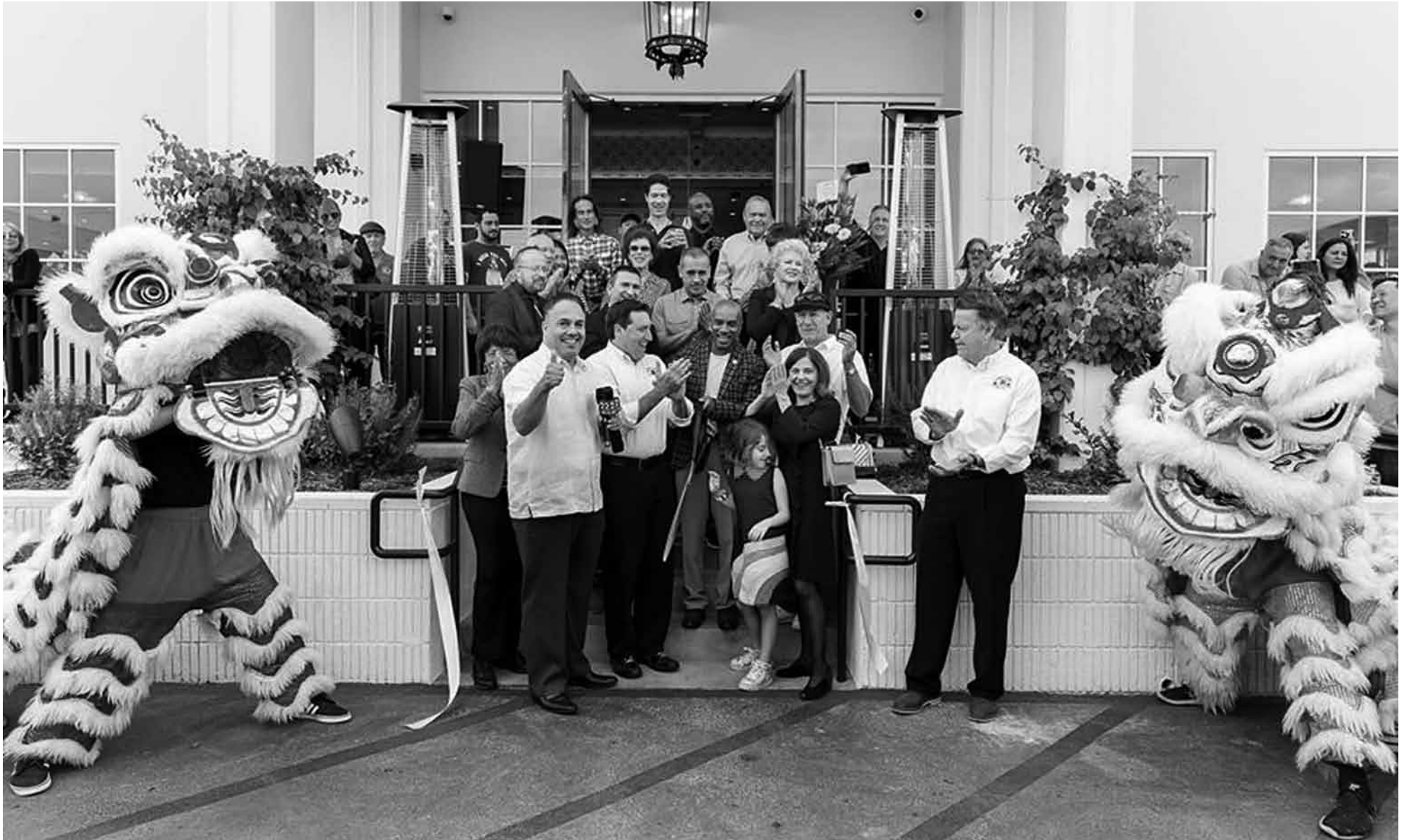
A grand opening ceremony held Oct. 27 at 4940 W 147th, the site of Urth Caffe's Hawthorne organic coffee shop stand and eatery, brought company founders and investors together with community leaders. The 1.5-acre Hawthorne complex was formerly home to Microcosm Inc., Scorpius Space Launch Co., Holochip Corp. and other providers of aerospace industry systems.