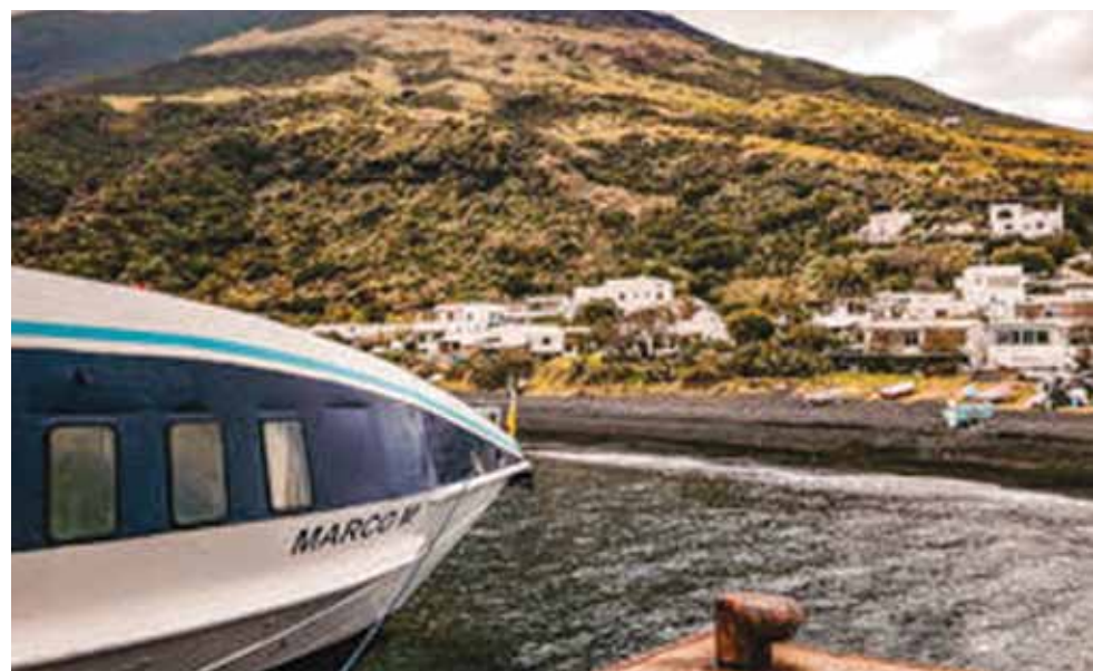
Stromboli belches, a storm approaches—time to cut and run.