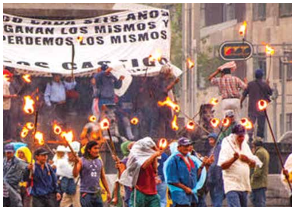
Friendly fires on la Reforma in Mexico City.