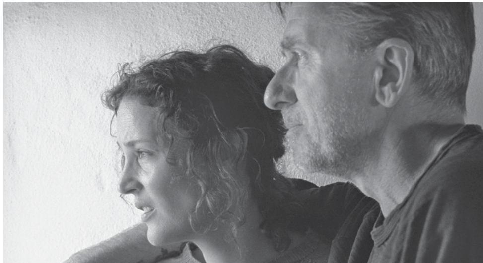
Bergman Island

pages and meet her protagonist, a young filmmaker named Amy (Mia Wasikowska). In Chris's story, which she narrates, Amy is forced to work through complicated emotional entanglements when she runs into her first love Joseph (Ander Danielsen Lie) on the Fårö island. Amy's struggles don't seem so far off from Chris's, giving the impression that