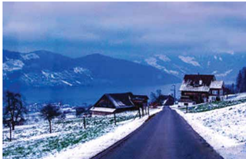
More view than you'll ever need, above the Vierwaldstättersee in Luzern.

foolhardy. And you have much more control over where you land along that line than you might want to think. And no, there is no sharp point awaiting you at the tippy-top of a Swiss Alp. But keep trying—we certainly will. Next up: How We Re-invented the Orient Express and Found Dracula Along the Way.