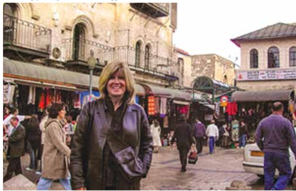
One hundred small steps (one giant leap?) for womankind at the East Jerusalem Gate.

Anger, on the other hand, shifts with the winds of religion and culture and the global competition for resources, but mostly with the leadership cycle in a given country. Right now, is probably not the best time for an American to go people watching in a bar in Kinshasa or Caracas. Probably not the best time to try out your new bikini on the beaches outside Riyadh or Casablanca. Beirut was a paradise in the 1950s and a catastrophe from the 1970s