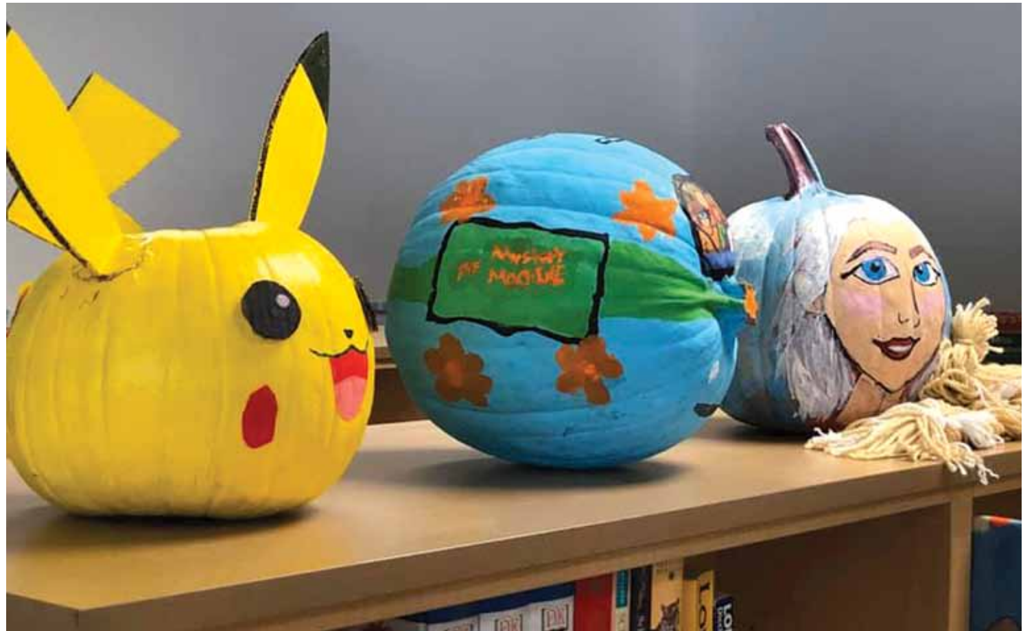
There were over 100 entries in the Literacy O'Lantern competition at Juan Cabrillo Elementary. Thank you to all the participants for their creativity and their artistry. It truly created the Spirit of Halloween.