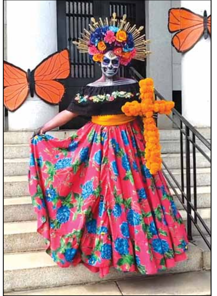
A Día de los Muertos drive thru event took place last weekend at IPC. It was a time to celebrate with love, music and memories of our loved ones.