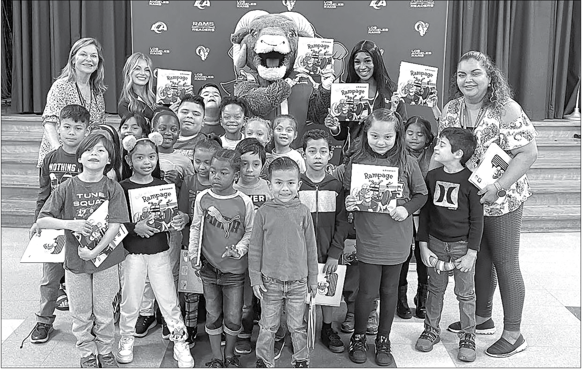
FDR Elementary had a Rams Readers Rally for the 1st - 3rd grade students. Students received their own copy of "Ride with Rampage", along with an activity guide, crayons, and bookmark. What a fun day.