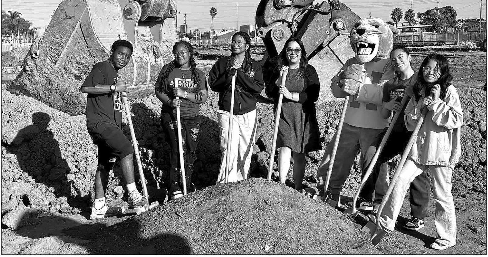
We celebrated the start of an exciting journey as we broke ground on the state-of-the-art Hawthorne High School Athletics Complex Project.