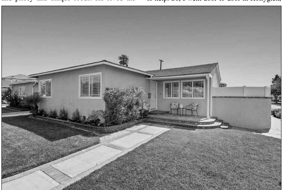
Hawthorne House for Sale

If he knocks on your door (he might), if he does, talk with him a bit. You will see what I mean. •