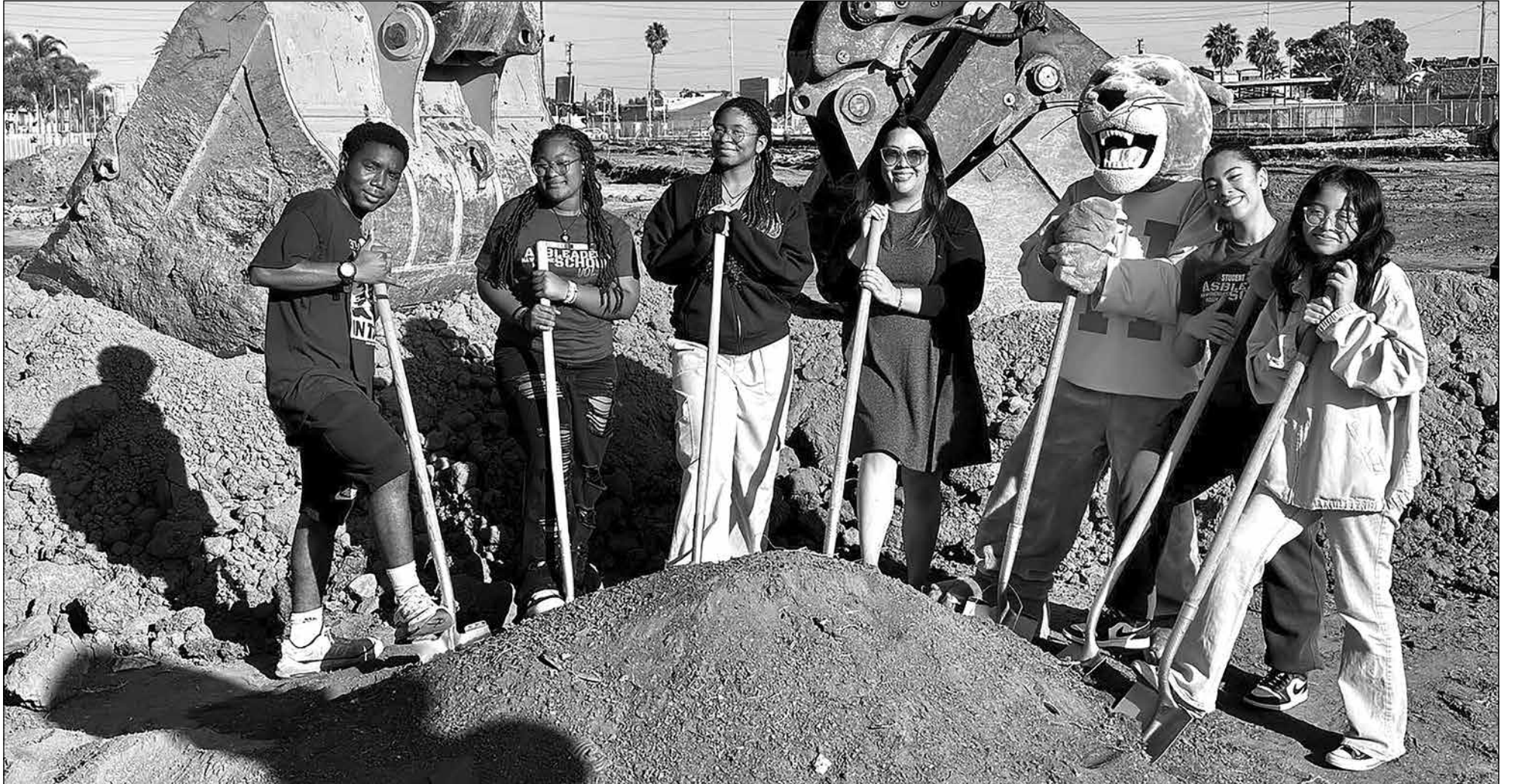
We celebrated the start of an exciting journey as we broke ground on the state-of-the-art Hawthorne High School Athletics Complex Project.