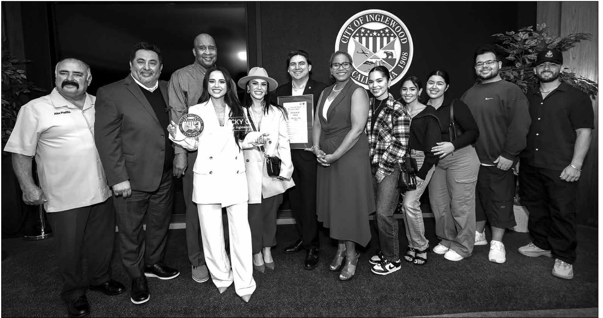
In celebration of National Hispanic Heritage Month, the Inglewood City Council presented Becky G the Key to the City for her extensive contributions to music and the community. This award makes Becky G the very first Latina to ever receive the City's highest honor, joining an exclusive group of individuals who have shaped our vibrant community for the better. "Beyond every recognition and award I've received in my career thus far, this is by far the most special. It's cool to have the key to Inglewood now, because Inglewood has always had the key to my heart." - Becky G.