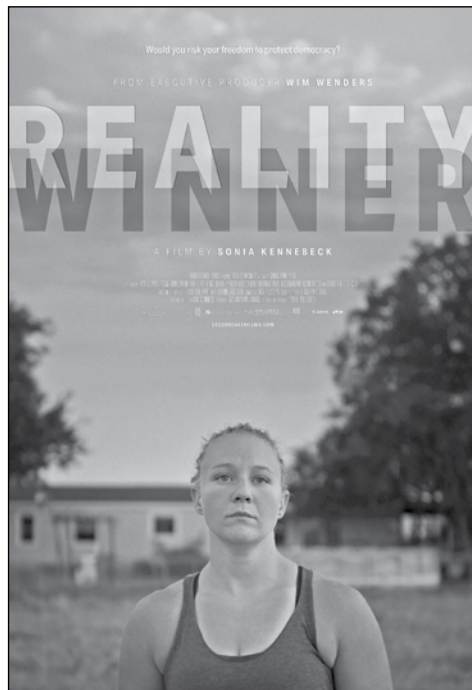
Reality Winner

Former Air Force veteran and NSA contractor Reality Winner was just 25 years old when she was charged under the Espionage Act, facing a decade in prison for leaking a classified document that seemed to prove Russia's interference in the 2016 Presidential