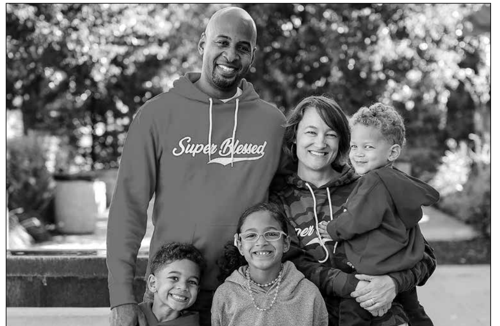
The Medler family