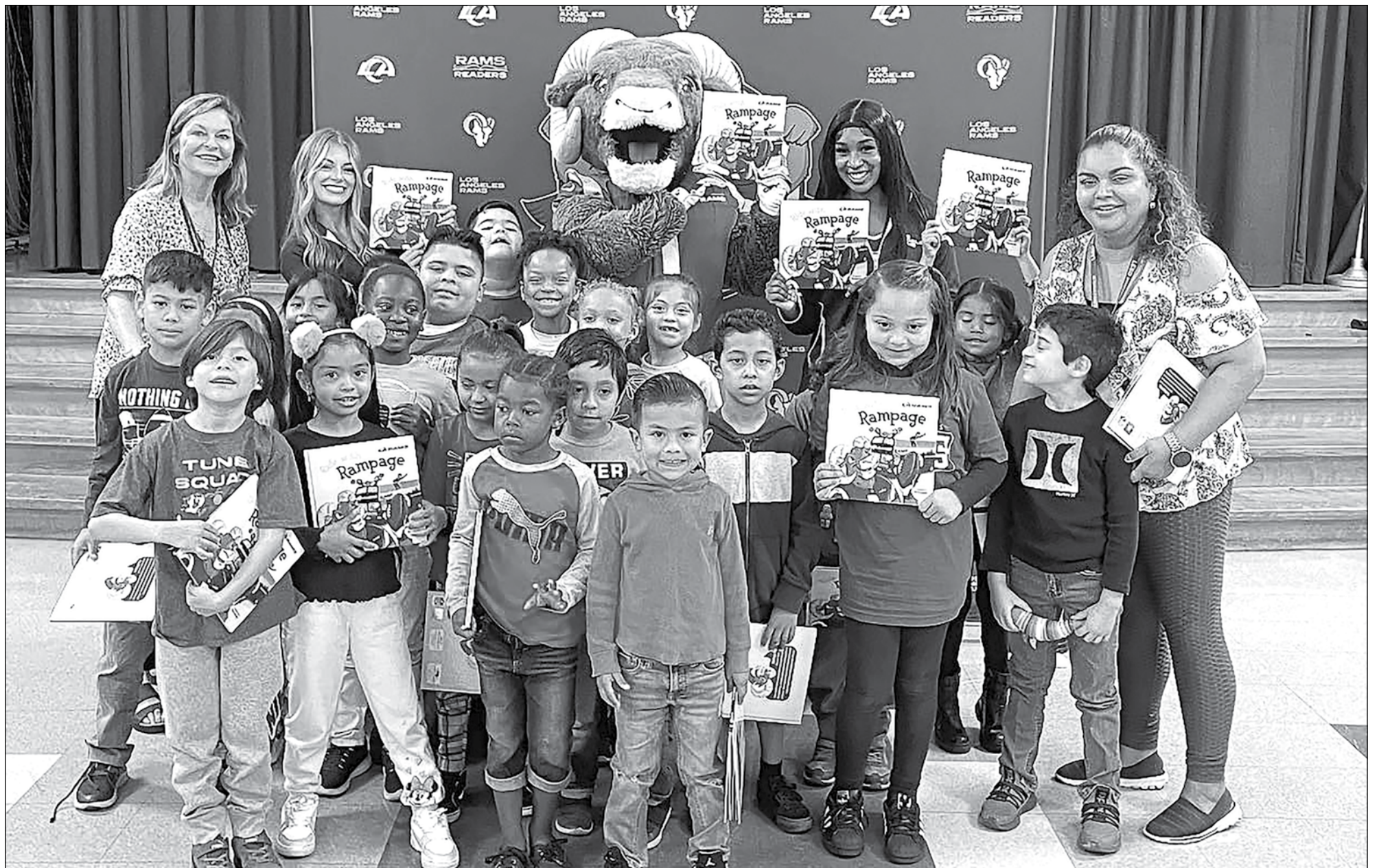
FDR Elementary had a Rams Readers Rally for the 1st - 3rd grade students. Students received their own copy of "Ride with Rampage", along with an activity guide, crayons, and bookmark. What a fun day.