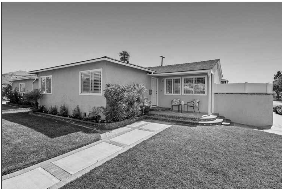
Hawthorne House for Sale

If he knocks on your door (he might), if he does, talk with him a bit. You will see what I mean. •