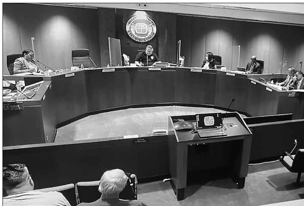
Hawthorne City Council.