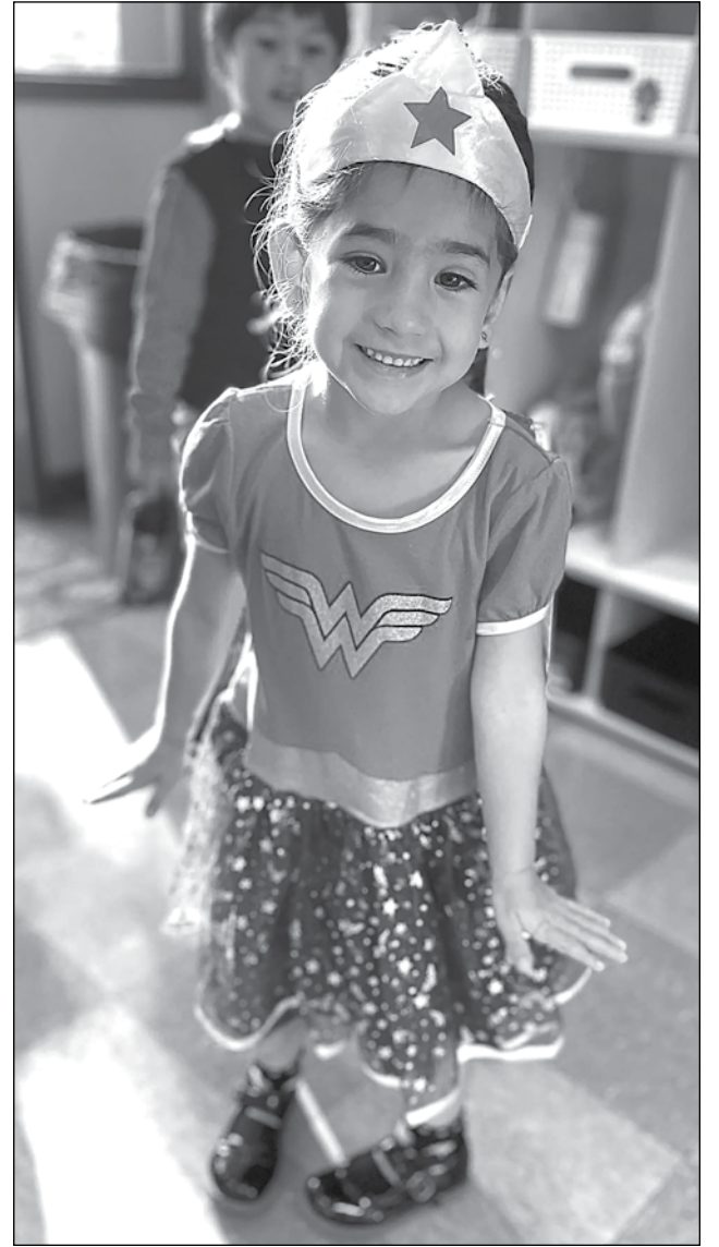
It was Superhero Day and our students got into the spirit by dressing as their favorite characters.