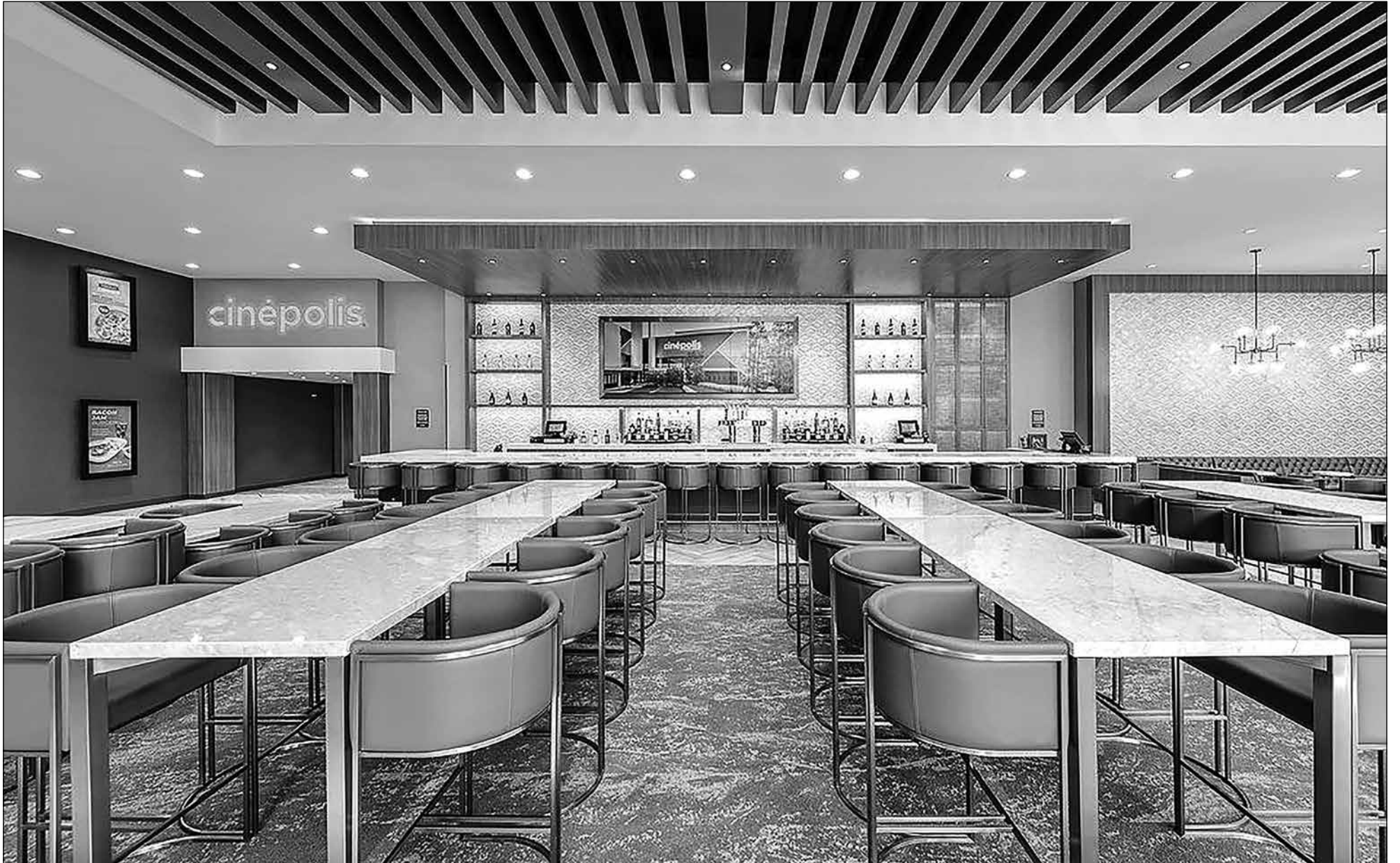
Cinépolis International was originally founded in Mexico in 1971 and was the first cinema exhibitor in the world to pioneer the concept of luxury movie theaters. The first luxury theater experience was in 1999 in Mexico City. Today, Cinépolis has positioned itself as the world's fourth-largest movie theater circuit in the world, operating across 19 countries worldwide.