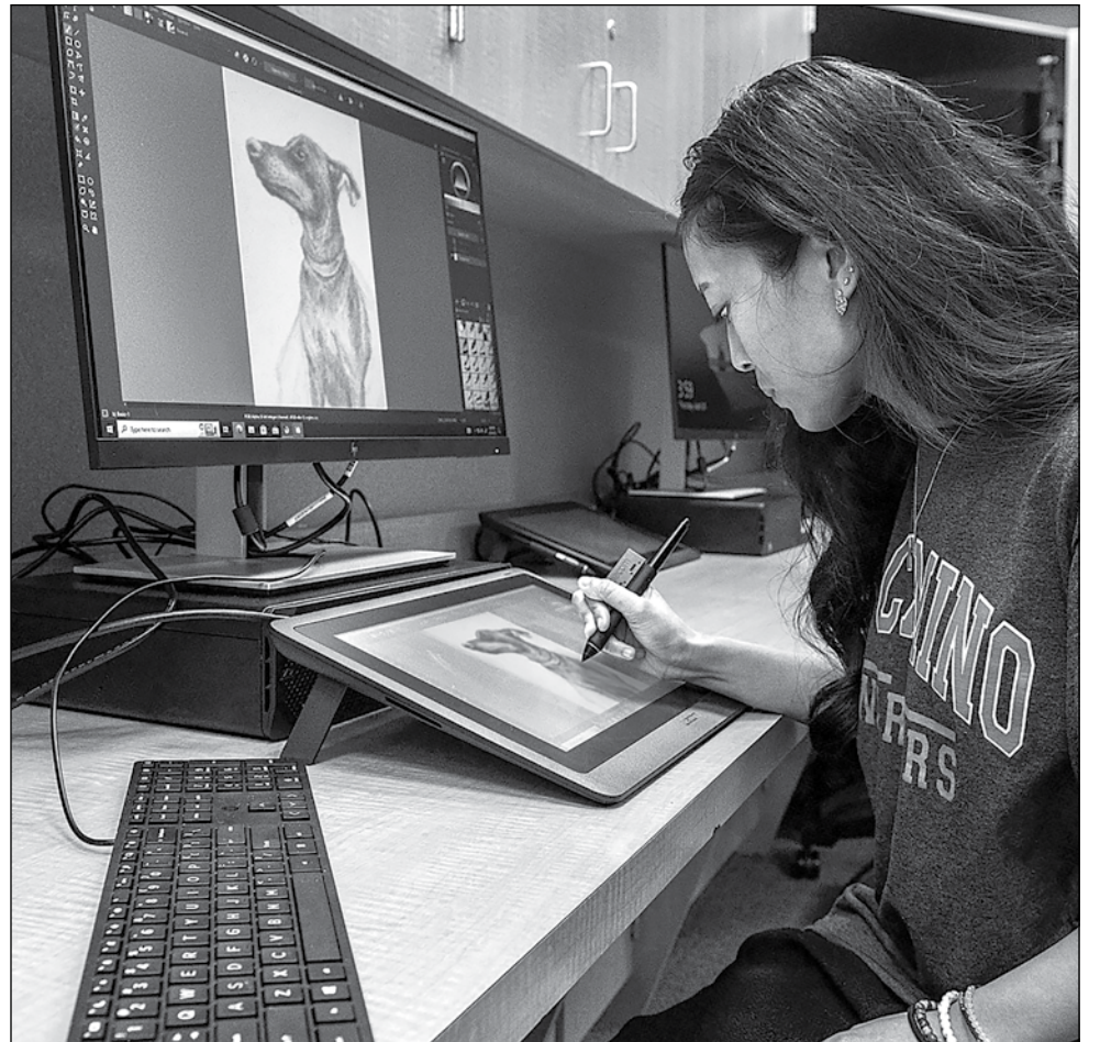
Makerspace is a place for you to explore your making and creative interests. Makerspace offers 3D Printing, Sewing, Electronics, AWS Cars, Wacom Tablets, Soldering, Tools, Virtual Reality, a video recording room and a podcasting, vocal, and instrumental recording studio.