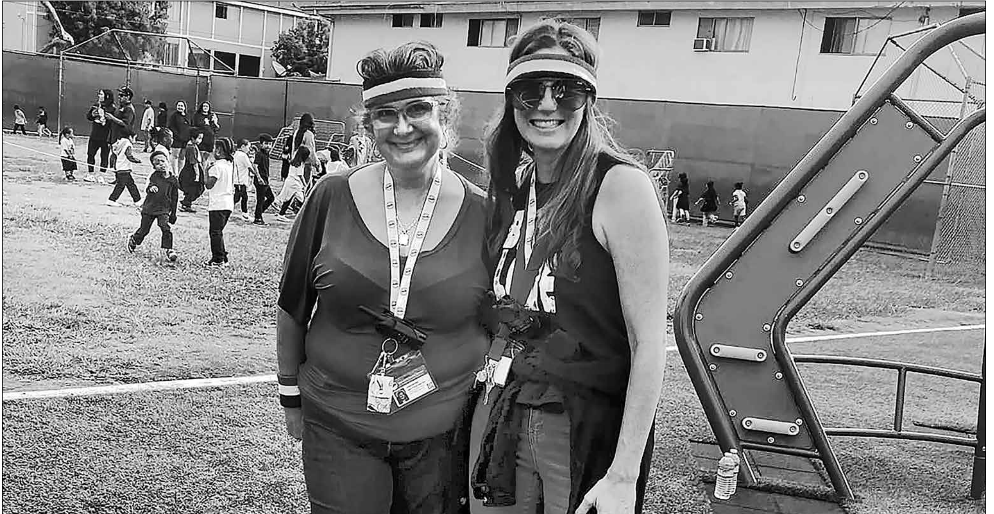
Such a fun time at our Stomp Out Cancer Jog - A - Thon. TK - 2nd grade had a great time while helping those in need.