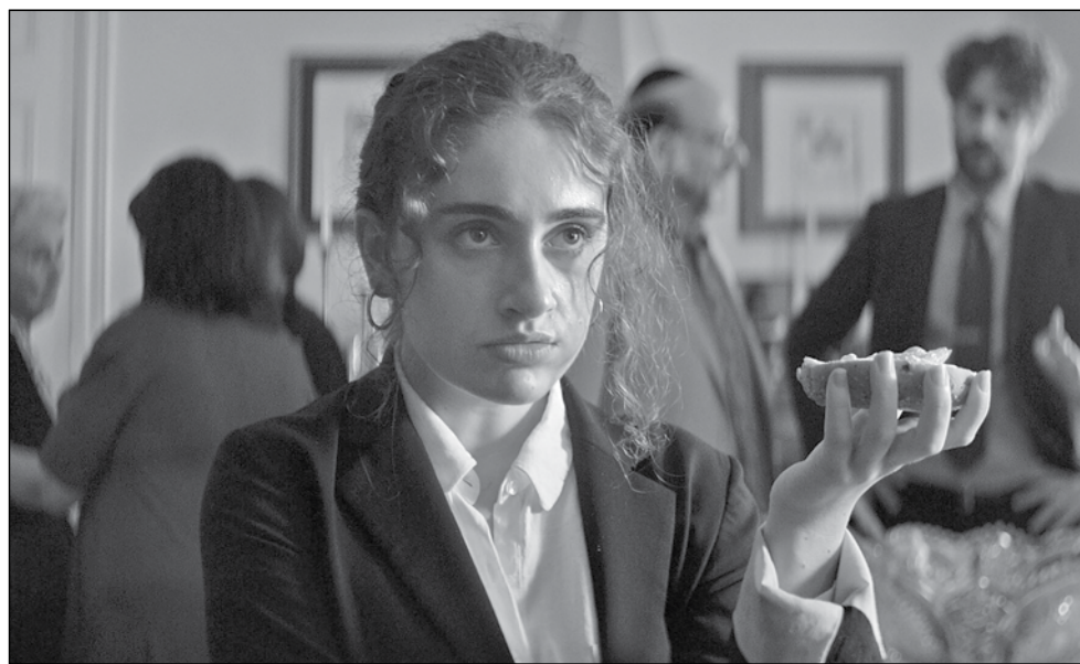
Rachel Sennott in ‘Shiva Baby.’ Now streaming on Max and Apple TV+.