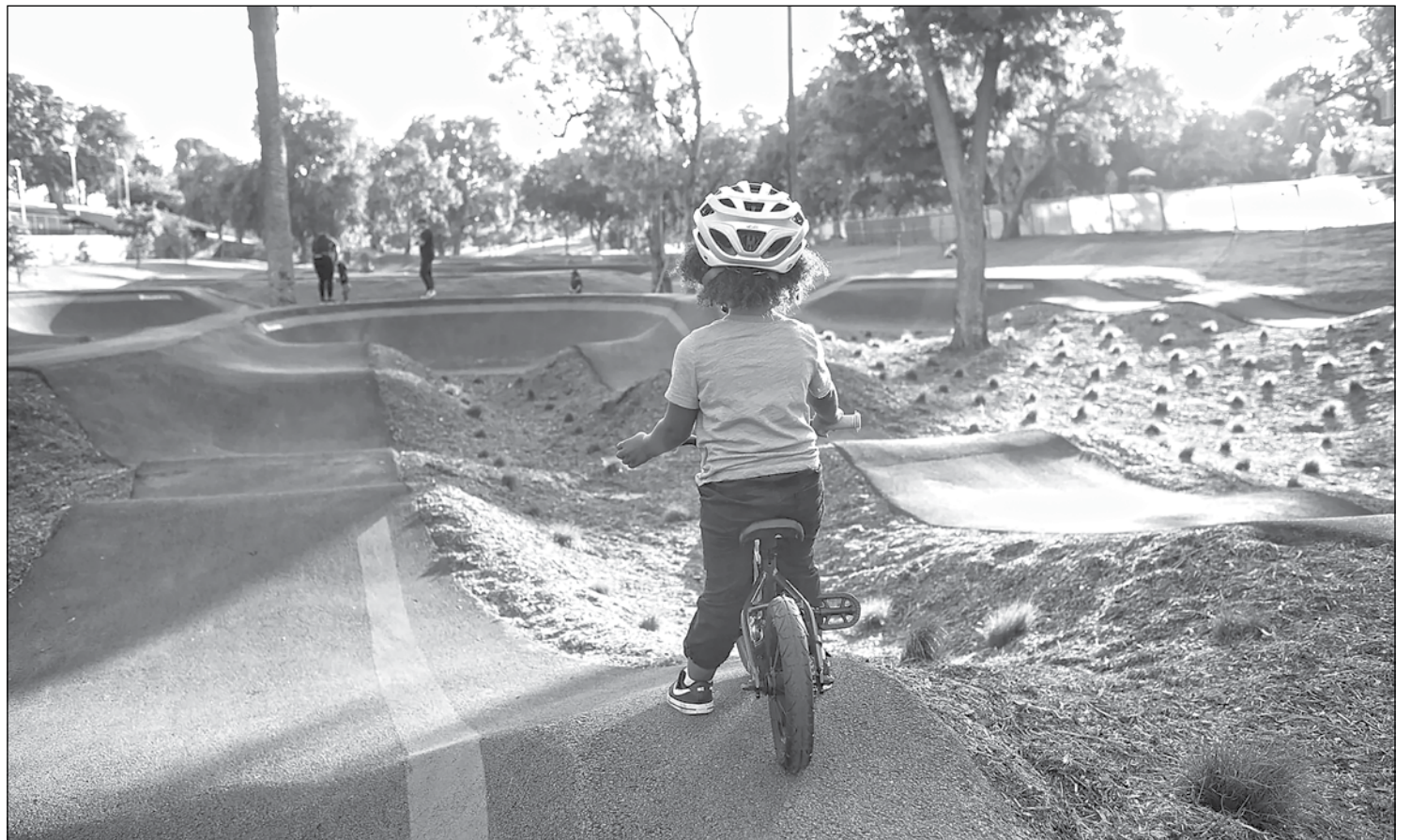
The City of Inglewood is thrilled to announce the grand opening of the Inglewood Pumptrack at Edward Vincent Park. Join Inglewood's Mayor and City Council Members for an adrenaline-pumping celebration on Sunday, September 24, 2023, starting at 11:00 am. Sponsored by Grow Cycling Foundation, the pumptrack caters to all levels of riders, from beginners to experts. Expect a day filled with bike demonstrations, fantastic giveaways and tasty refreshments.