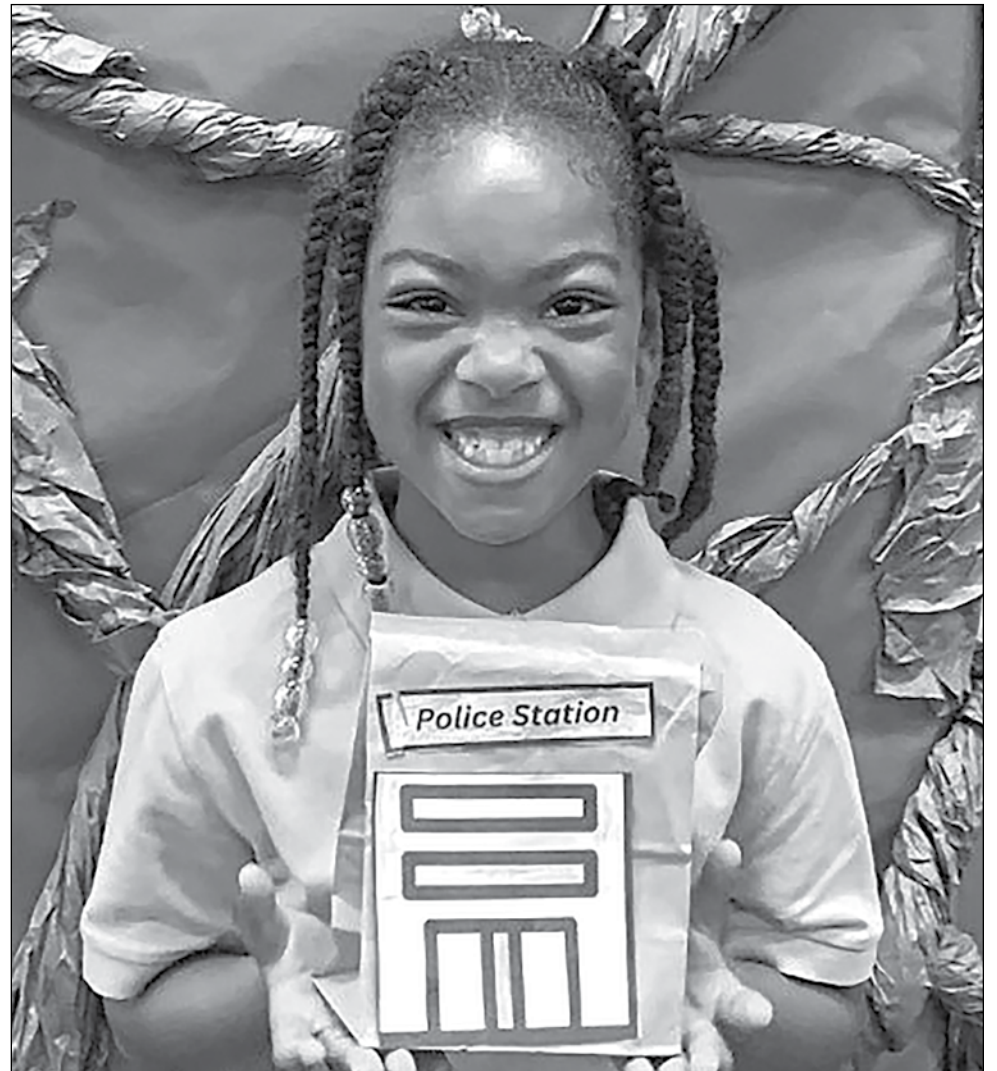
It was an exciting morning at the Main Library. Thirty-eight students joined us for story time and crafts related to what they are learning in school. Our young readers also received library cards and chose books to take home.