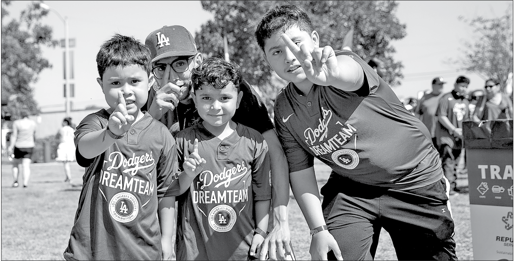
The City of Hawthorne in collaboration with Los Angeles Dodgers Foundation held Dodger Day at Holly Park. This resource event helped participants and families receive access to health screenings, education programs and more. It was a fun filled, hot summer day with many who came out to enjoy these great resources available to them.