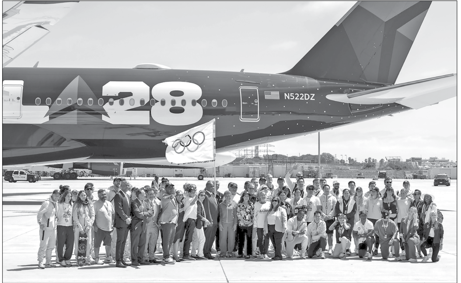
Inglewood Mayor James T. Butts welcomed Los Angeles Mayor, Karen Bass and Team USA Olympians back from their incredible run in Paris for the Olympic Games Paris 2024. Following the Closing Ceremony of the Olympic Games, Delta carried the Olympic Flag from Paris to Los Angeles on its custom LA28 livery for the official Olympic Flag Flight – signifying the Games’ return to the United States in 2028. Inglewood will host the opening and closing ceremonies, swimming, and basketball in 2028.