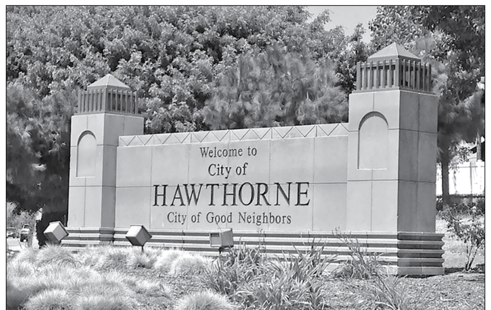
The City of Good Neighbors.