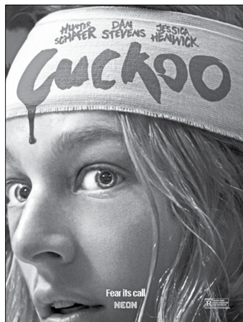
Poster Courtesy of NEON.

1h 42m. Rated R for violence, bloody images, language and brief teen drug use. •