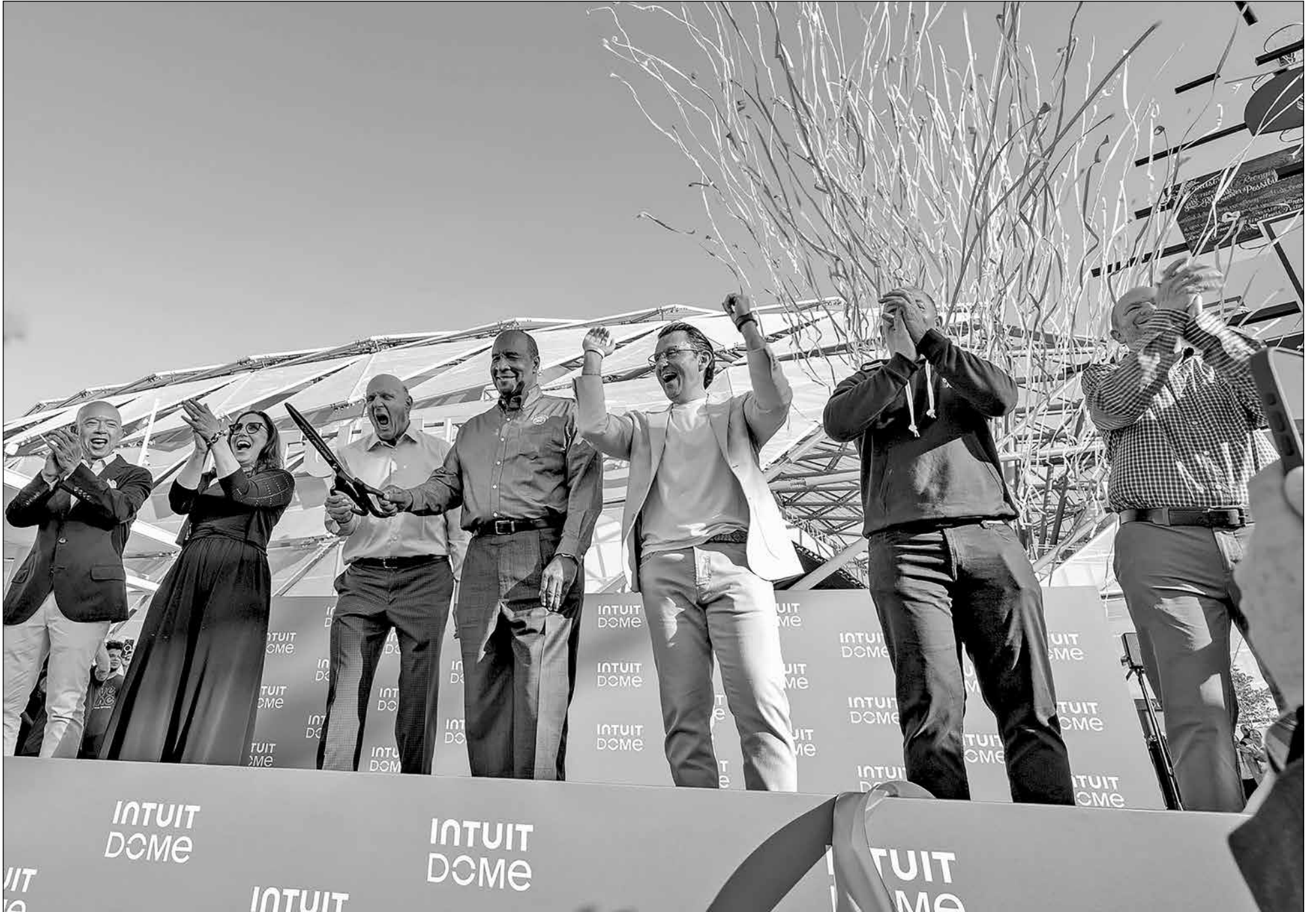
What sat as a vacant lot on the corner of Century and Prairie, is now the home of the Los Angeles Clippers. The Intuit Dome is officially open.