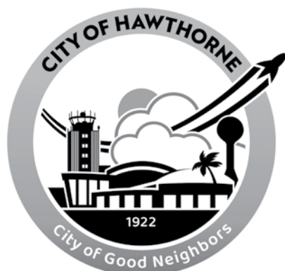
Hawthorne's Logo. Courtesy City of Hawthorne.