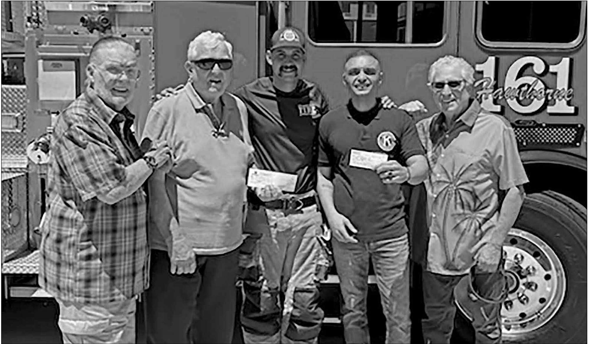
The generous donation helped to pay for a sauna which assists in maintaining health (fire fighters absorb a lot of toxins in their work). Thank you to the Kiwanis Club for their continued support of our community.