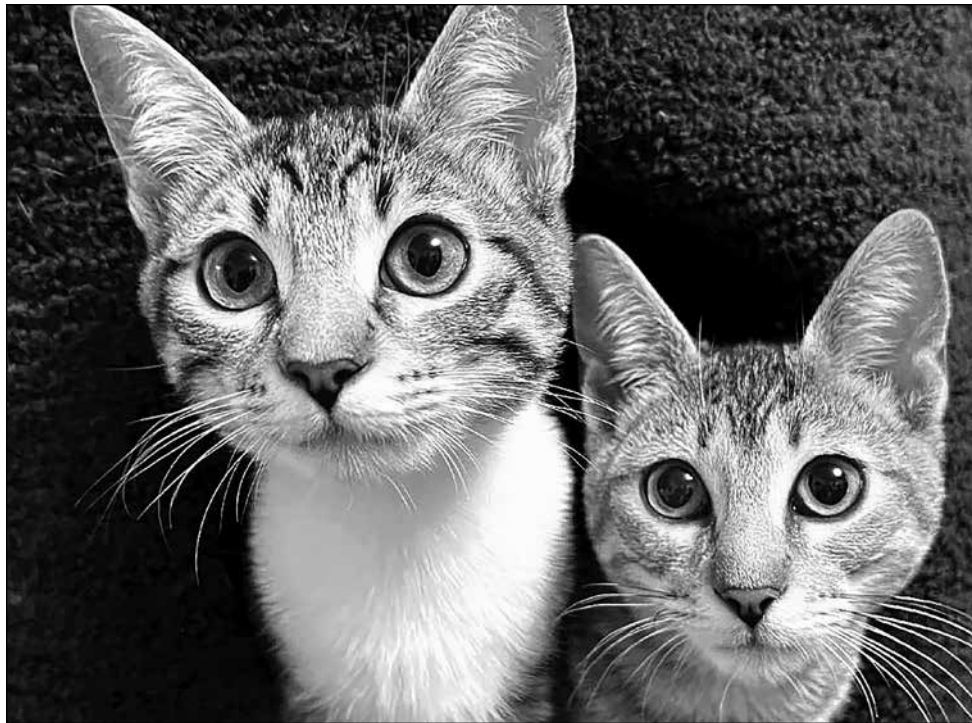
Angel and Mermaid

upbeat and always prepared to leap for a toy or curl up into any waiting lap. Angel and Mermaid are very vocal and enjoy saying hello and letting people know they would like attention and treats. Both Angel and Mermaid are very social and do not mind mixing with other cats. These two may be a touch reserved when meeting new friends for the first time particularly Mermaid. But within a few days these girls will be romping and tussling with any cat that wants to play.