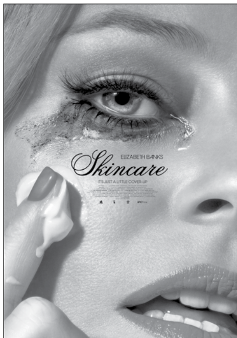
Skincare , courtesy IFC Films.