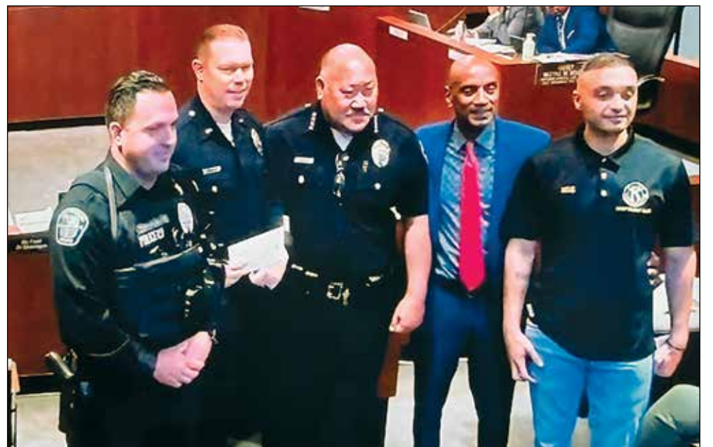
Honoring the K9 Unit.