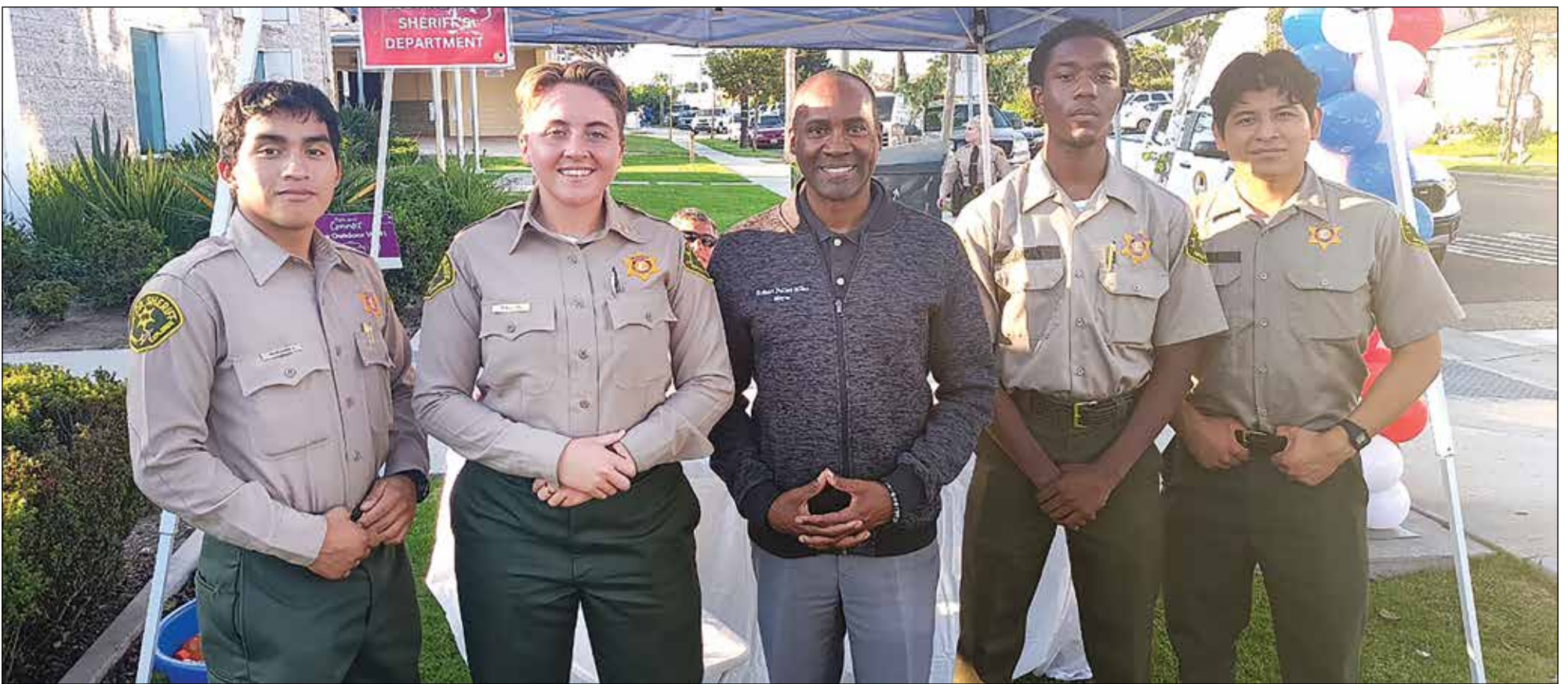
The City of Lawndale hosted the National Night Out on August 6 at the City Civic Center. It was an evening filled with community members and organizations. Fun was had by all.