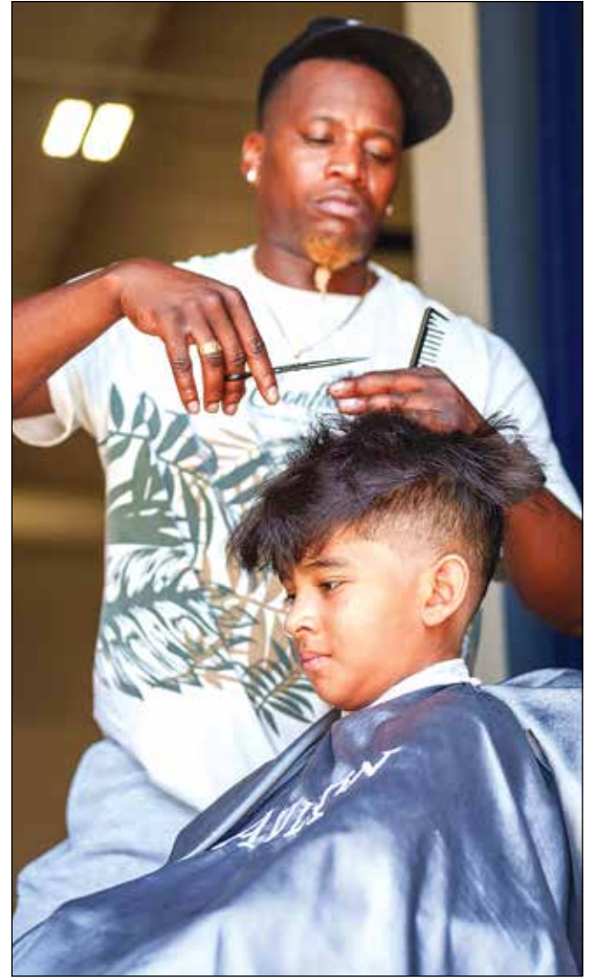
Our youth enjoyed a day full of fun and essentials, with free haircuts and hairstyling, new backpacks, enrollment opportunities, community resources, and an amazing performance by D Smoke and guests. A huge thank you to our partners Taste of Inglewood, It's Bigger Than Us, and Perfectly Puzzled, for helping make this event a success. Together, we're setting our students up for a fantastic school year.