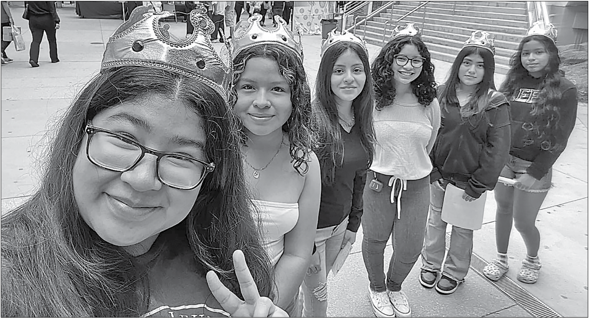
Big shoutout to our Link Crew for hosting freshmen campus tours, our PTSO for your connection with our Cardinal families, and the rest of the Cardinal team.