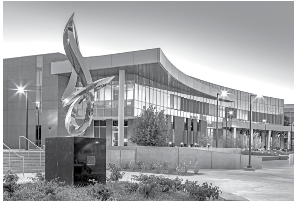
El Camino College's Administration Building.

As stated above, the South Bay is a choice area in which to reside. El Camino Community College is one of the reasons. Indeed, El Camino has a lot to be proud of, not the least of which is its students. •