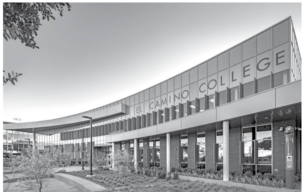
El Camino College's Administration Building