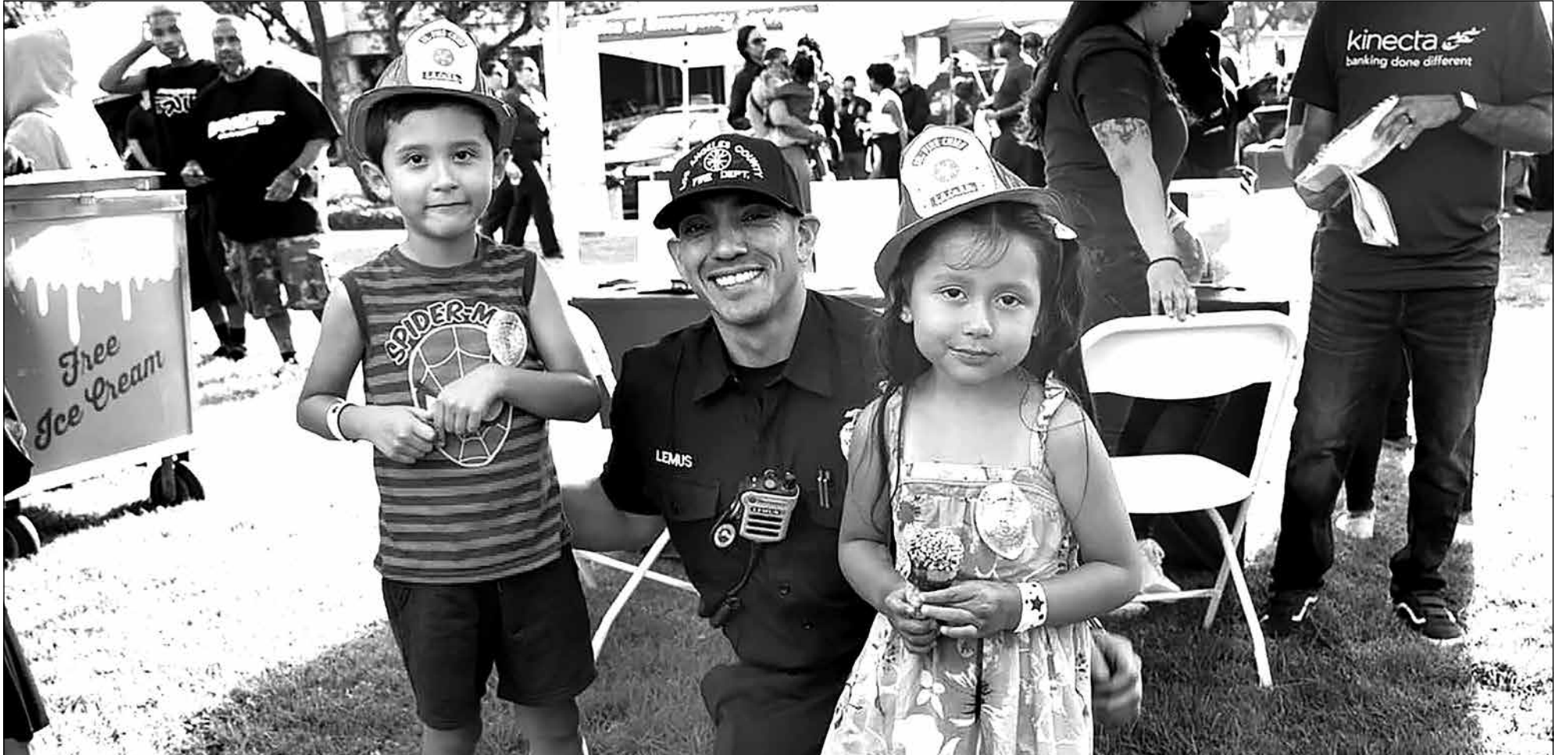
Firefighters from FS 171, and across LA County, joined their fellow public safety officers to celebrate safety and teamwork with the wonderful community members we proudly serve.