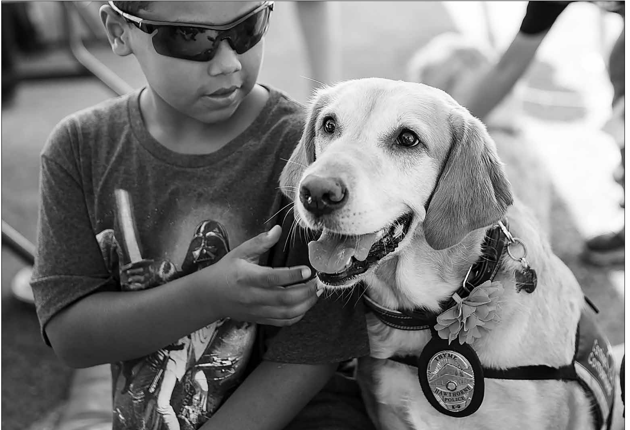
Families and friends came to spend a fun evening out with our own Hawthorne Police. Food was served, fun was had, and we cant wait till this event returns next year.