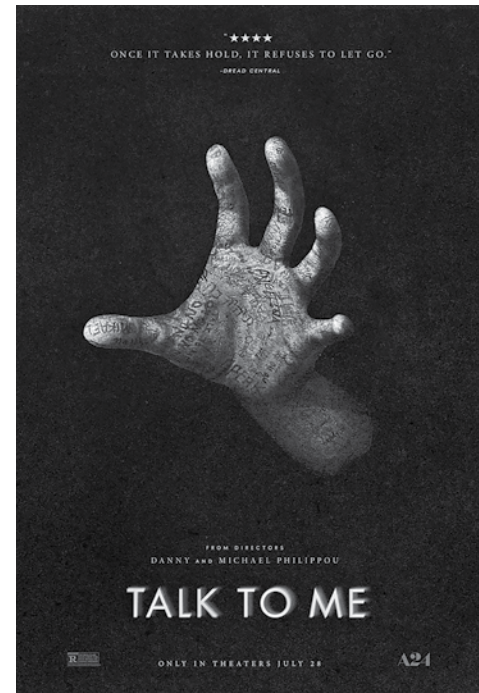
Talk To Me