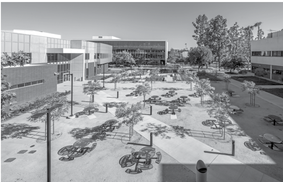
Administration Building Quad.