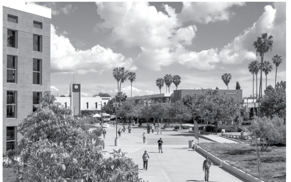
Student Services Plaza.