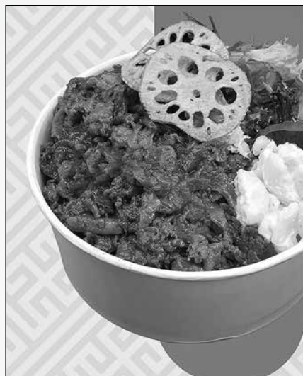
Rice Cups' Gochujang Pork Bowl.

soy sauce glaze topped with caramelized onions. The Chicken Jjimdak is made of sweet soy braised thigh meat topped with caramelized onions, which can also be made