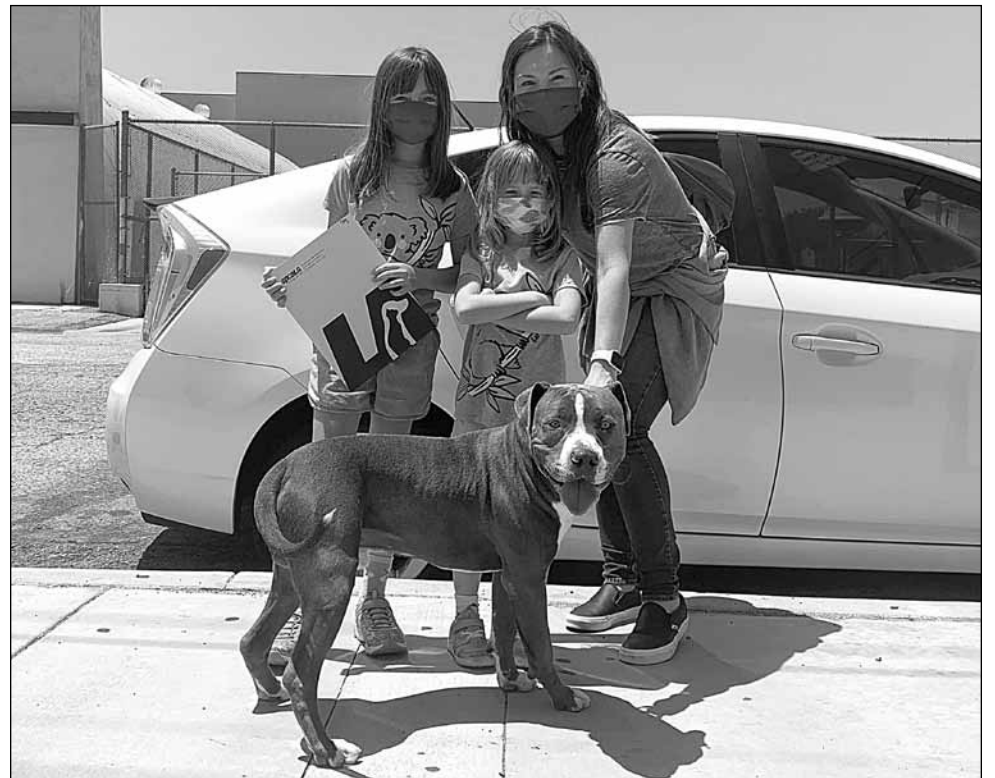
Congratulations to Gabriel and his new family.

for one day before finding his forever family! He was adopted by a family with two young daughters, both whom took to him right away. Lucky for Gabriel, one of his new sisters is an aspiring dog trainer. Looks like the sky is the limit for this pooch!