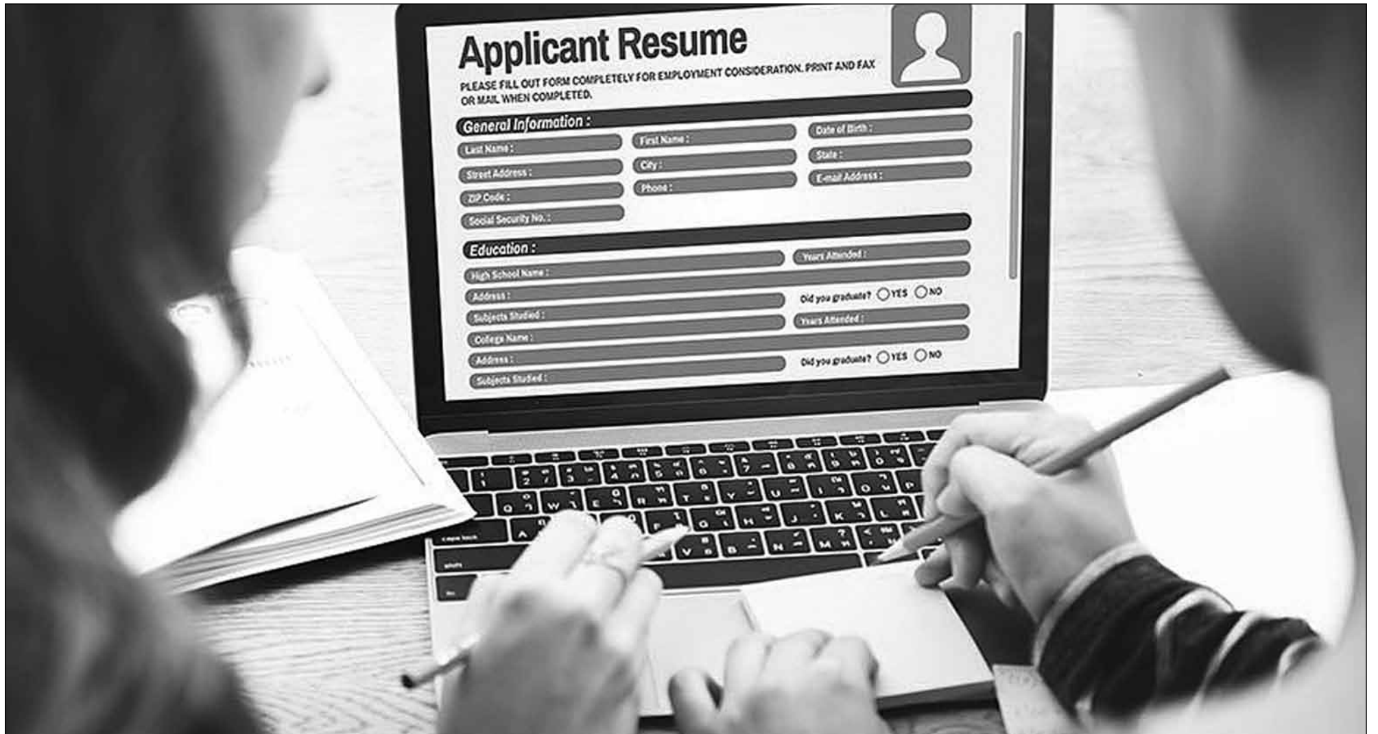
Looking for work and need help writing and formatting your resume? The Inglewood Public Library is offering resume writing assistance to members of the community on Tuesday's from 2-3pm. For more information, please visit: www.cityofinglewood.org/1409/Virtual-Events .

"Purposefully dedicating time into developing yourself is one of the keys to being effective in life."