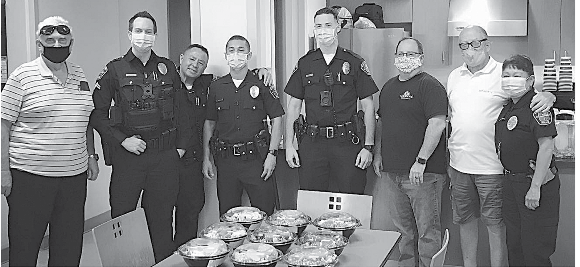
The Hawthorne Police Department couldn't be more grateful for the Hawthorne Farmers Insurance's act of kindness. They donated over 40 boxed lunches from Panera. Also, thank you to the Hawthorne Kiwanis Club for stopping by to deliver the food.