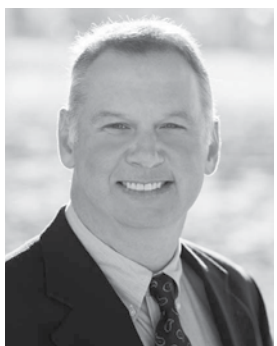
20-year El Segundo Home Owner