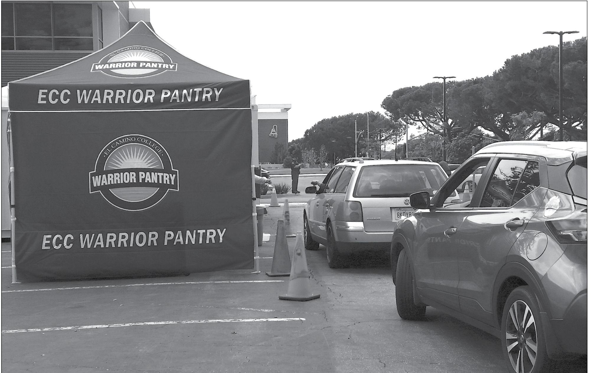
The Warrior Pantry is open. Due to the COVID-19, the Warrior Pantry has made some changes to protect both students and staff, while still being able to utilize the Warrior Pantry in a safe way. Drive-thru service is available on Tuesdays and Thursdays from 11 a.m.-2 p.m. Pre-packaged bags filled with food items and toiletries are available to students enrolled in either Summer and/or Fall 2020.