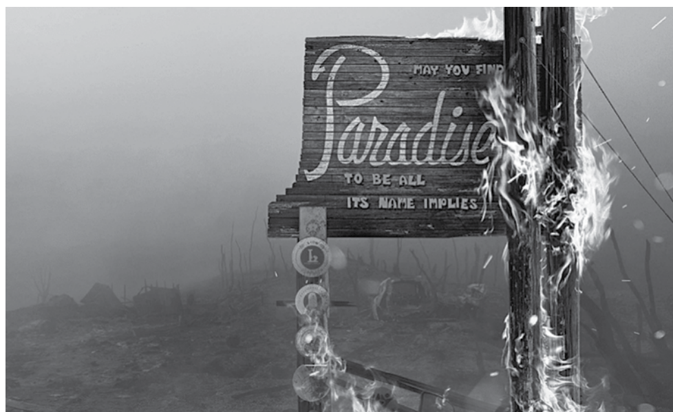
In Rebuilding Paradise , courtesy of National Geographic.

are heart-wrenching and empathetic. Watching them, we are reminded that disasters don't discriminate. The film's release in 2020 is, perhaps, not ideal, as we're still in the middle of the global pandemic. However, the silver lining we can take away is the steadfast resilience and strength from Paradise residents, which is proof that we can overcome anything when we look out for and help each other.