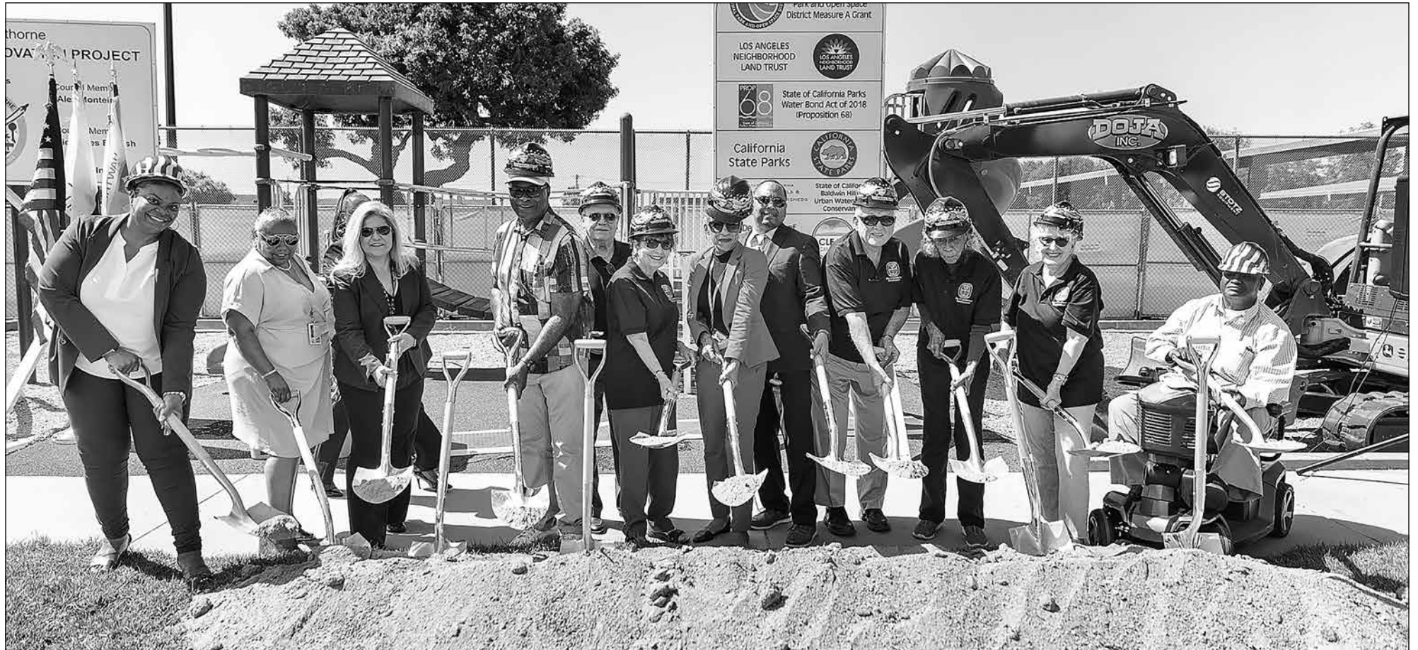
The City of Hawthorne and its Community Services Department had the pleasure of hosting a groundbreaking event for the Zela Davis Park Renovation Project. Hawthorne has received generous funding from several esteemed sources, including: Proposition 68, California State Parks, Clean California, Los Angeles County Regional Park and Open Space District and State of California Baldwin Hills Urban Watersheds Conservancy. Their support underscores the importance of the City's mission to enhance and revitalize our community parks for the benefit of all residents. Thank you for all your generous funding.