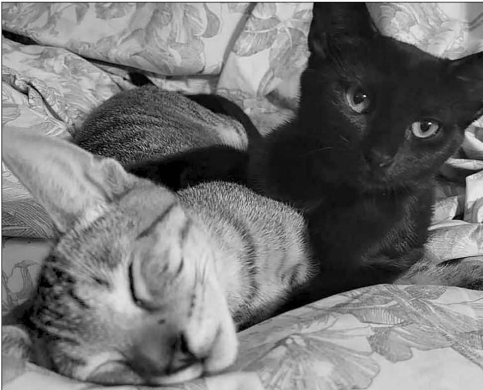
Arthur and Buster

Kitten Rescue rescues cats and kittens from a variety of situations. Most live in our volunteers' homes and those volunteers foster them until we can find permanent homes for them. Young or old, tabby or Siamese, we care for orphaned and abandoned kittens that need to be bottle-fed around the clock, moms with litters, cats that need socialization, and sick or injured animals. When they are finally ready for their forever home, we will help match you with the purr-fect one. When you adopt, you save a life... and in turn enrich your own.