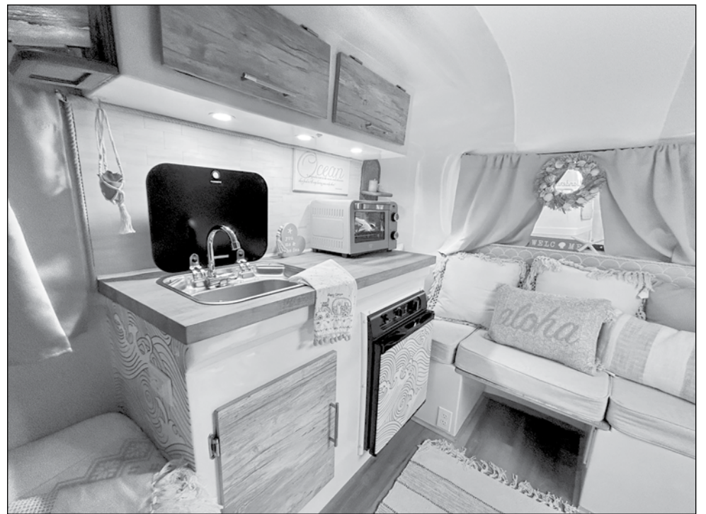
A Peak Inside.