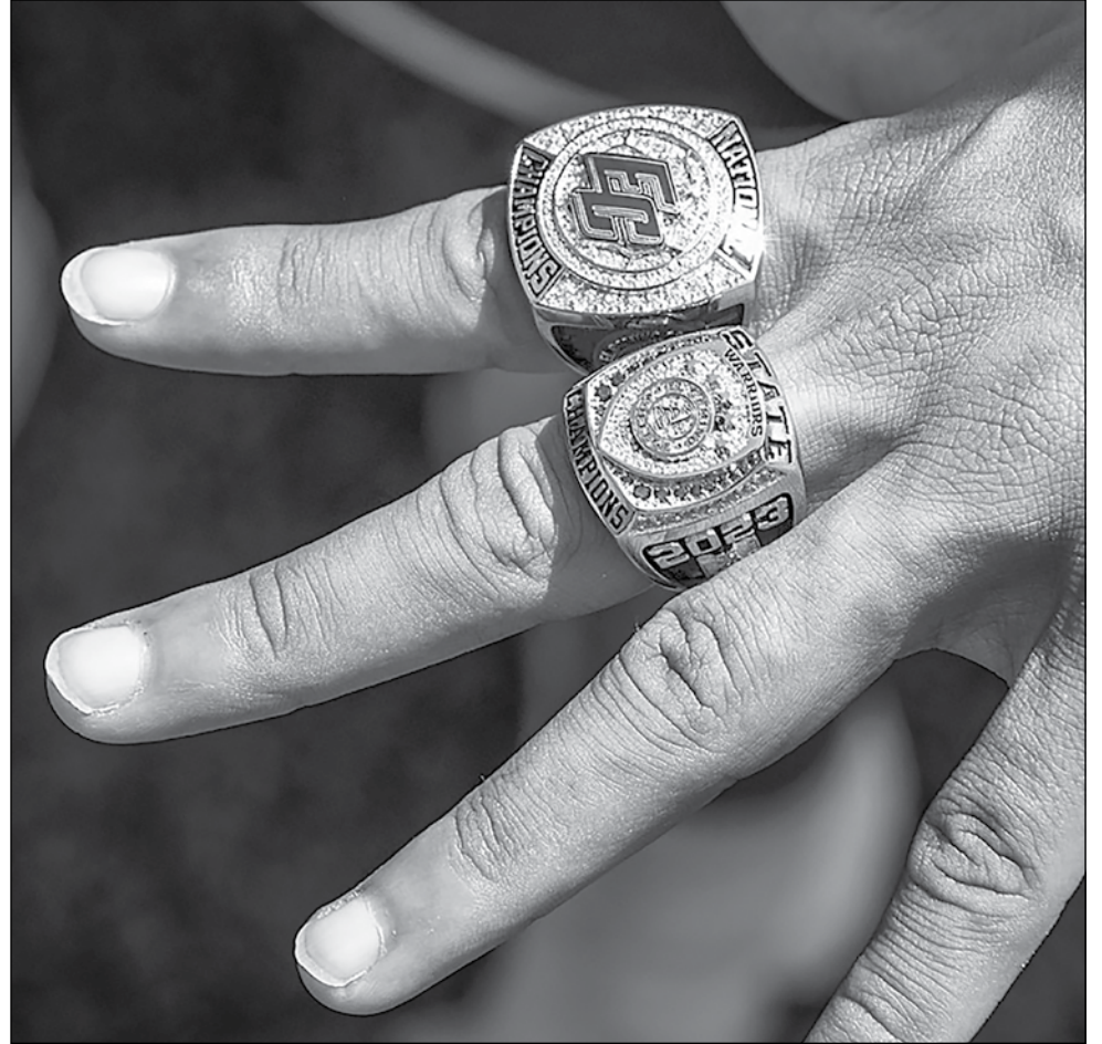
The ECC Men's Soccer Team was presented their 2023 state and national championship rings. We're proud of our scholar athletes and all they have accomplished. Go Warriors.