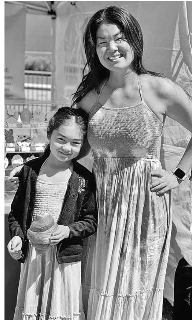
Every Saturday Inglewood becomes a hub of local and world-wide cuisine. The Farmers' Market brings together people, cultures, and flavors all while using local produce.