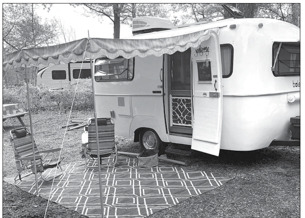
Wanderlust Traile.