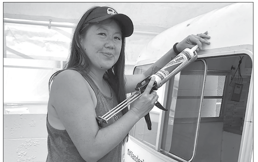
Rita at Work.