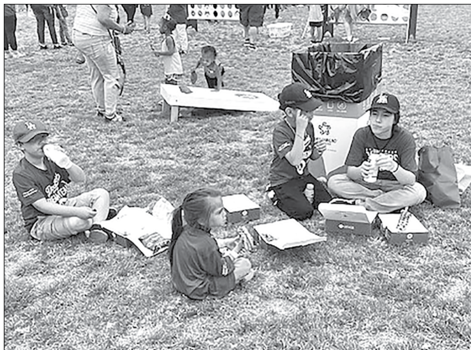
Kids, Dodger Day