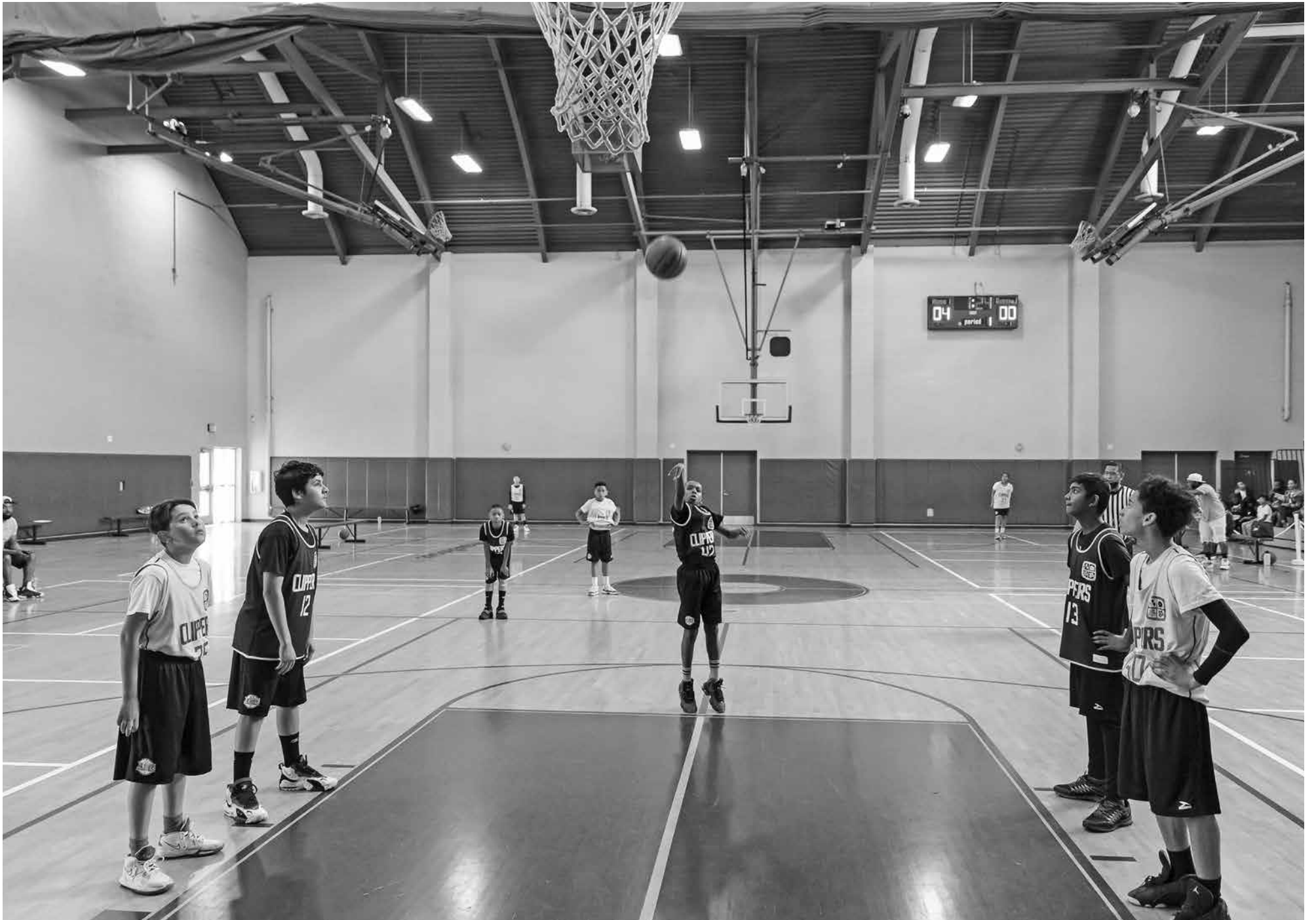
Hawthorne Youth Basketball League. To read more about the City of Hawthorne's Summer Programming, see story below.