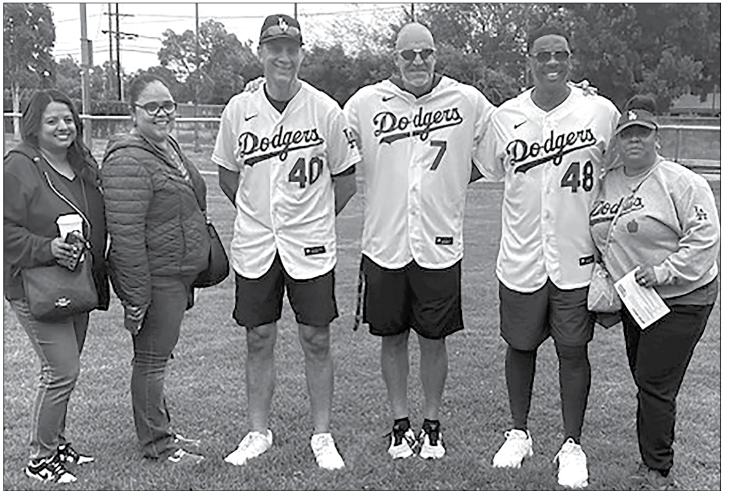
Dodgers and fans come together at Holly Park. To read more about the Dodger Foundation, see story below.