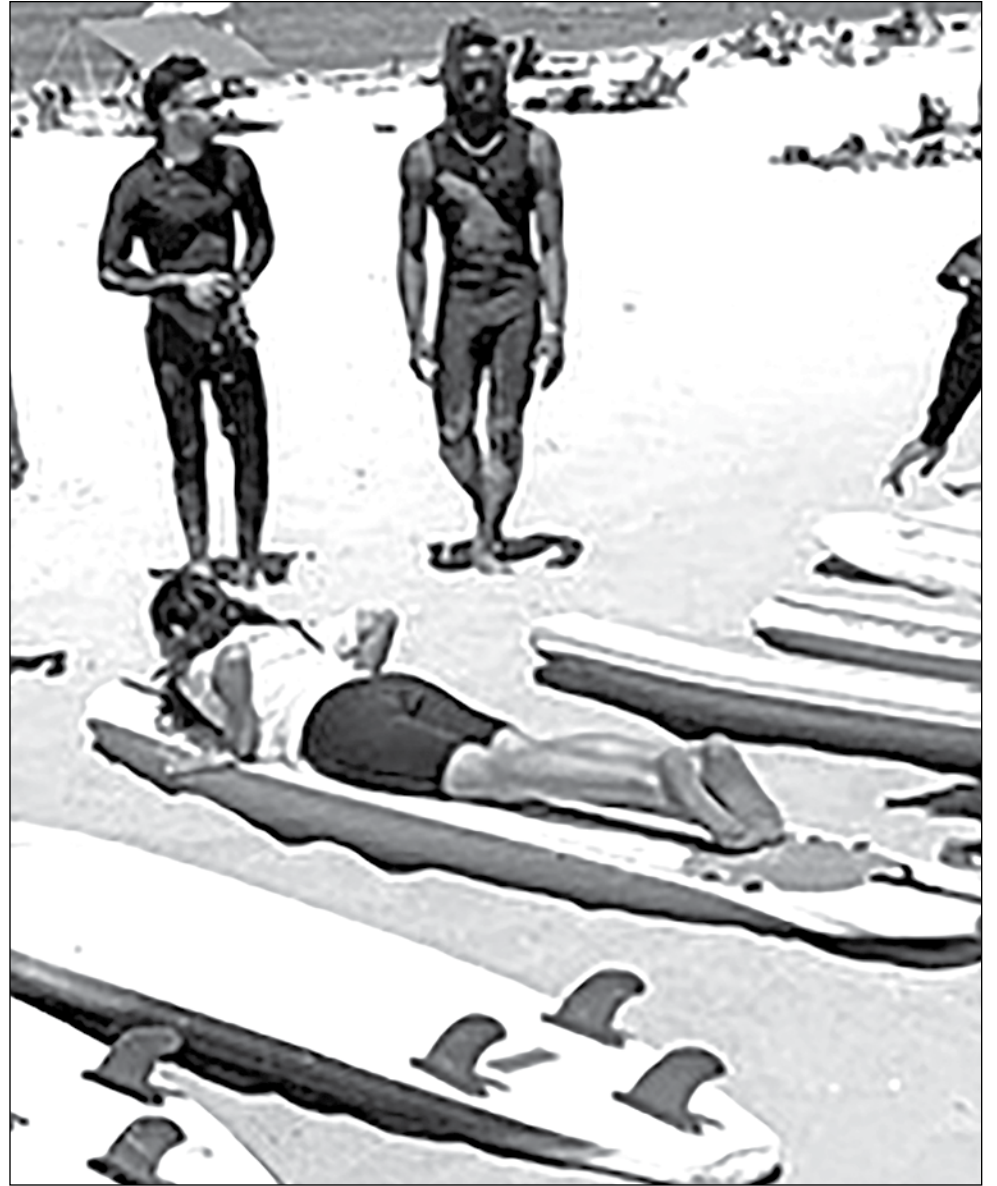
As part of the new Camp ECMS program, participating students from the two middle schools have the opportunity to experience surfing, ocean literacy, and all the beach has to offer every Friday.