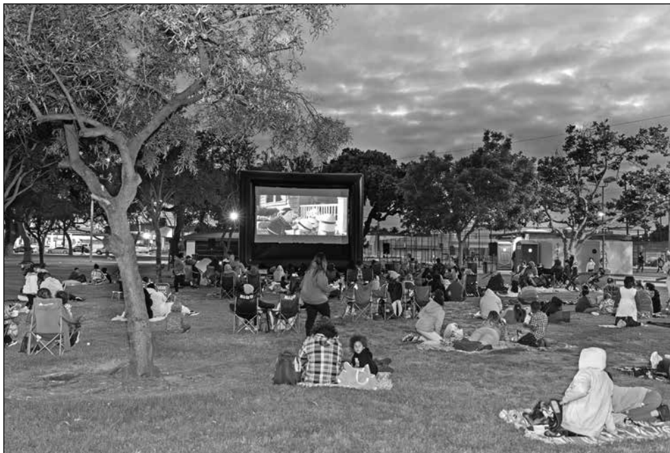
Movies in the Park

For more information on the City of Hawthorne's summer programming and to view the complete schedule of activities, please visit https://www.cityofhawthorne.org/departments/community-services .