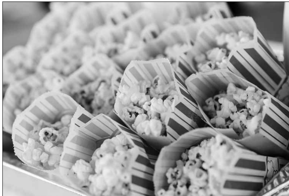
Popcorn at Movies in the Park

“Parks represent an efficient, cost-effective way to improve public health.”