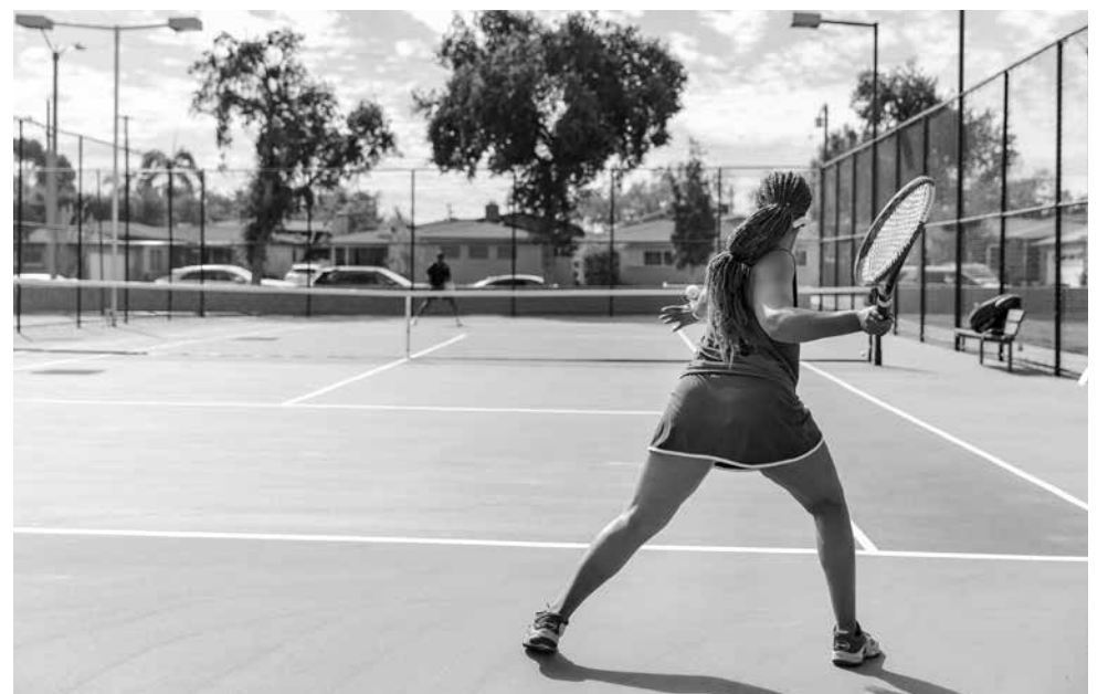
Hawthorne Community Members Play Tennis