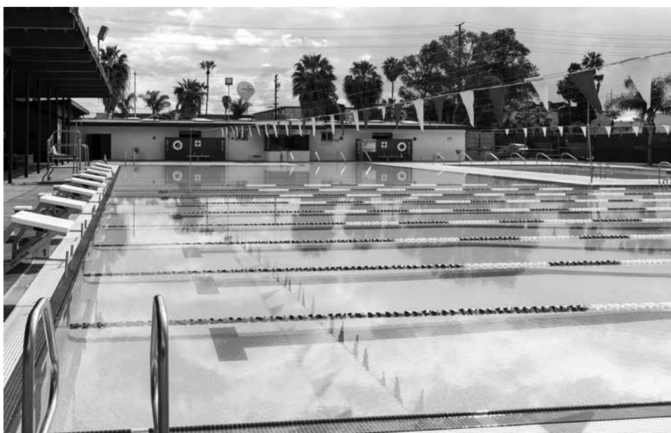
Looking to beat the heat?

Calling all sports enthusiasts! Hawthorne is proud to present a variety of sports clinics and camps designed to enhance skills and foster See Summer Programming, page 7