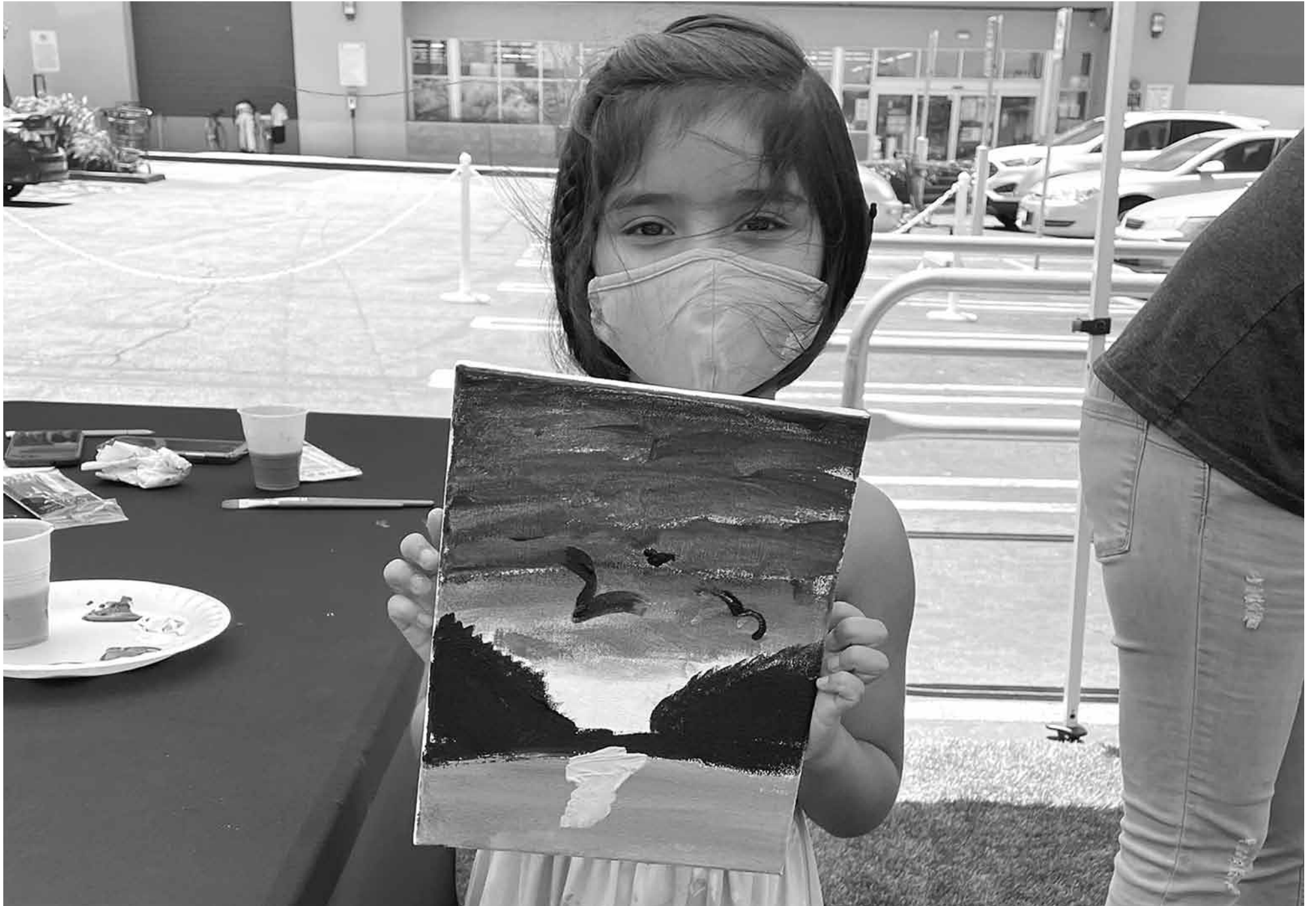
Kids Fun Zone offers art activities to explore new ways of self-expression for kids. This in-person event will be providing individual supplies to all registered kids. By registering for your time slot, we ask that you please attend at the specific time in which you registered and please be on-time. This event is FREE to the public, but you must register to attend. Crafts always by Artsy Kidds. For more information go to: www.crenshawimperialplaza.com/kids-fun-zone .