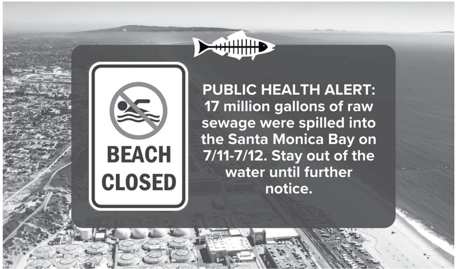
Dockweiler State Beach and El Segundo Beach are closed to the public. It is recommended staying out of the water. You can check the status of beach closures and conditions on LA County's recorded information hotline, available 24 hours a day, at 1-800-525-5662. Information about beach closures and conditions is also available online at: PublicHealth.LACounty.gov/Beach.