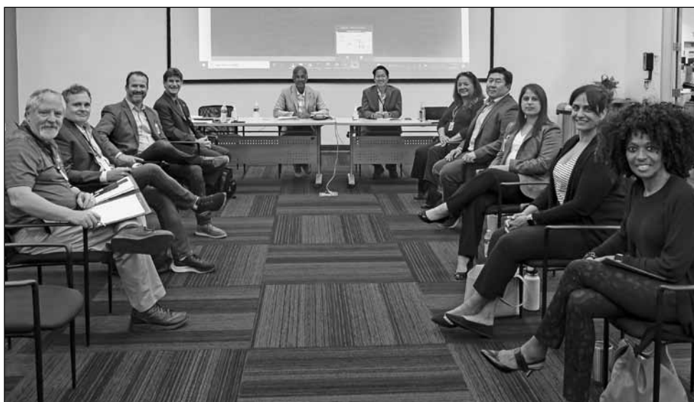
Members of the El Segundo Economic Development Corporation Board of Directors at a recent meeting to launch the new organization.