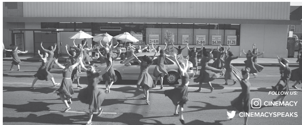
Summertime , courtesy of Good Deed Entertainment.