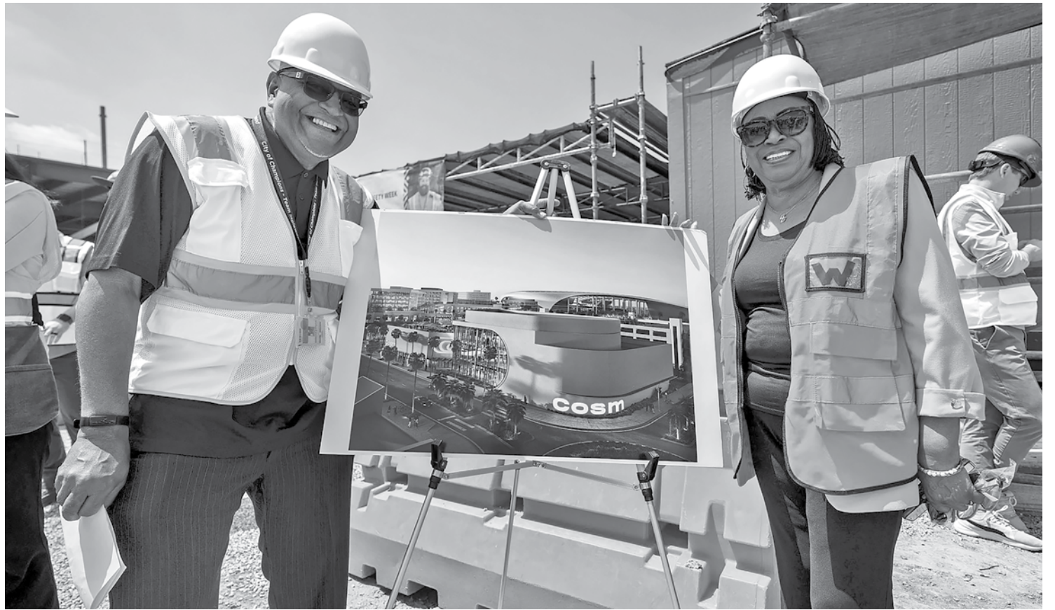
A global leader in experiential media and immersive technology, COSM recently celebrated their development milestone with a traditional “topping off” ceremony, where the last or tallest beam is placed on a project. The Hollywood Park location will be the first venue of its kind to bring entertainment to life by utilizing Cosm’s revolutionary domed and compound curved LED technology. Guests will be able to directly experience immersive content through the company’s proprietary, best-in-class technology that seamlessly bridges the gap between virtual and physical realities. The 65,000-square-foot venue will be able to hold up to 1,700 people and is scheduled to open in 2024.