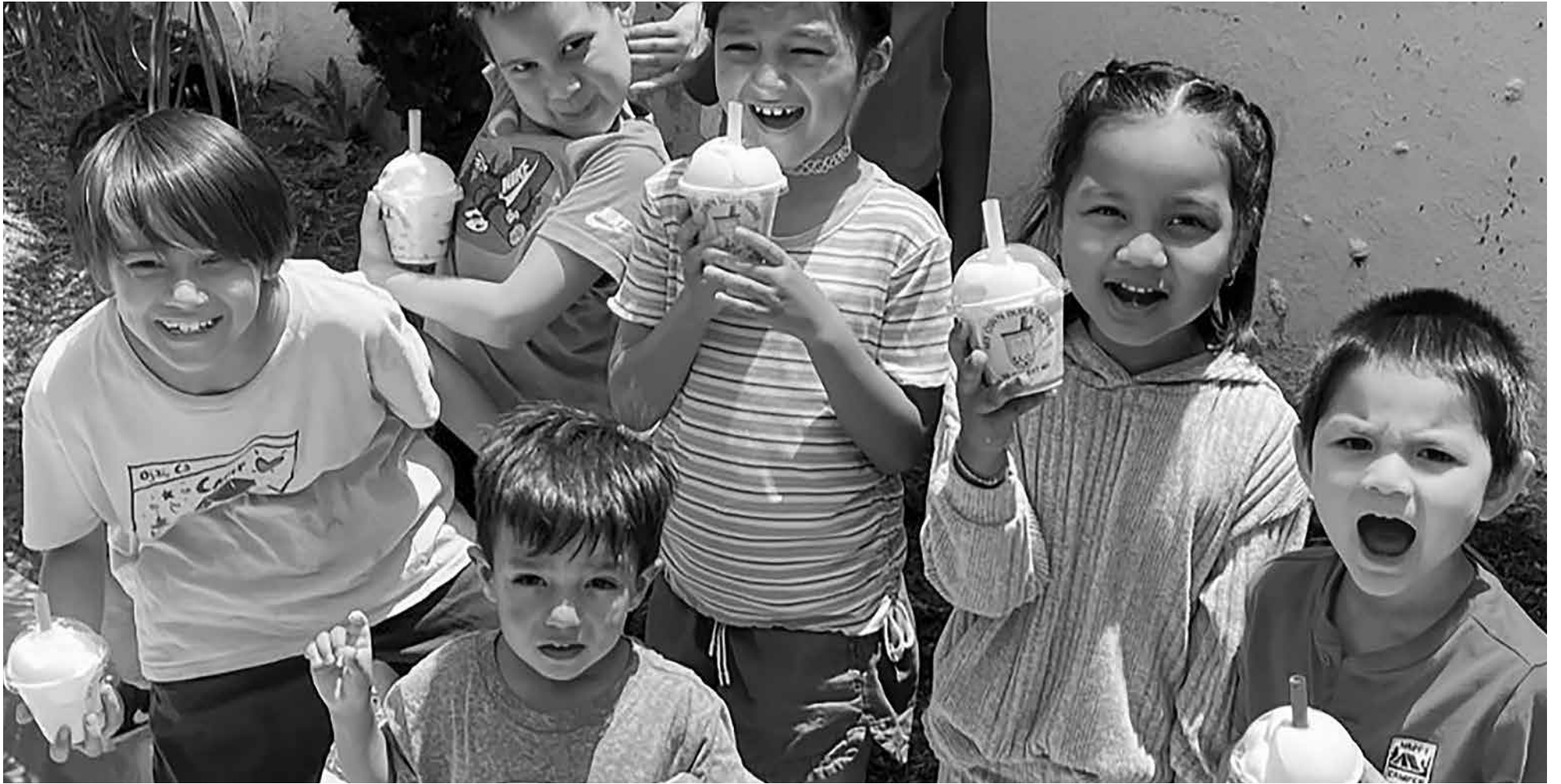
Over 150 patrons joined us at both libraries to make their own Boba-themed slime! The kids were amazed to see their creations come to life. Some almost looked good enough to eat. Sign up for the Summer Reading Program & enjoy all the summer fun through 7/22.

“Everything good, everything magical happens between the months of June and August.”