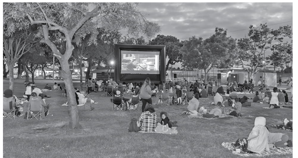
Movies in the Park