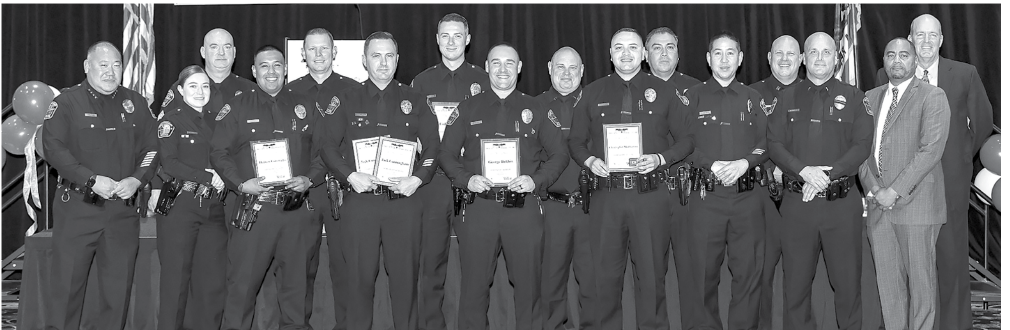
Life Saving Awards