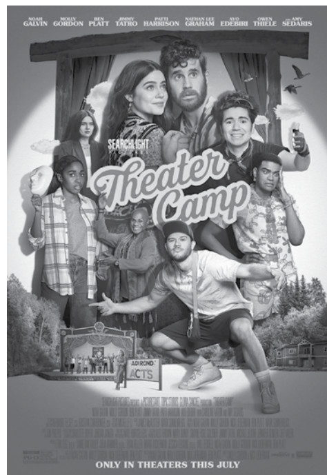
Theater Camp , courtesy Cinemacy.com.

1h 34m. 'Theater Camp' starts playing in select cities Friday, July 14.