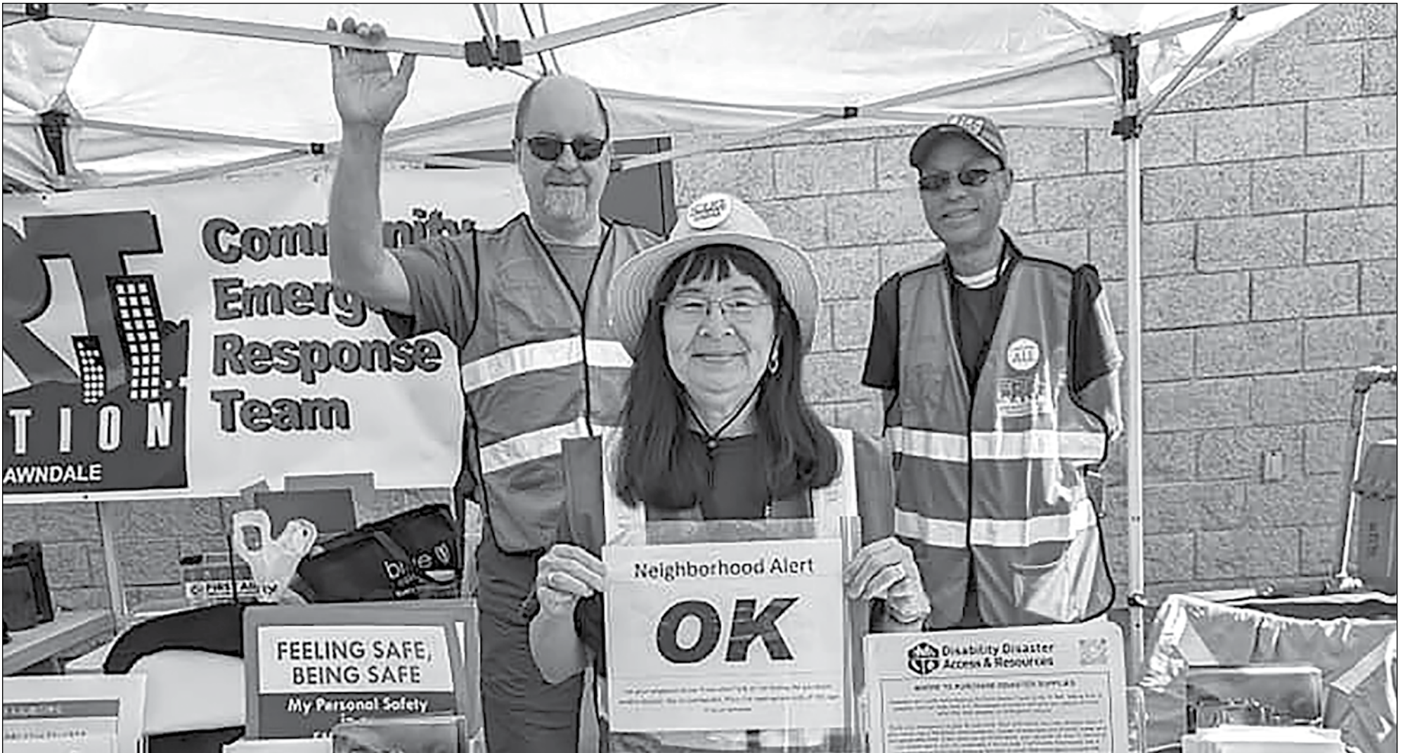
Tri City CERT is an all volunteer organization from the cities of Gardena, Hawthorne & Lawndale. Our primary goal is to teach disaster preparedness, refresh CERT skills and ultimately help our family, neighbors & our community in a time of disaster. This is an open group so anyone can join. We have meetings every even month and your are welcomed to join us.