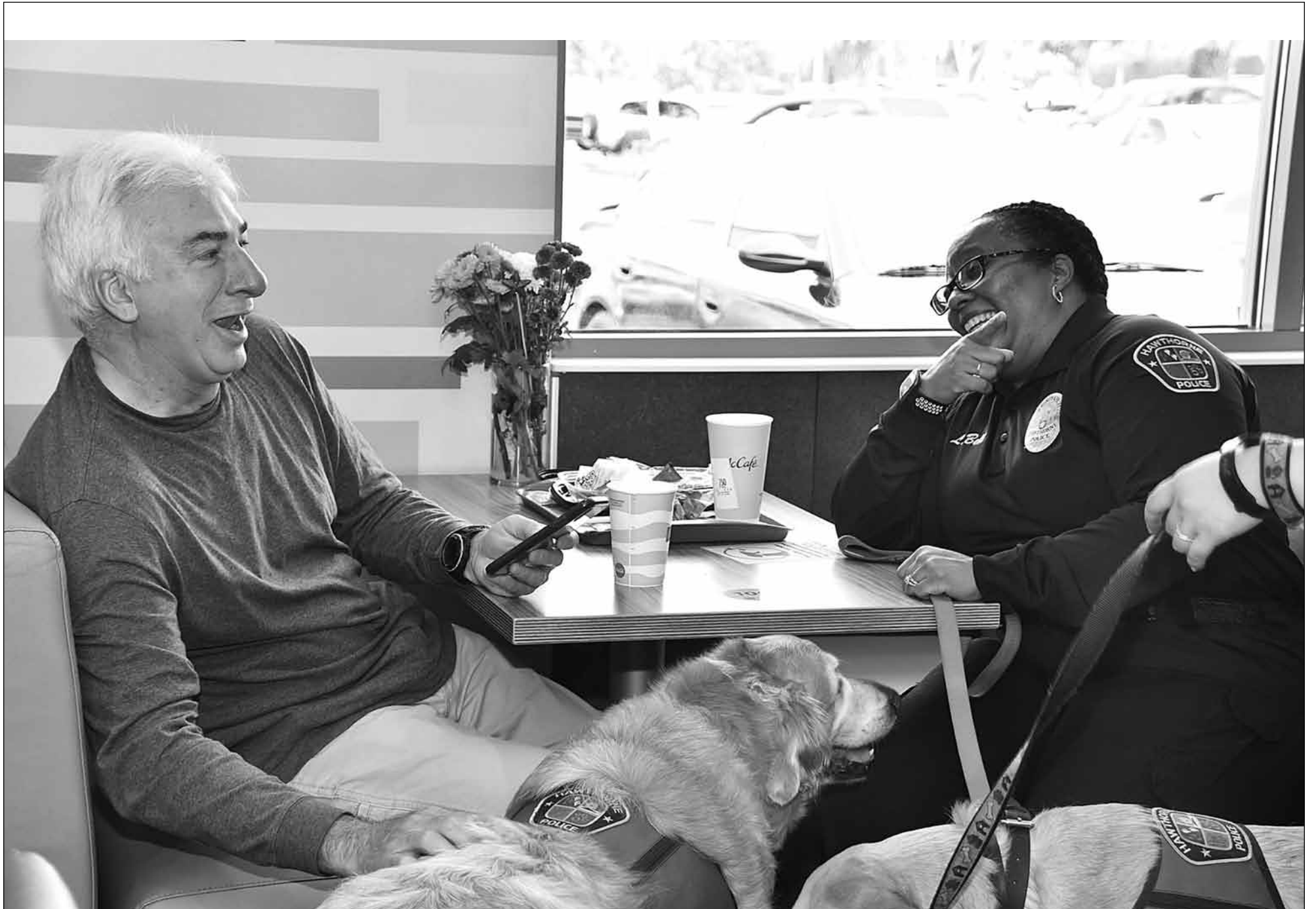
The Hawthorne Police Department had a great time at Coffee With A Cop meeting our neighbors. If you missed us this time, we will be out again next month. Join your neighbors and police officers for coffee and a conversation.