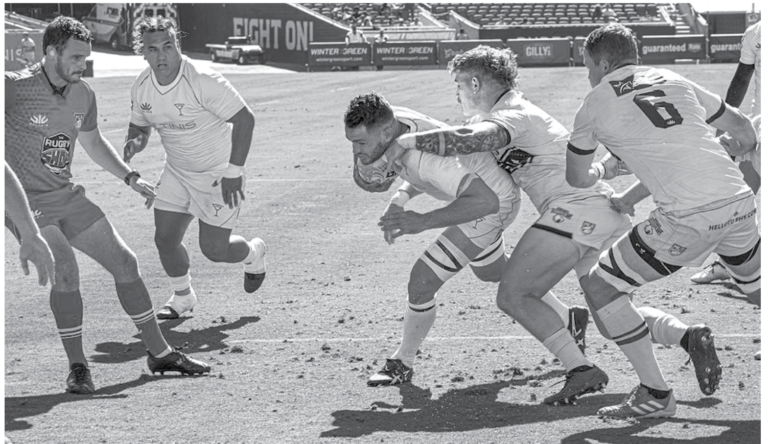
DTH in Action versus San Diego Legion. To read more about the Giltinis and DTH, see story below.