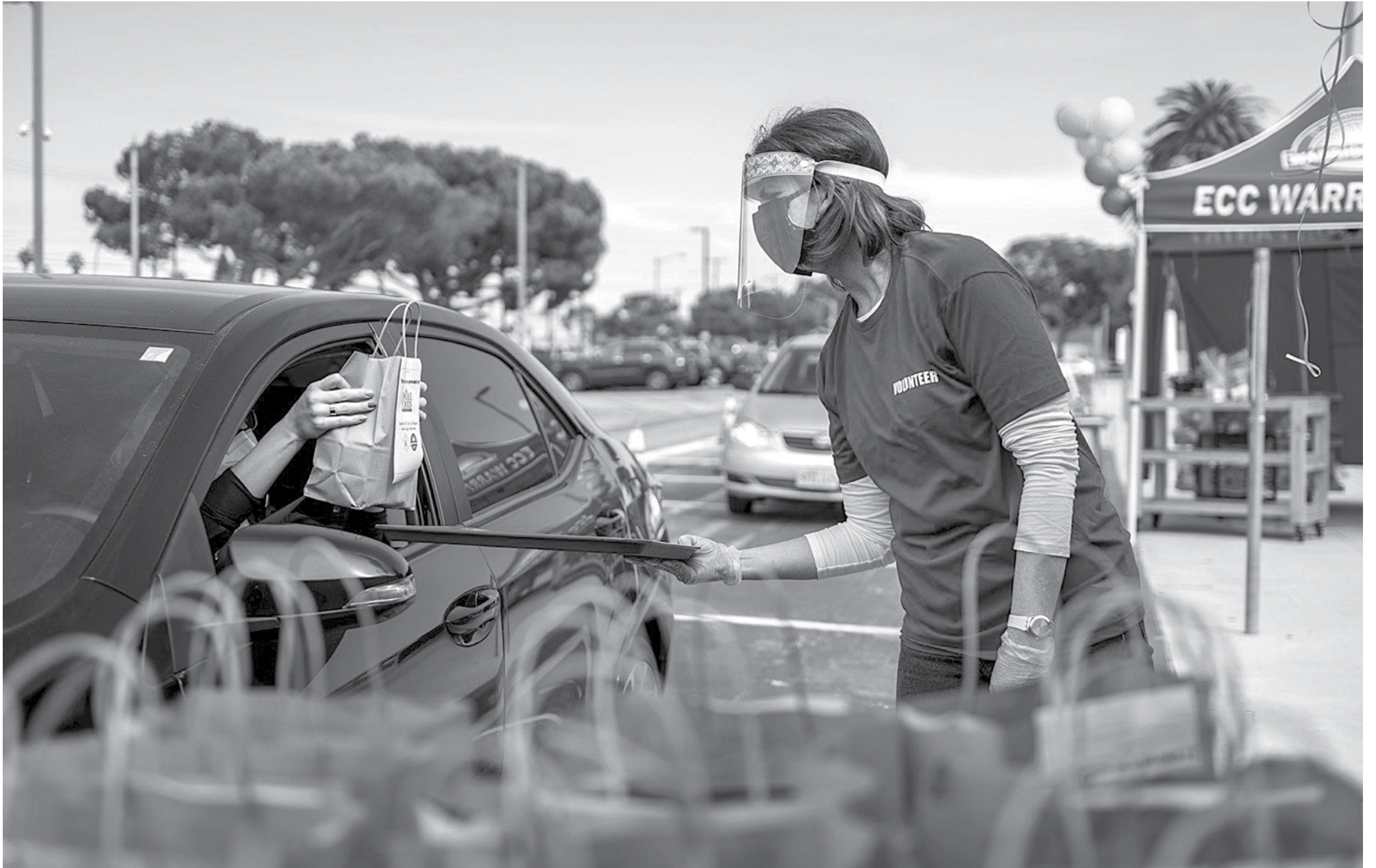
Students enrolled in summer or fall semesters are eligible to receive services. Food and toiletries packages are available via drive-thru or walk-up Tuesdays and Thursdays in Lot B between 11 a.m.-2 p.m. For more info, visit www.elcamino.edu/warriorpantry .