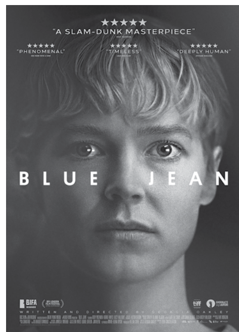
Blue Jean , courtesy Magnolia Pictures.