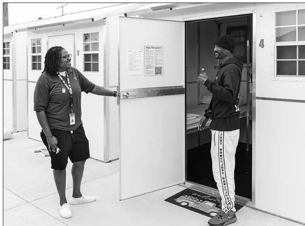
A new resident is welcomed in to Bridge of Hope housing.