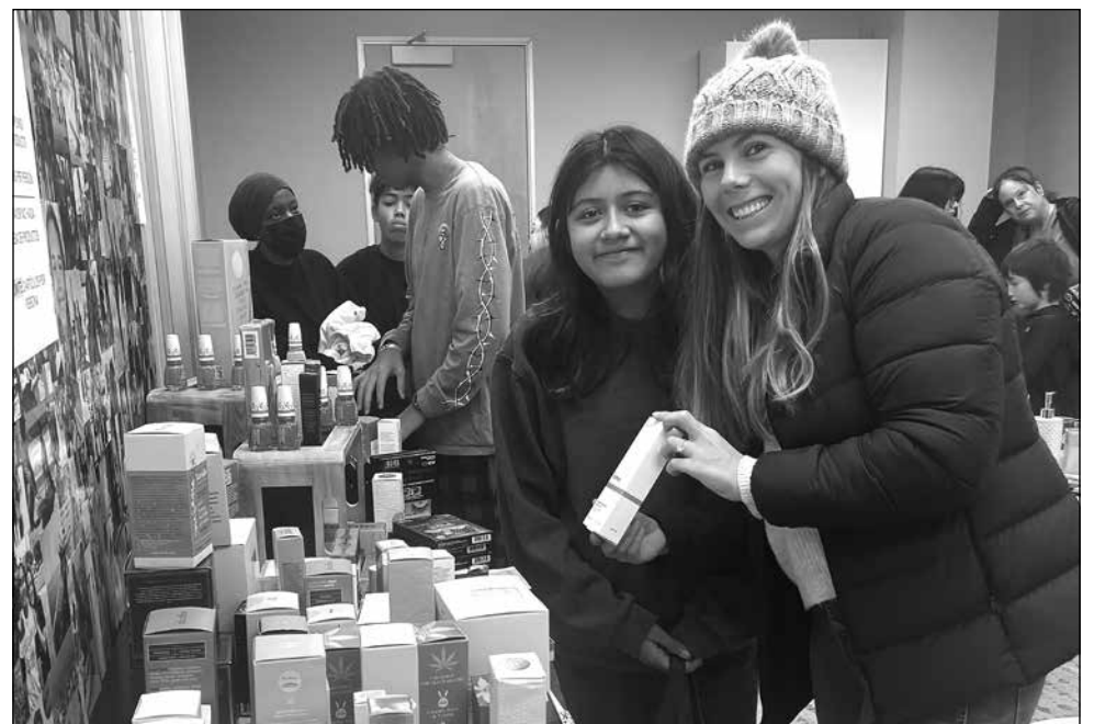
Family members shopping at the Walk with Sally store.