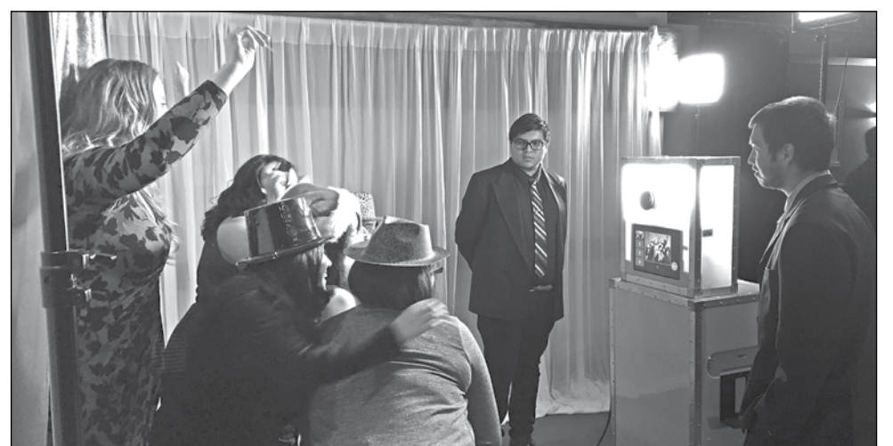
Photo Booth in Action