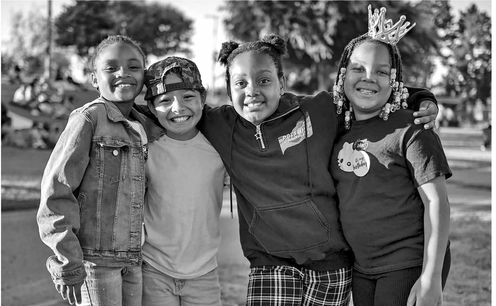
There's nothing better than laying out your blankets and chairs at sunset for popcorn, snacks and good old family fun. Thank you to everyone who came out and made movie magic. Our City is the best.