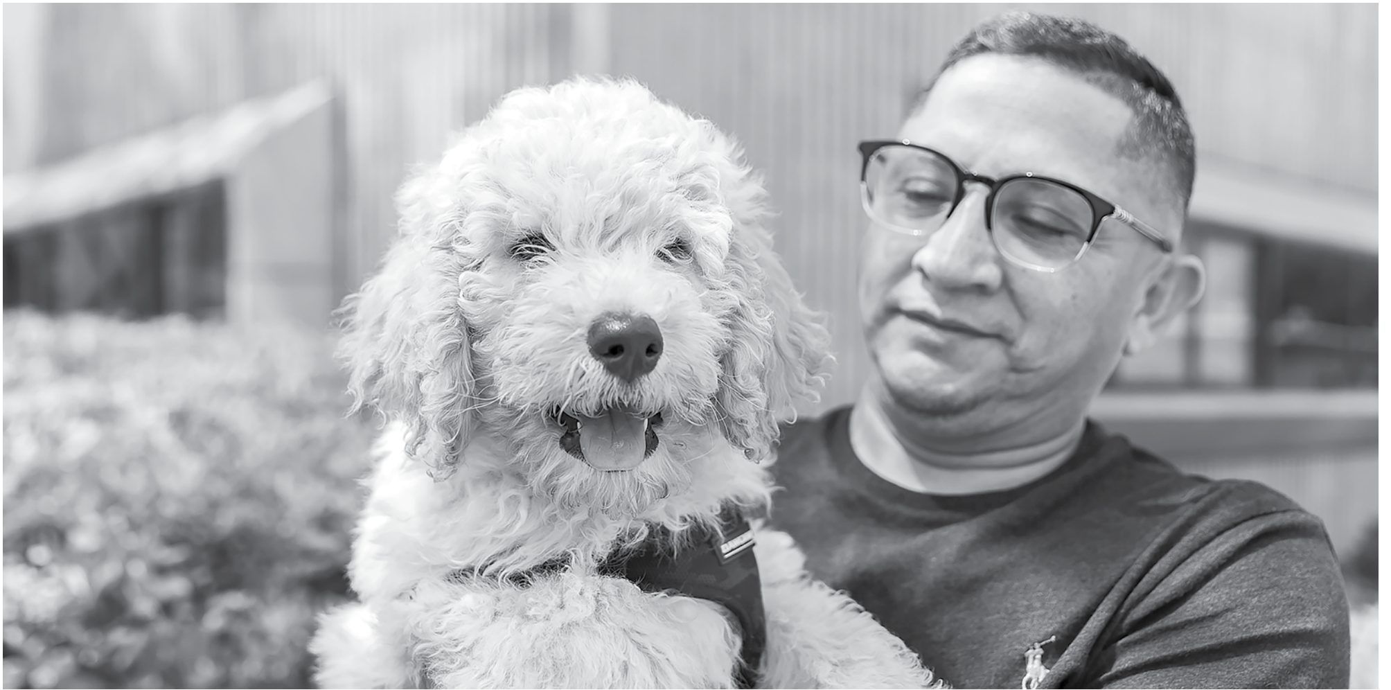
The City of Hawthorne held the annual low cost rabies clinic and microchipping event at City Hall. Dozens of furry friends and their owners showed up to get much needed vaccines, microchipping, and registrations. This is an annual event that will return in 2024.