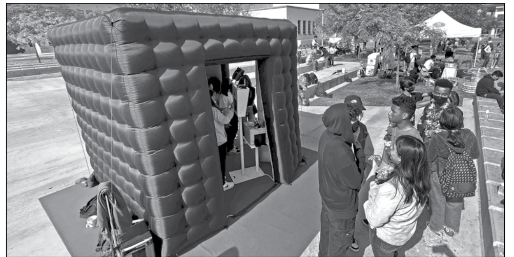
An Outdoor Photo Booth