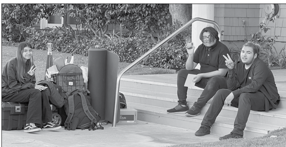
Academy Staff at Your Service