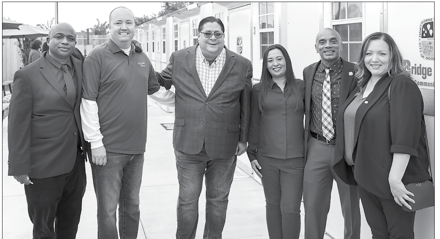
Hawthorne city staff celebrate move in day at Bridge of Hope. For story, see Biz Briefs on page 2.