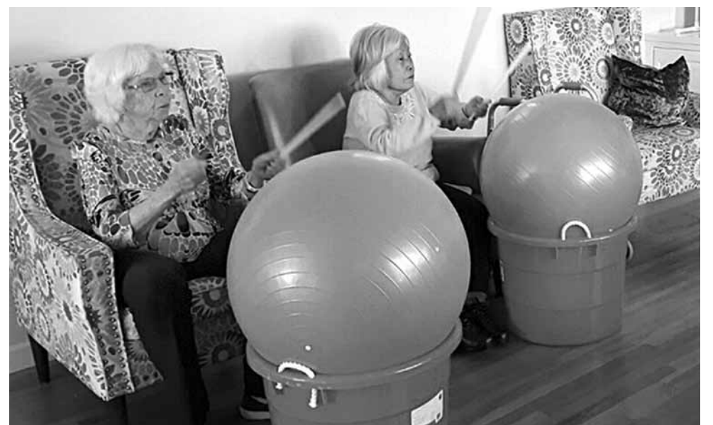
Drum Therapy: Residents getting moderate cardio-drumming which provides great brain workout!