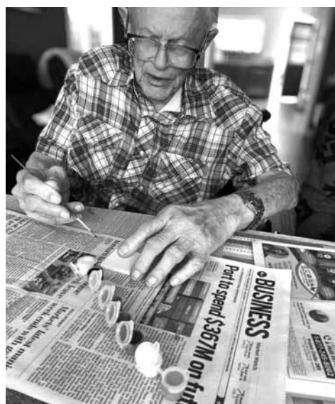
What's Art Got To Do With It?: Everything for Chronologically Gifted with Cognitive Impairment.