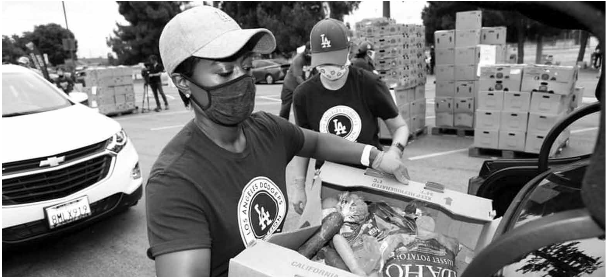
The Los Angeles Dodgers won the 2020 ESPN Sports Humanitarian Team of the Year in recognition of the work of the Dodgers Foundation. The City of Inglewood thanks the Dodgers not just for the work they do here in our community, but for what they do for the entire community of baseball.