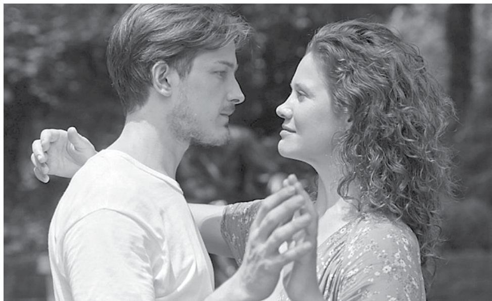
Aviva , courtesy of Outsider Pictures.

as the director of the Denzel Washington football drama Remember The Titans , or the Brittany Murphy/Dakota Fanning comedy Uptown Girls . Aviva is nothing – nothing – like his previous work. In fact, I had to do a double-take when I saw his name in