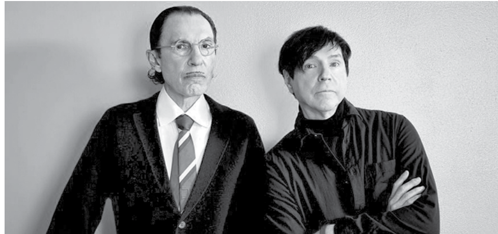
The Sparks Brothers

Of course, Ron and Russell themselves are present in this doc, too. So too do they want a part in constructing this (their) story, as their authorship has always been integral to their presentation. What I found interesting about The Sparks Brothers is that, while the Mael brothers were clearly all-too gleeful playing pop-provocateurs throughout their career (Ron famously sported a sort-of Hitler moustache, which