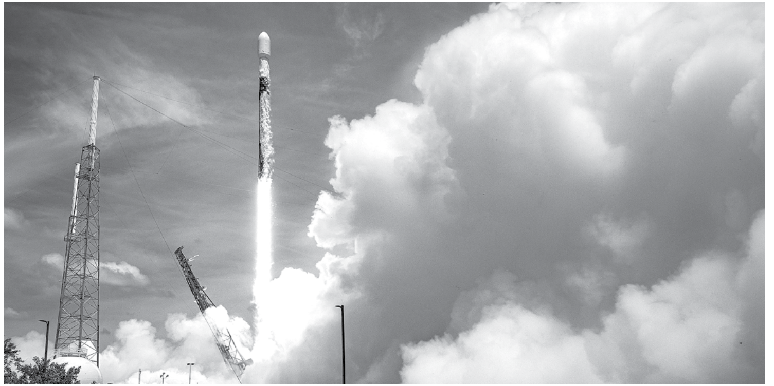
A SpaceX Falcon 9 launch vehicle clears the lightning towers around Space Launch Complex-40 at Cape Canaveral Space Force Station after lifting off at 12:09 p.m. EDT (9:09 am. PDT) June 17, carrying the fifth Lockheed Martin-built Global Positioning Systems (GPS) III Space Vehicle (SV05) for the U.S. Space Force. For story, see yellow box below.