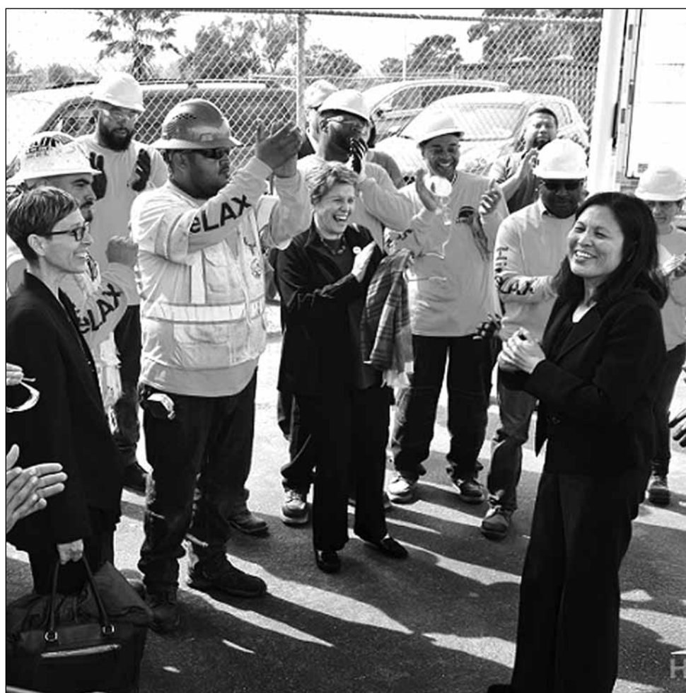
The California Labor & Workforce Development Agency visits HireLAX