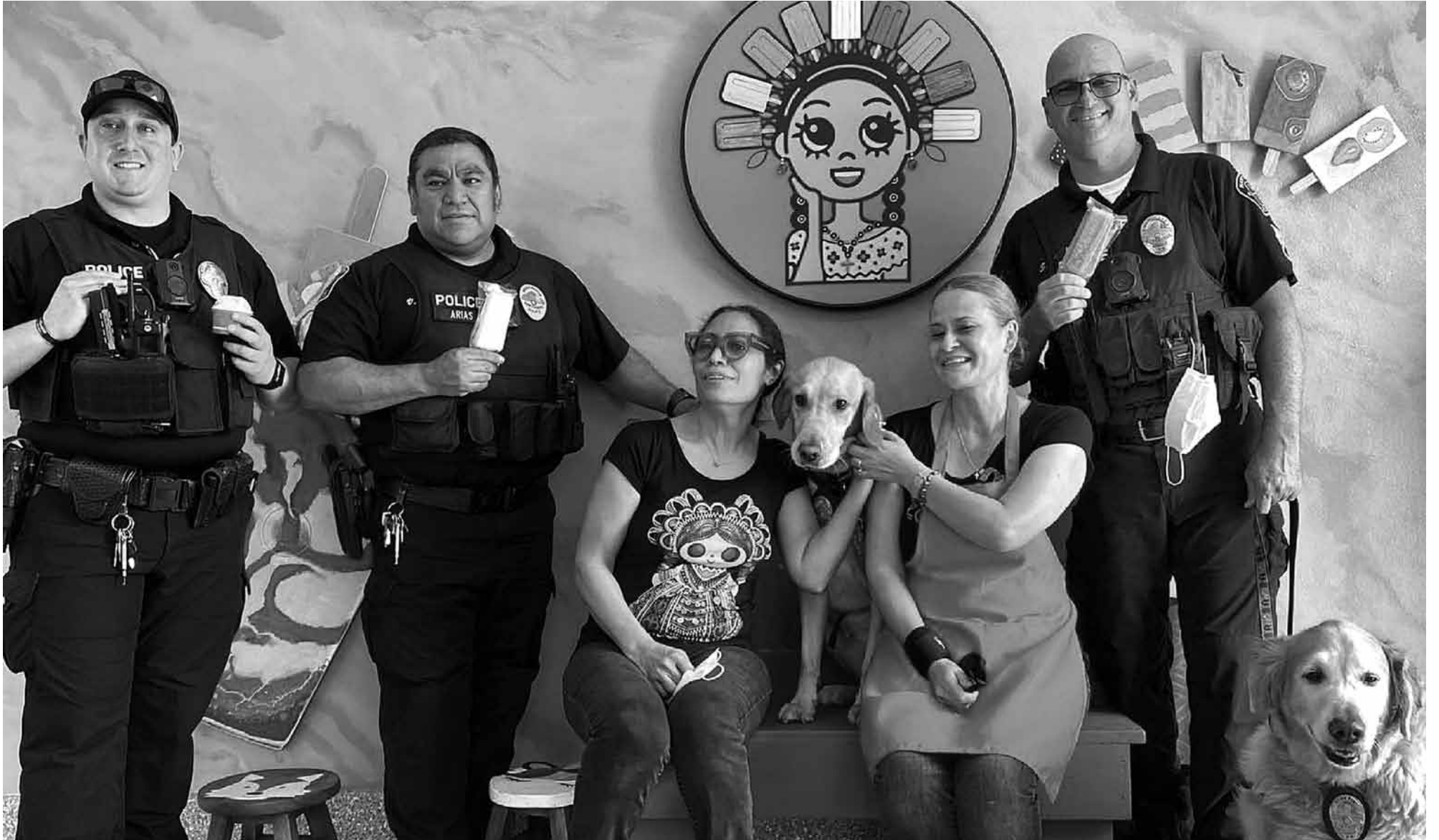
The Code 7 police code meaning for the police forces is Out Of Service To Eat. The Hawthorne Police Department thanks La Michoacana Mil Sabores for the awesome treats. Go say hi to them. Rosecrans Ave. and Inglewood Ave. Please support our neighborhood businesses by eating locally.