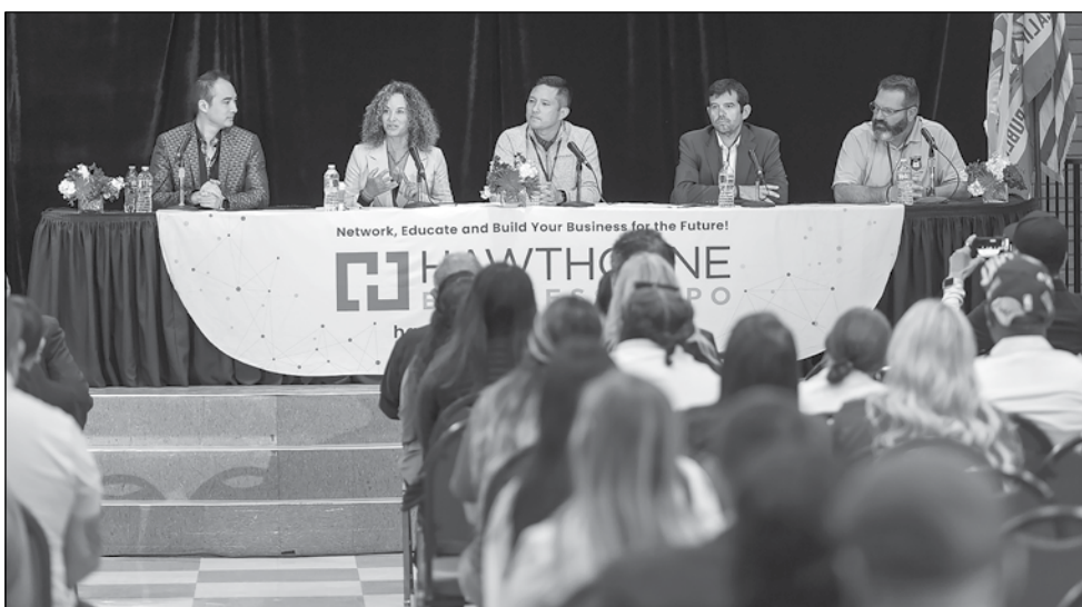
Business Expo Seminar.