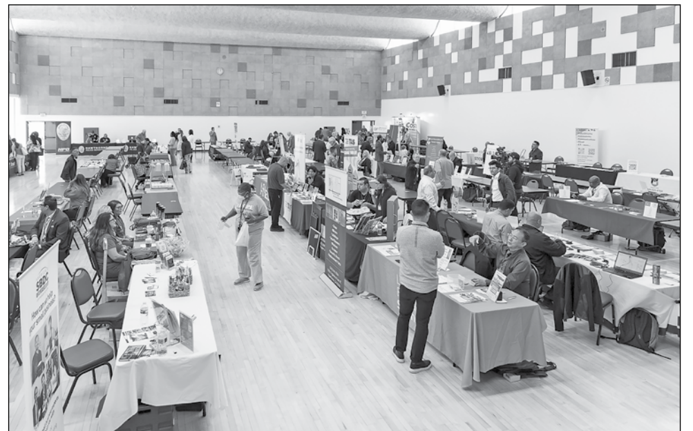
The Busy Expo Floor.