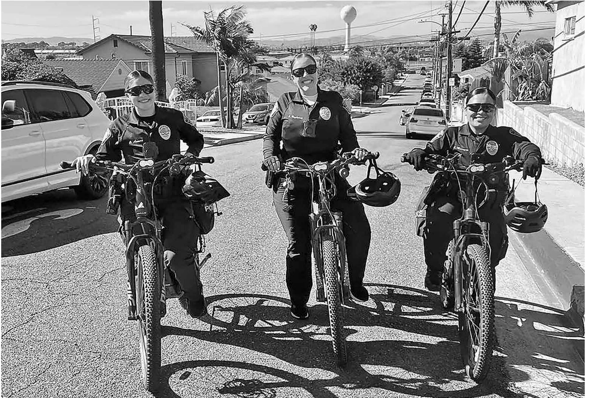
The Hawthorne Police Department wants to remind everyone to always be safe when riding. Always remember to do your ABC quick check before going on a ride. A: check the AIR on your tires. B: always check the BRAKES. C: always check that the CHAIN is clean and lubricated. QUICK: check your quick release skewers on your wheels. CHECK: take a quick ride to ensure everything is working properly. Also, do not forget your helmet, gloves, eye protection, reflective clothing, obey traffic laws, and always be aware of vehicles and other cyclists. Have fun on your next ride.