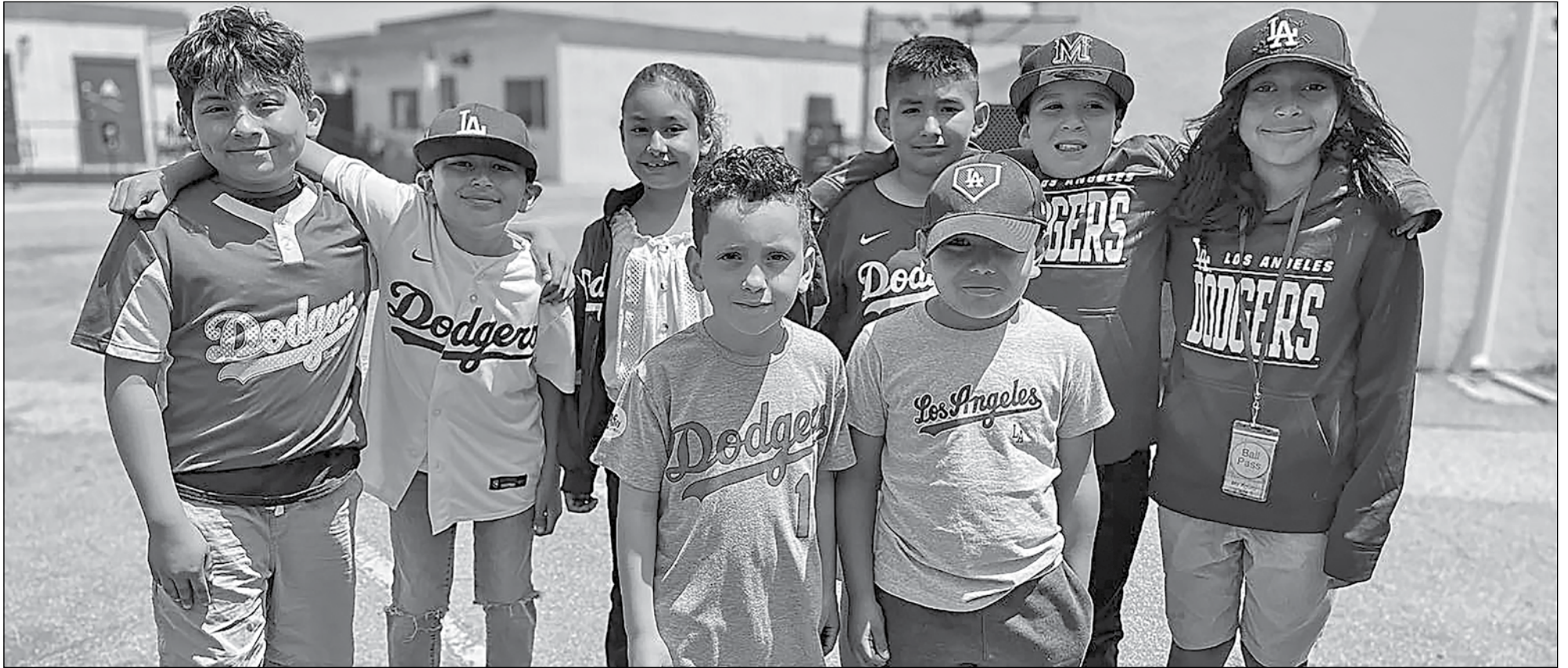
On Dodger Day the school got into true spirit to honor all our wonderful staff. Thank you PTA for making a fun day for all.