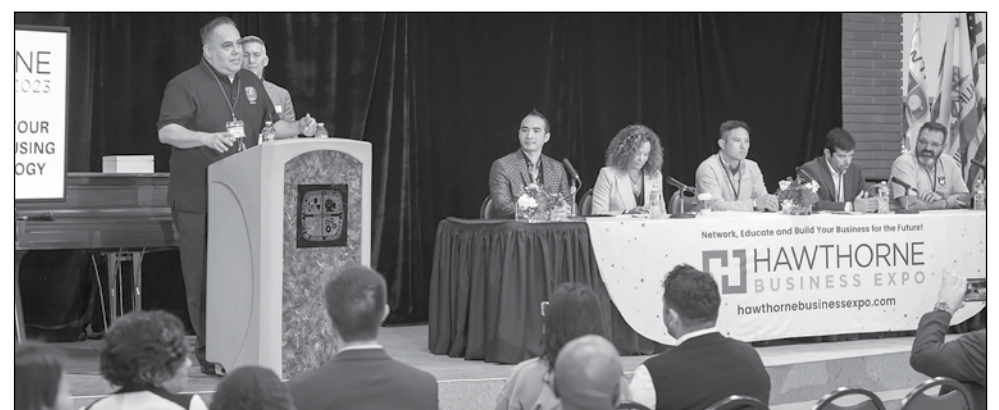
Business Expo Seminar.

Now, about the Hawthorne Convention Center... •