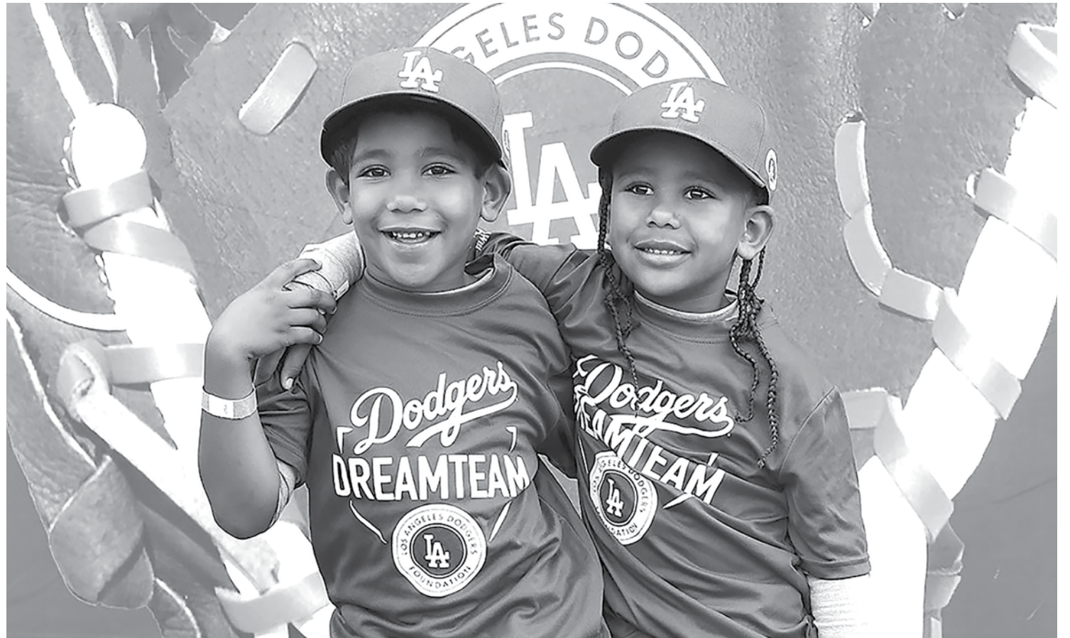
The Los Angeles Dodgers Foundation recognizes the power of sports as a tool and an outlet for positive mental health, especially for youth. With the Dodgers Dreamteam program, there is an emphasis on the various resources that are provided to Angelenos and the hope to continue raising awareness to promote the positive connections between sports and mental health. Our youth's health is bigger than baseball. Thank you for honoring Mental Health Awareness Month during the month of May.