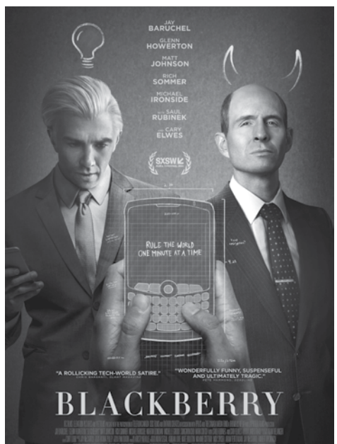
BlackBerry

In the early 2000s, the BlackBerry was a symbol of status. Lindsay Lohan and Paris