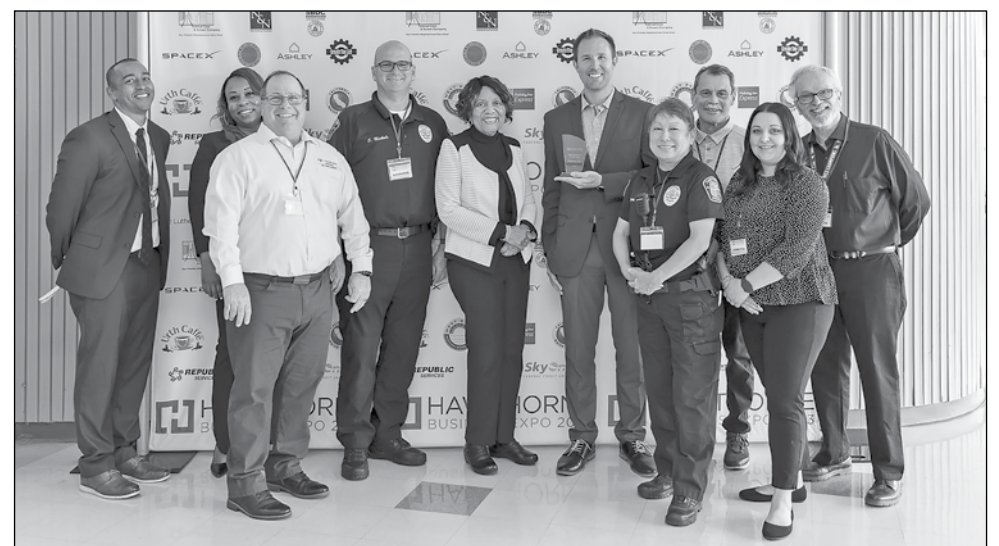
Some of the Participants.