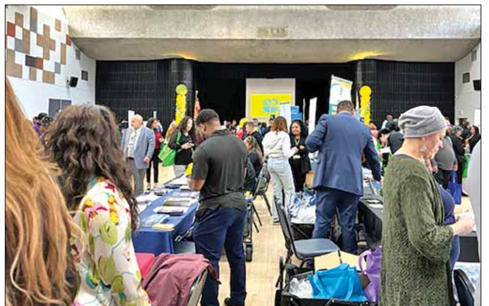
Big turnout for the Business Expo