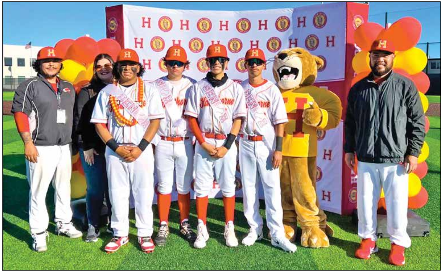
Congratulations to our Cougar Baseball seniors for the class of 2024. Thanks for a great season.