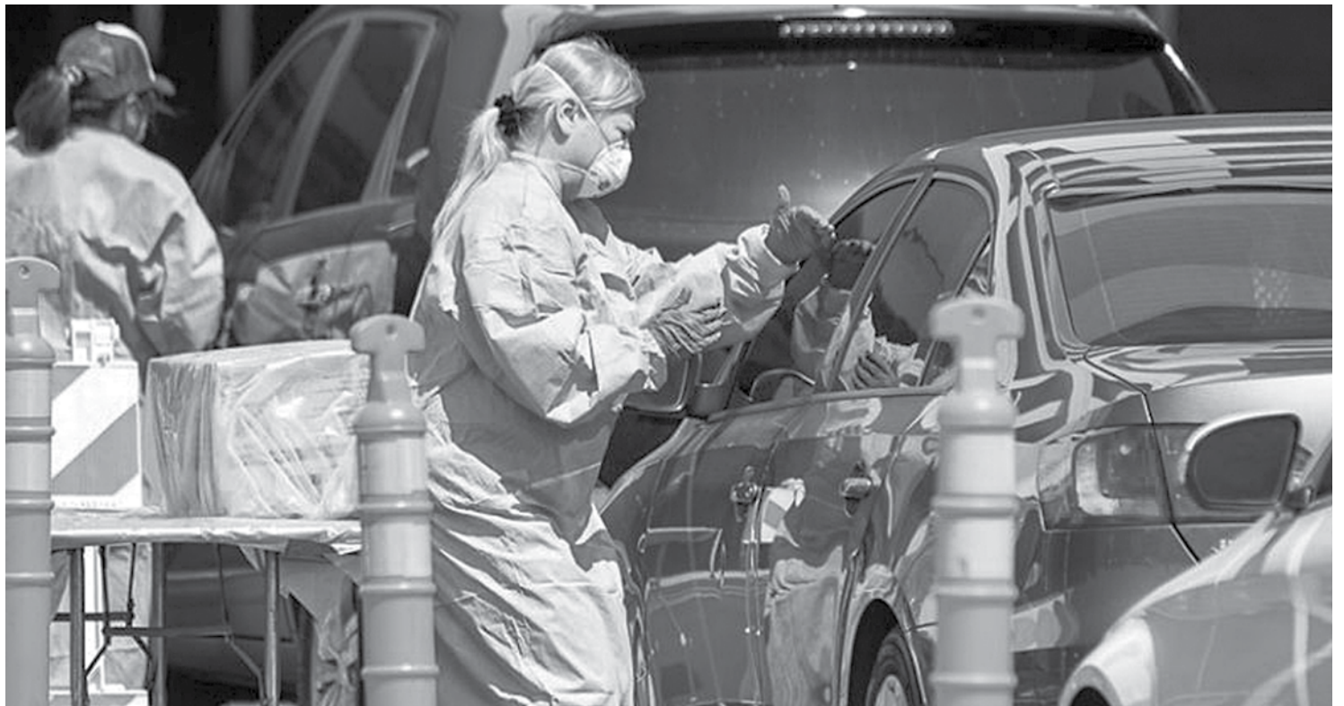
A drive-up mobile testing site for COVID-19 opened at the South Bay Galleria on April 3, one of three locations that opened, bringing the County's total to 10. Los Angeles County residents who scheduled an appointment online were administered oral swabs to test for COVID-19.