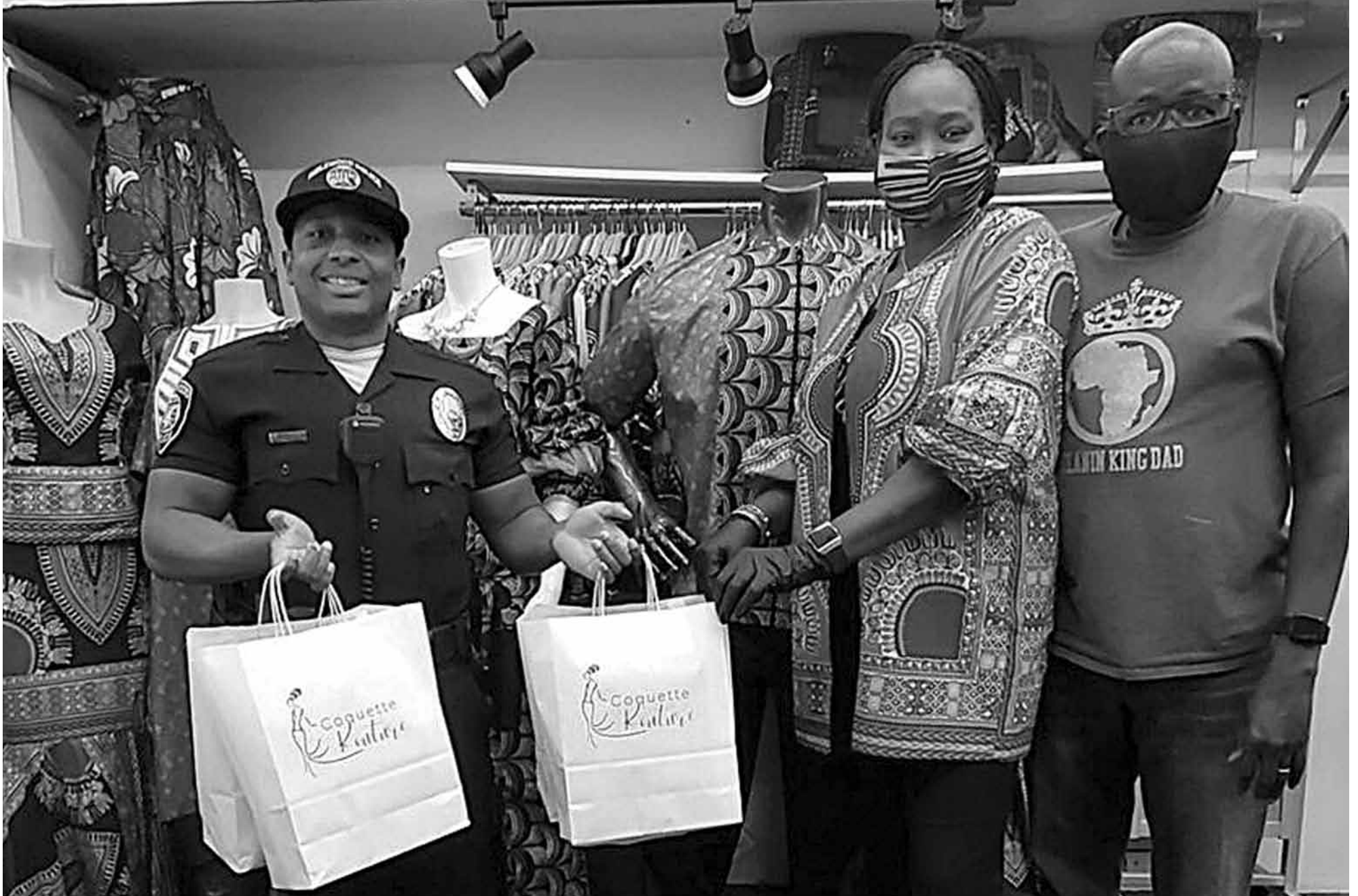
Thank you CoquetteKouture for your donation of 100 masks. You are helping keep our officers safe while serving the community.