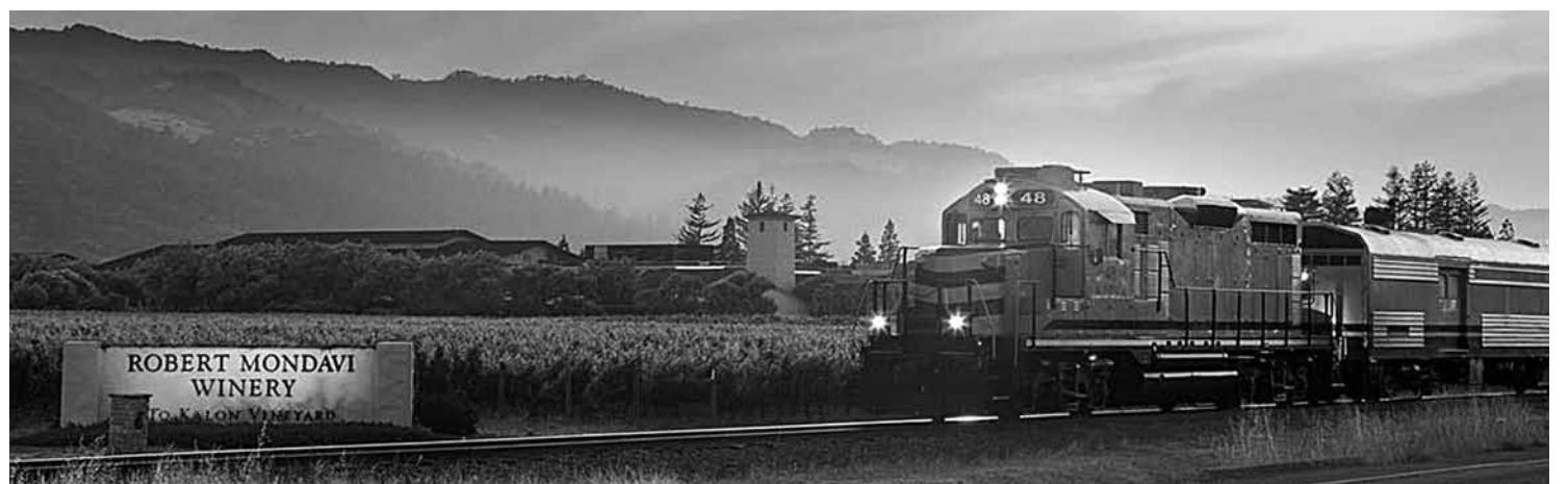
article from AAA of Southern California.