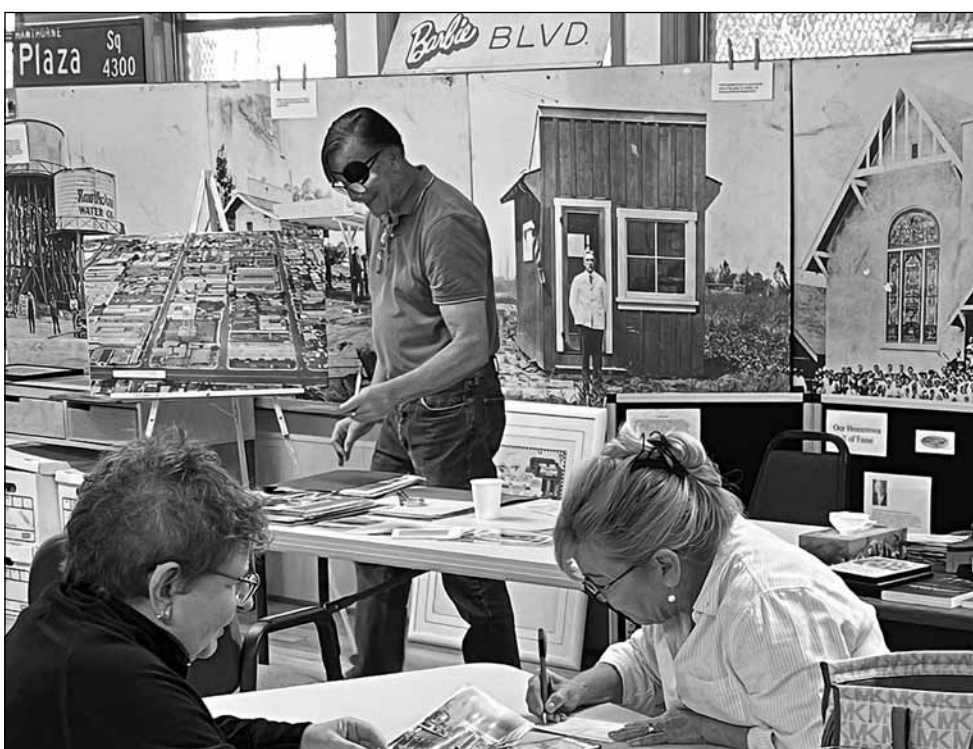
Some citizens review items at the Hawthorne Historical Society.

Well, I think "City of Dreams" is an excellent motto for Hawthorne, along with "City of Good Neighbors," of course. •