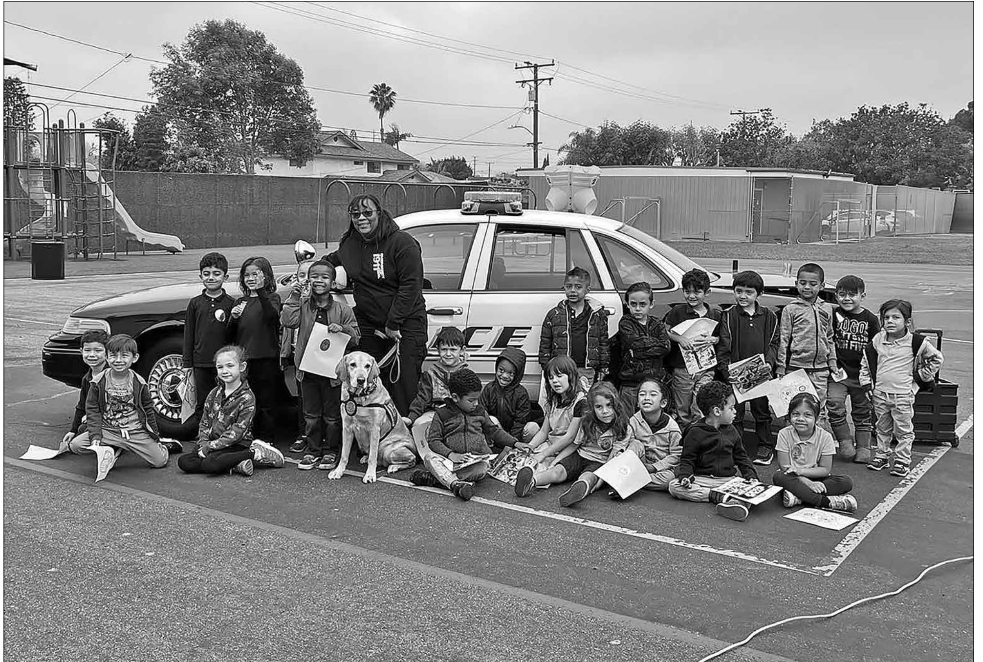
Gabby the talking car got to meet so many amazing kids last week. For those that have been with us a long time know about Gabby the Talking Police Car. Gabby is still going strong teaching young kids about safety.