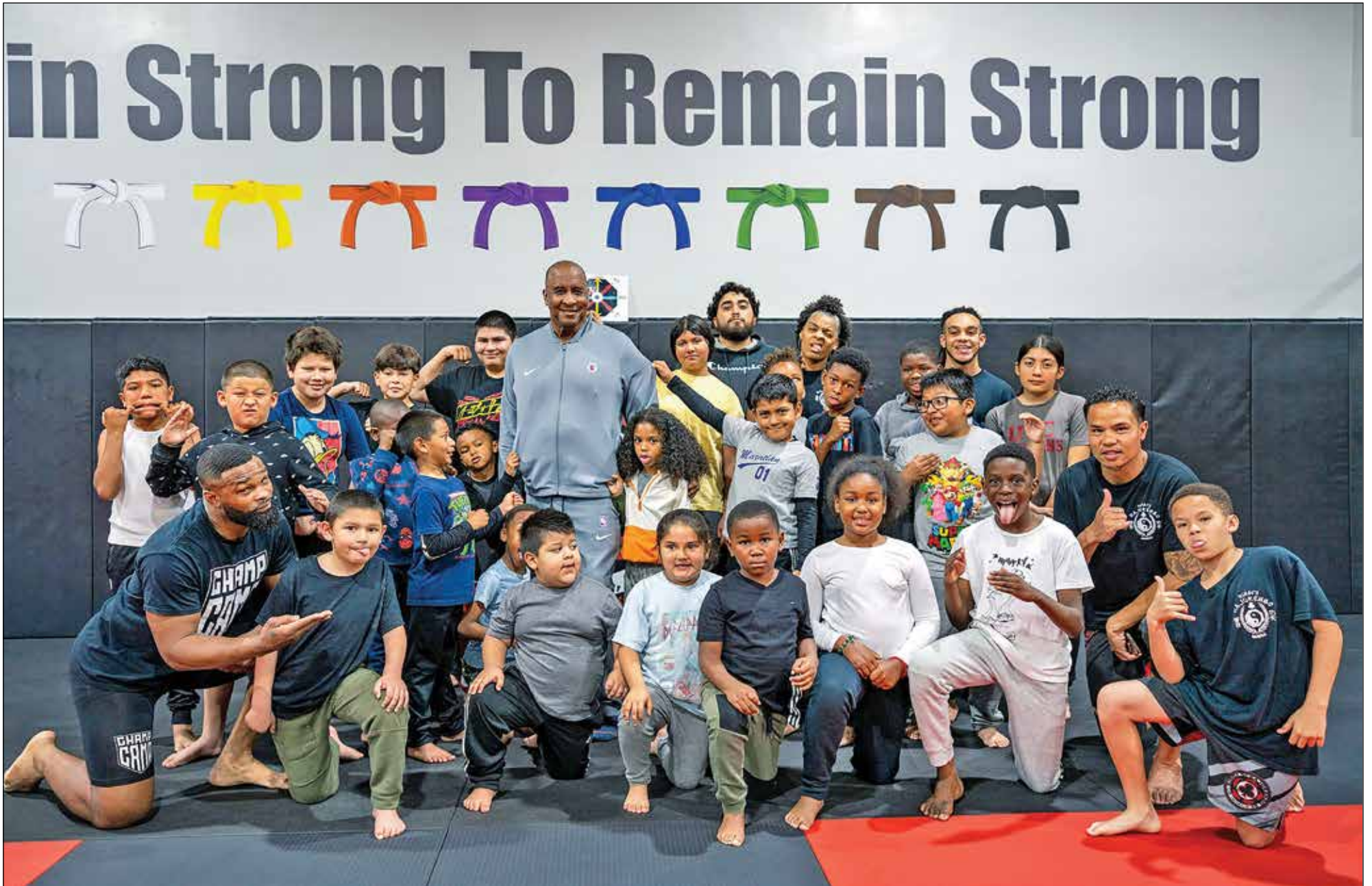
Massive gratitude to Tyron Woodley for joining us and inspiring our youth through martial arts. This marks the beginning of an exciting six-week journey, and we're eagerly anticipating their growth and achievements ahead.