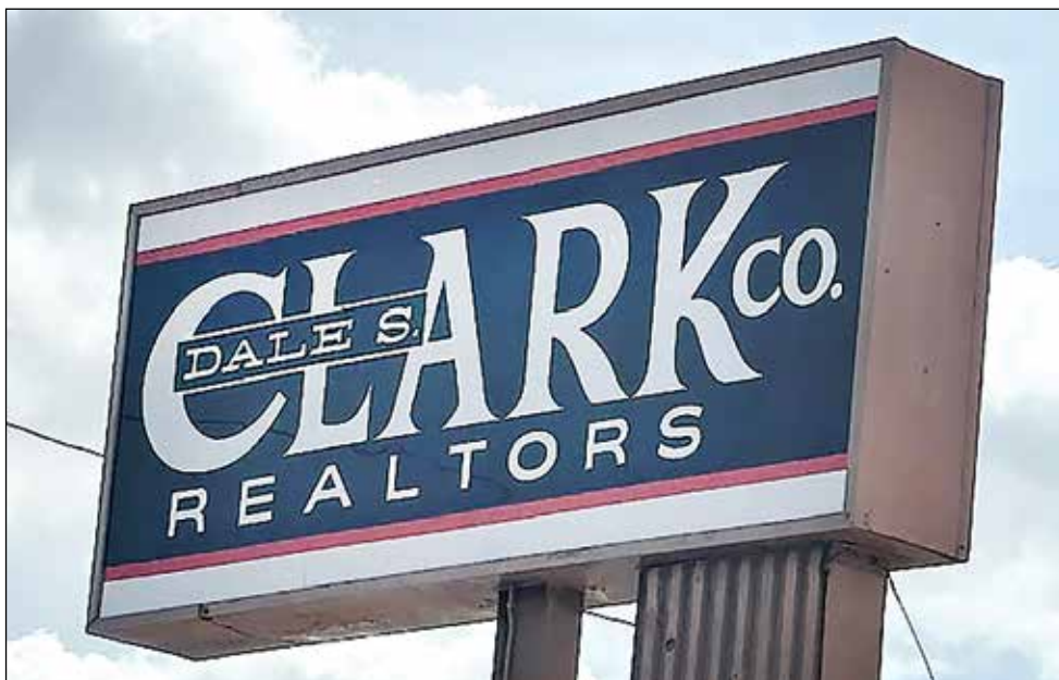
Clark Realtors.