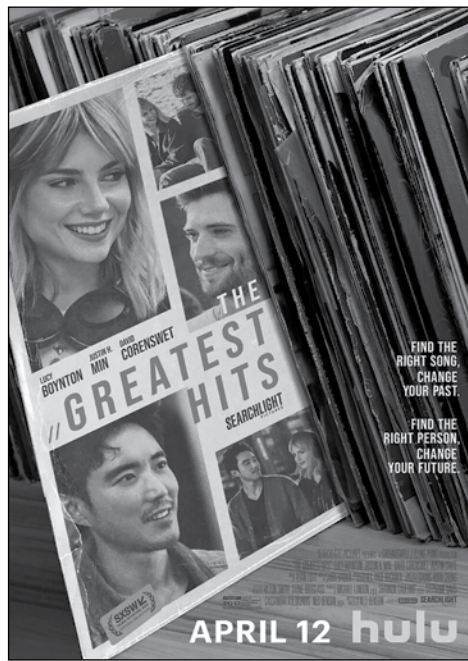
The Greatest Hits , courtesy Hulu.