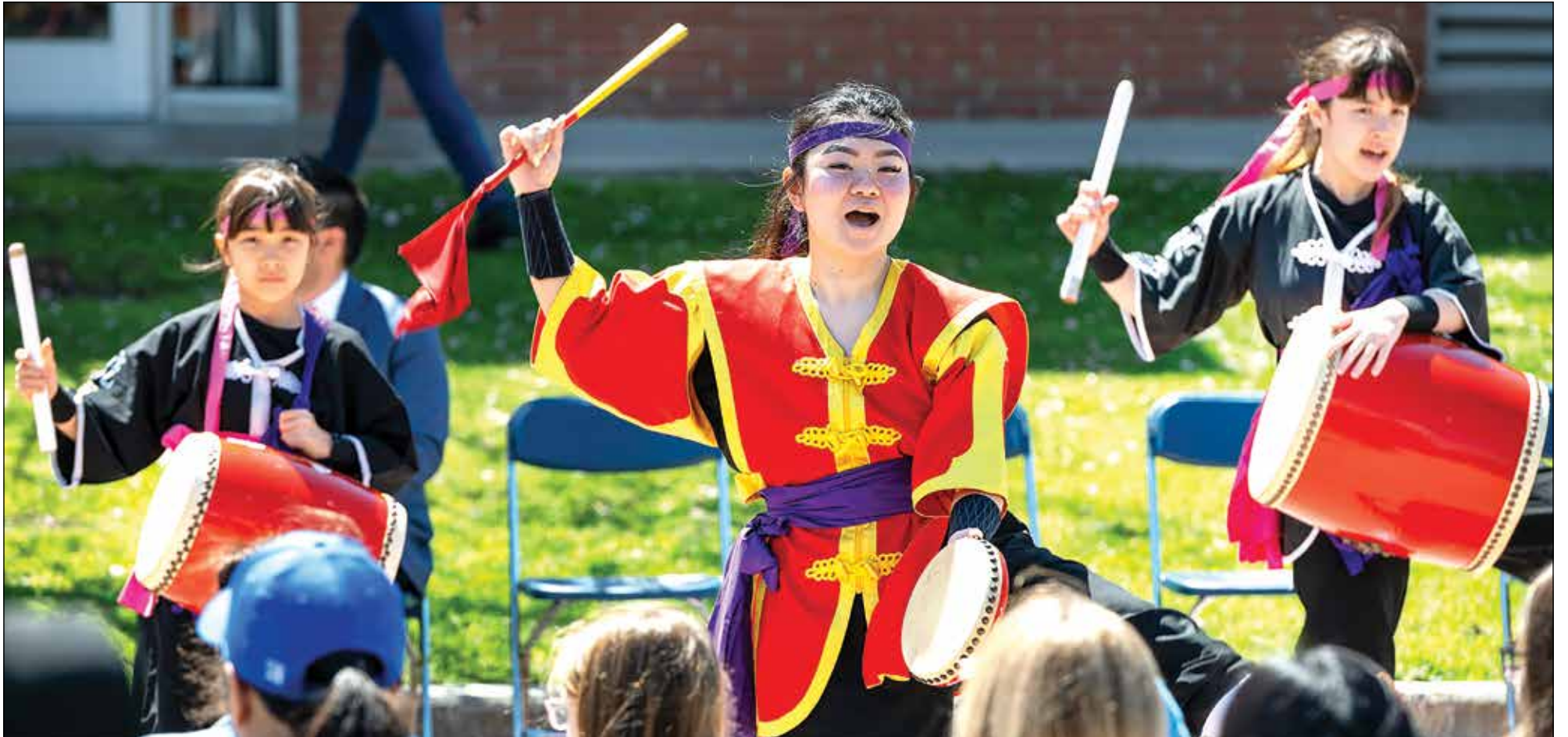
It was a sun soaked afternoon full of music, dance, poetry and snacks. Ryukyukoku Matsuri Daiko of Los Angeles opened the celebration with a thrilling performance. They were followed up by Creative Writing/Poetry students reading their original haiku. The festival ended with complimentary treats from our local friends at Kansha Creamery.