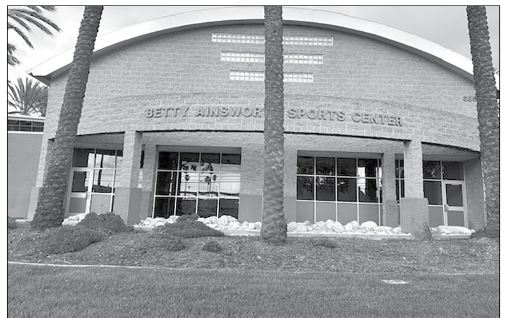
Ainsworth Sports Center