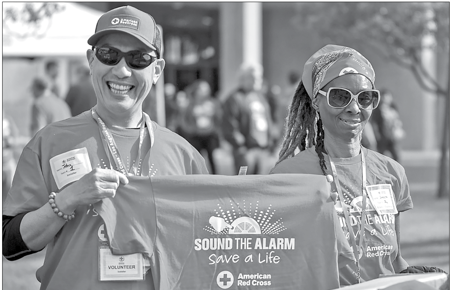
Over one-hundred and fifty dedicated volunteers joined forces in Inglewood to serve their community. With home fires claiming seven lives every day, their efforts in installing free smoke alarms will make a huge difference in cutting that risk in half. Thank you to all who participated and helped spread awareness about fire safety. Make sure to follow City of Inglewood Office of Emergency Services for more preparedness and safety tips to keep our community safe.