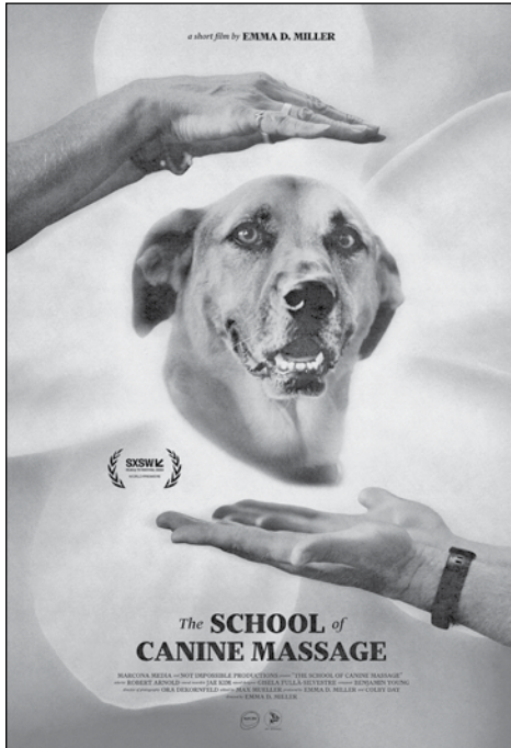
The School of Canine Massage, courtesy SXSW.

Sure, this borderlines SNL skit territory, See Film Review, page 3