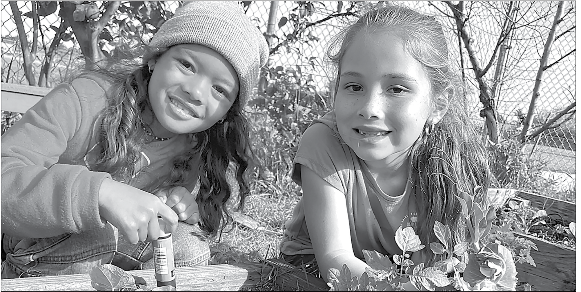
Anderson Dolphins harvested, planted seedlings and enjoyed doing a skit. They also participated in a sketch station and ended with a closing circle where they shared what they enjoyed the most. Happy Spring.