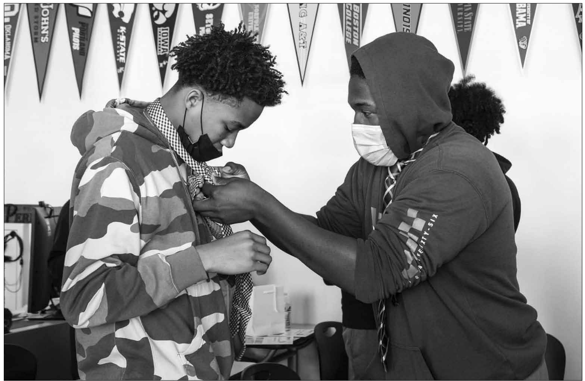
Students from Hawthorne High School, Lawndale High School, Leuzinger High School and RK Lloyde gathered at each site to attend a virtual symposium composed of accomplished Black business professionals sharing stories about overcoming adversity to achieve professional success. Kinecta hosted the event to connect students to tools, community, and contacts to help them define their own paths of success.