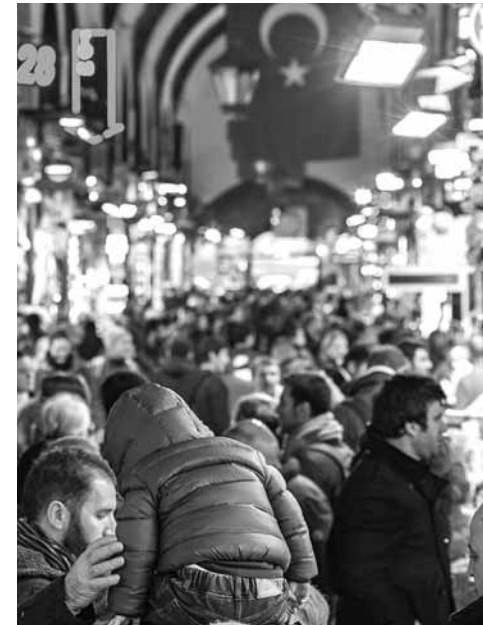
Fatih—Holiday shoppers through the Mısır Çarşısı. are still friendly. We wish we’d followed the same advice for Teheran, Beirut, Damascus, or Baghdad—but what can you do? Today, traveling to Istanbul is traveling into the very heart of human civilization.

One of our first tasks in any new city is to figure out the Metro. Our first day in Casablanca, for example, we rode the entire network, even out to the beach, and met all kinds of polite citizens determined to give up their seat for Glinda. The Istanbul Metro is far more complicated, but easy to use, and it takes you everywhere, even out to the suburbs. If you get lost, don’t worry—just cross the