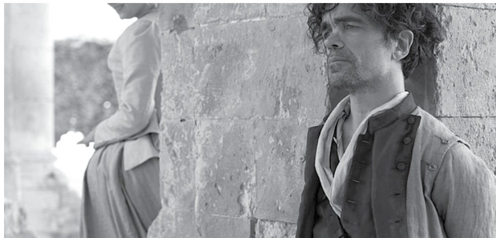
Haley Bennett stars as Roxanne and Peter Dinklage as Cyrano in Joe Wright's Cyrano.

As the title character, Peter Dinklage captivates and commands the screen. He showcases his trademark charm and wit. But seeing him long for Roxanne as a sort of doomed "Phantom of the Opera" shows even more range than what we've seen from him before. His chemistry with Roxanne—the centerpiece romance of the film—is also uplifting and heart-aching. As Roxanne, Haley Bennett is wonderful. Her singing voice is beautiful, her character desirable, and her character so pure-hearted.