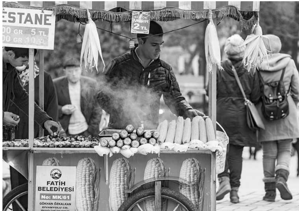
Fatih—Corn and chestnut roaster by the Sultan Ahmed Blue Mosque.