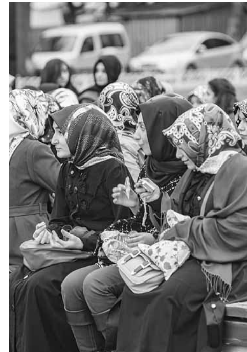
Fatih—Women’s lunch spot near the Hagia Sophia.