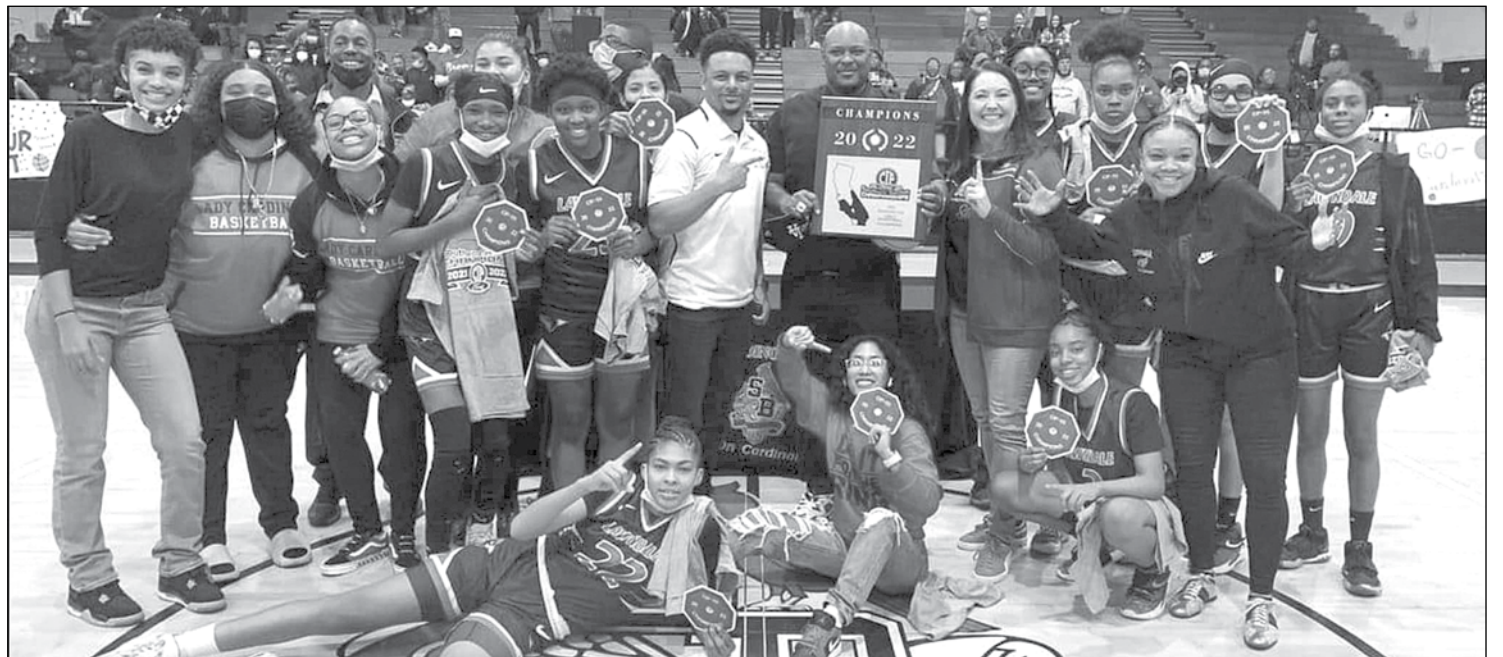
Congratulations to the Lawndale High School Lady Cardinals on making school history. Can't wait for the CIF state championship.