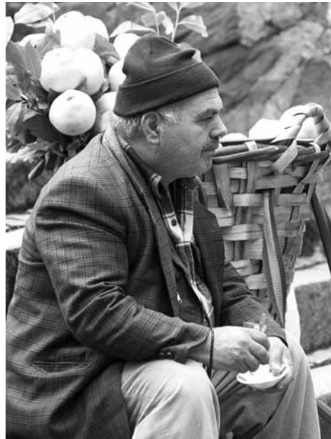
Karaköy—Lemon seller on a pomegranate-yogurt break. history—the Roman-Byzantine Christians followed by the Muslim Ottomans—its position at the junction of the east-west Silk Road and the north-south Eurasian-African travel routes guaranteed that it would dominate the trade and culture of the ancient world. When London was still an Anglo-Saxon village and later, when Manhattan was still valued at $24 worth of beads, the polyglot city of Constantinople already teemed with travelers from the fabled four corners of the Earth.

Go to Istanbul, and go soon while things