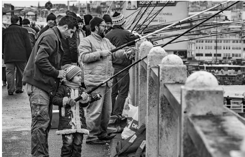
Galata—Fishing family-style from Leonardo da Vinci’s favorite bridge. Tower—are two of the most fabled waterways in history. The Topkapi Palace housed the Sultans, their Harems, their troops of Janissaries, and the enormous governing retinues led by their Viziers. The Hagia Sophia, the Blue Mosque, and the Süleymaniye Mosque were three leading jewels in the life of historical Islam. Legendary names like these alternately terrified and inspired generations of humanity.

So with all that history and the lively, chaotic