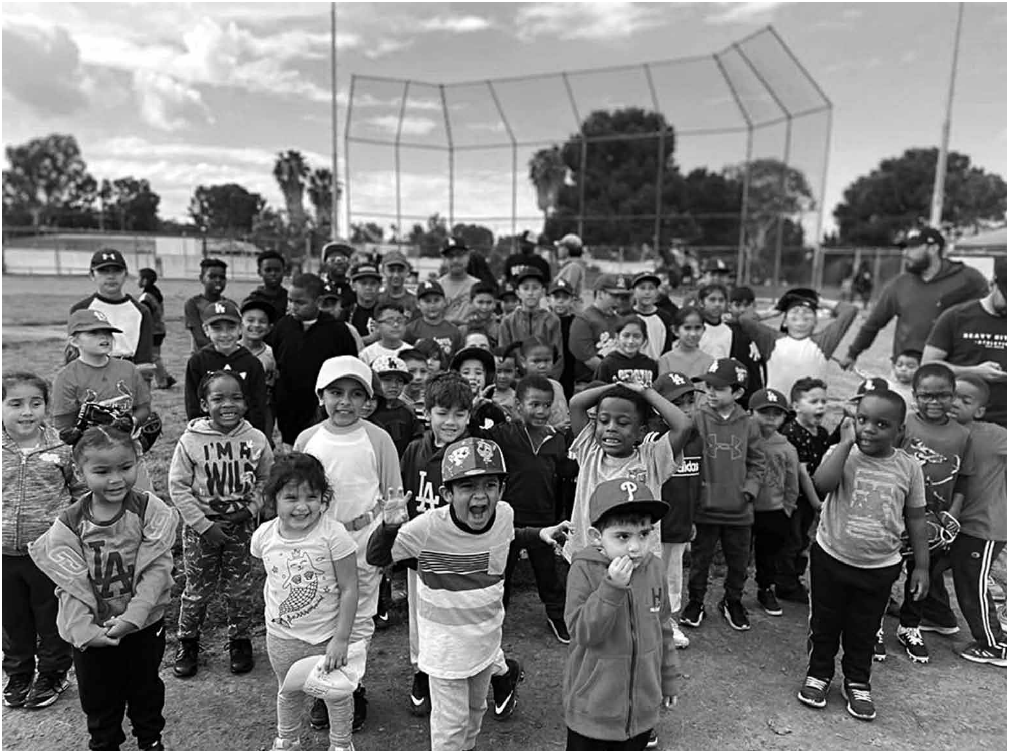
Evaluations & Drafts complete! Inglewood Little League is on its way. We invite everyone to our Opening Day - Saturday, March 14 at Rogers Park.

“Who in their infinite wisdom decreed that Little League uniforms be white? Certainly not a mother.” — ERMA BOMBECK