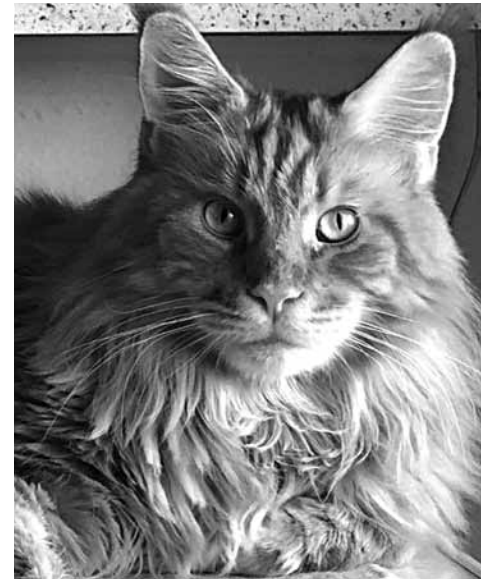
Redd Redd will also need to be the only animal in the house with no children. The ideal home for Redd would be a quiet environment with only one or maybe two patient adults who are home quite a bit so that they can cater to his culinary needs and keep him in the lifestyle to which he is accustomed.

Redd is a gorgeous and wonderful Maine Coon guy. Weighing in at 24 pounds, he needs quite a bit of space and a very sturdy and strong cat tree. This handsome boy will require a special home to accommodate his special needs. He needs special food served in small amounts three to four times a day as he will overeat to the point of vomiting. Redd also had a terrible reaction to a vaccine when he was young, so no more vaccines of any kind for him ever.