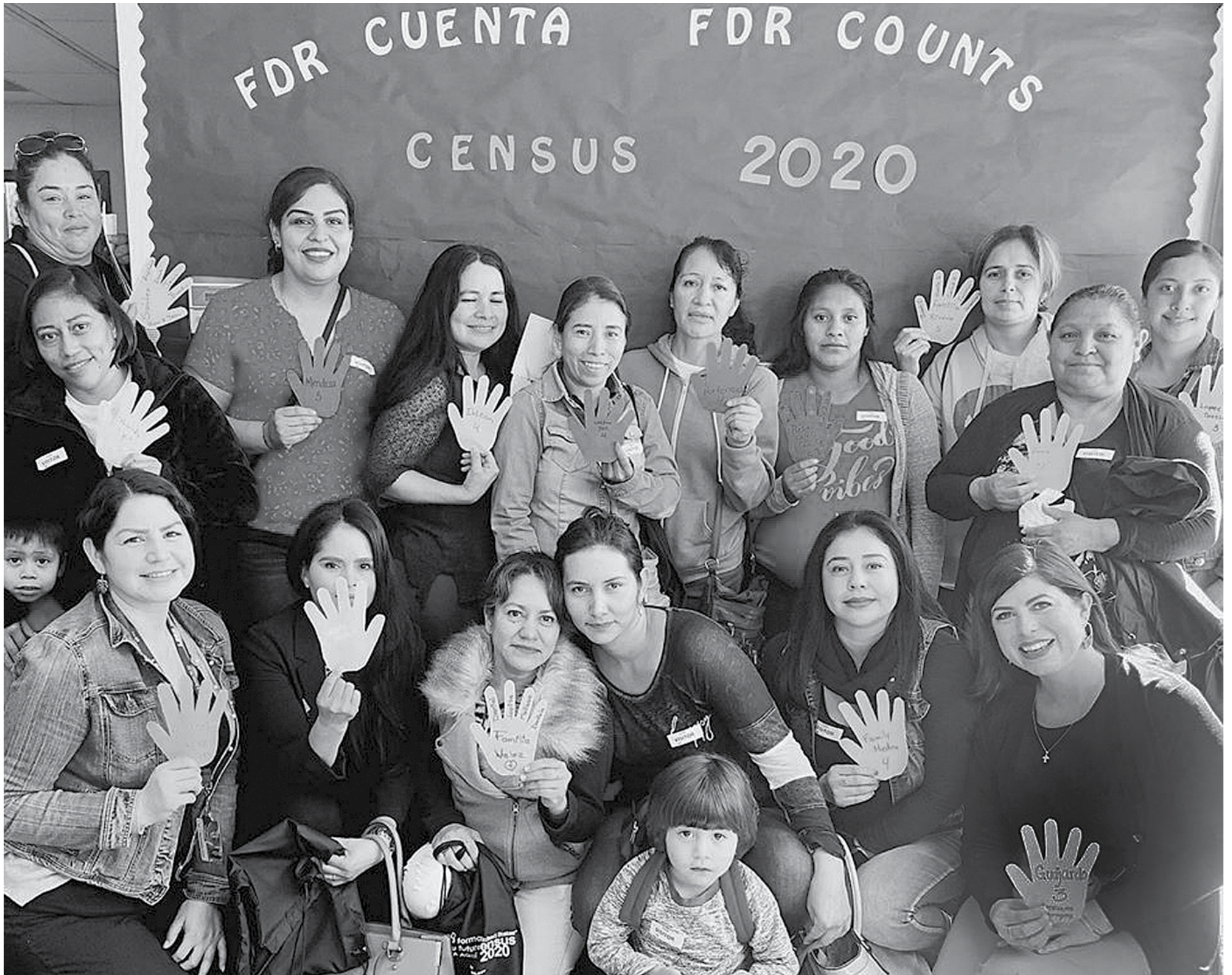
On Tuesday, February 25, FDR families attended the census2020 workshop to learn how the census benefits Lawndale and they helped start our school census by placing their "hands" on the school wall. We welcome all FDR families to place their hand on the wall and show the world that #lawndalecounts.