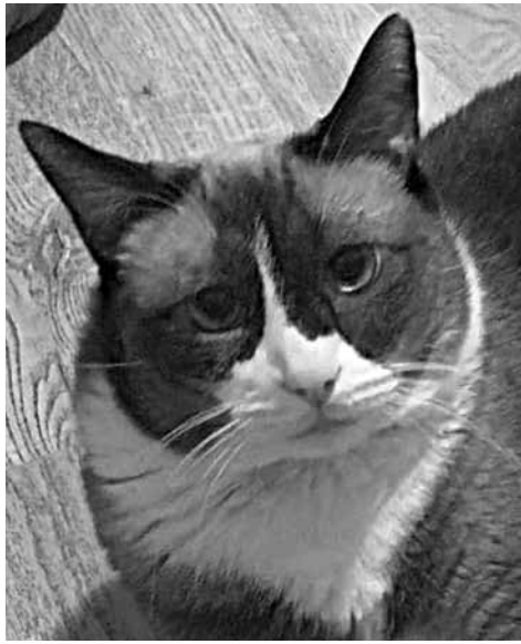
Bubba “A cat has absolute emotional honesty. Human beings, for one reason or another, may hide their feelings, but a cat does not,”... Ernest Hemmingway.

When Bubba was rescued in November, he weighed in at a whopping 26.5 pounds! He signed up for our Biggest Loser Club and we're proud to report that he is now down to 19.5 pounds. Although his weight loss journey is going well, he's still looking for his fur-ever home. As the weight has come off, his wonderful personality has come out. This lovable boy is very friendly, playful and sociable to his human friends. However, Bubba has made it clear that he needs to be the king of his castle and doesn't want to share his human(s) with other