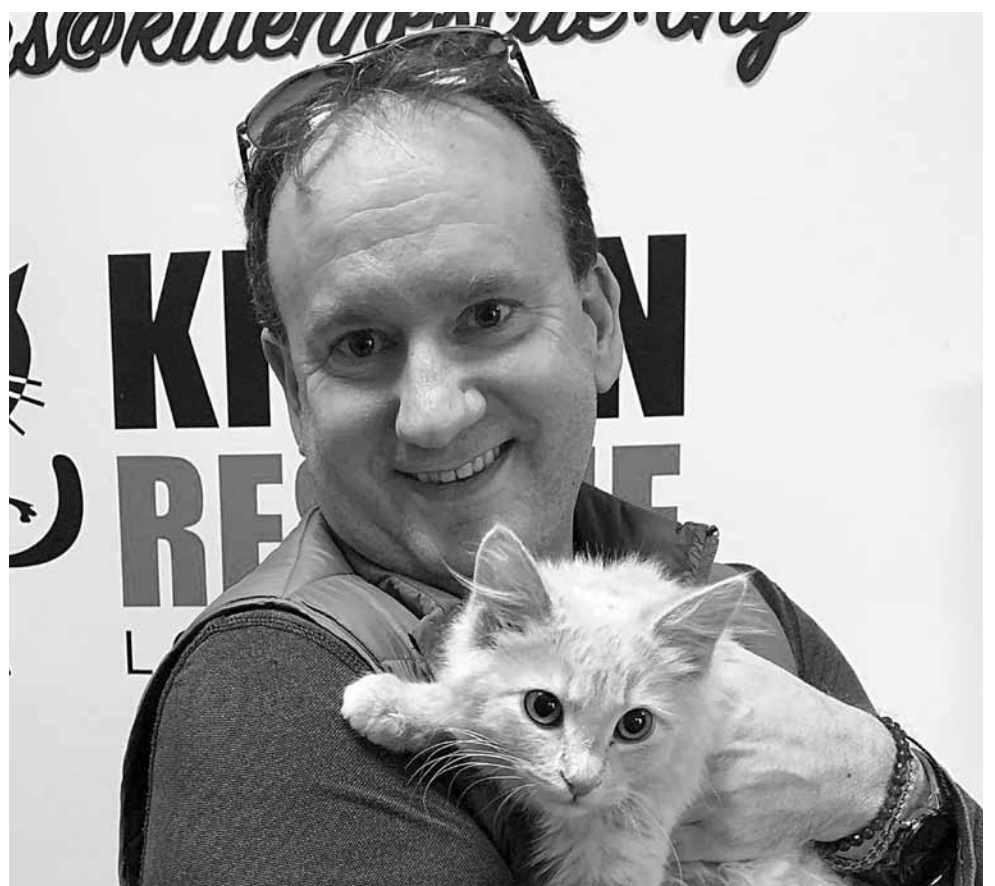
Gatsby is going home!

When you adopt a “pet without a partner”, you will forever make a difference in their life and they are sure to make a difference in yours. •