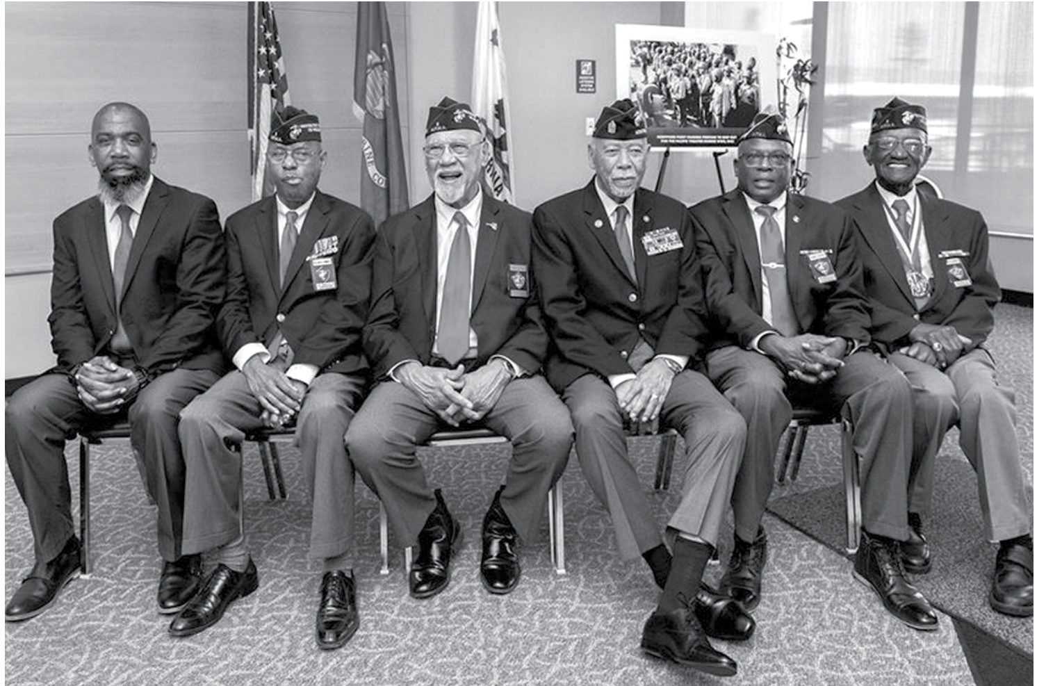
El Camino College proudly welcomed the Montford Point Marines Los Angeles Chapter 8 to campus for the Black History Month Luncheon hosted by ECC's Veterans Resource Center. They honored the history and World War II legacy of the first African Americans to join the Marine Corps.