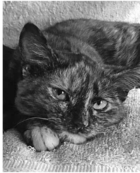
Scarola next exciting toy to play with or thinking of ways to make a new game out of the old toys to amuse herself and her siblings. She also loves to get cuddled and will even climb up to your arms to make sure she gets some cuddle sessions with you. In her foster home, Julianne loves to play with her mommy's dog and is great with older cats. She is still very young and needs to be adopted with one of her siblings – James, Jasper or Jolene.

Julianne is always on the go and looking for some cuddle sessions. She loves to climb on top of cat trees and running around with her siblings. She is such a fun and energetic little girl. Julianne is always looking for the