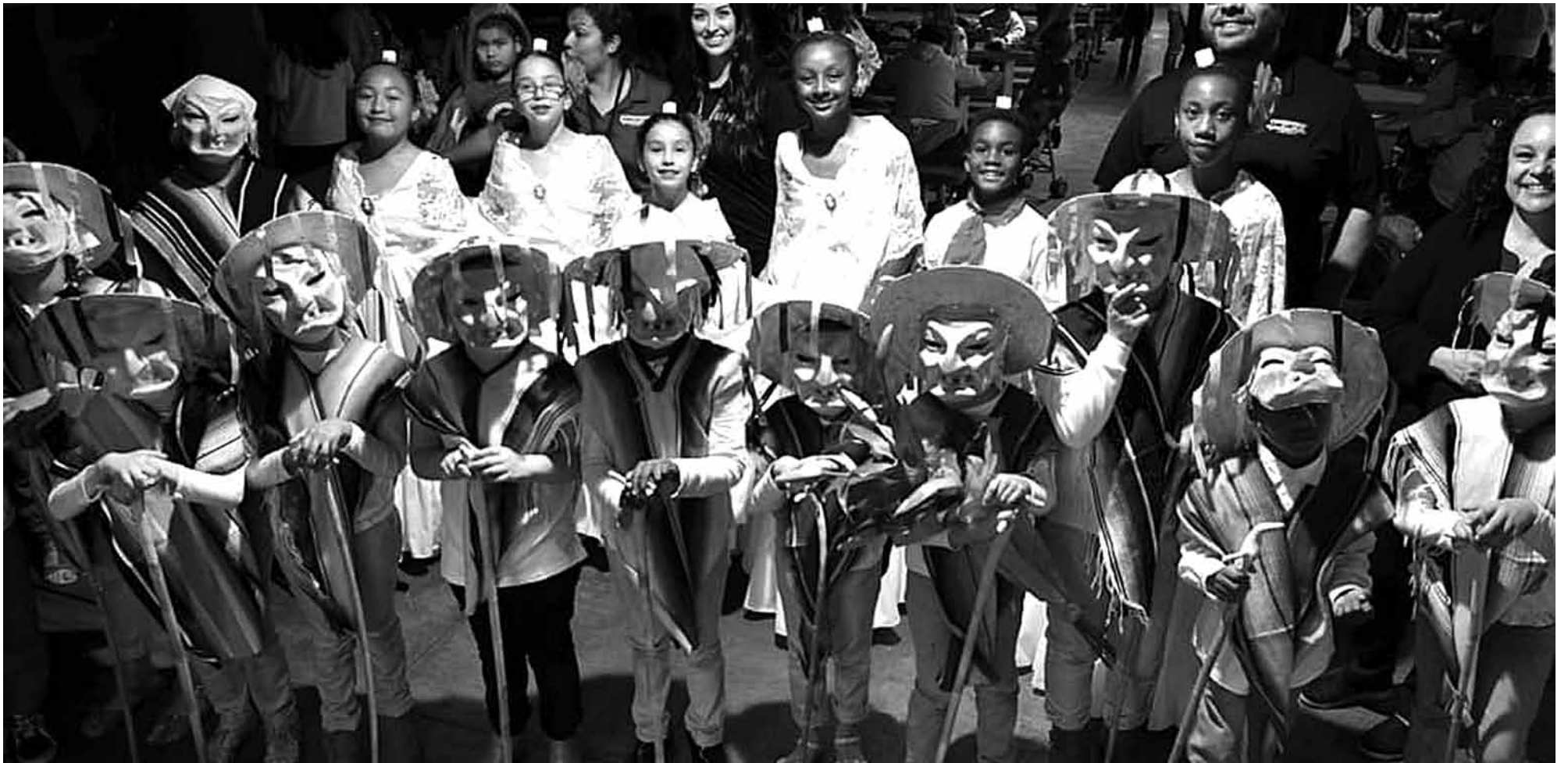
Students dress up to celebrate the occasion. Jefferson's Families' hard work made the Multicultural Night a fun and exciting evening.