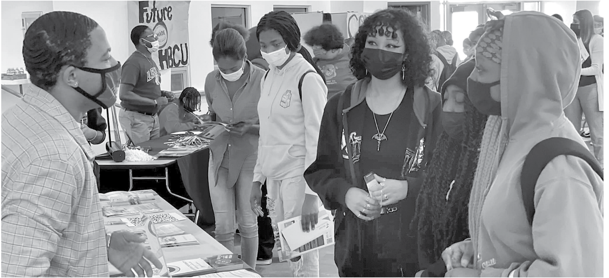
Hundreds of undecided seniors attended the caravan and so many were accepted on the spot. Numerous students received scholarships and the students who received the most acceptances at each campus won $300 on the spot. Congratulations on such an amazing event.