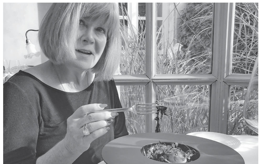
Grignan — Lunch of the century at le Clair de la Plume.