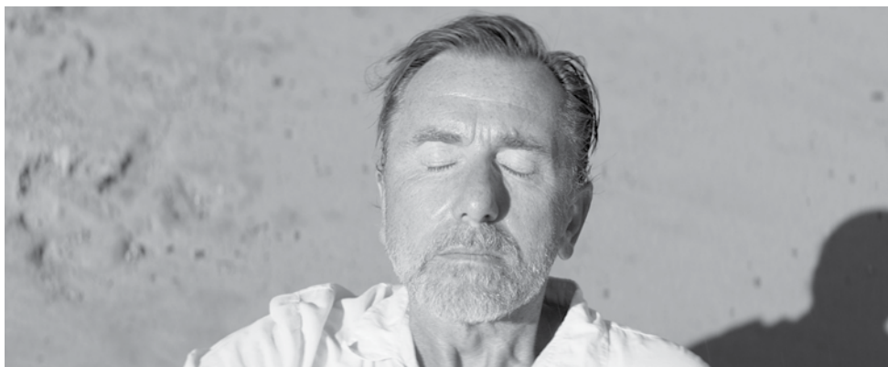
Tim Roth as Neil Bennett in 'Sundown,' a film by Michel Franco