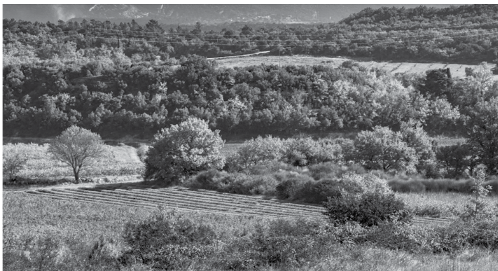
Richerenches—Truffles, lavender, and fruit trees in late autumn.