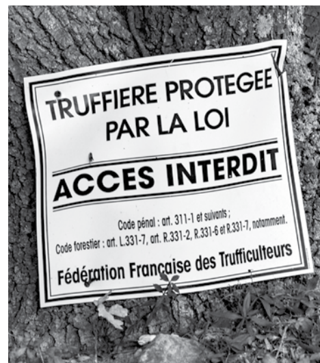
Richerenches—Beware of the pig!