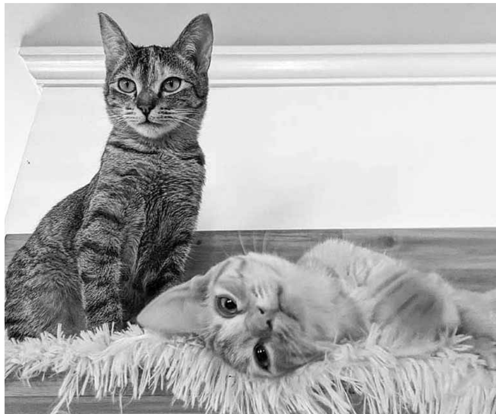
Gracie and Opie

Saving one animal won't change the world, but the world will surely change for that animal. •