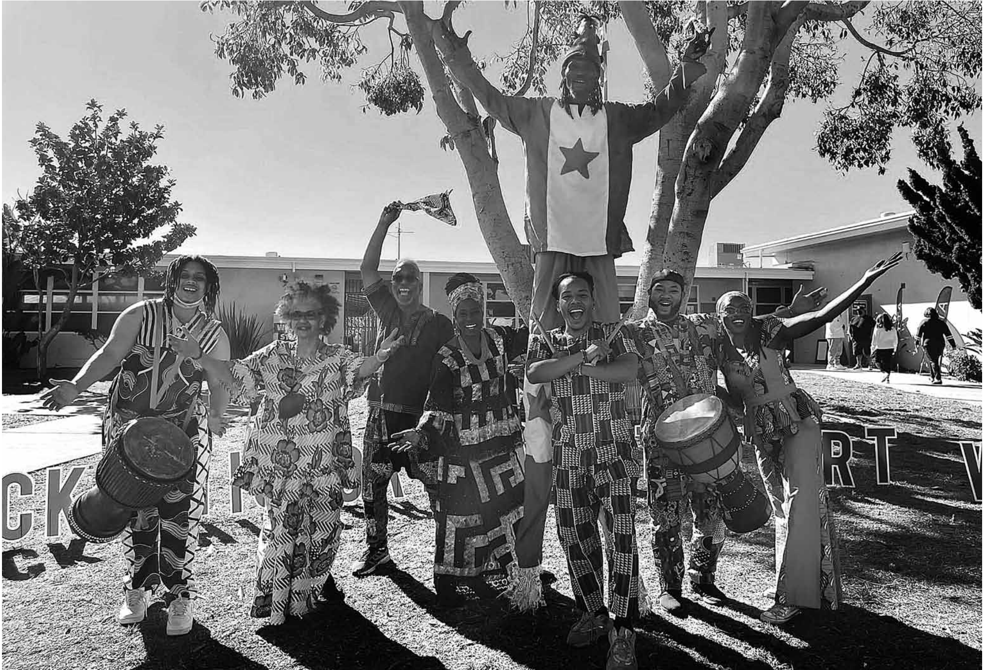
A Black History Art Walk Festival took place at Frank D. Parent School. Students in grade levels K-12 showcased their amazing artwork, celebrating Black History Month, alongside enjoying some remarkable performances.