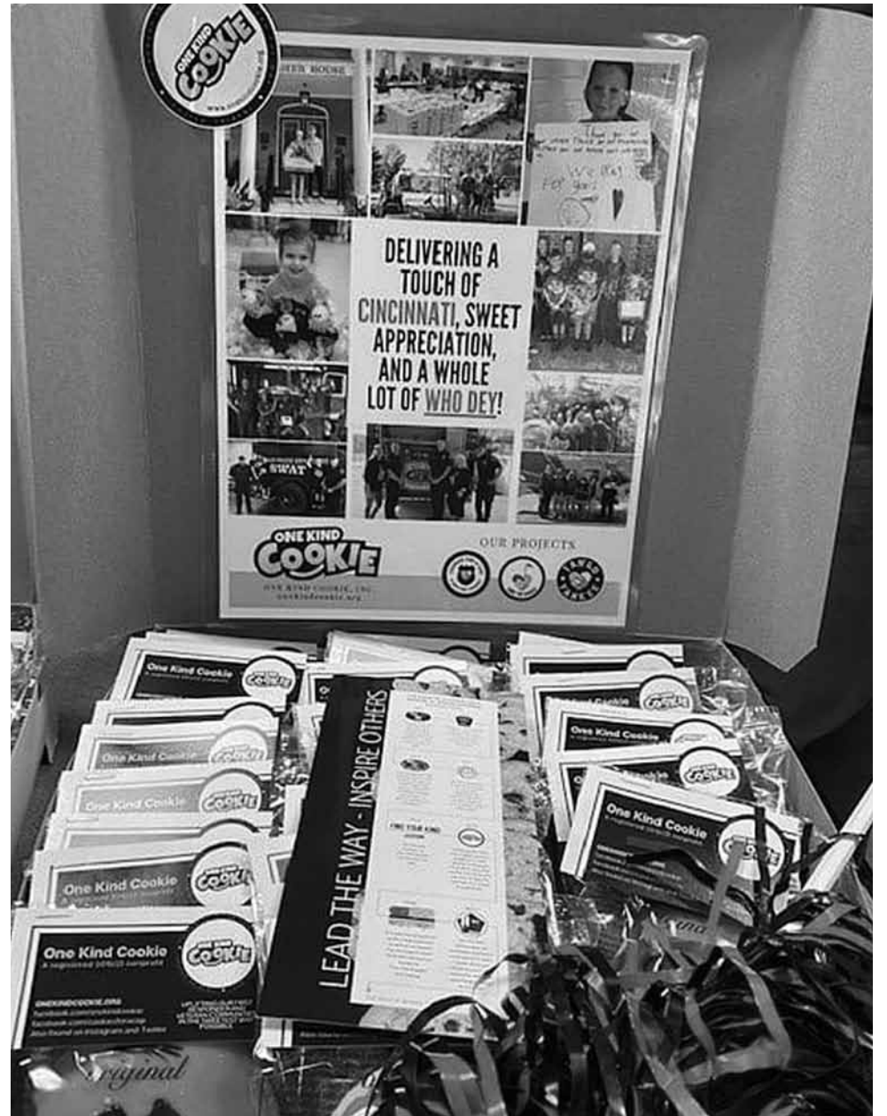
Thank You to One Kind Cookie for the delicious sweets delivered to the Hawthorne Police Department during Super Bowl week. They were much appreciated by all the officers. One Kind Cookie, the nonprofit parent to the nationally known Cookies for a Cop and our Fire Friends campaign, works to grow the mission of connecting families and communities in the name of kindness (and cookies).