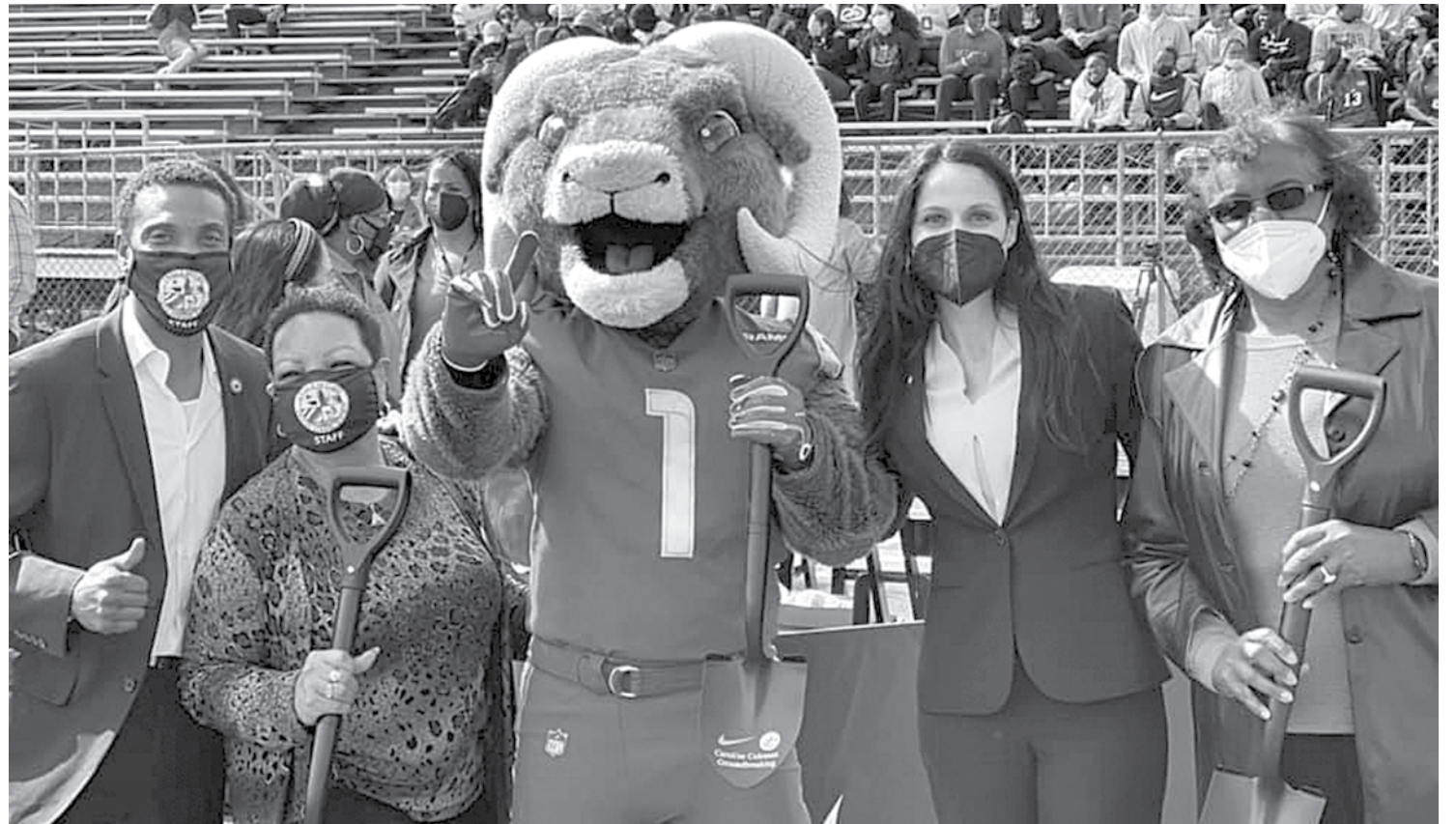
Inglewood Unified School District is proud to announce the Caroline Coleman Stadium Refurb. In partnership with Nike, NFL, Los Angeles Rams, and Los Angeles Chargers the stadium will be remodeled giving our students access to state-of-the-art facilities.