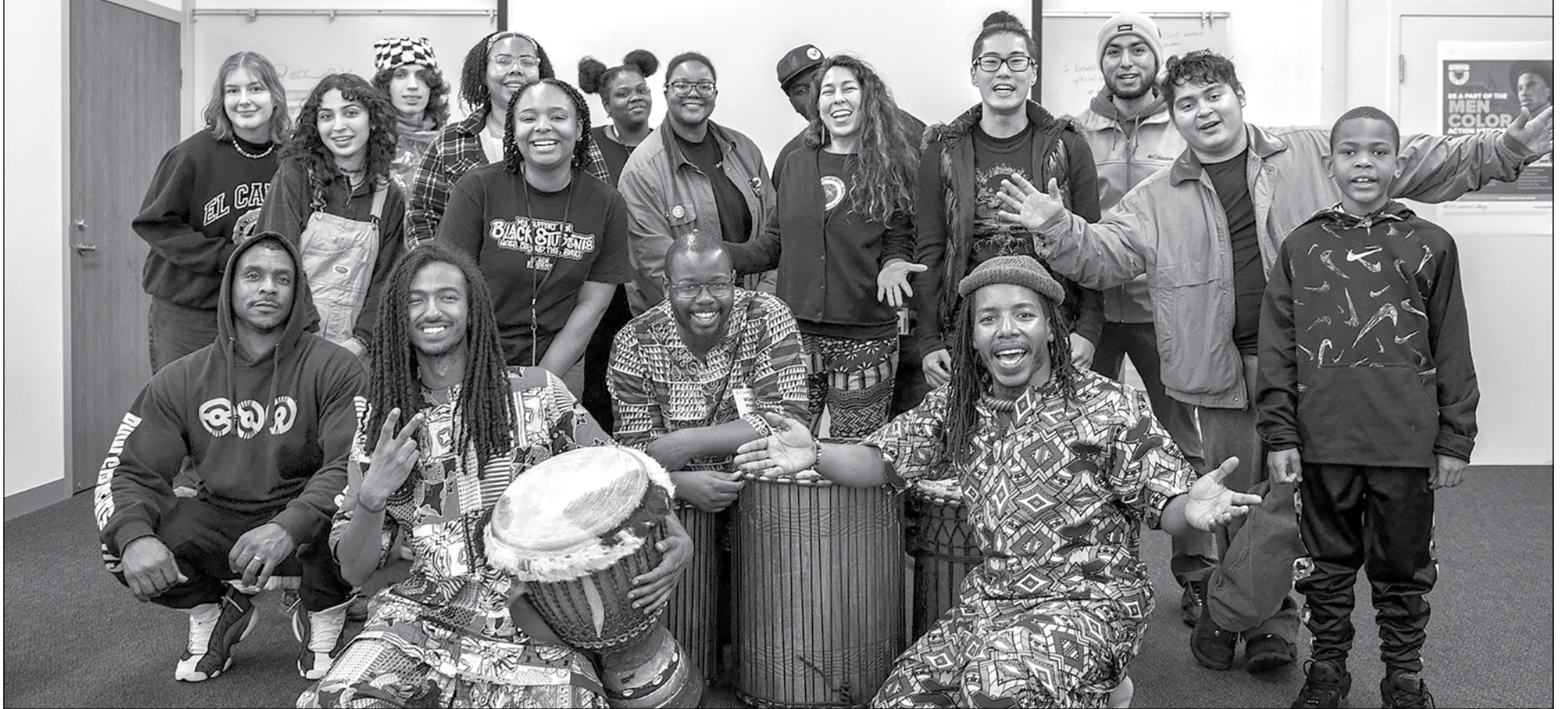
The UC San Diego professor hosted a West African Dance Meditation workshop in the Social Justice Center. Students, faculty and staff braved the weather and moved together as one to the beat of the drums.