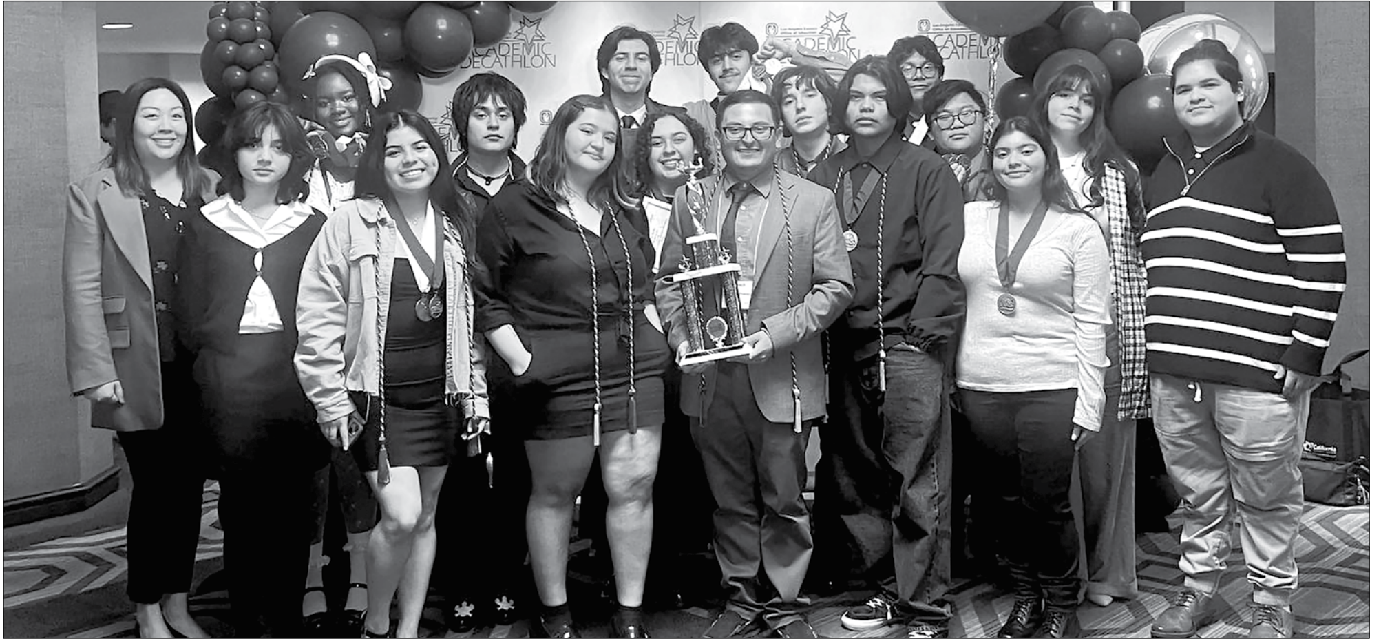
Our decathletes received sixteen individual medals (double from last year) in Essay, Interview, Literature, Mathematics, Music, Science, Social Science, and Speech. Additionally, they placed 1st in our division in the Super Quiz. We are extremely proud of the hard work and achievement of the entire Aca Deca Team. Go Cougars.