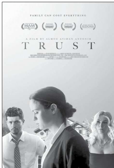
Trust, courtesy Cinemacy.com.