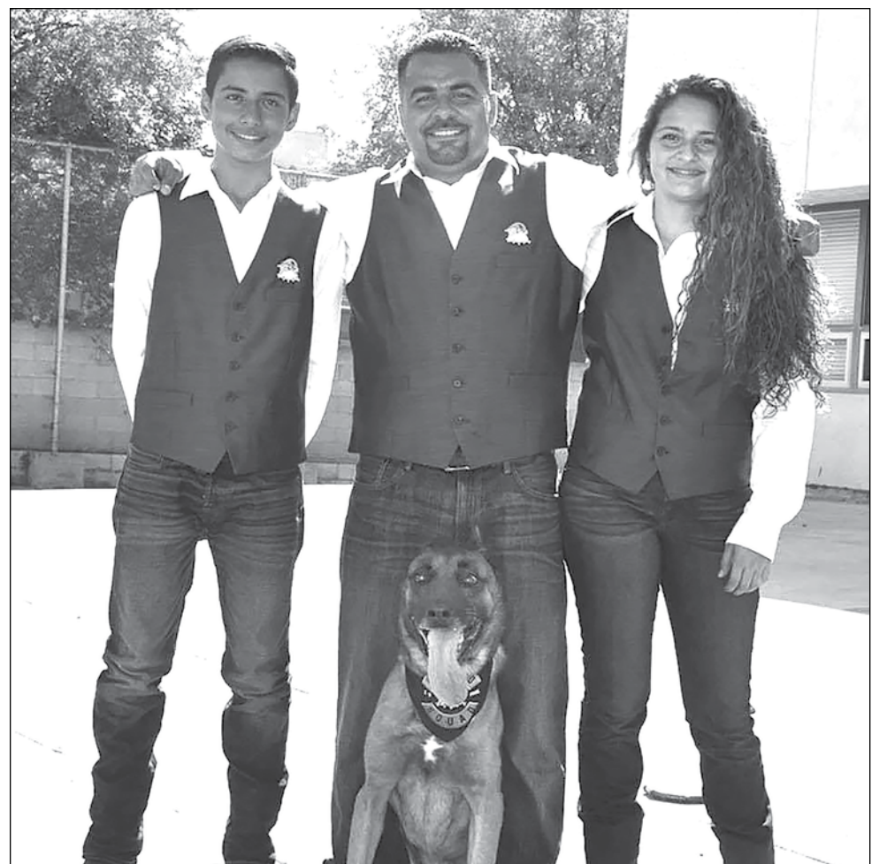
Some of the Family.