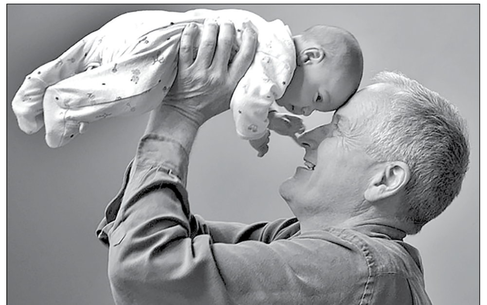
Beloved grandchild.