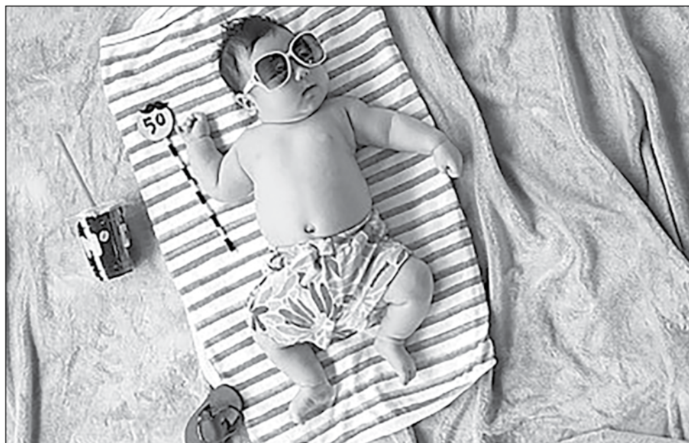
Pampered grandchild.