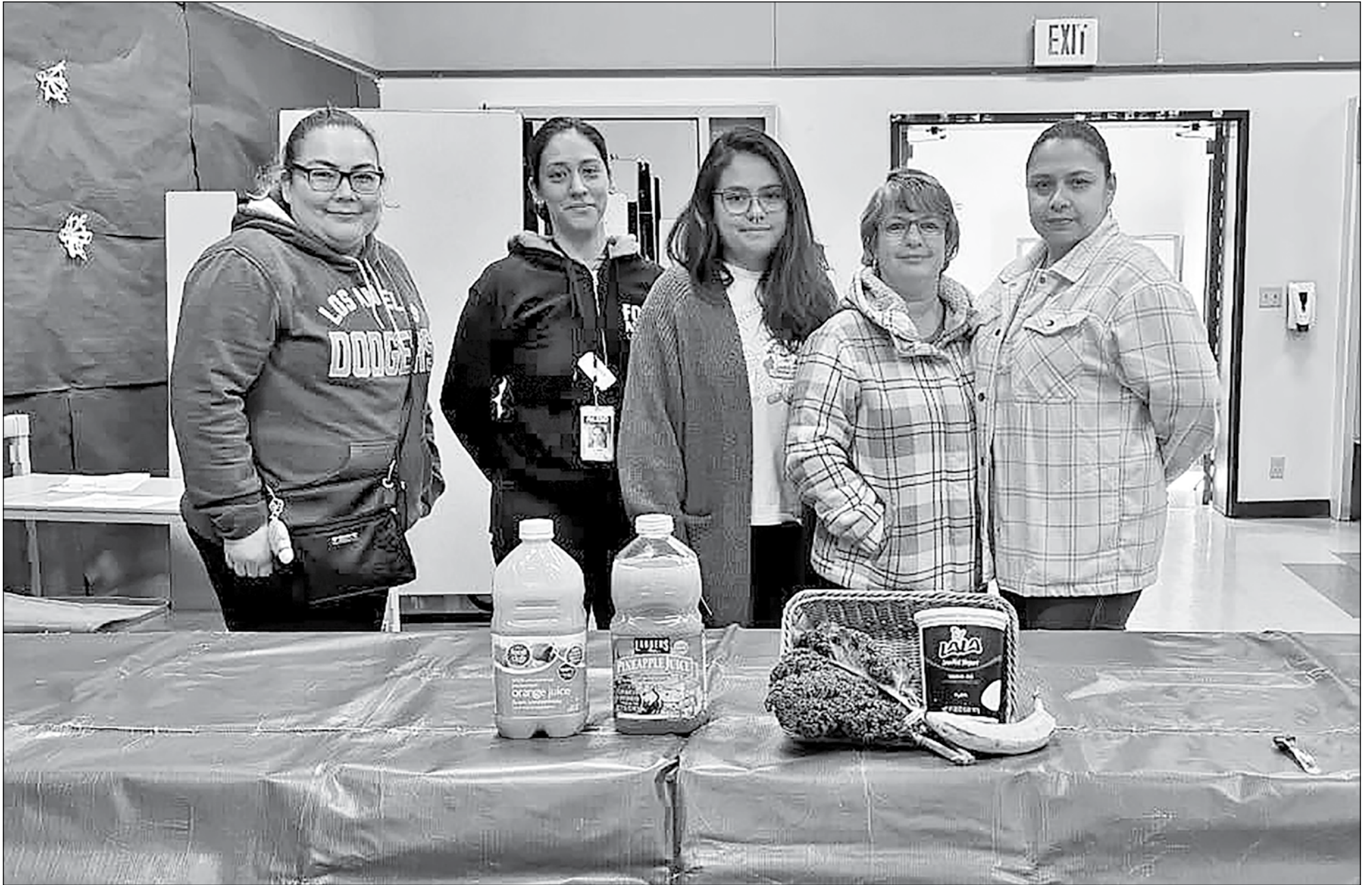
Thank you to our dedicated families for joining us in our nutrition and cooking workshops. Today we sampled a delicious kale and pineapple juice smoothie.