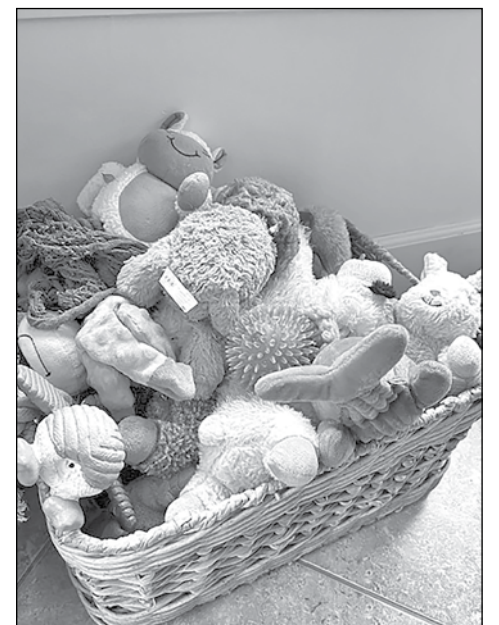
Dog Toys Galore.