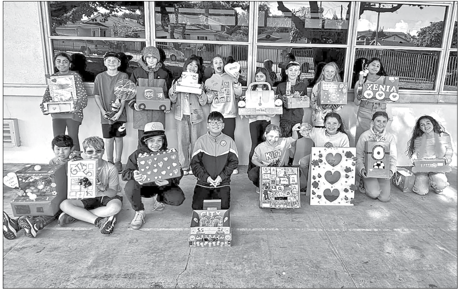
Our 5th graders truly outdid themselves this year with their creative and fun mailbox designs. From classic to comical, recycled to razzle-dazzle, every student brought their A-game.