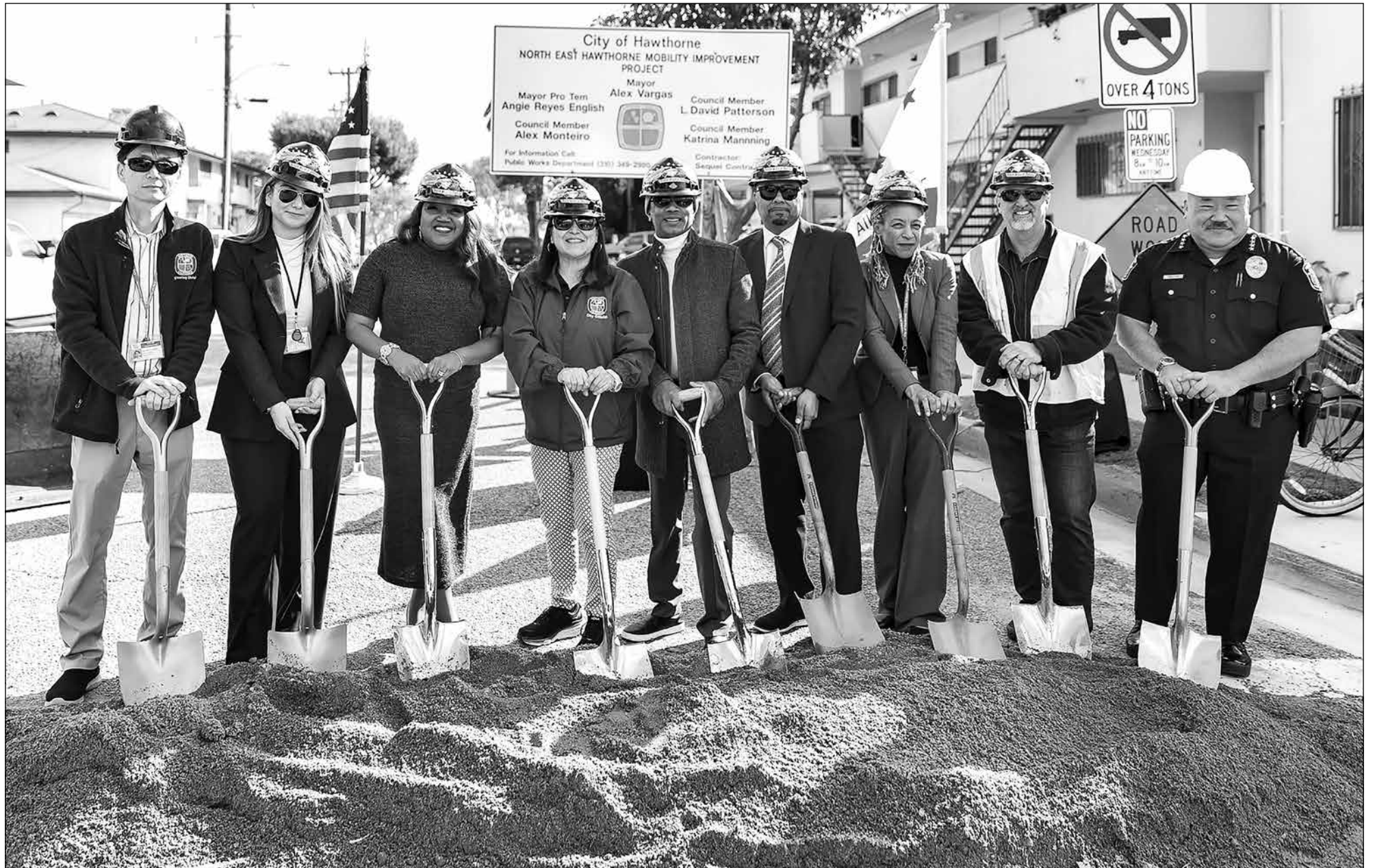
The project takes place on the corner of Birch Avenue and 126th Street. It's funded through the measure M program, and was awarded $2 million dollars for public safety, which includes, widening streets, making driveway improvements and much more. This is one of thirty-two active projects the City is currently working on.