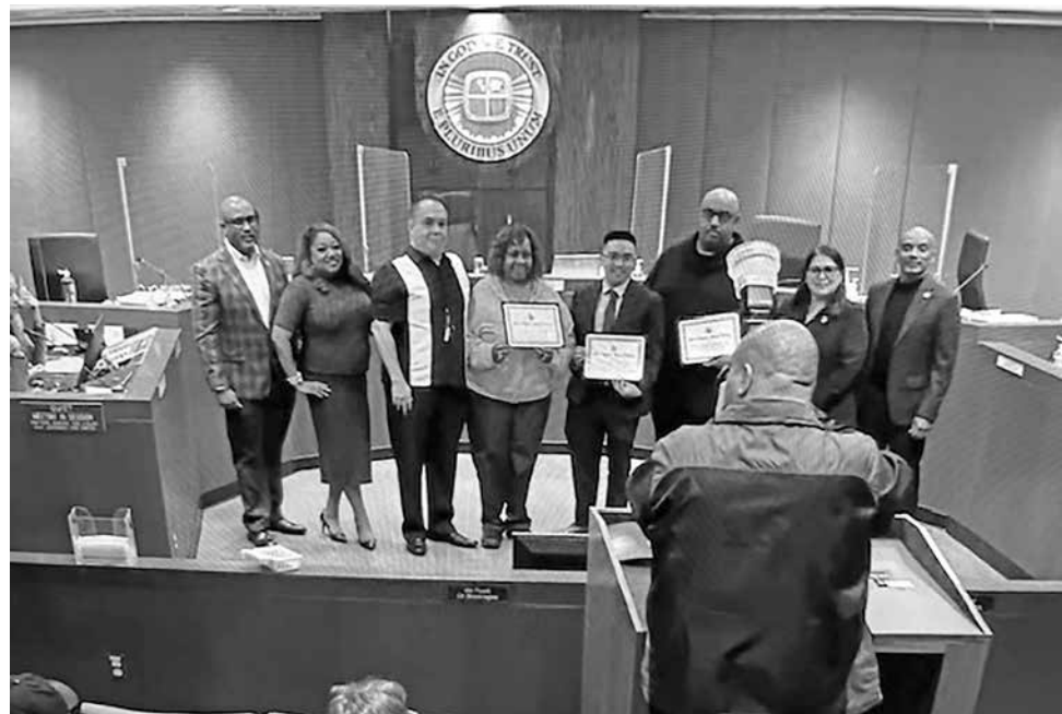
Good Neighbor Award

In closing, another City Council meeting with quite a lot addressed, but as is not uncommon, A great deal of hope arises that Hawthorne's present and its future are both being carefully evaluated and protected. •