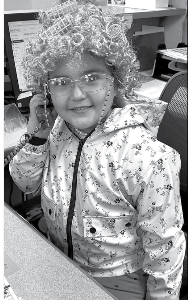
Anderson Elementary Students dressed up as if they were 100 years old to celebrate the 100th day of school.