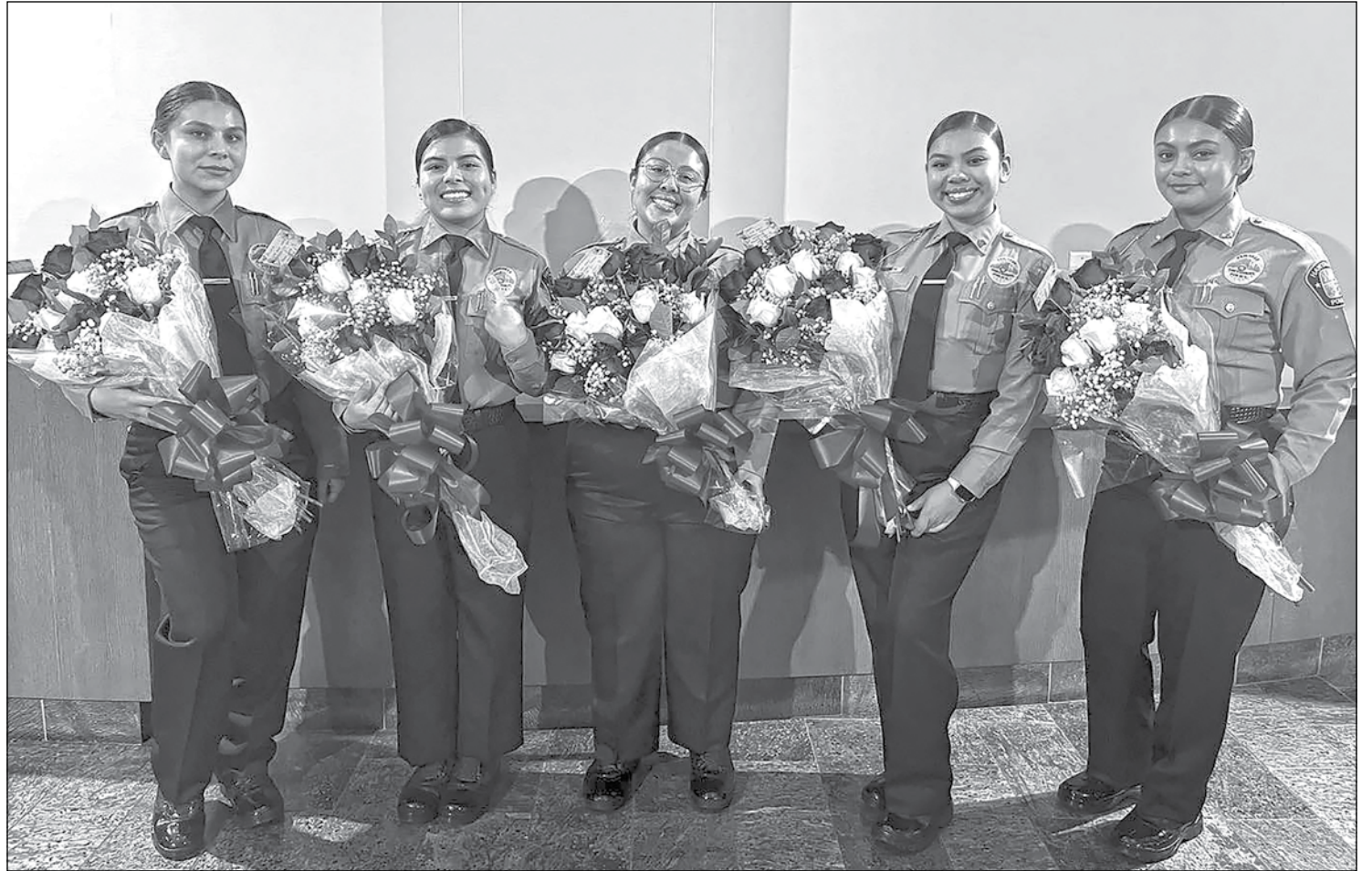
Congratulations to our new Secretary, Corporal, Sergeants, and Lieutenant. Keep striving for the best. We are extremely proud of you.