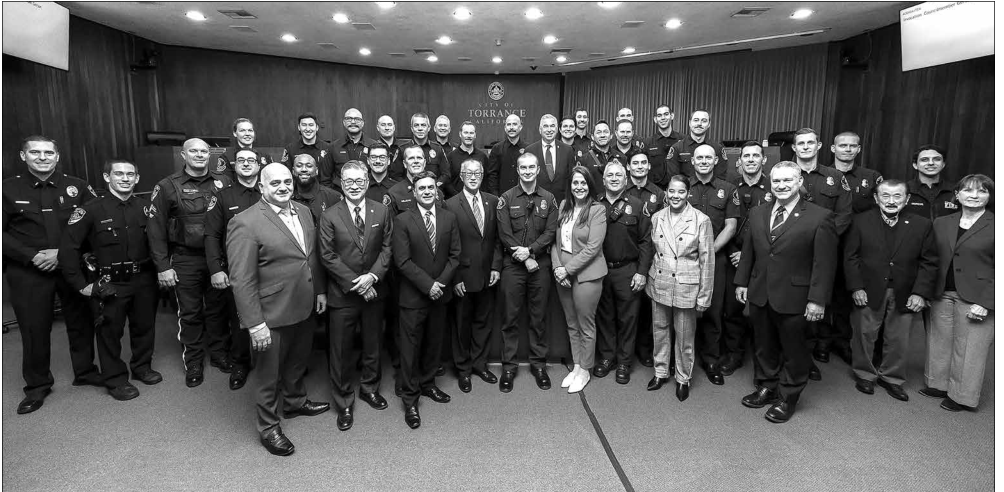
Thank you for joining us at the First Responders Appreciation Event as we honored the incredible members of the Torrance Police Department and Torrance Fire Department. It was heartwarming to see so many greetings, photos, and expressions of gratitude shared throughout the evening.