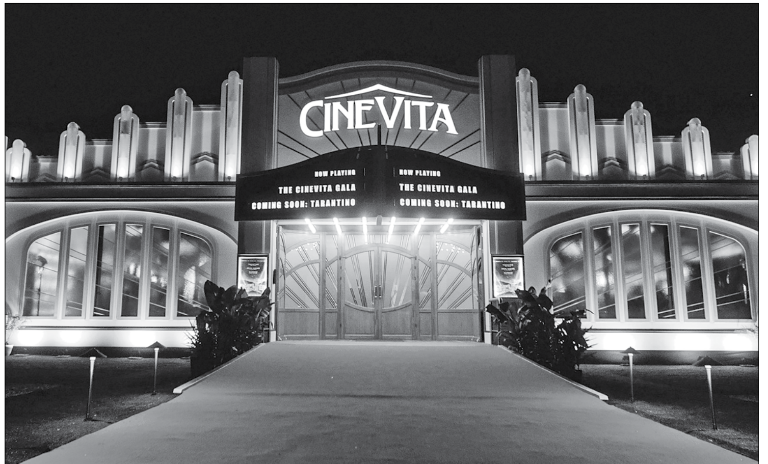
Just steps away from SoFi Stadium, The CineVita will host their first show at Hollywood Park with Tarantino: Pulp Rock. Tarantino's most unforgettable films have legendary soundtracks featuring phenomenal high octane rock hits. Experience them all in one night. No screens, no movies—just pure, electrifying live entertainment. Whether you're a die-hard fan or new to his films, you'll know and love the music. For more information, go to: bit.ly/CineVitaTarantino .