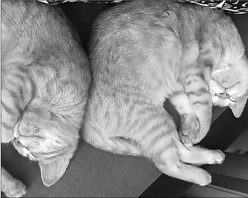
Honey and Pumpkin

Since 1997, Kitten Rescue has rescued cats and kittens from a variety of situations. Young or old, tabby or Siamese, we care for orphaned and abandoned kittens that need to be bottle-fed around the clock, moms with litters, cats that need socialization, and sick or injured animals. When they are finally ready for their forever home, we will help match you with the purr-fect one. When you adopt, you save a life... and in turn enrich your own.