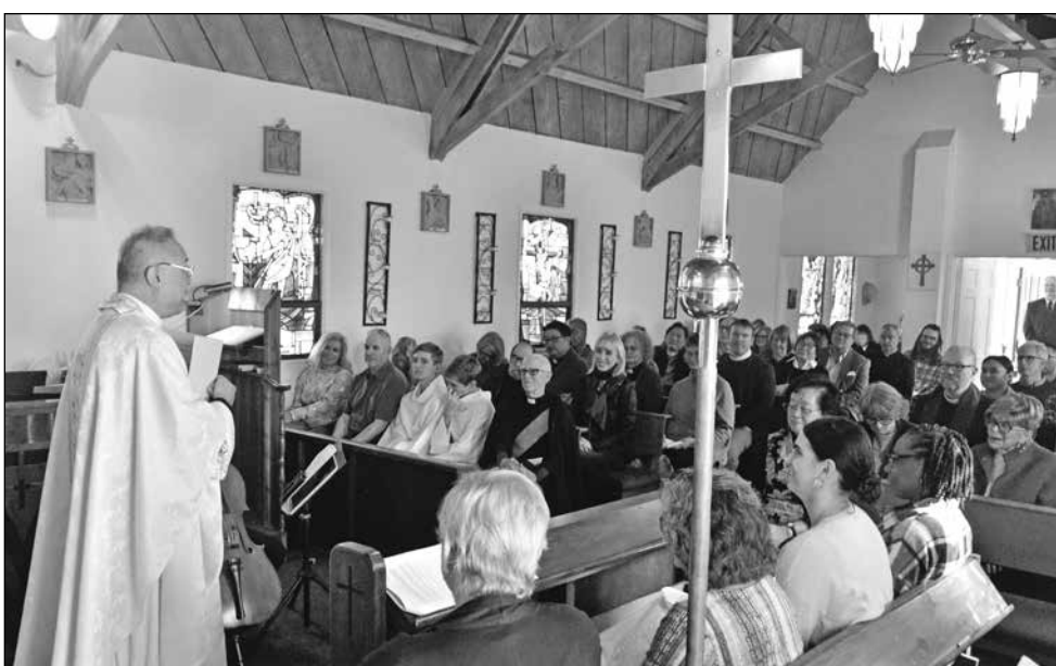
Clergy and parishioners from across the LA Diocese attend the Installation.