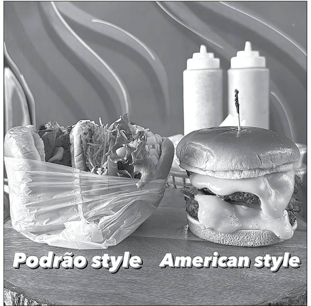
Located in the heart of South Bay, Pedroca's Burguer brings authentic Brazilian flavors to your favorite American classics. From mouth-watering burgers and crispy fries to refreshing açai bowls and tasty appetizers, there's something for everyone. Please support our local businesses.