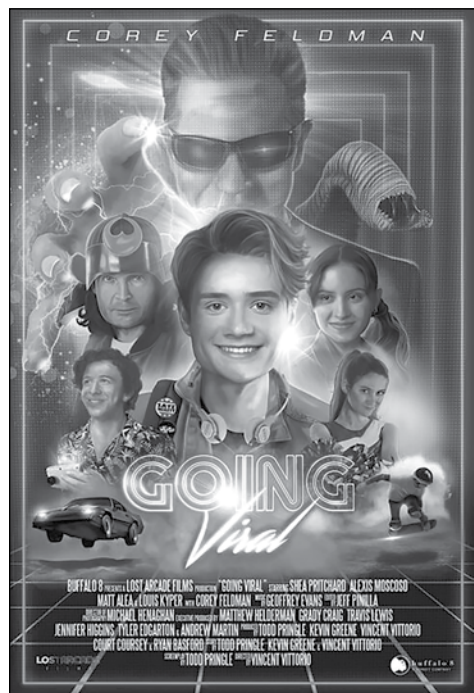
Going Viral.

Imagine Ferris Bueller had a Gen Z desire for influencer fame, and you'll have a good idea of what to expect in Going Viral . Full of heart and sideways ponytails, this vibrant indie film tackles the timeless challenges of self-discovery in the digital age. •