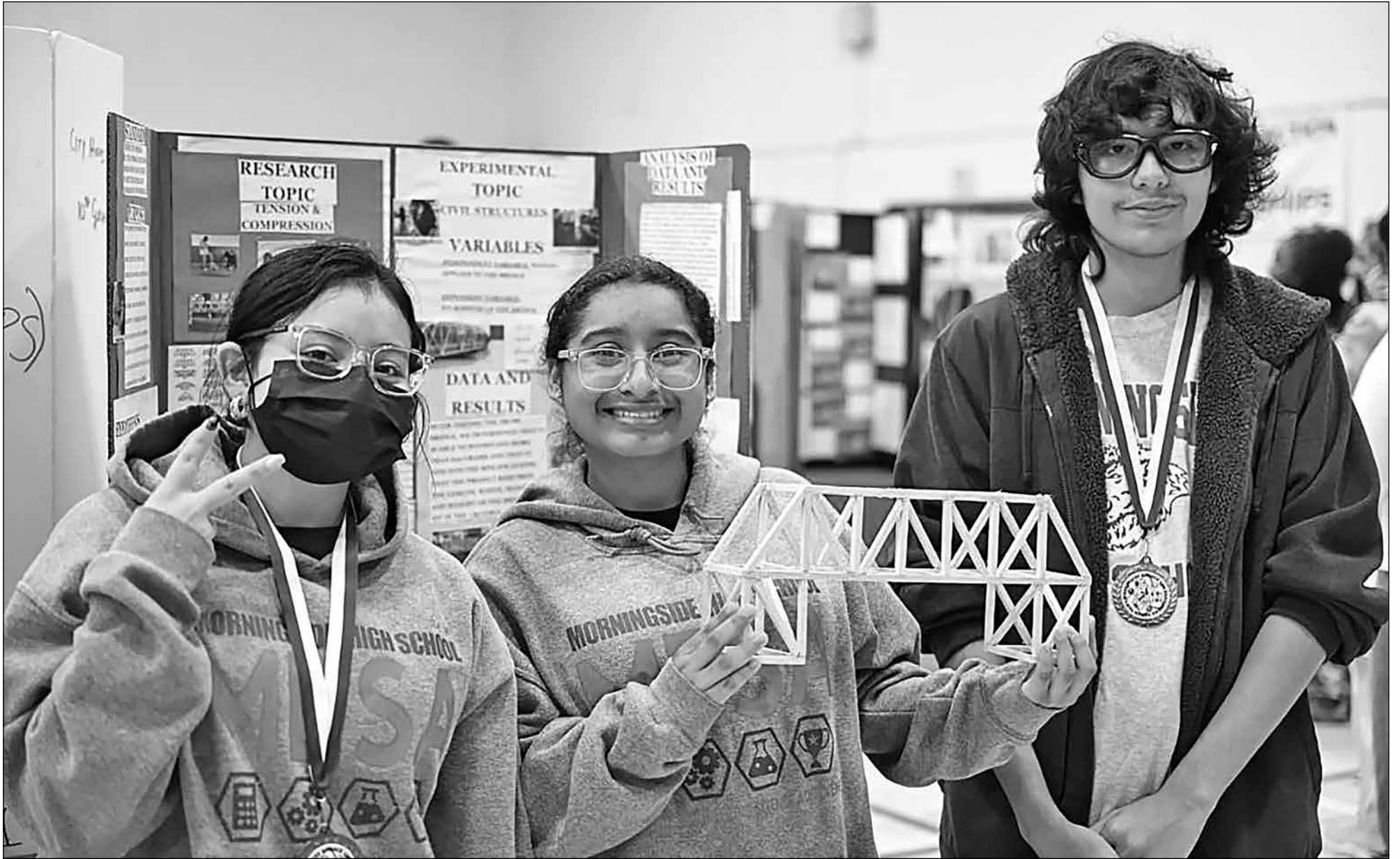
Congratulations to all our student participants and winners of the 2025 Science & Engineering Design Fair.