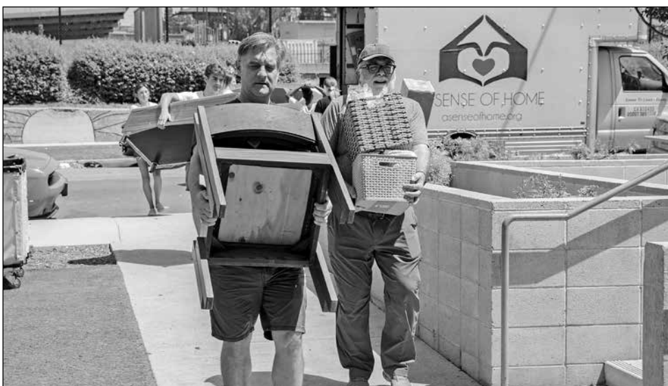
Volunteers carry in boxes of necessities to a new home.

There are many ways to get involved with A Sense of Home—through furniture and home goods donations, monetary gifts, warehouse volunteering, and joining the fun of home creations. The ASOH is small, consisting of only ten people, and is always looking for volunteers to experience the joy of creating a safe and loving home for others. •