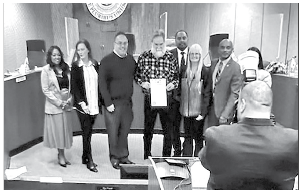
Kudos to "Mr. and Mrs. Claus".