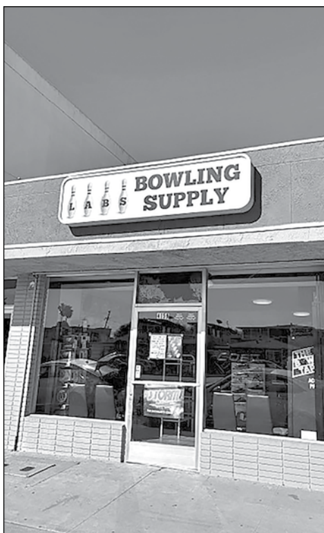
The Lawndale Store.