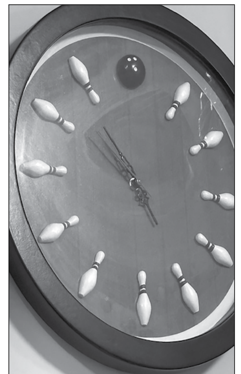
It's Time to Bowl.