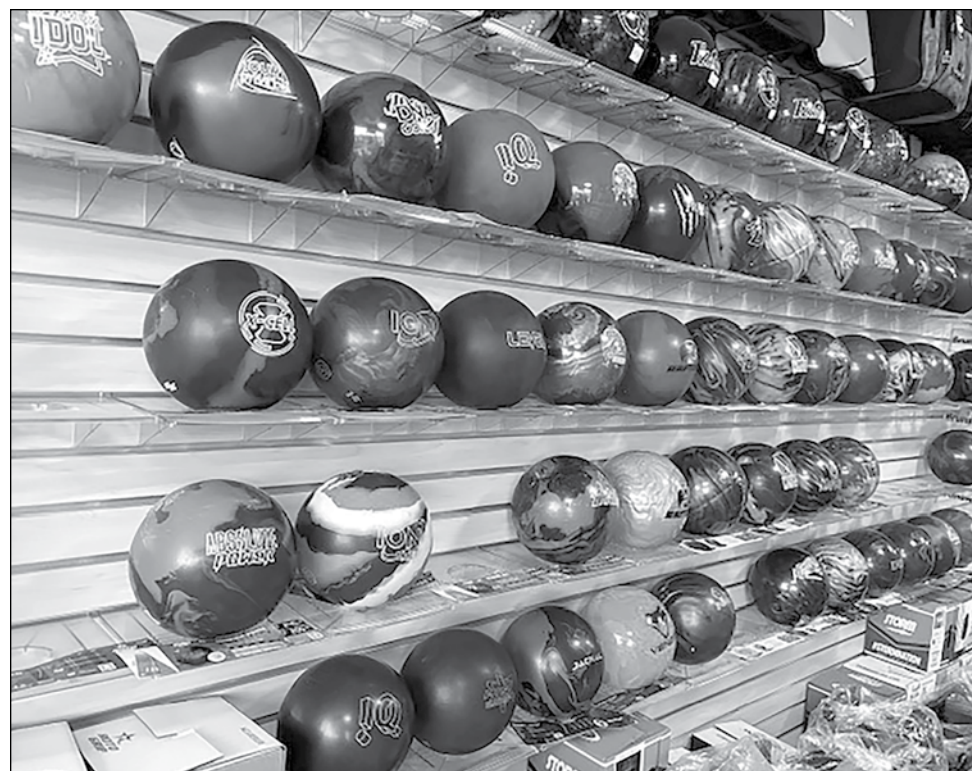
Some of the merchandise.