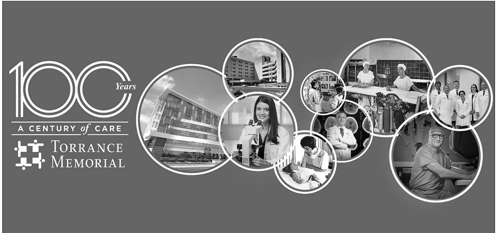
From their humble beginnings as the first hospital in the South Bay to being recognized among the top three percent of hospitals in California, Torrance Memorial has always prioritized the health and well-being of our community. Join us in honoring a century of compassionate care and medical innovation.