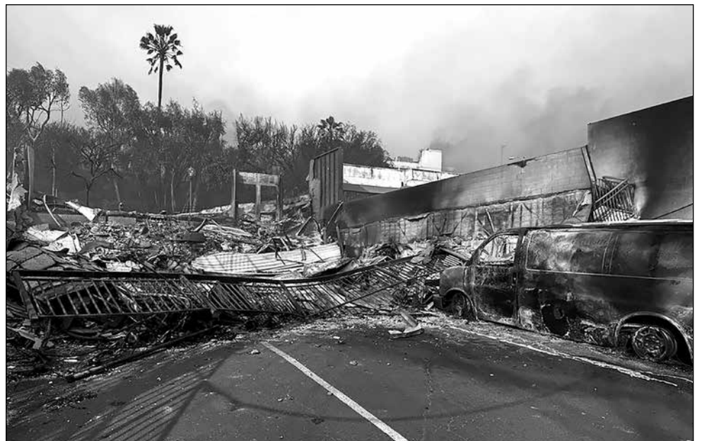
The business completely destroyed.