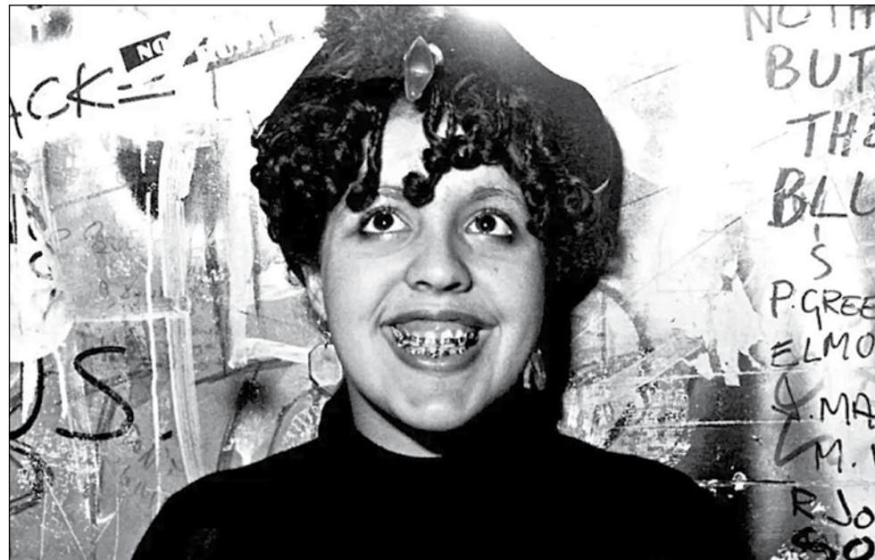
Poly Styrene: I Am a Cliché , courtesy of Utopia.

legacy, her daughter Celeste beautifully pays homage to a perfectly imperfect woman. The documentary acts as a memorial to the feminist trailblazer who proudly rocked braces, embraced her fuller figure, and shaved her head