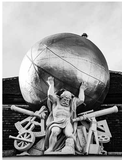
Vienna, Austria: Rest assured, you're in safe hands with Atlas—tickling not advised.

Even in modern times, with our preference for efficiency over splendor, maps have represented the best of our cultures. In the explosion of tourism that followed Napoleon's exit at Waterloo, German and French maps