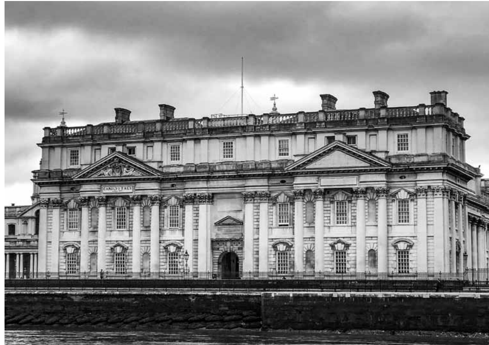
Greenwich, England: Time has to start and end somewhere. If you're British, it might as well be here.