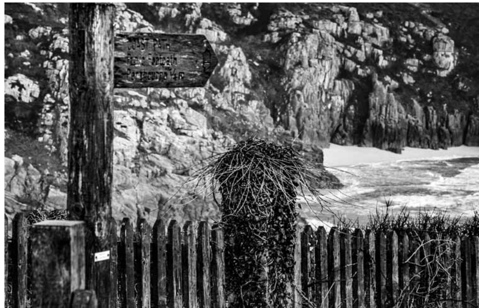
Land's End, Cornwall: Signpost to the edge of a flat world full of waterspouts, whales, and sea monsters.

On the very first morning of our first trip to Mumbai, we awoke for our usual 7AM coffee stroll and left the hotel with Google Maps and iPhone in hand. I'd always wanted to visit the Sassoon Docks, one of the legendary points in the constellation of the ancient