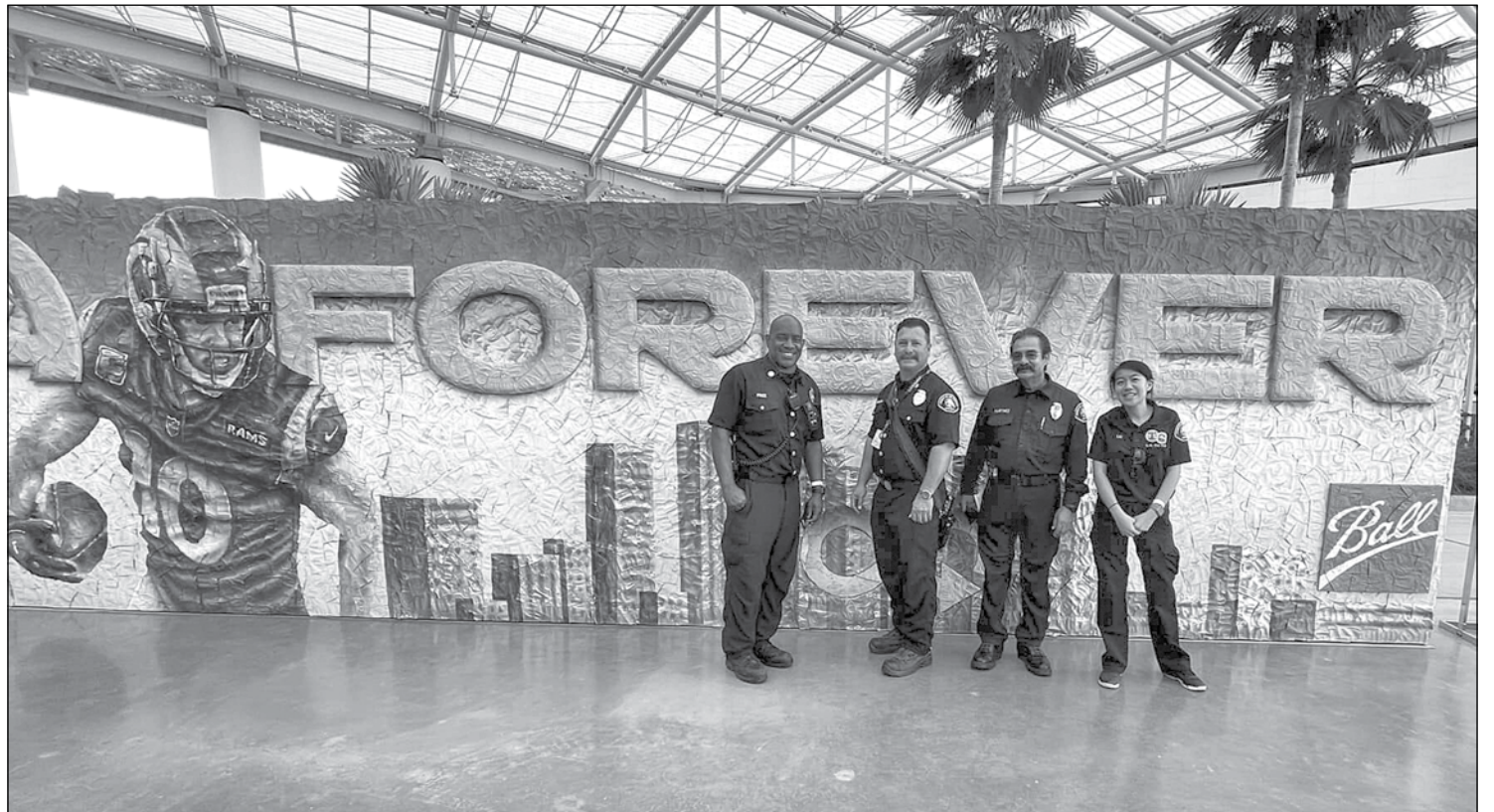
Congratulations to our hometown Los Angeles Rams on their National Football Championship win and advancement to Super Bowl LVI. You got this. One more win at home in SoFi Stadium, our "Rams House."