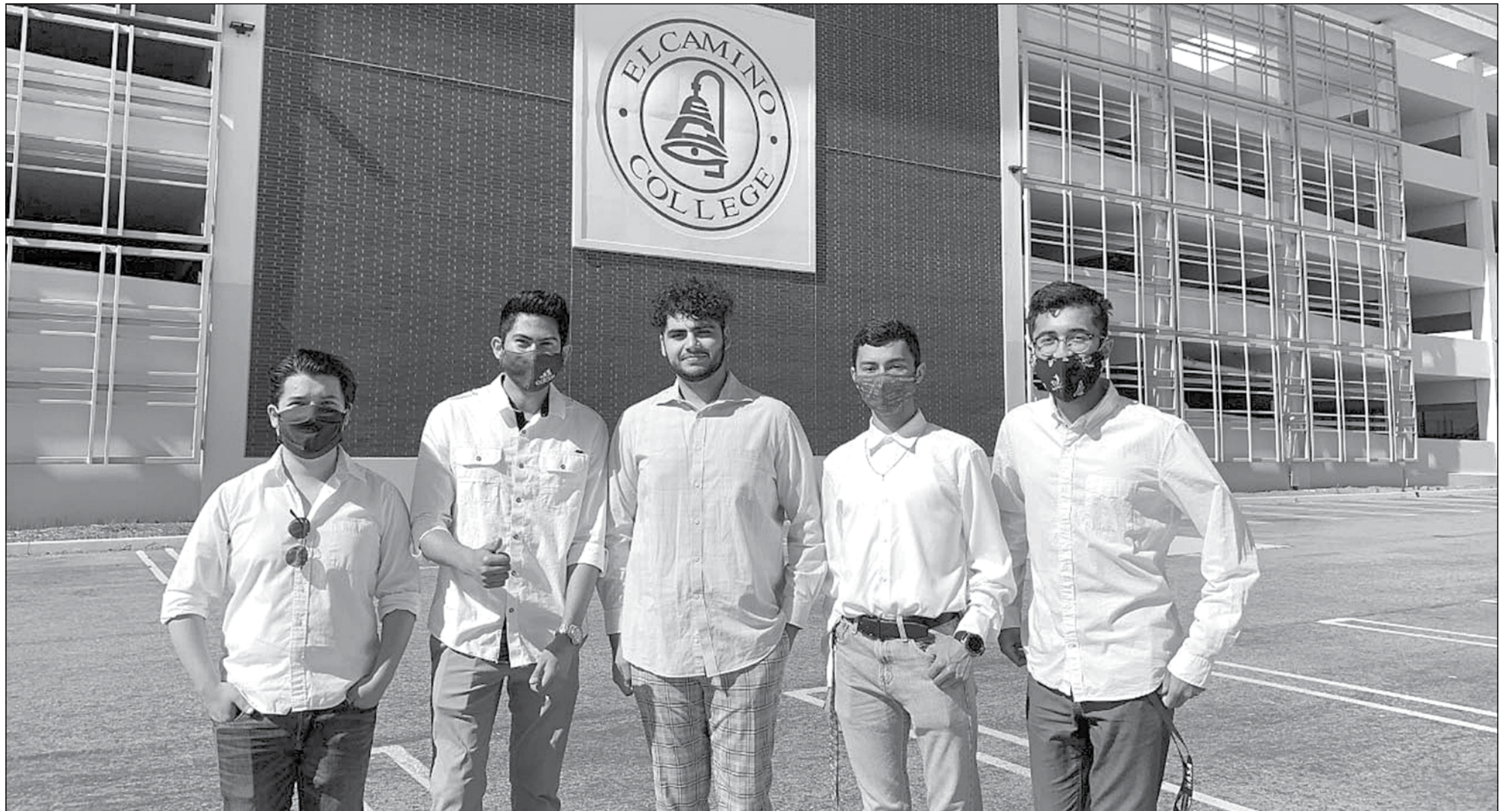
A group of El Camino College STEM students is embracing the challenge of getting a new business off and running, while also pursuing degrees in engineering. Their specialized startup received initial funding from a $5,000 grant awarded from the NASA Minority University Research & Education Project (MUREP) Innovation & Tech Transfer Idea Competition (MITTIC), which challenges teams across the nation to create a product or service using NASA-patented technologies.