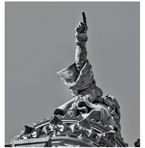
Barcelona, Spain: Columbus points south to the New World and places it... just outside Algeria?