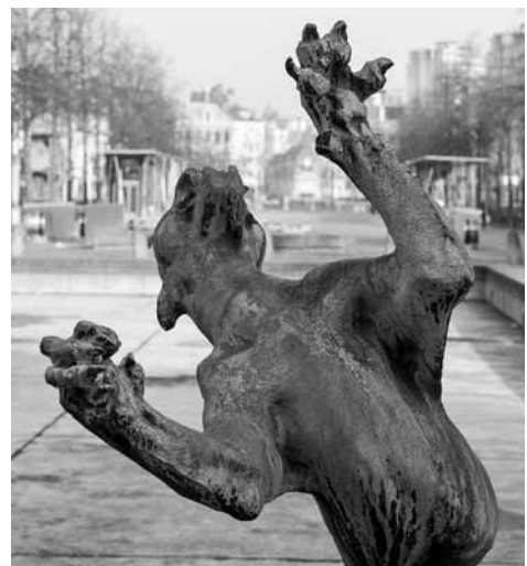
Église Sainte-Catherine de Bruxelles: A demon gushes liquid venom in agony at all our righteousness.