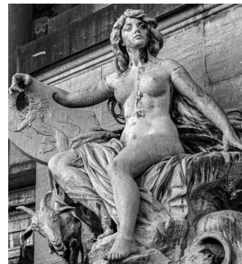
Arc du Cinquantenaire: One King's taste in art, another King's penchant for scandal.