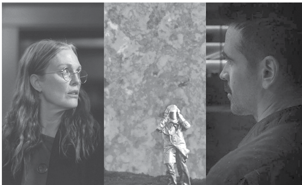
From L-R: When You Finish Saving the World, Fire of Love, After Yang.

With his gifted eye for aesthetics, Kogonada's films are among the most arresting in movies today. His ability to compose beautifully designed, richly crafted shots of environments and the people who inhabit them, makes his