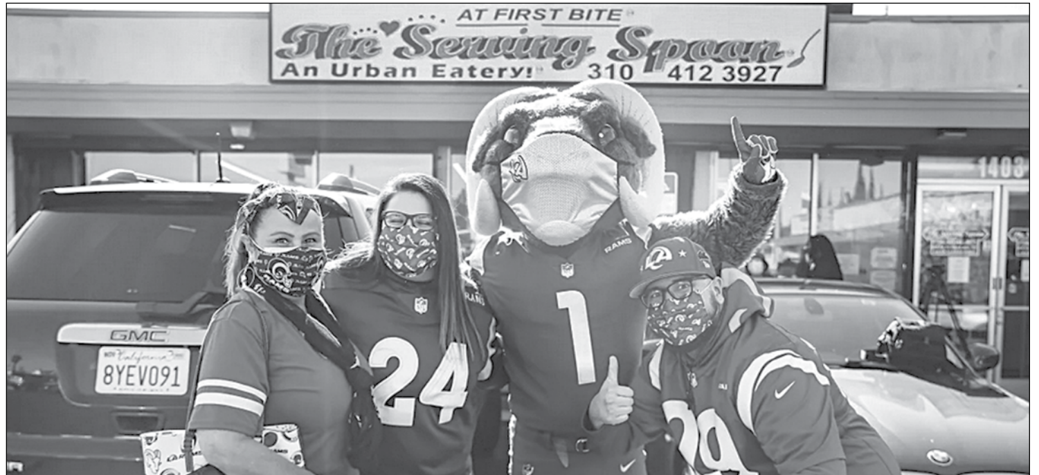
The Los Angeles Rams partnered with Pepsi's "Dig In" program to provide fans with free lunch from the iconic restaurant, The Serving Spoon.