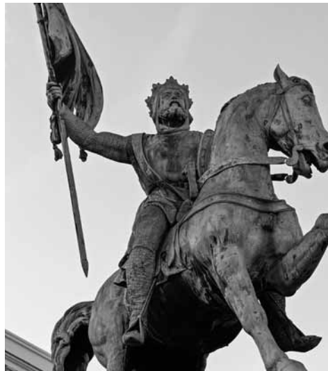
La Place Royale: Godefroy de Bouillon summons the faithful to the First Crusade, then dies in Jerusalem.

In 2000, the US Supreme Court decided an election in part because no one trusted the country to go a day without a sitting govern-