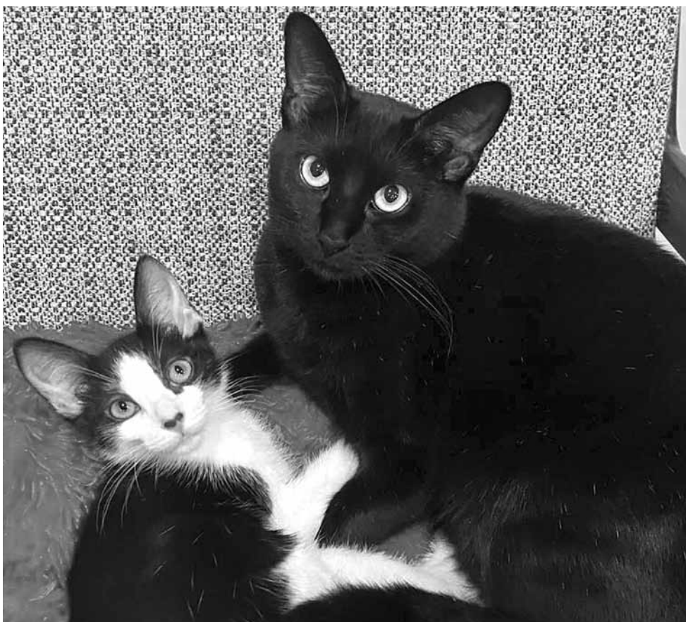
Minnie (left) and Jacques-Pierre

Ready for a double treat? Orange Juice (orange tabby) and Creamsicle (buff tabby) are a bonded pair of teenage brothers. Both are super sweet, affectionate, and outgoing. They are also highly energetic and playful. Bonus feature... they were raised with and love dogs. This handsome duo is looking for a safe and loving home together.