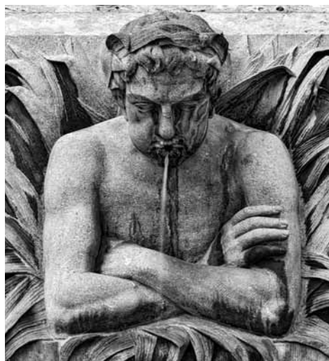
La Rue des Pierres: Le Cracheur spews his opinion of tourists and officials alike.

The guilty secret, of course, is that the flood of money from the Congo turned Bruxelles into one of the most beautiful capitals in the world. The usual monuments and palaces are far less overbearing (and tourist-mobbed) than other European relics—after all, imperial pretensions only travel so far in a tiny populace that treats tax evasion like a second religion. Yet, Bruxelles sports the greenest park network of any capital on the planet, with gorgeous spaces ranging from the geometric Parc Royal and Grand Sablon to sumptuous Botanical Gardens, to the leafy sprawls of le Bois de la Cambre