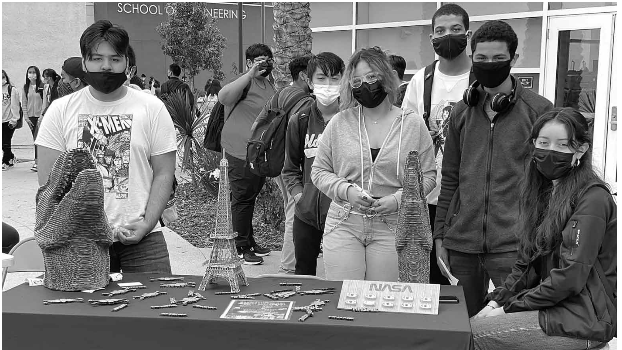
This Thursday, January 27 is our final Enrollment Open House at Hawthorne High School, Lawndale High School & Leuzinger High School from 5-8PM. Come learn about all that our schools have to offer and register onsite. Learn about Academies, Clubs, Programs and Sports. You are not automatically enrolled in high school, you must register for the school of your choice. Join our family CV family.