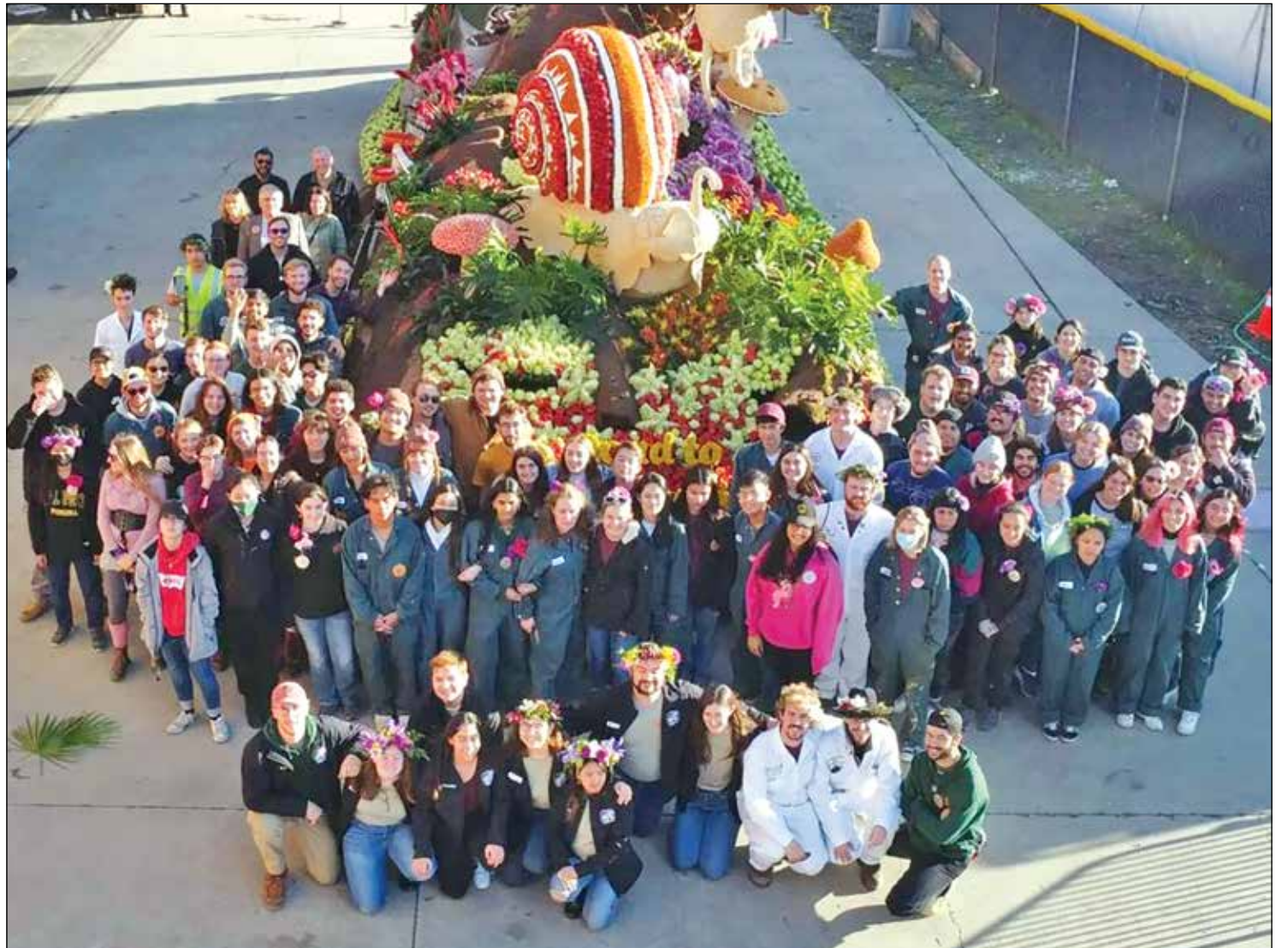
The Cal Poly float team who helped create The Road to Reclamation float in the 2023 Rose Parade. For story see page 3.