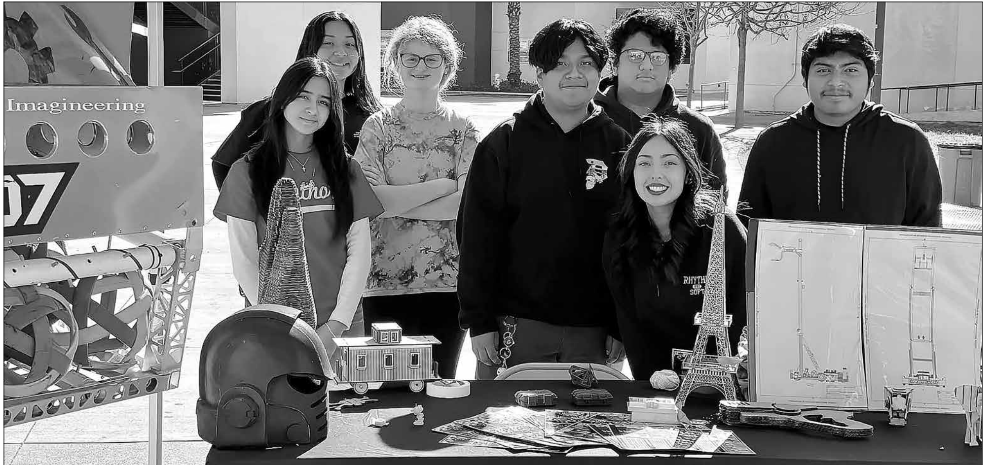
Thank you to the Class of 2027 students who came to our High School Priority Enrollment Fairs. It was so awesome to see our future Cougars, Cardinals and Olympians on campus checking out everything they have to look forward to. And thank you to our amazing staff and students who showed their school pride by working the event and welcoming our future students. Centinela Valley Union High School District.