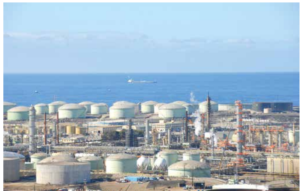
A bird's eye view of Chevron El Segundo.