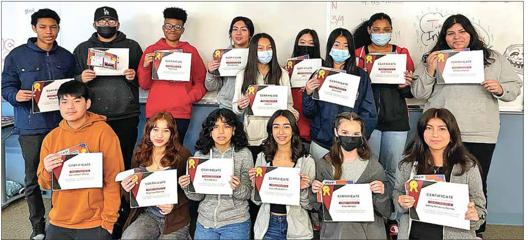
Check out our Scholar Cardinals who worked hard all last semester to increase their Lexile scores. We are very proud of their hard work and dedication. Keep on ROCKin.