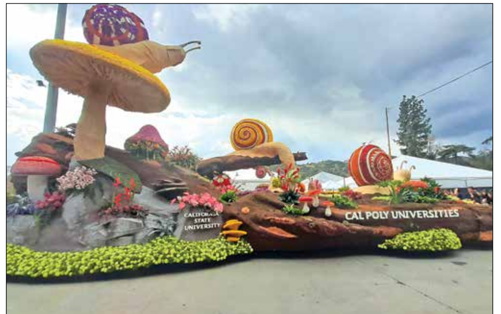
The Road to Reclamation