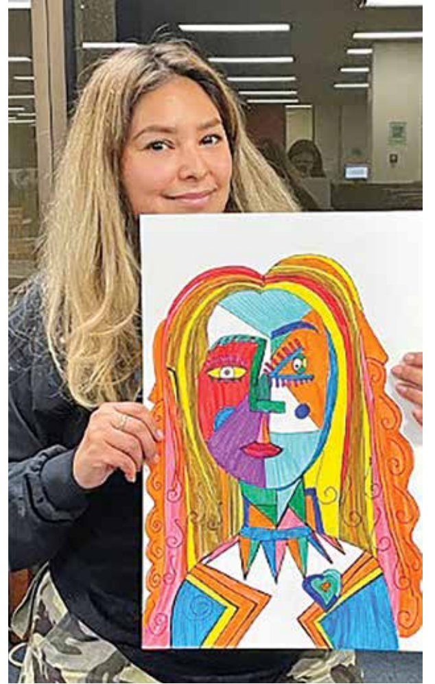
Library patrons had an awesome time creating their Picasso inspired self-portraits. Check out other fun events at the library.