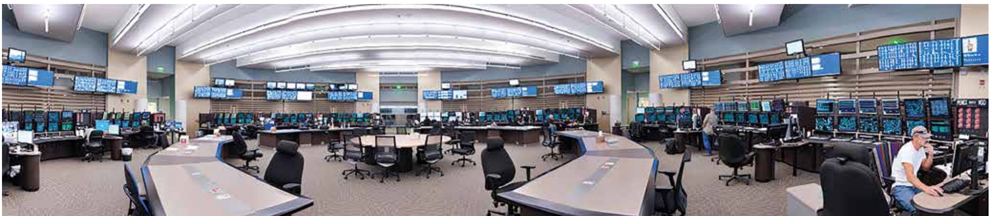
Chevron's NASA-like control center, known as the Refinery Optimization Center(ROC).

ables technology and innovation while still providing safe, reliable service to customers—a win-win. “We have a long tradition of being able to deliver on a corporate level to our shareholders,” he said. And an especially important part of delivering to shareholders involves constantly thinking about how the company’s operations and presence coincide with its neighbors, including El Segundo. As a result, one of the company’s biggest priorities