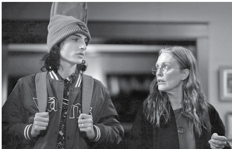
Finn Wolfhard and Julianne Moore in Jesse Eisenberg’s When You Finish Saving the World.

Together, they create a dynamic that’s fiery (a running joke is Ziggy’s demands to not have his parents come into his room when he’s live-streaming, erupting into battle when they do). Once mother and son both slow down and listen to each other, Eisenberg’s film reveals the simple answer of how one can truly “save the world.”