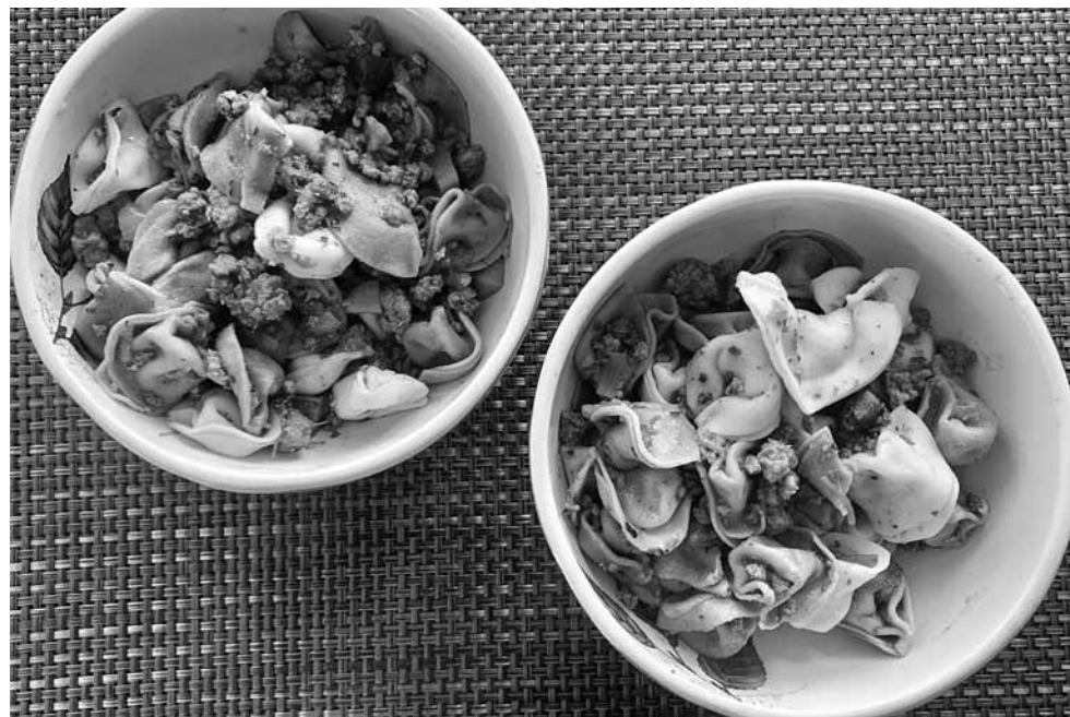
Tuscan sauce over fresh cheese and spinach tortellini.