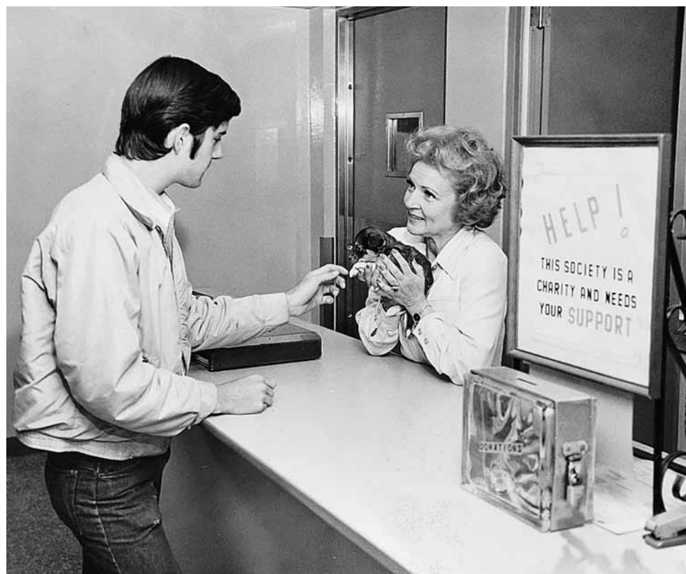
Betty White Charity LA.

This year, on what would have been Betty's 100th Birthday – January 17th – please consider making a special donation in her honor. Your support will help her legacy live on in spcaLA's work to fulfill our mission of preventing cruelty to animals through Intervention, Law Enforcement, Education and Advocacy. spcala.com/donate •