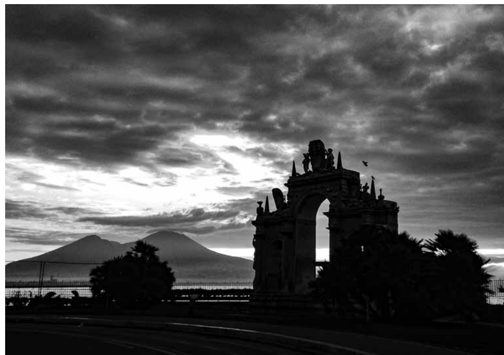
A grumpy Mount Vesuvius at sunset from downtown Naples.

Le Creuset loves to burn tomato paste, so your options are medium heat, constantly watching for 2 hours, or low heat forever. We sometimes make the sauce at night, cooking on low heat for 3 hours, then leave it on the