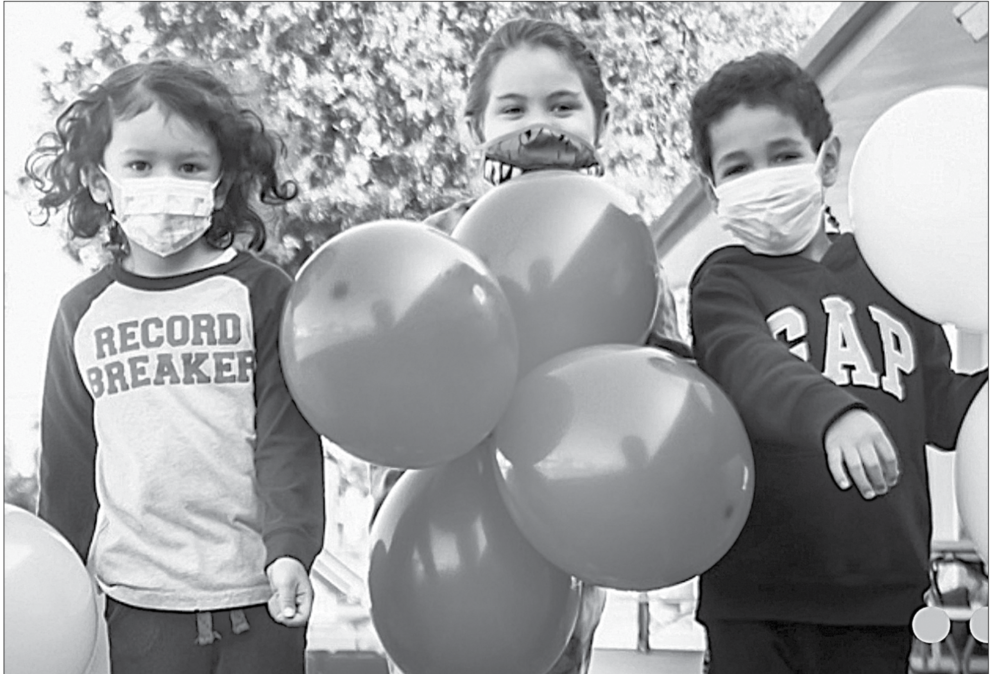
LEAP Preschool is offering specially designed classes for typically developing students ages 3-5 known as Peer Partners. LEAP preschoolers engage in developmentally appropriate activities that integrate STEM and sensory learning in a language rich environment. We are now accepting applications at https://fdr.lawndalesd.net/LEAP . Come learn with us.