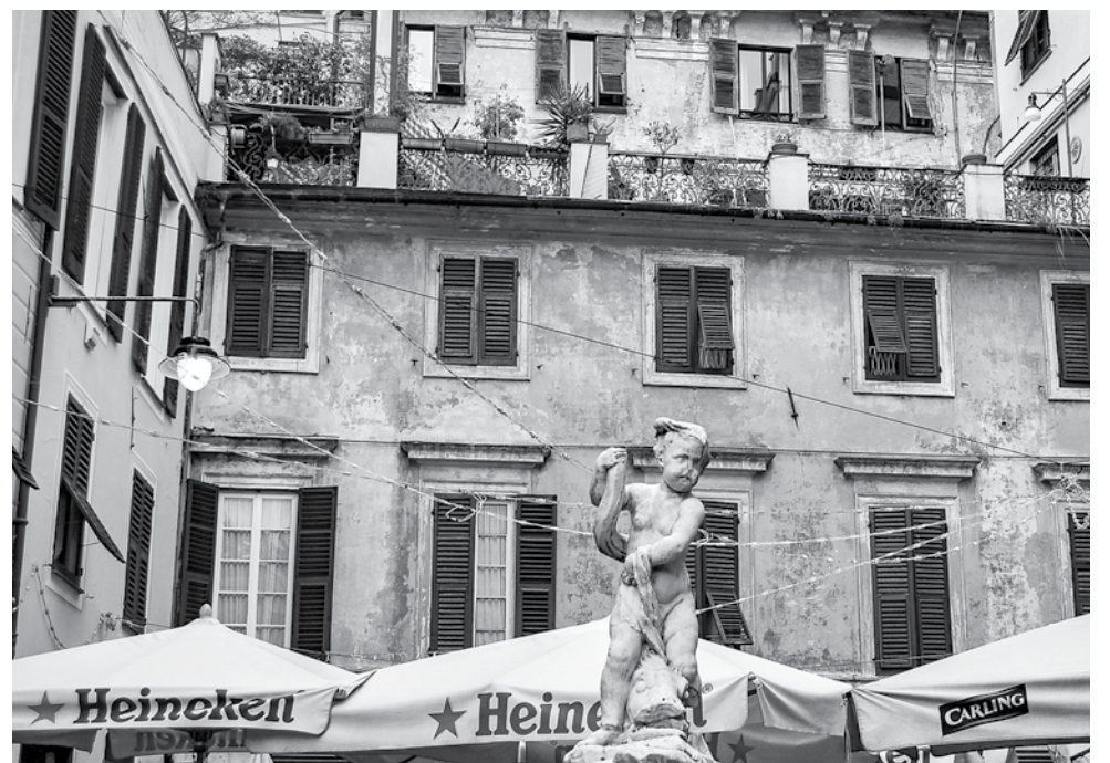
A cherub, a washerwoman's fountain, and a trattoria in a lost corner of Marco Polo's Genoa.