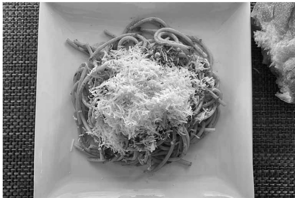
Neapolitan sauce over #12 spaghetti.