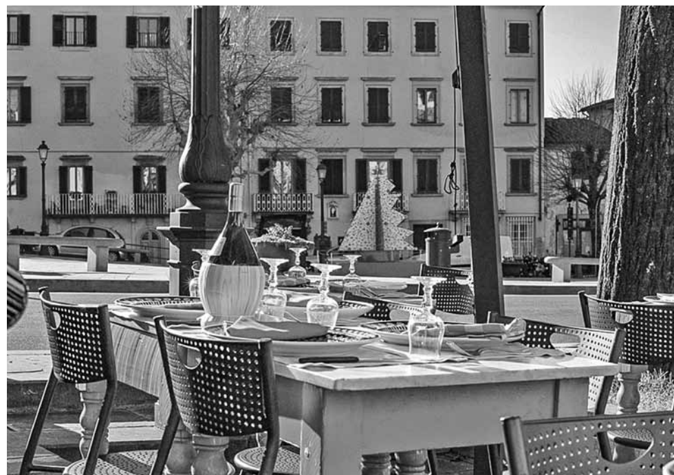
A table and a bottle of Chianti on a summer afternoon in Fiesole above Florence.

Spaghetti is twirled on the fork in the base of your plate. In Italy, if the server offers you a spoon, it's because they expect Americans to ask for one. If you're older than ten years