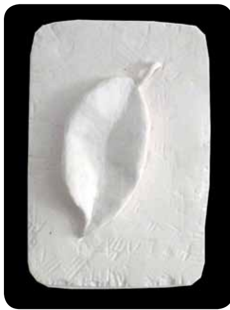
"Black and White" Bas Relief Sculpture by Patty Grau.