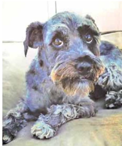
Nixon has had a lot of rehab and is ready for a family.

My name is Nixon and for a youngster, only three years old, my life hasn't been all that delightful. I don't know why my owners were so unkind to me because I really did my best to be good. They never spent much time loving me or caring for me. I was never brushed or groomed so I was always a matted mess. Then they finally decided to drop me off at a shelter and they just walked away without a second glance. Because I was so matted I had to be shaved down after pictures were taken for the neglect case I was involved in. Can you blame me for being fearful of people when the little contact I had was all abuse? Thankfully the MSFR folks rescued me, got me some help and with lots of love and TLC, I'm finally back to my friendly, trusting self and looking for my forever home. I'm 15 pounds of love and devotion just looking for the right family