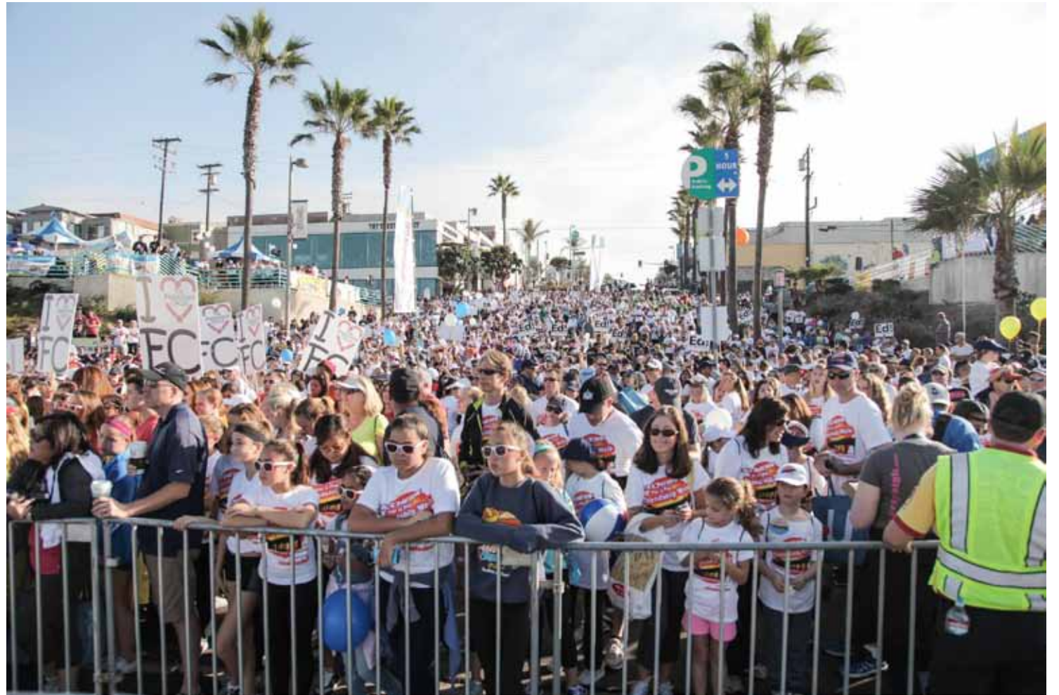
The crowd at the 2014 Skechers Pier to Pier Friendship Walk. The 2015 Friendship Walk, which benefits the Friendship Circle, a nonprofit organization for children with disabilities, will be held on October 27, 2015. To register or find out more, visit skechersfriendshipwalk.com.