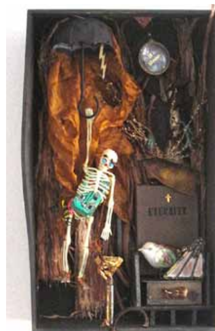
"10 Minutes to Eternity" Assemblage Sculpture by Patty Grau.

Art Center in Redondo Beach that will enhance the lives of South Bay residents, visitors and businesses.