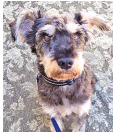
Shermy loves people and is a lot of fun.

My name is Shermy and I'm a four-year old male purebred Miniature Schnauzer. I arrived at the IE (Inland Empire) shelter as