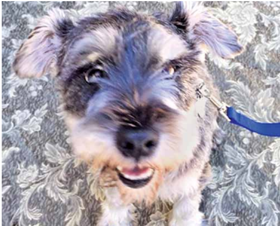
Stewie has had a hard life and needs some love.

We are looking for volunteers to help with our pet adoption fairs which are held every Saturday at the Petco located at 537 N. Pacific Coast Highway Redondo Beach 90277, from noon-3: 30 p.m. If you are interested in volunteering and can commit to at least one Saturday a month, please contact us at info@msfr.org . You can also visit all of our Miniature Schnauzers & Friends rescues at the adoption fair or check out our website, www.msfr.org . If you have any questions about a particular dog's availability you can email us at info@msfr.org . Schnauzers! Bet you can't adopt just one!