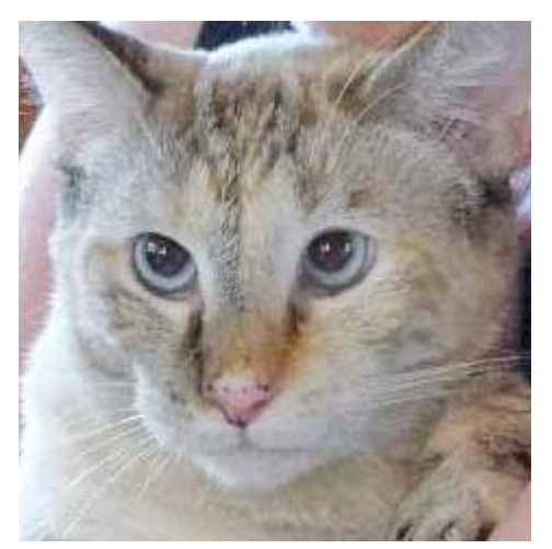
Mae Mae is still a kitten who loves to pounce!

These kitties are available for adoption through Kitten Rescue, one of the largest cat rescue groups in Southern California. All of our kitties are spayed/neutered, microchipped, tested for FeLV and FIV, dewormed and current on their vaccinations. For additional information and to see these or our other kittens and cats, please check our website