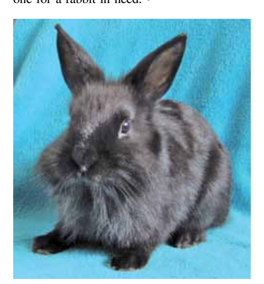
Bella has very good manners.

Bon Bon is a very intelligent rabbit who needs human attention. (3) charitable organization that is run by unpaid volunteers. Monetary donations to Los Angeles Rabbit Foundation can be made thru PayPal on their website or mail a check to "Los Angeles Rabbit Foundation," P.O. Box 252124, Los Angeles, CA 90025. Make this year a positive one for a rabbit in need. •