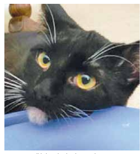
Margot is a well-behaved girl with a tuxedo coat.

www.kittenrescue.org or email us at mail@ kittenrescue.org. Your tax deductible donations for the rescue and care of our cats and kittens can be made through our website or by sending a check payable to Kitten Rescue, 914 Westwood Blvd. #583, Los Angeles, CA 90024.