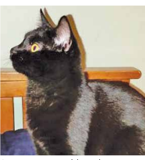
Genevieve enjoys attention and playing with toys.

Margot is a sweet kitten full of sugar and spice and everything nice. With her beautiful tuxedo coat, four white paws and round golden eyes, she is growing into a lovely little kitty. Margot enjoys being on your lap to have her back and shoulders rubbed while she resonates a continuous purr. She is an active girl who will jump in the air for her favorite toy on a string or play with her balls. Ready for attention, Margot lies at your side, and then paws gently at you, so happy to just to be with you. She is submissive with other cats, yet she can hold her own during playtime. Margot has excellent litter box manners and loves to use her cardboard