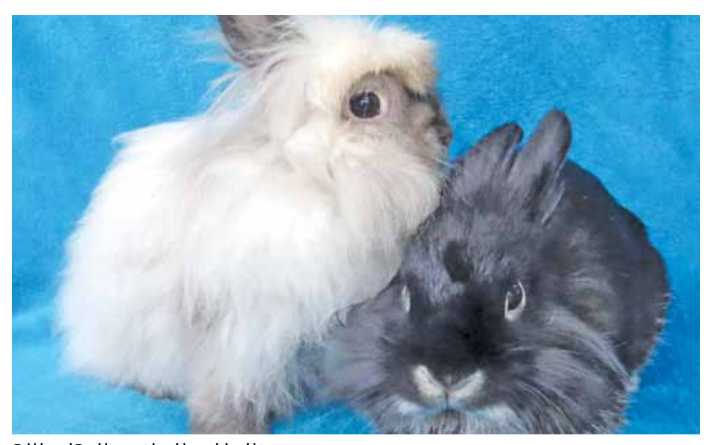
Tribble and Trouble are girl-and-boy adult rabbits.

Are you thinking of celebrating this spring by bringing home a pet rabbit? Before you buy a bunny from a pet store, think about this: On the list, rabbits are the #3 most often abandoned pet and #3 most often "put to sleep" in animal shelters in the U.S.