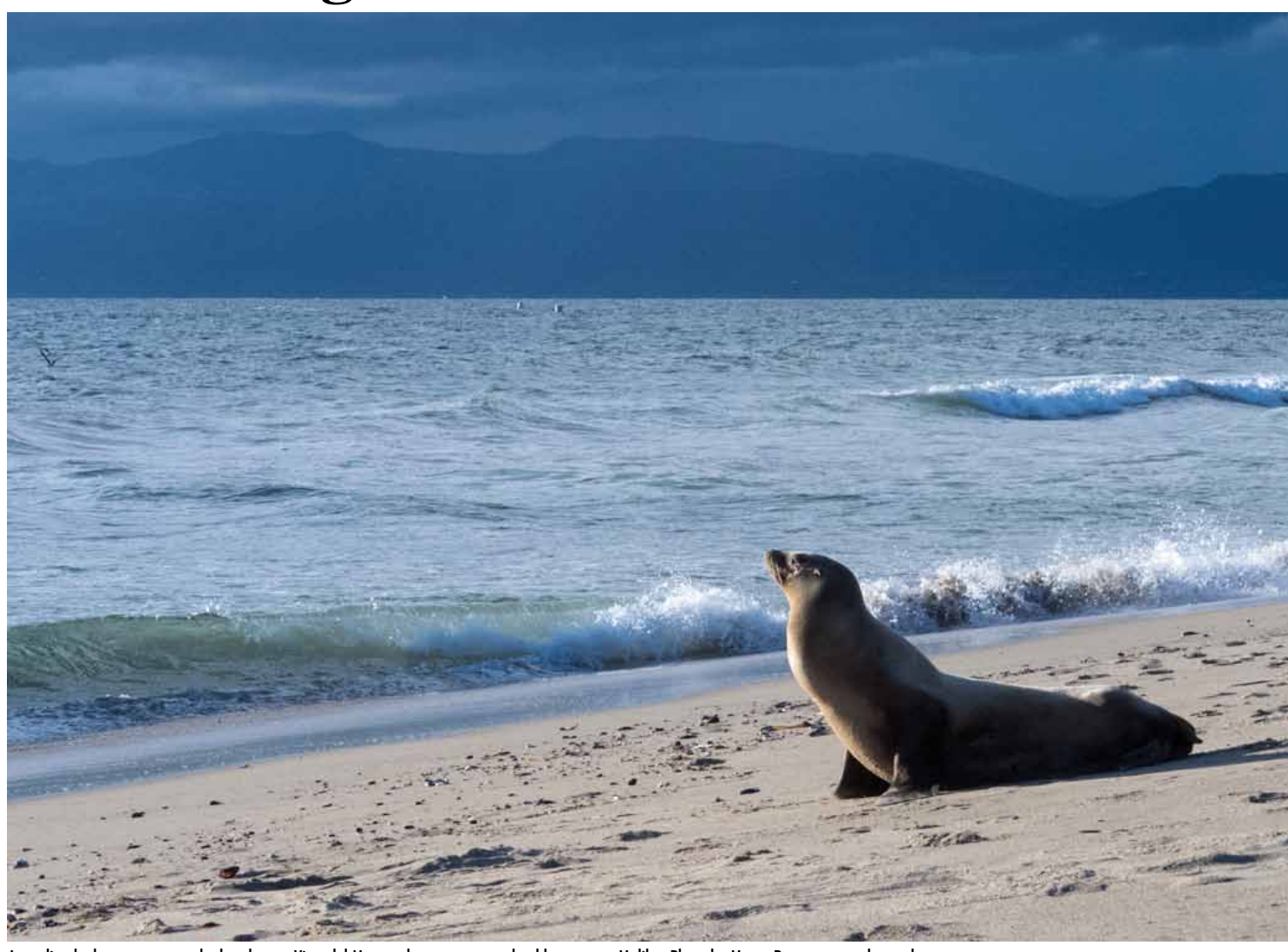
A sea lion looks out to sea at the beach near Vista del Mar, as the recent stormcloud hangs over Malibu.