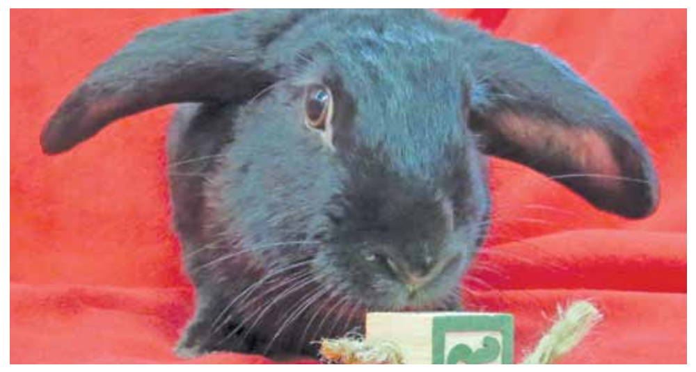
Sydney is a Lop blend bunny.