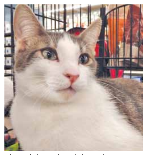
Ashton is a high-energy kitten who loves to play.

Looking for your purr-fect match? Kitties of every color and size are waiting to meet you.