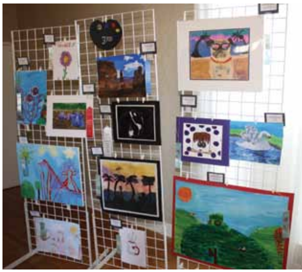
Student art contest entries from the 2015 Neptunian's annual student art contest.

Students must attend a Manhattan Beach school and must submit through their school office. An awards ceremony will be held on Sunday, March 8, 2015 at