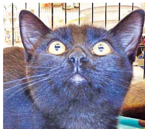
Genvieve is soft and cuddly.

On Saturdays, we have adoptions from noon to 3:30 p.m. in Westchester at 8655 Lincoln Blvd. just south of Manchester Ave. and also in Mar Vista at 3860 Centinela Ave. just south of Venice Boulevard. Our website lists additional adoption sites and directions to each location. •