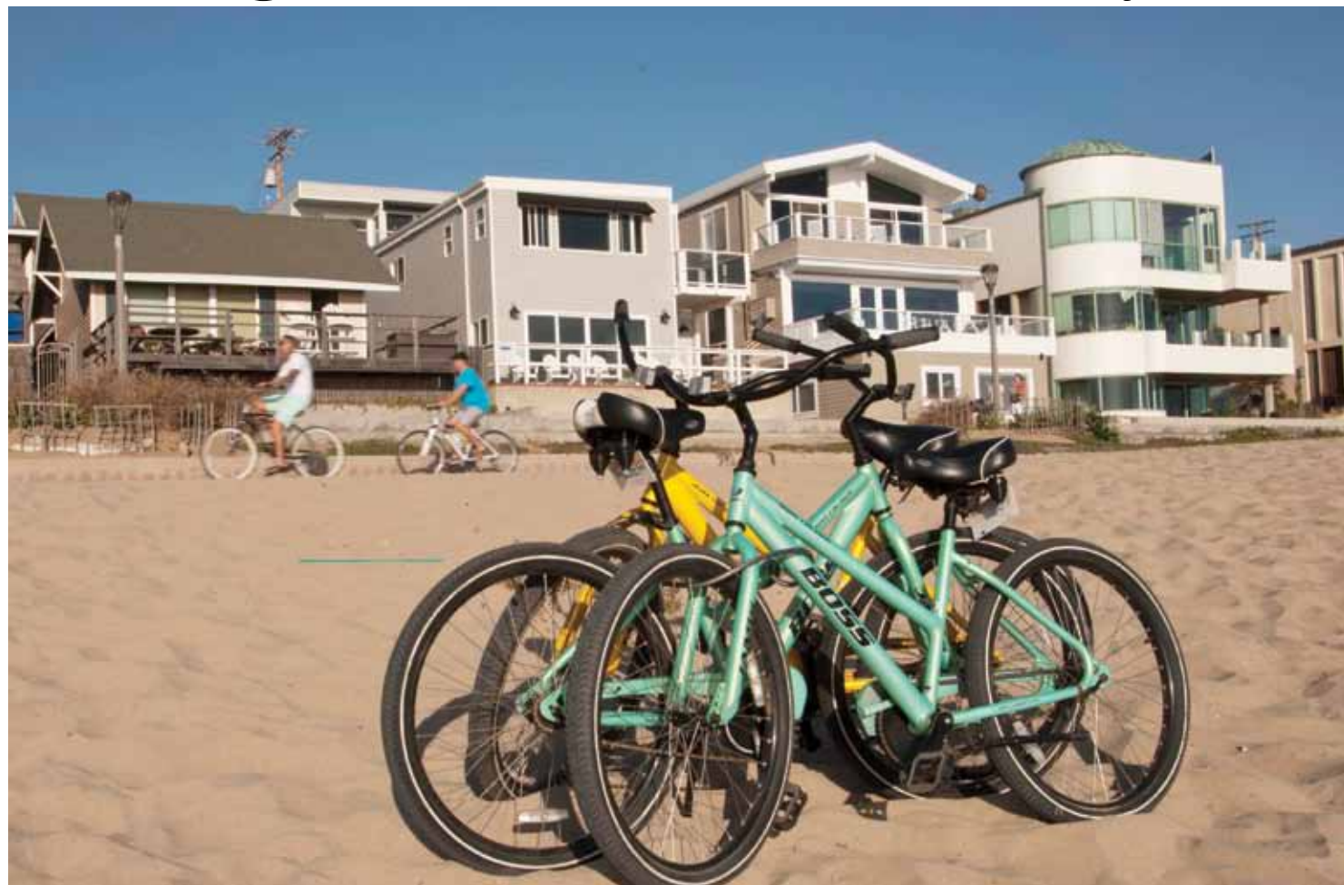
Two bikes sit chained up on the Strand, waiting for their owners to come back and resume riding.