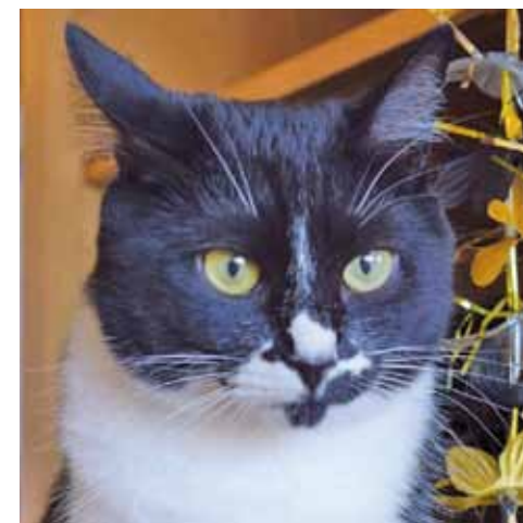
Connie is confident and curious.

Minkus is a not-quite 3-year-old orange tabby who can be a little shy, but is very snuggly and affectionate when he gets to know you. Once he knows you're his buddy, he asks for belly and chin rubs. He's used to living both alone and with another cat. As far as dogs go, he hasn't spent much time around them and he gets a little nervous/shy. He's very playful and loves wands, anything that rolls, and anything that dangles. Sunny spots are his favorite when he's feeling brave, and closets or blankets are his favorite spots when he's scared. Minkus will thrive in a calm,