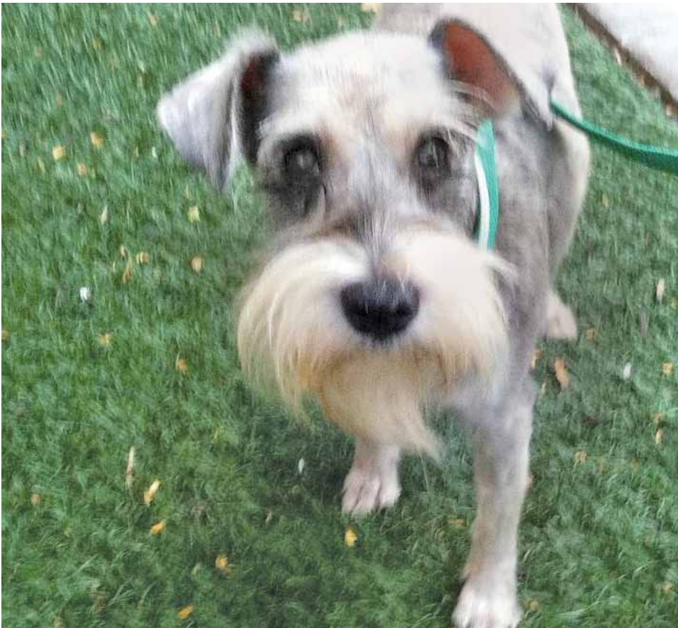
Kristy has gone to a new loving home and helped heal her family's grief.

Golden just several months before. Leave it to Kristy to heal their hearts by making their family whole again. What a great Christmas this will be for everyone! •