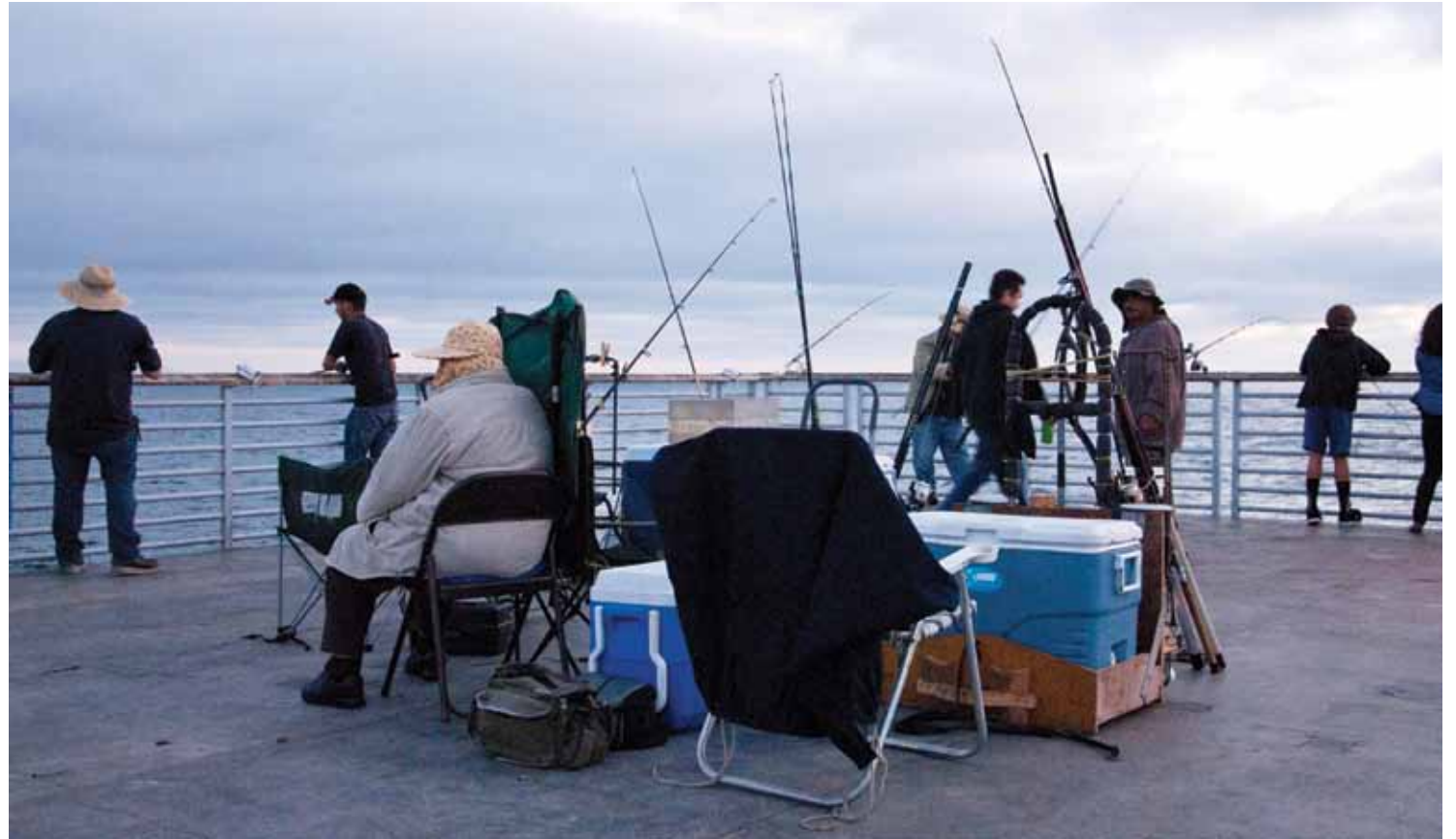
A family of fishermen gather at the end of the Manhattan Beach pier with coolers and lawnchairs in hand to relax as they catch dinner.