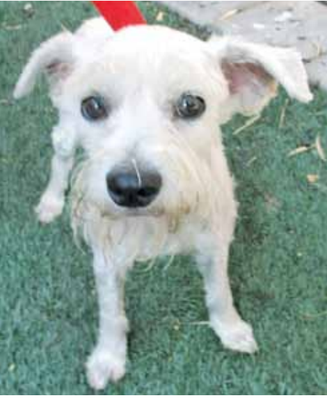
Gavin has a sunny personality.