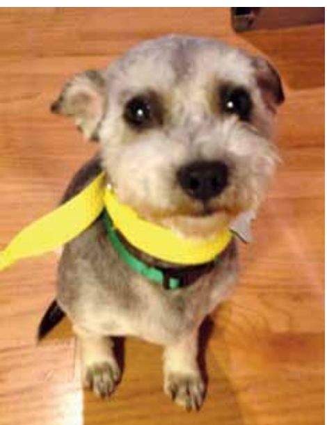
Slater is loyal and affectionate.

Hi! My name is Slater and I'm a 1-year old, male Miniature Schnauzer/Poodle mix who is 13 pounds of fun. I was rescued from a LA county shelter where was brought in as a stray. That is one scary place so is it any wonder that I was very frightened and skittish when the MSFR folks rescued me? Once I realized I wasn't going back there, I warmed up nicely to my foster family but I'm still a little slow in the trust department. That's why it would be best to have a patient owner who is willing to give me time to earn my trust. Once I know I can trust you,